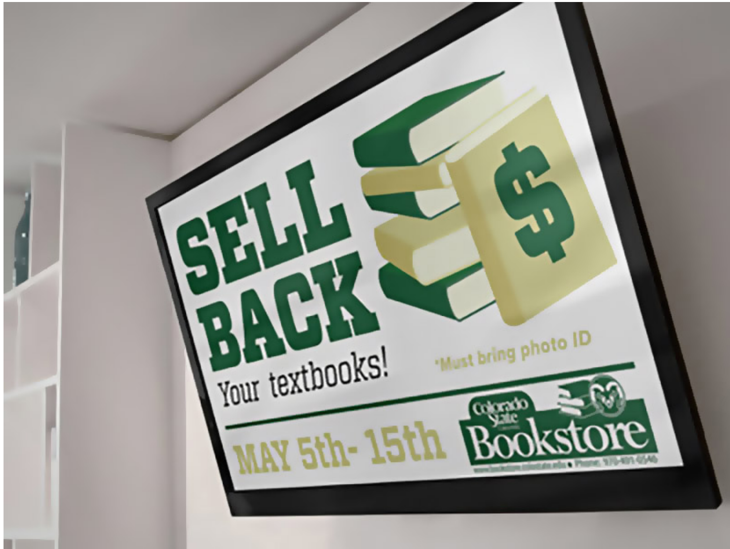
Figure 5: CSU Bookstore Sell Back Rebrand TV Ad