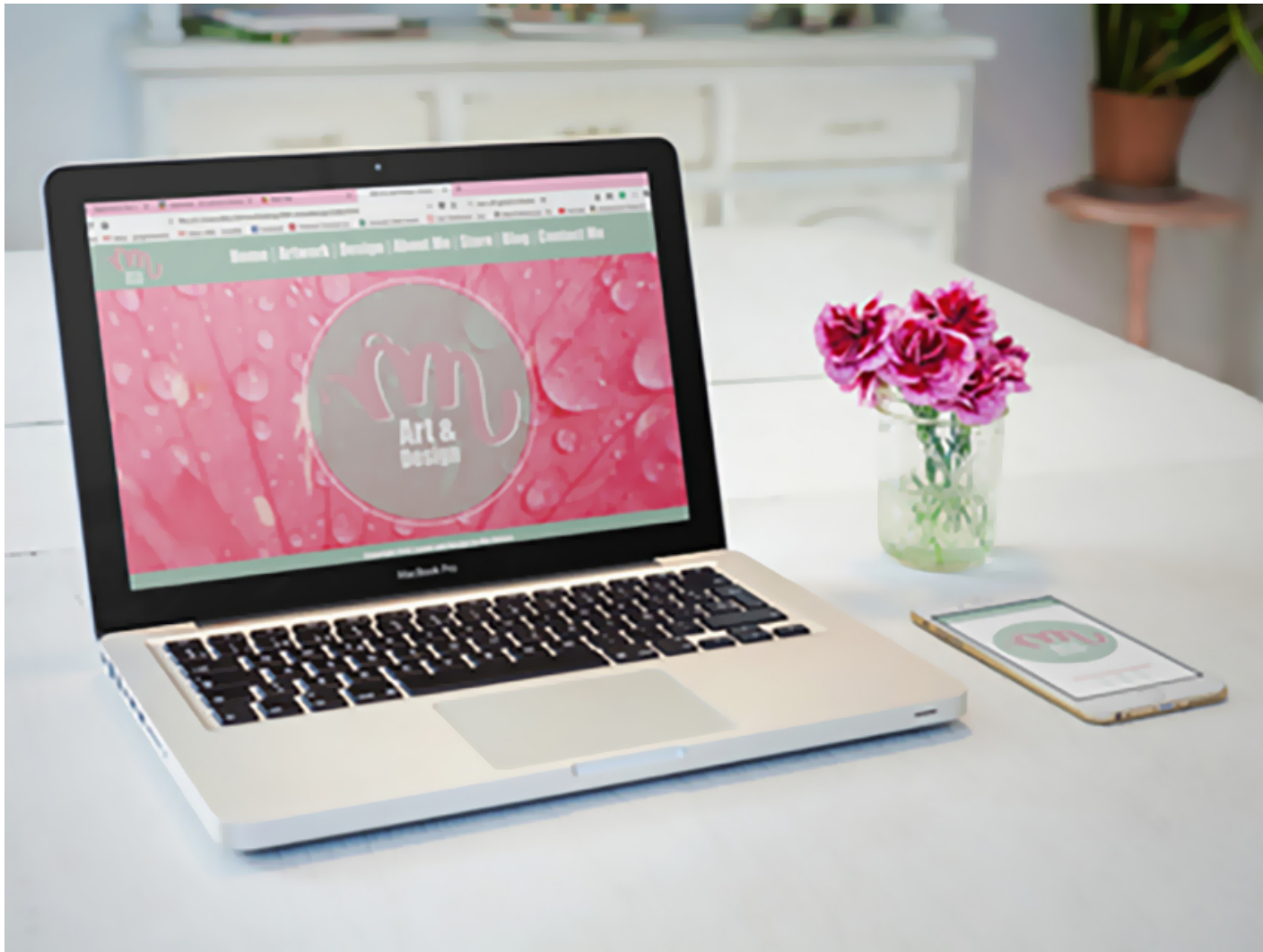
Figure 9: MM Art and Design Website