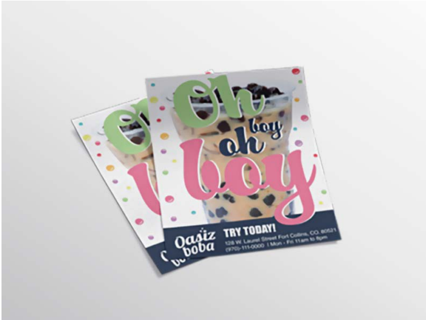
Figure 3: Oh boy oh boy Oasis Boba Flyers