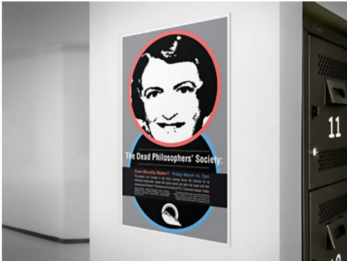
Figure 10: The Dead Philosopher's Society Poster