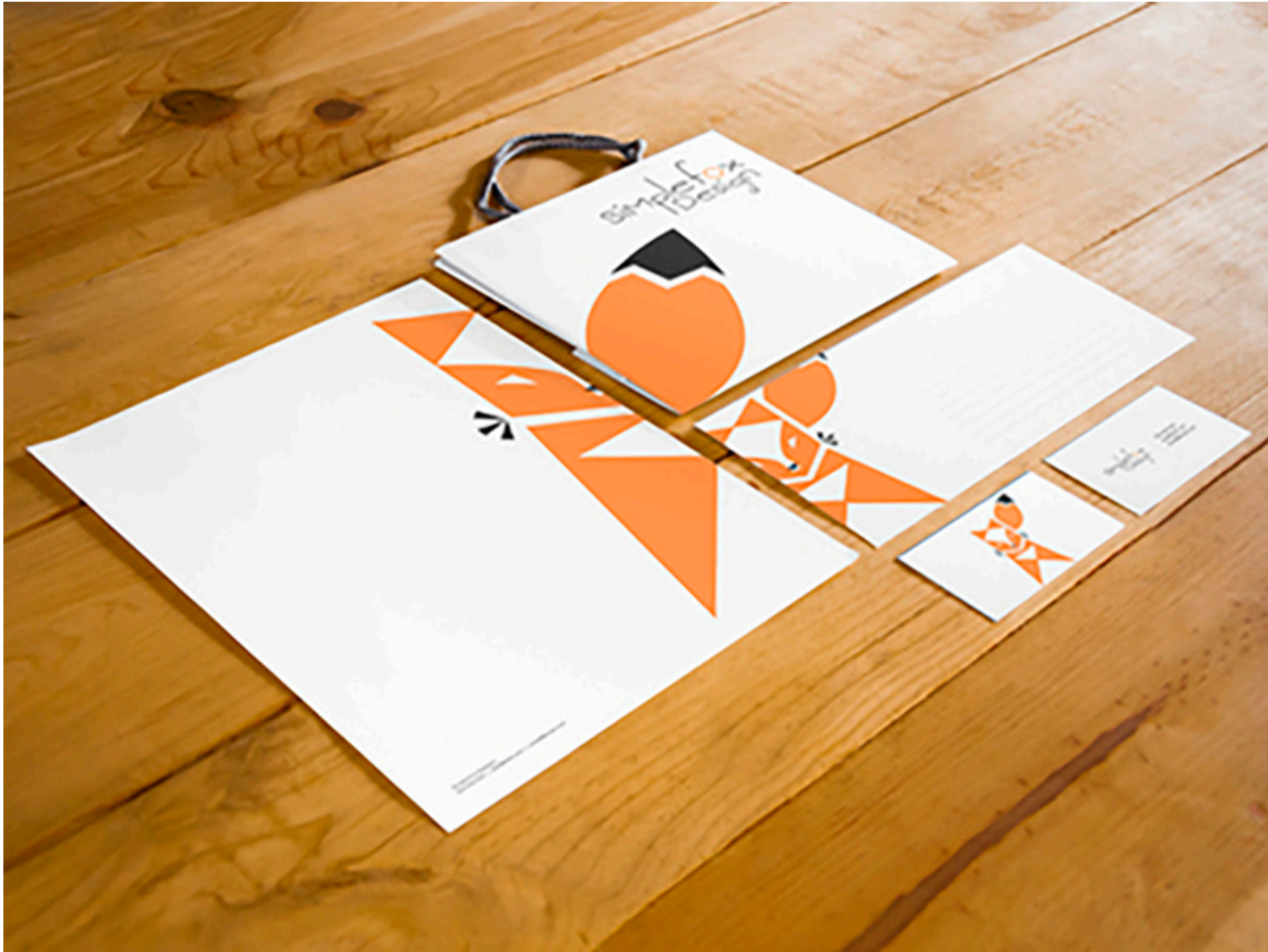
Figure 1: Simple Fox Stationary Design