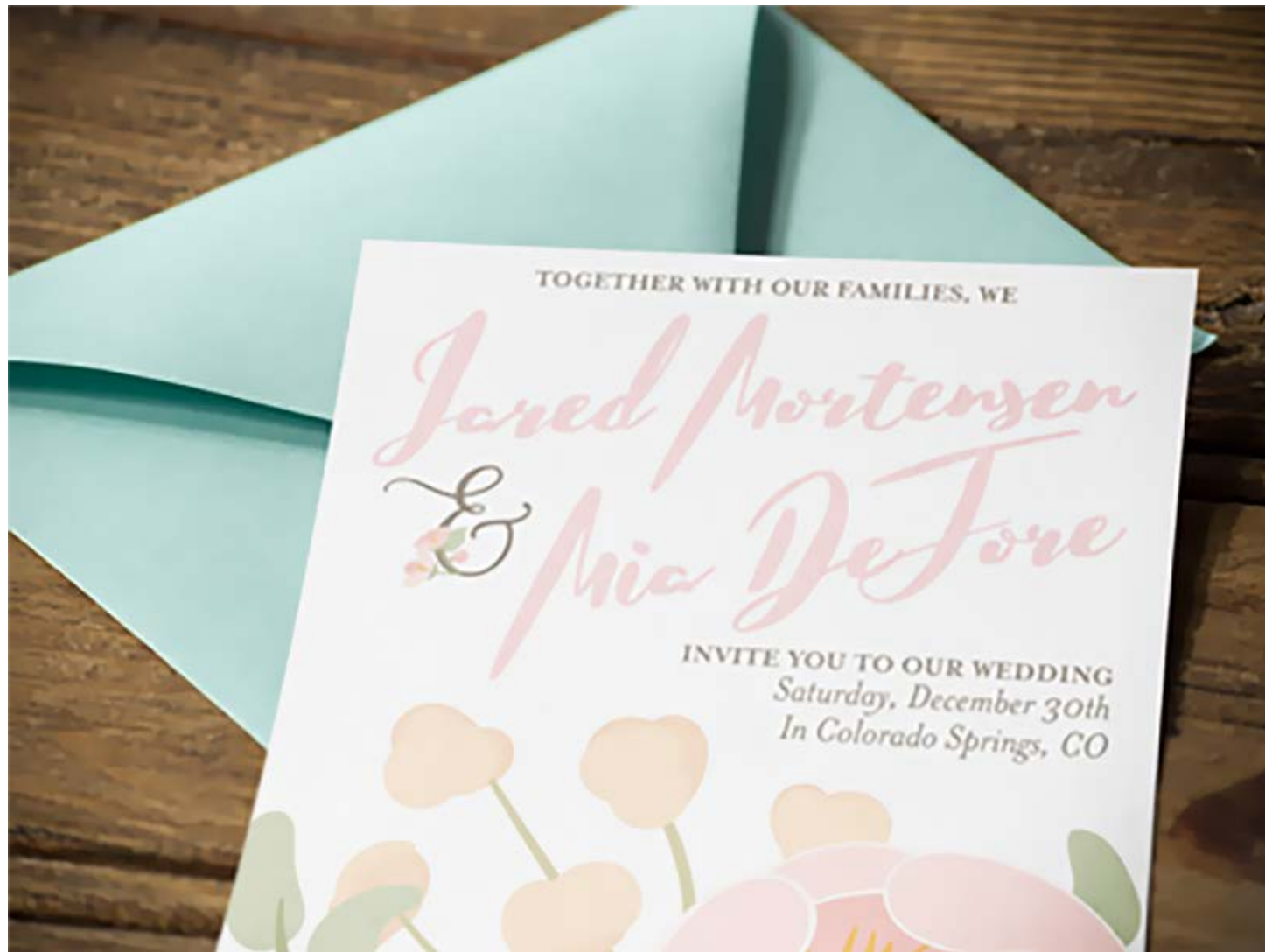
Figure 2: Jared and Mia's Wedding Announcements