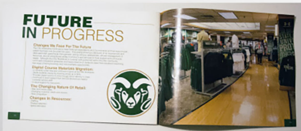
Figure 7: CSU Bookstore Annual 2016 Pitch-book Inner Spread