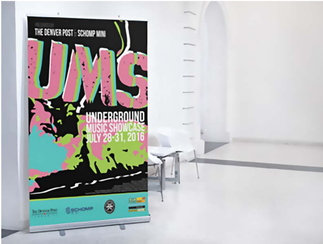
Figure 4: UMS Underground Music Showcase Banner