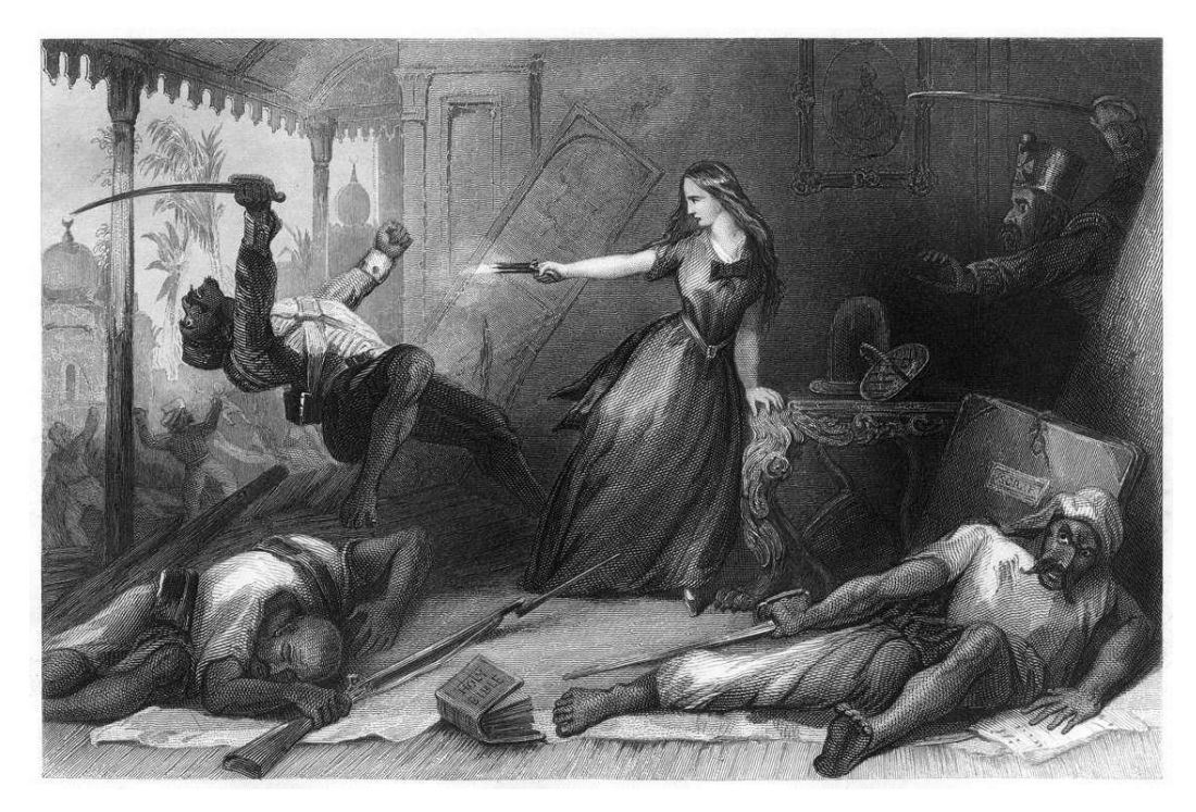
Figure 4-1: British depiction of the Mutiny. "Miss Wheeler defending herself against the Sepoys at Cawnpore" 1857. Credit: The London Printing & Publishing Company, (c1860)

Hindusthan!...never before were there such a number of causes for the universal spreading of these traditional and beautiful principles as there were in 1857" (Savarkar in the "Indian War of Independence 1857" 1909, 9-10)