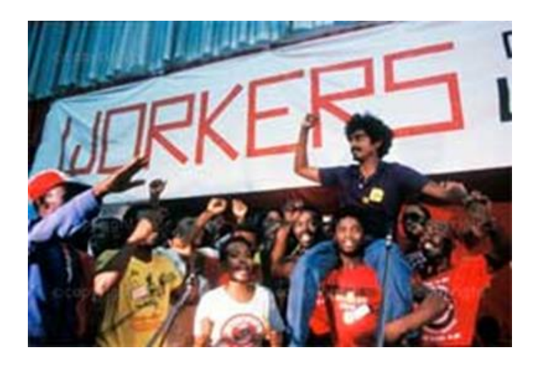
Figure 5-2: Jay Naidoo at the launch of COSATU, Durban, South Africa, 1985.

With a major union like National Union of Metal Workers South Africa (NUMSA) leaving the confederation, COSATU decided to change course. This loss forced COSATU to focus on its worker base and led to the rebuilding of affiliates, organizational skills, and the reorganization of its structures (Barchiesi 1996). When the ANC succeeded in South Africa's first democratic elections, COSATU was invited to construct the constitution. It was able to push for labor rights to be embedded in the country's constitution. The militant/political wing of COSATU disintegrated as these union members became consolidated into the new ANC government (Von Holdt 2002). During the transition to democracy, the moderate faction within COSATU took steps to develop and reconstruct itself within a newly democratic system. It took steps to professionalize and modernize its operation (Buhlungu 2009). South African labor unions began to copy the strategies employed by unions from Europe and the US. They began to pursue a more workerist approach by observing other unions through extensive study tours and exchanges with European and Australian trade unions (Von Holdt 2002).