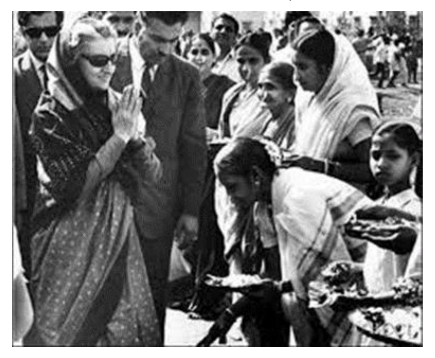
Figure 6-1: Indira Gandhi being greeted by women after rolling out Garibi Hatao.

"The answer to class-antagonisms and world conflicts will arrive soon if we succeed in discovering a sound basis for human relations in industry. Economic progress is also bound up in industrial peace. Industrial relations are, therefore, not a matter between employers and employees alone, but a vital concern of the community which may be expressed in measures for the protection of its larger interests." (Government of India, National Commission on Labour 1969, 54)