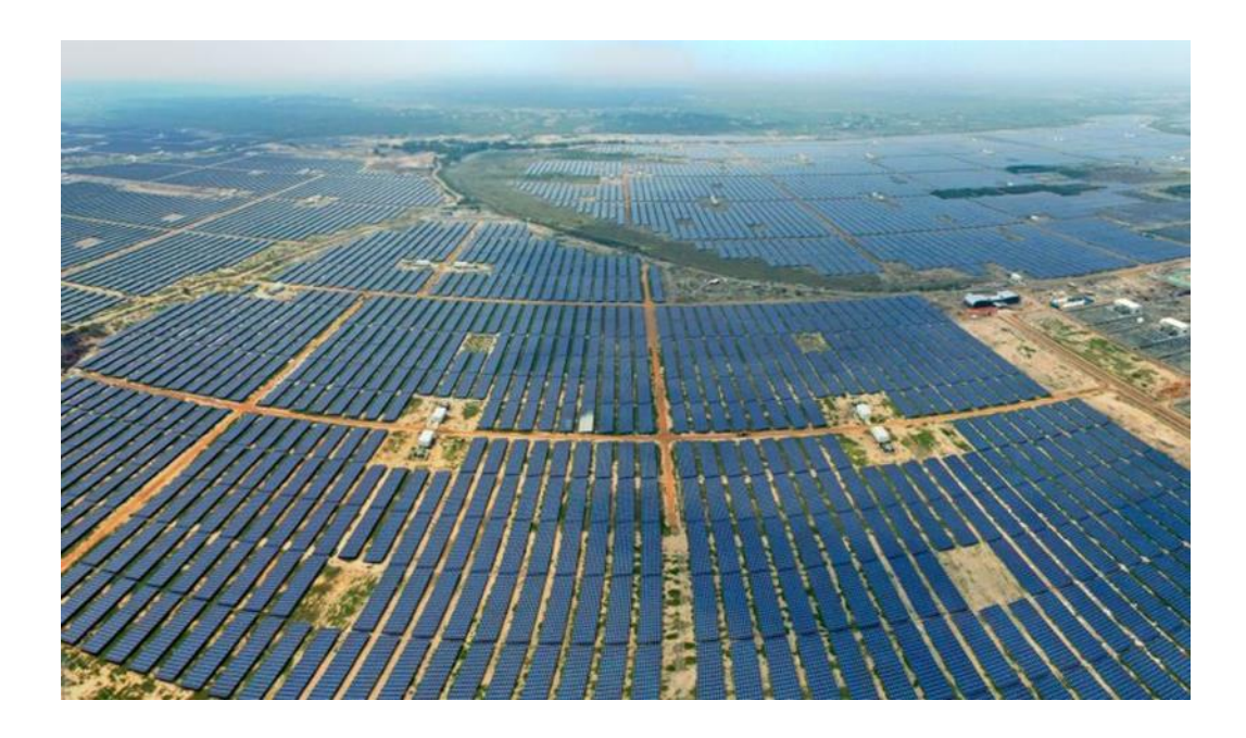
Figure 9-1: Adani's 2-gigawatt solar plant, which would tie for the world's largest.