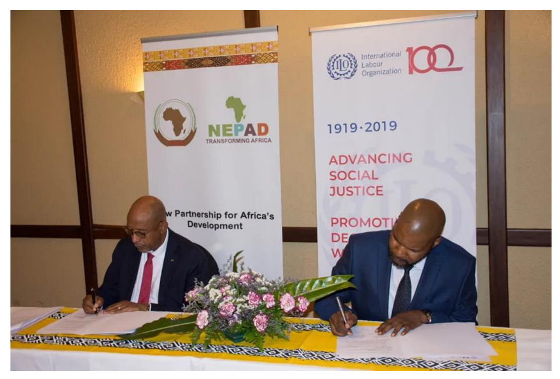
Figure 9-2: The New Partnership for Africa's Development (NEPAD) Agency, a technical agency of the African Union and the ILO entered a Memorandum of Understanding (MoU) with the objective of promoting decent jobs.

therefore ill-equipped for the demands of today's labour market as well as higher education opportunities... Limited availability of tertiary-qualified workers has meant that employers looking for high-skilled workers in emerging and innovative sectors have had to hire underqualified workers as well as foreign workers... At the same time, the large pool of available unemployed high-school graduates has led to the displacement of those without qualifications, as employers are filling low-skilled positions with high-school graduates instead, generating a situation of skill-related underemployment." (ILO-BRICS 2019, 5)