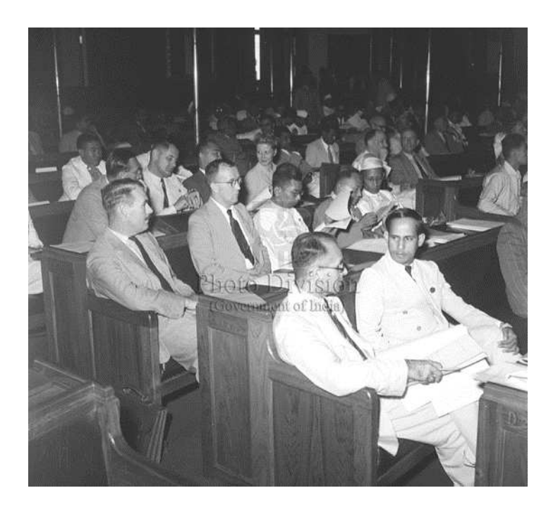
Figure 7-2: A view of the first plenary session of the Asian Regional Conference of the ILO. which opened in New Delhi on October 27, 1947.

raised the issue of "low productivity" and requested that the ILO examine if this could be attributed to the colonial policy of exploitation that they were subjected to (ILC 1950, 236).