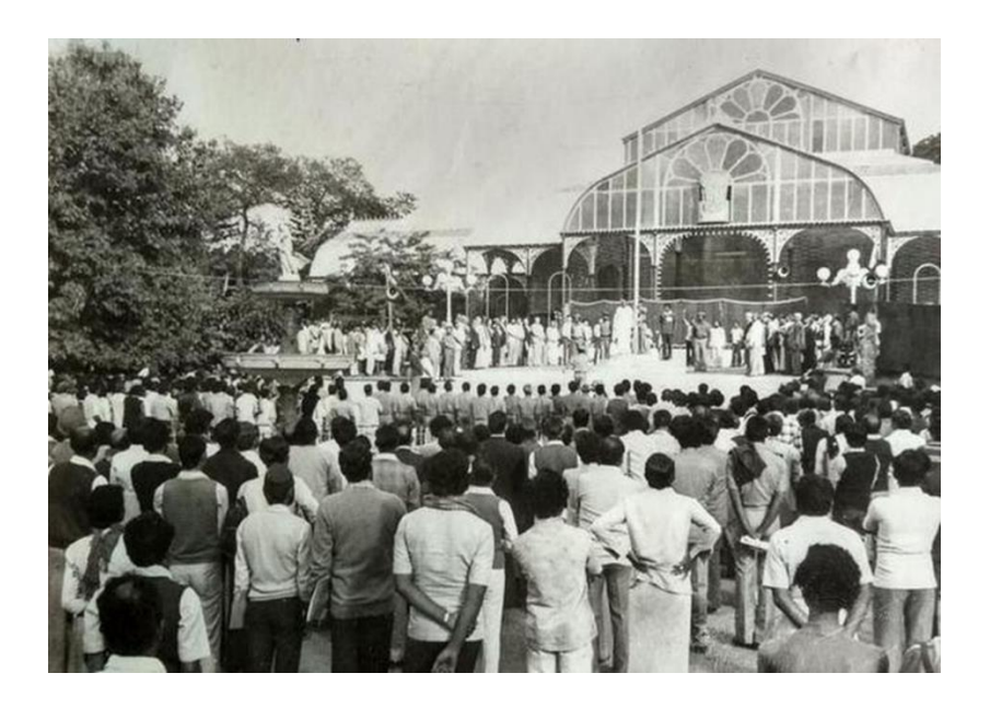
Figure 5-1: AITUC gathering at Bengaluru.

And the federation made claims for better working conditions in war production centers (Roy 1943). The IFL competed with the AITUC for worker support but failed in 1948 when evidence that it accepted British subsidy emerged. This led to workers questioning its allegiance to India and its independence (Park 1949).