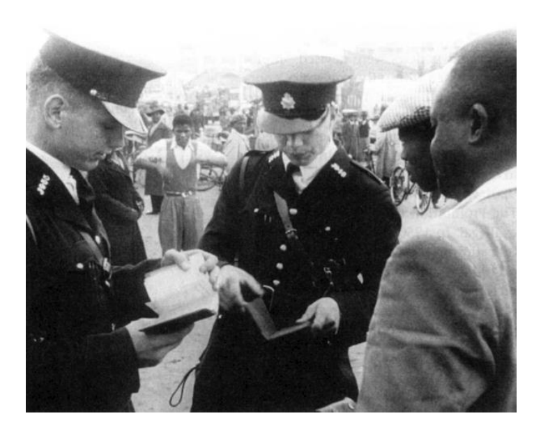
Figure 4-2: Afrikaner police officers checking passes.

Lastly, the Boers set up a low-quality education system that kept Africans as manual laborers. The Boer government spent less money on these vocational schools despite collecting taxes from the Africans. Money collected from Africans were used to fund the education of Boer children while African children were trained to be low-skilled workers (Loram 1915, 250-253). Black children were taught needlework, woodwork, drawing, physical education, and domestic science.