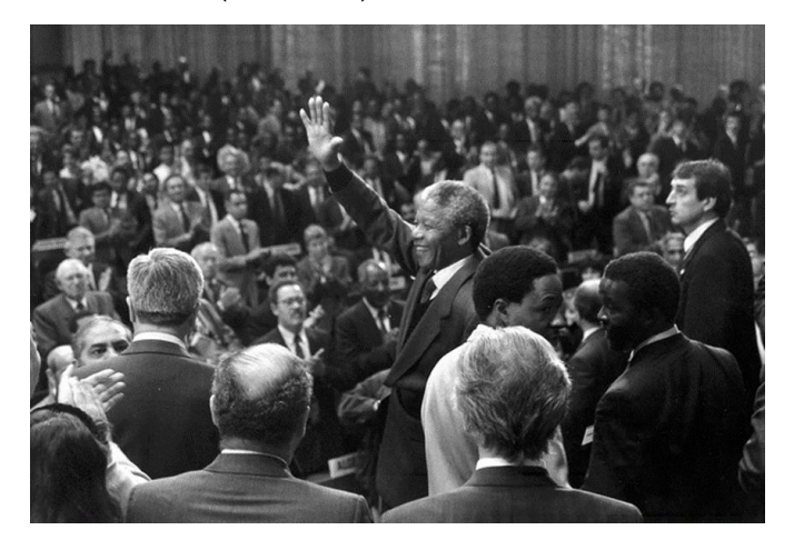
Figure 7-3: Nelson Mandela addressing the International Labour Conference, Geneva, in 1990.

"I am sure that our Minister will outline steps that South Africa is taking on the same issues as those raised by the Director-General. I want to place it on record that while there may exist differences in approach on certain issues, there is overwhelming support from us for the overall strategic approach that he is taking, whose aim is to foster social justice, economic development, and job creation. As a country, we even have an agreement on how to approach the vexing question of a social dimension to trade." Workers' adviser, South Africa (ILC 1997)