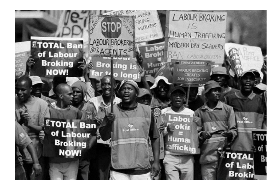
Figure 6-2: COSATU protesting the impact of globalization on workers.

Accelerated and Shared Growth South Africa (ASGISA) which promised to halve poverty and unemployment by 2014 was introduced (Naidoo & Mare 2015)