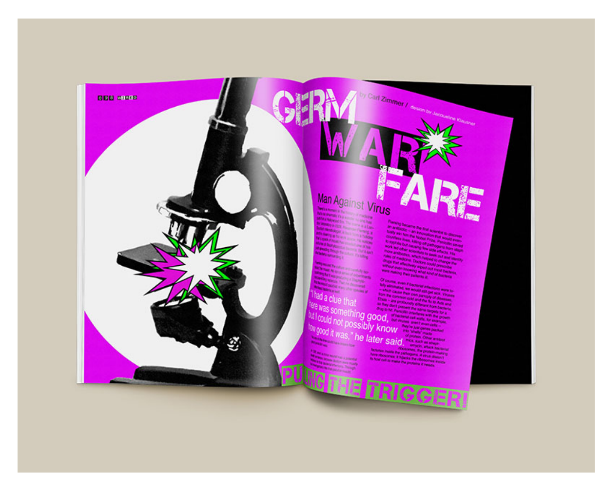
Figure 3: Germ Warfare Magazine Spread