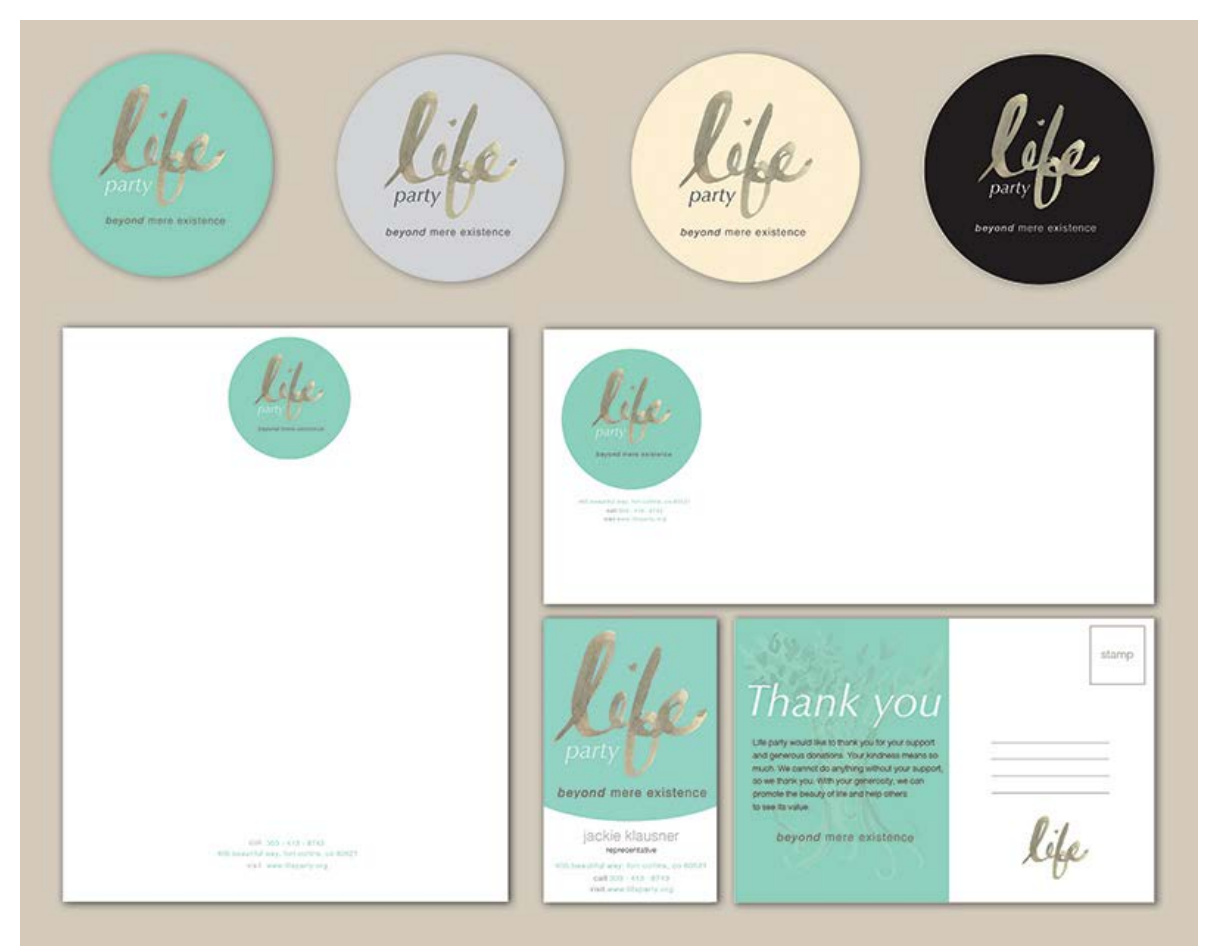
Figure 6: Life Party Logo: Letterhead, Envelope, Business card, and Postcard