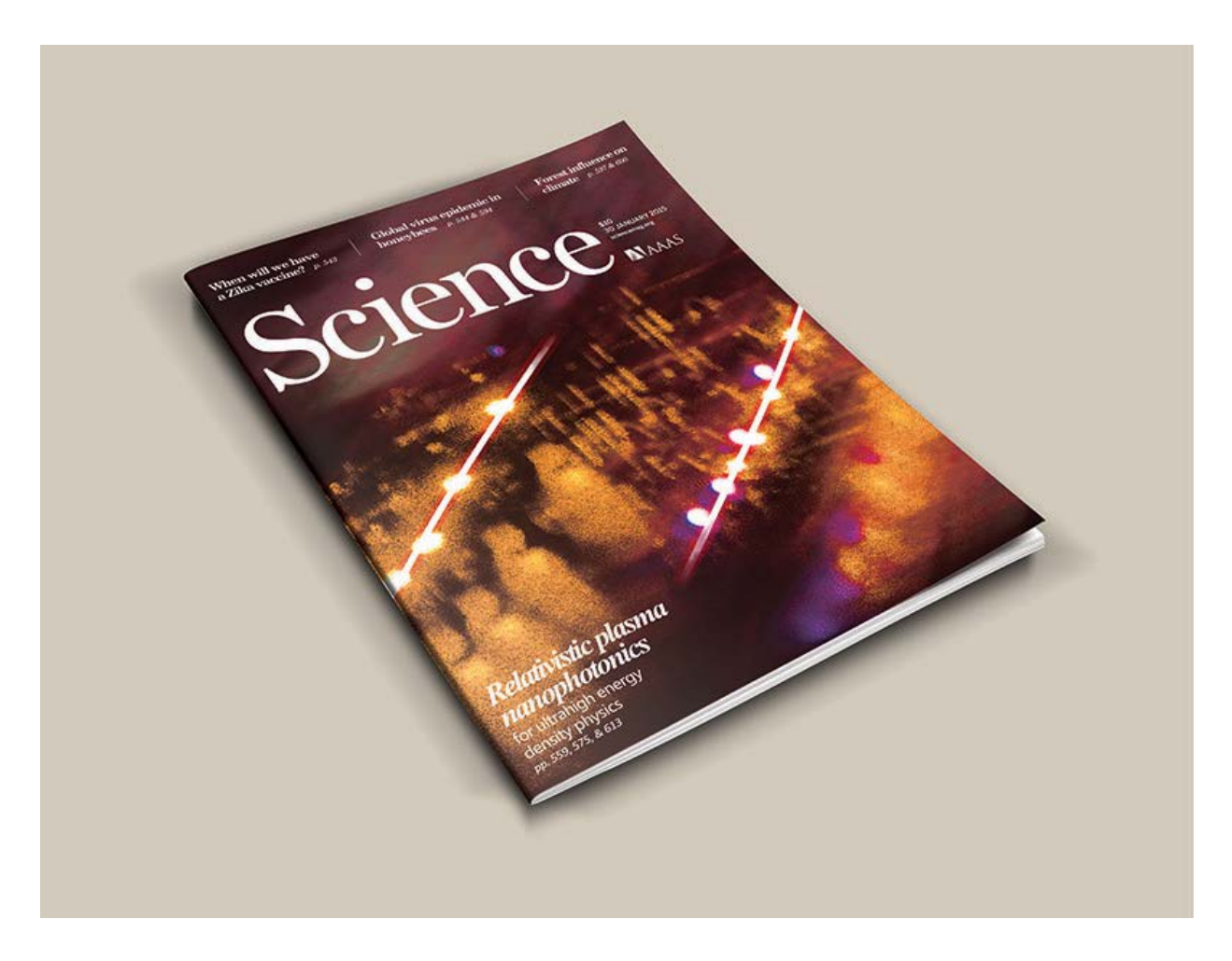
Figure 2: Science Magazine Cover