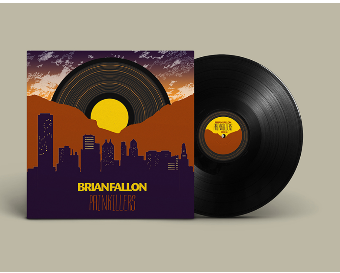
Figure 4: Brian Fallon Record Album Cover