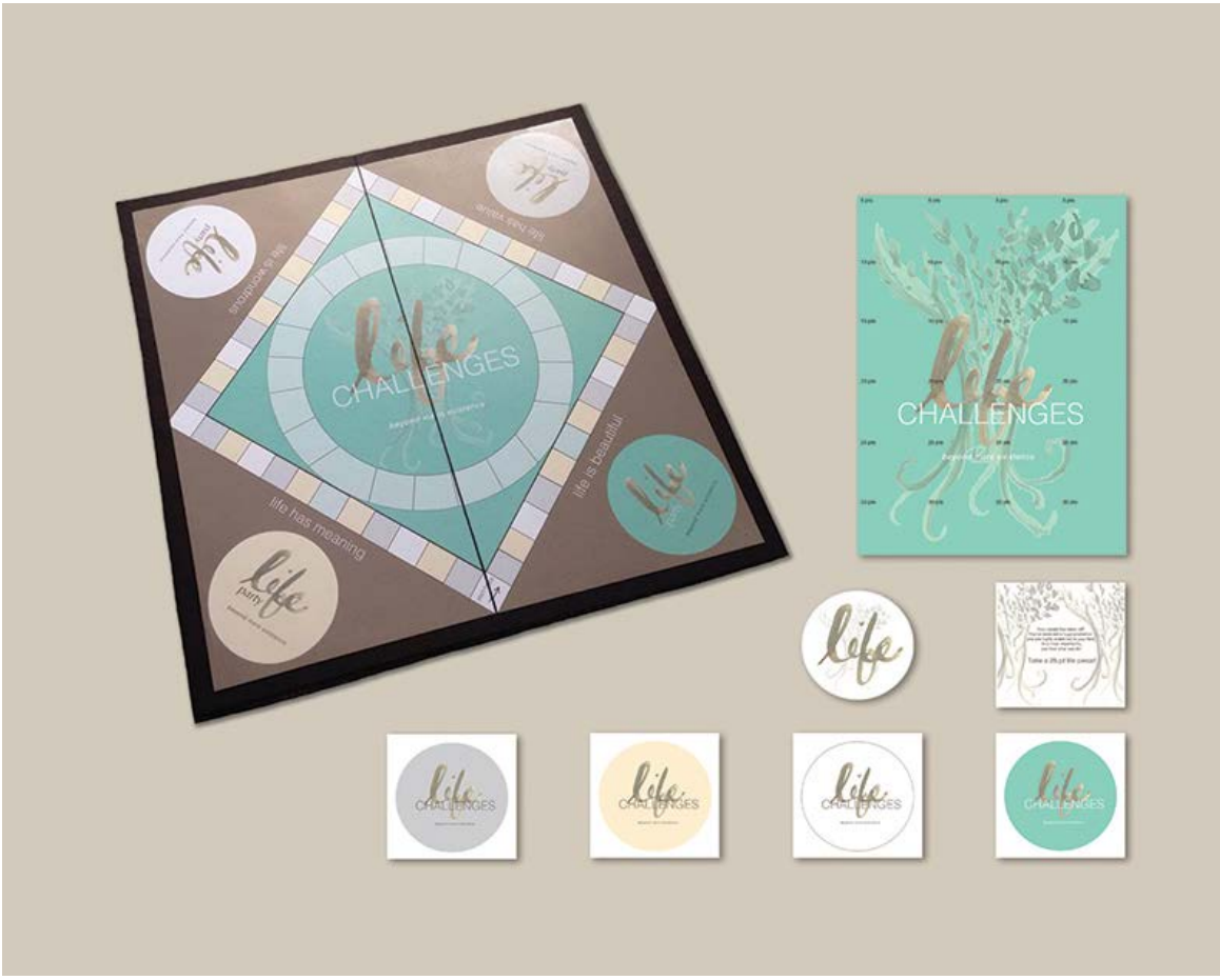
Figure 7: Life Party Game Board and Pieces