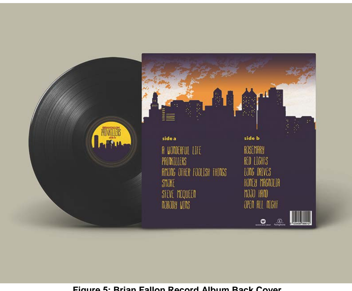
Figure 5: Brian Fallon Record Album Back Cover