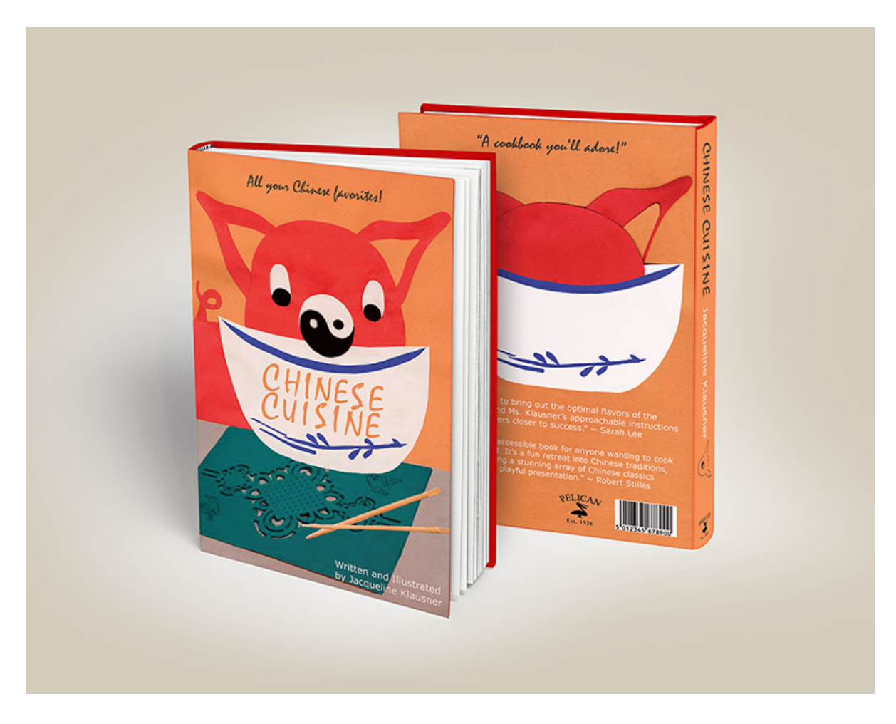
Figure 1: Chinese Cookbook Dustcover