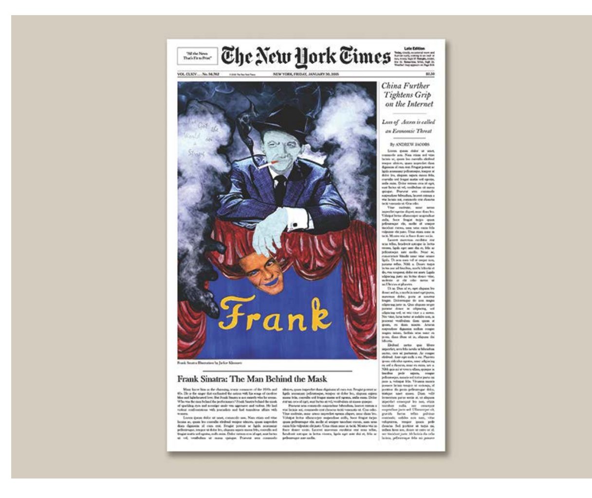
Figure 10: Frank: The Man Behind the Mask Editorial