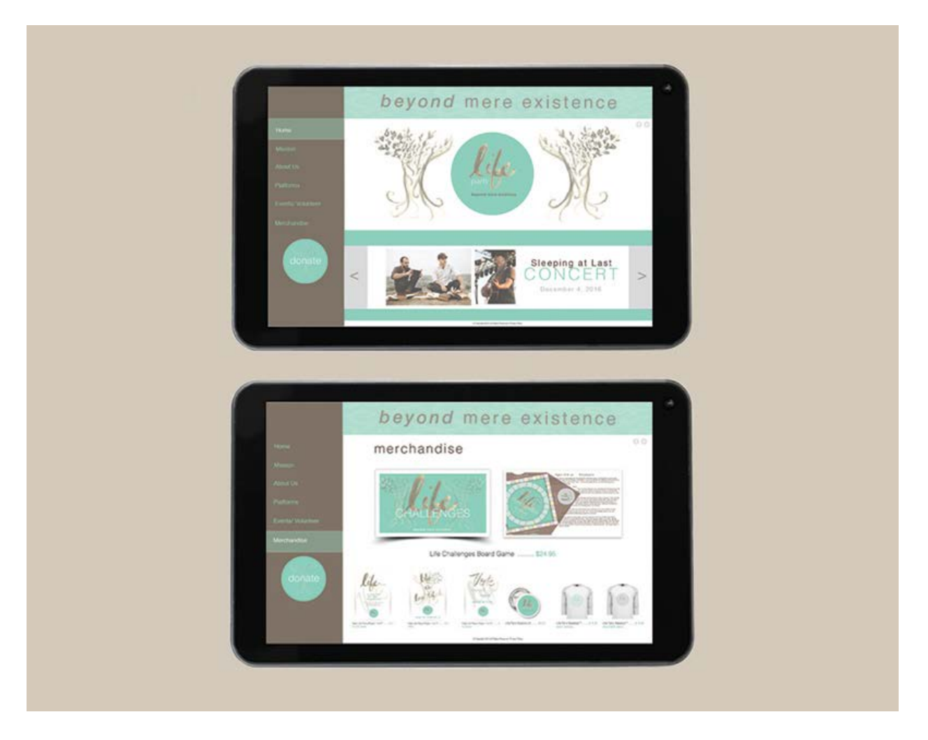
Figure 8: Life Party Website on tablet Design