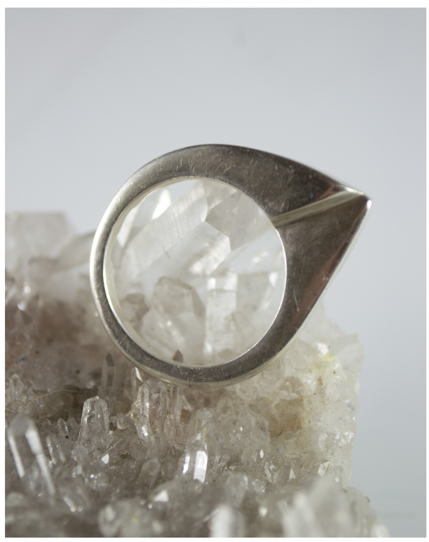
Figure 4: Ring Back