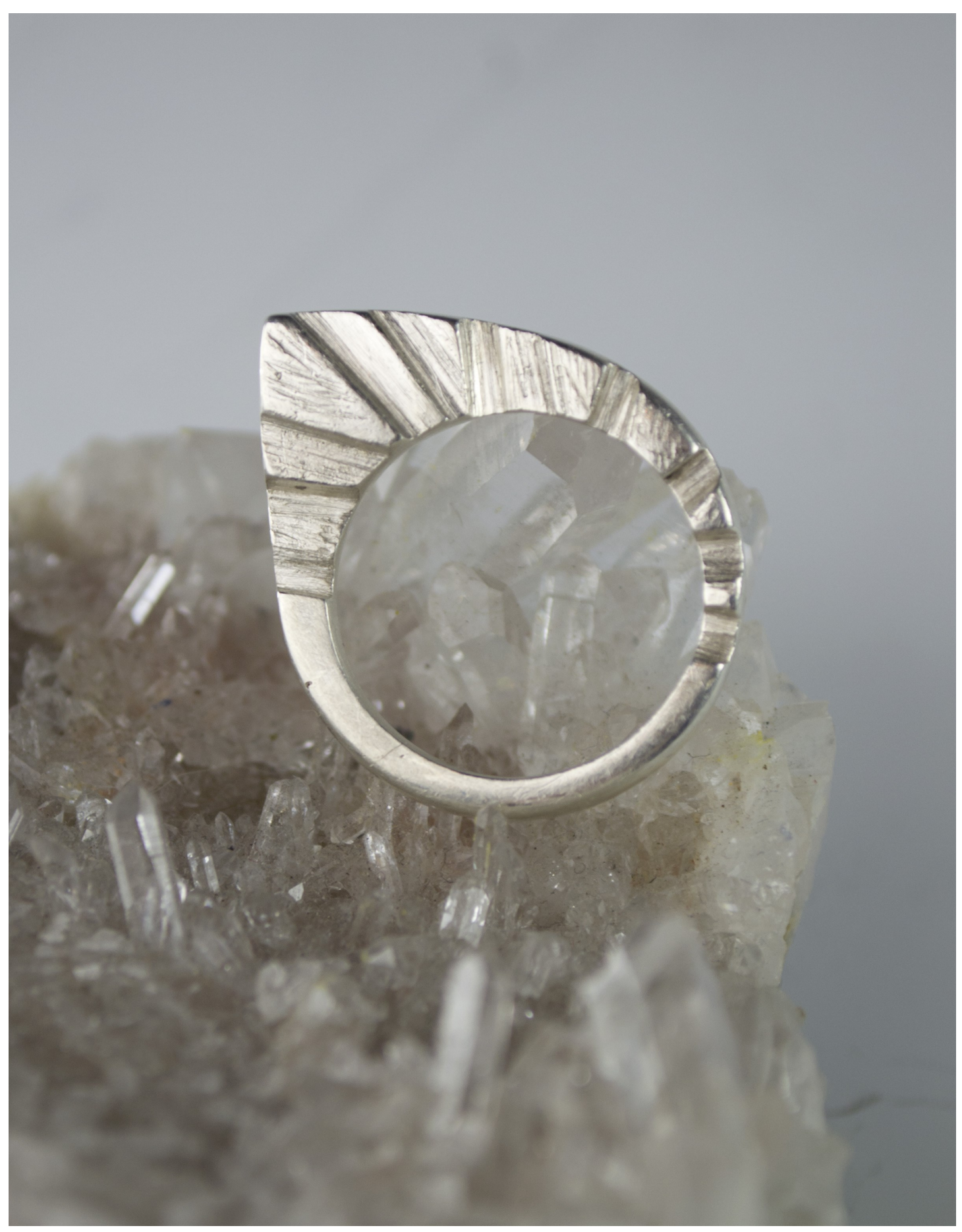
Figure 3: Ring Front