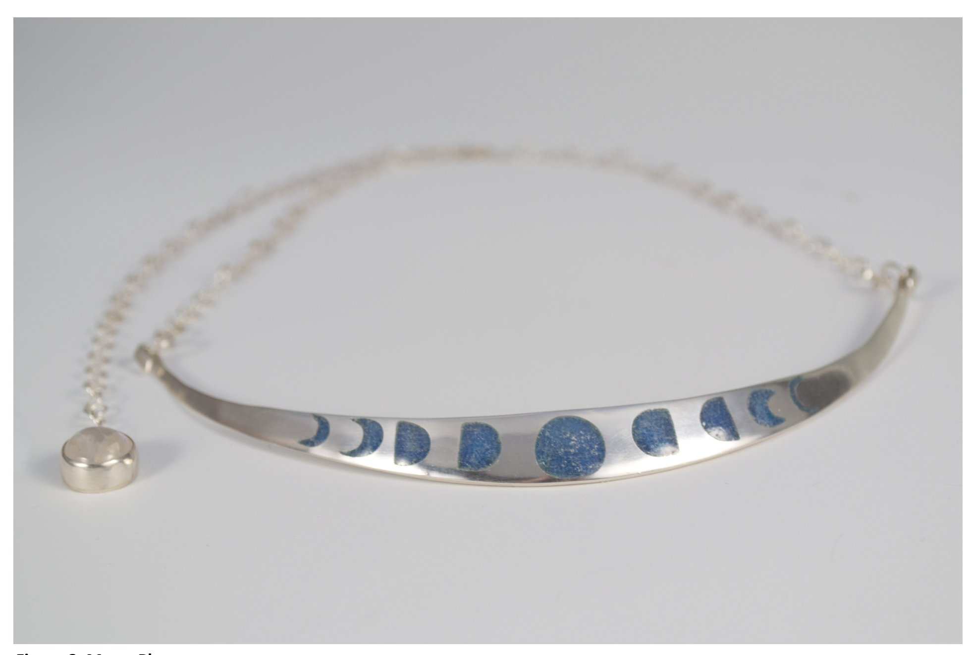
Figure 8: Moon-Phase