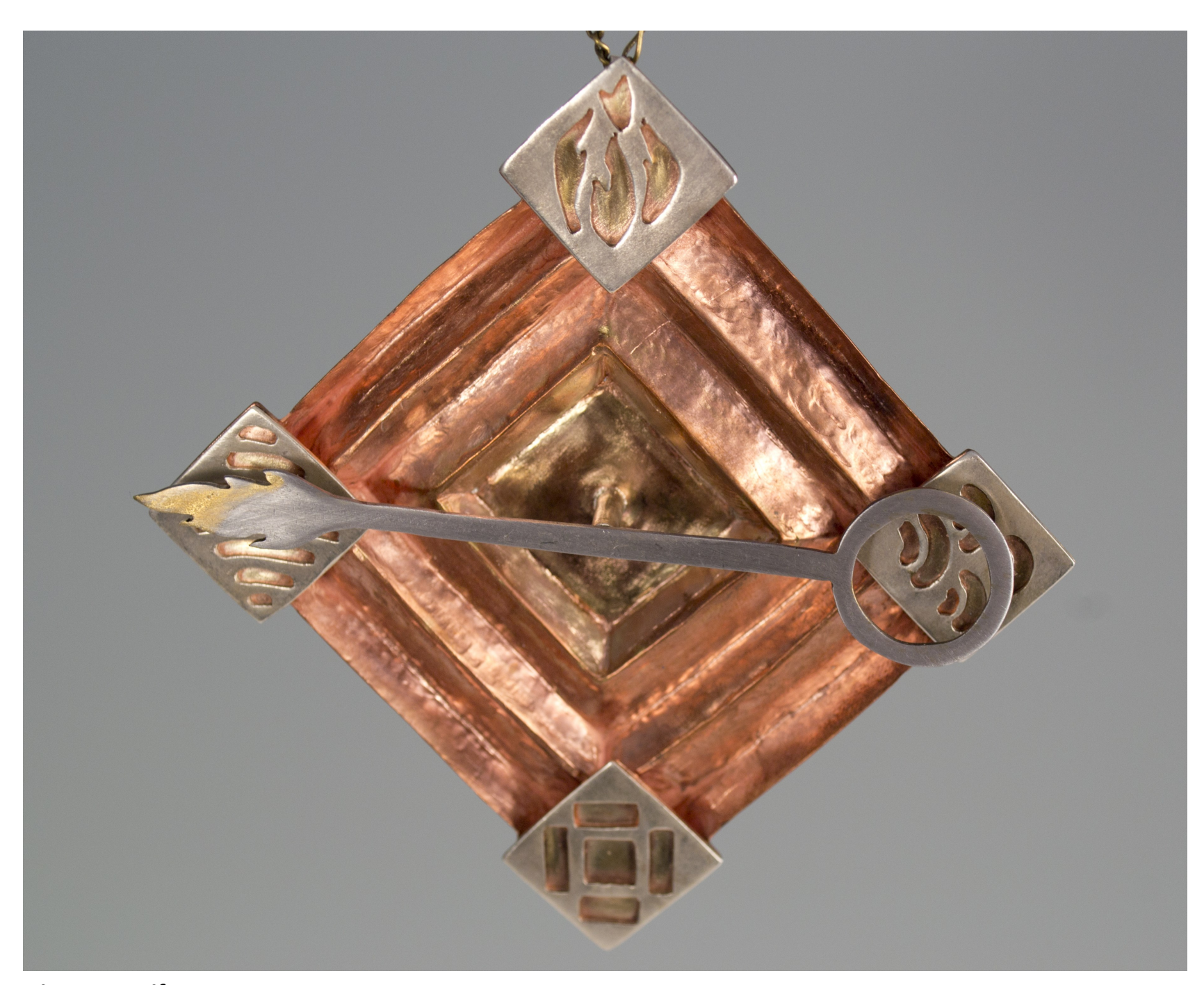
Figure 12: Life Compass Front