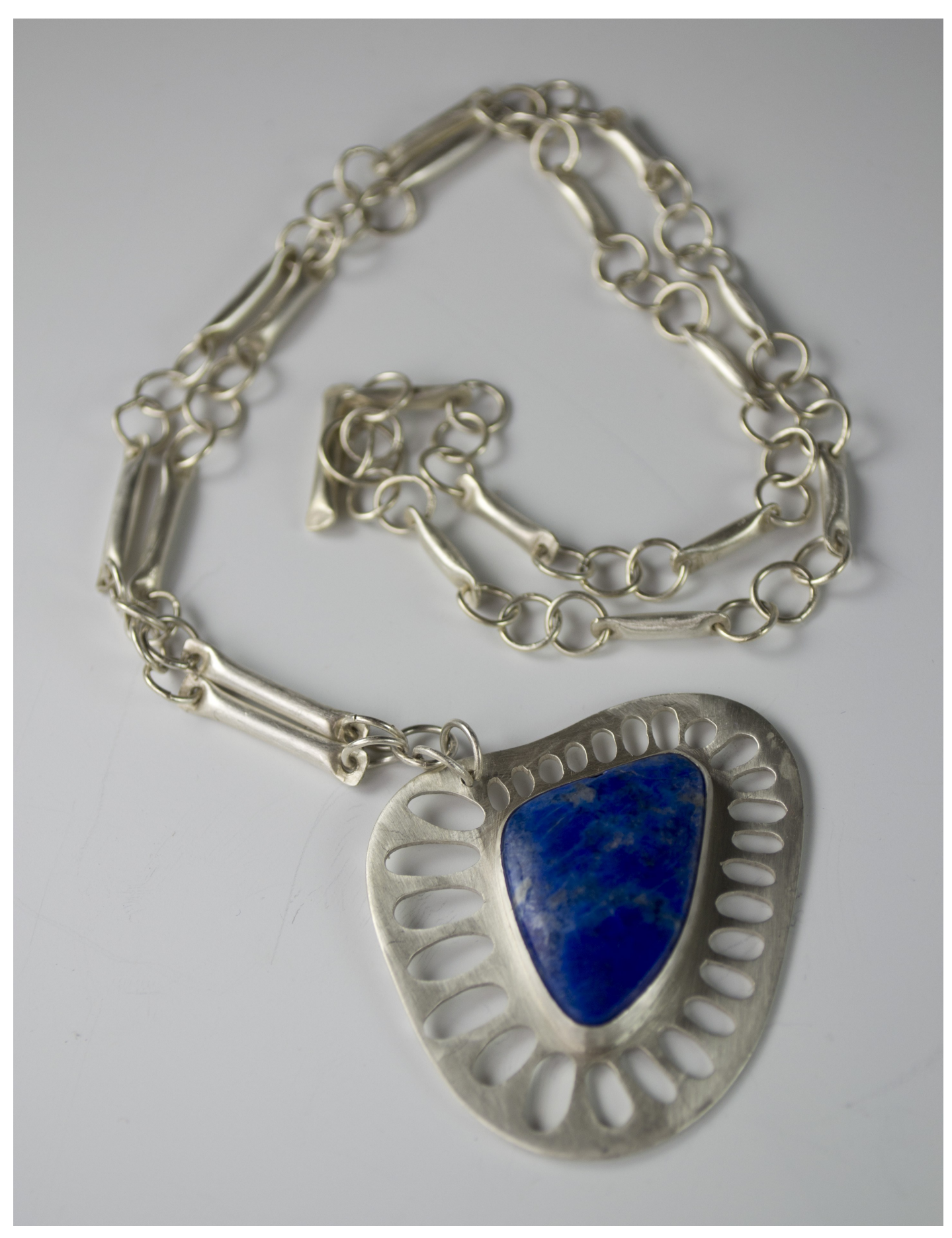
Figure 5: Emanating Truth