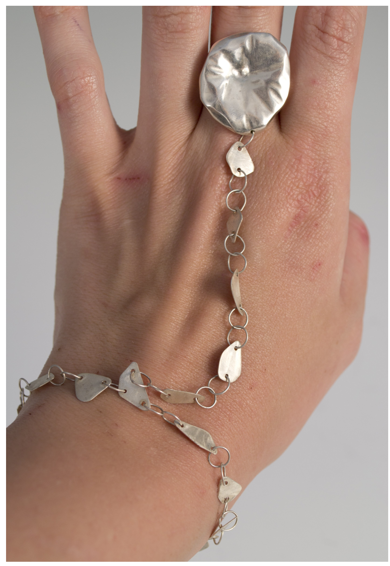
Figure 14: Connectic Ring