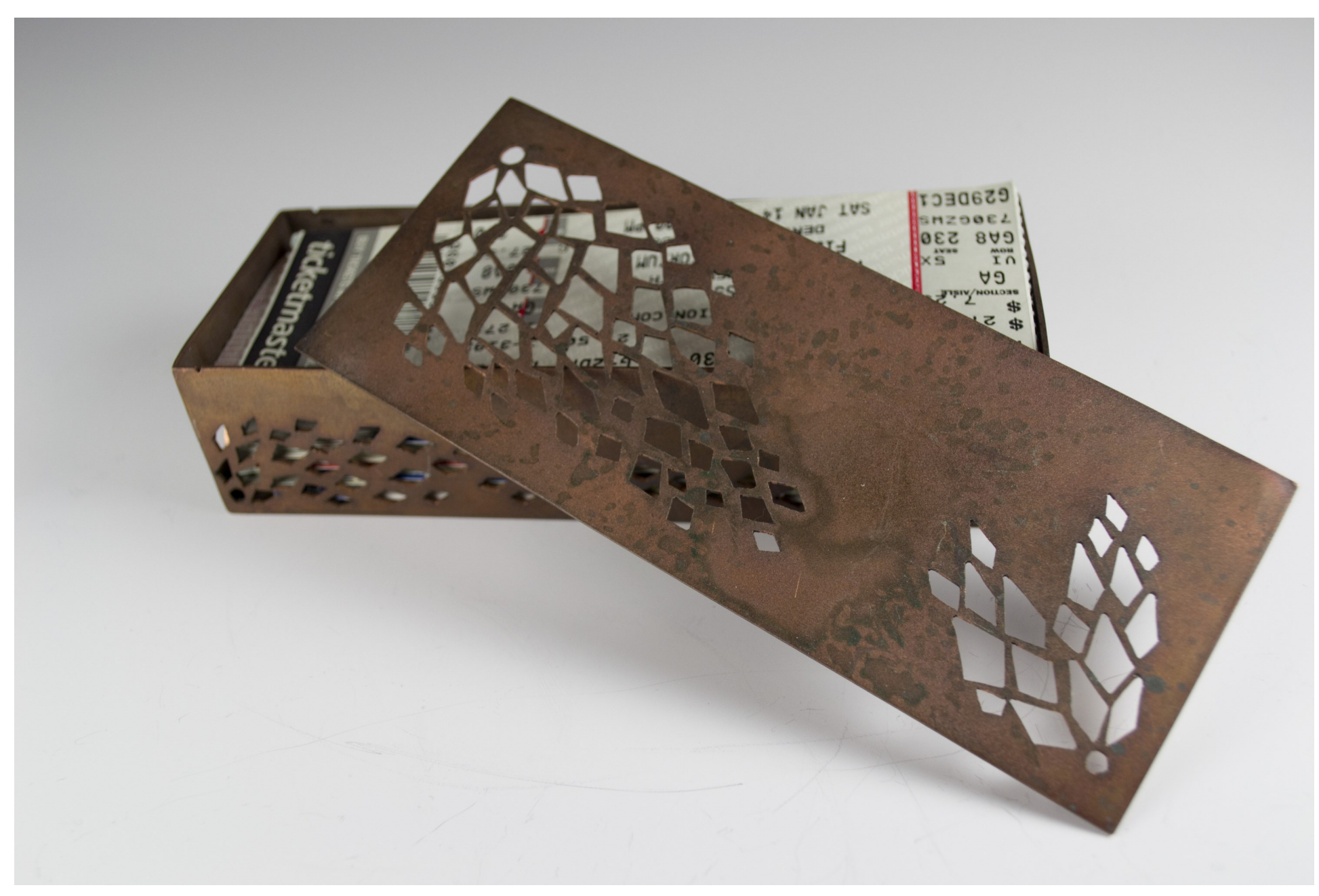
Figure 15: Reliquary