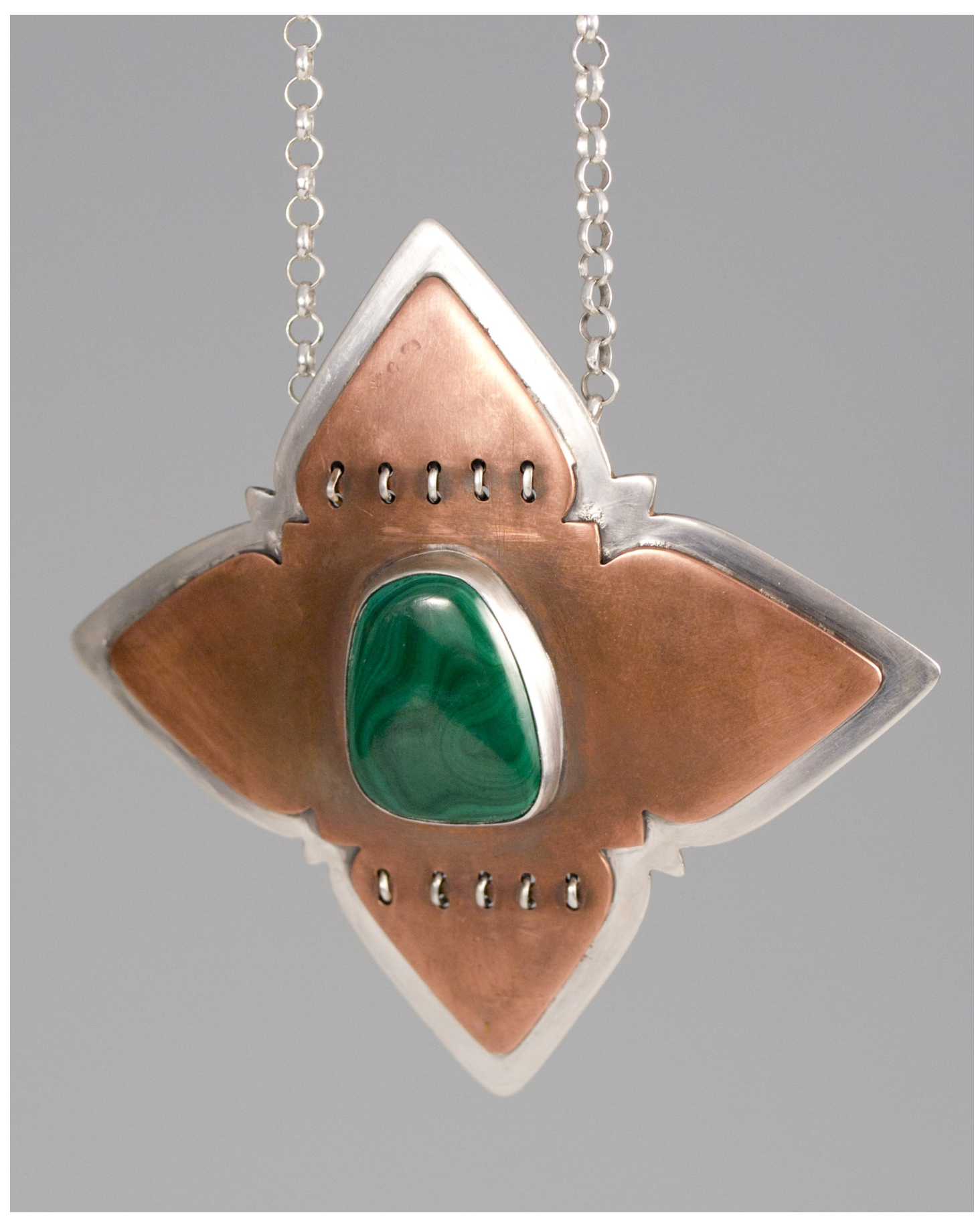
Figure 10: Mirror The Soul Front