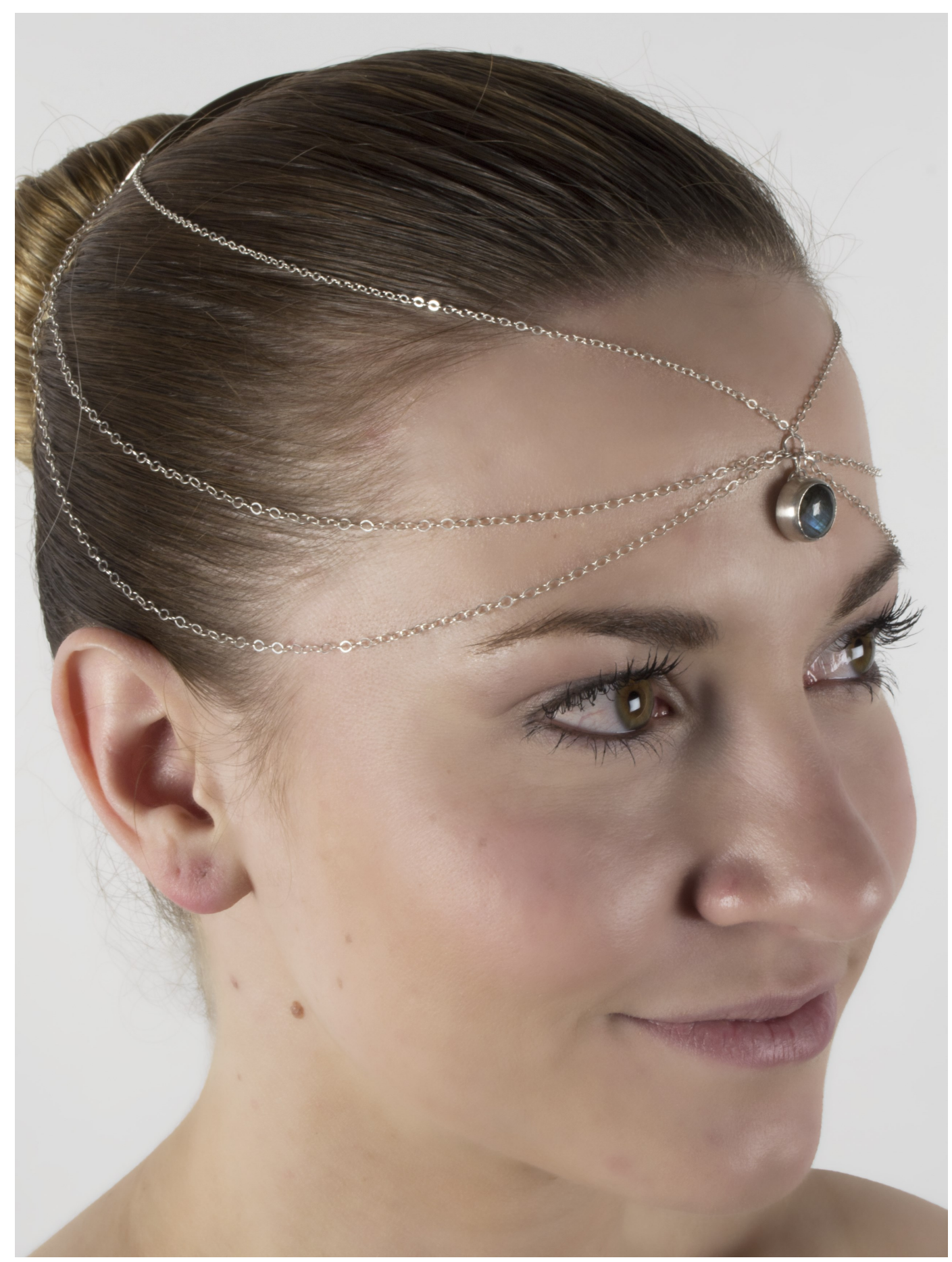
Figure 6: Awakening Introspection Front