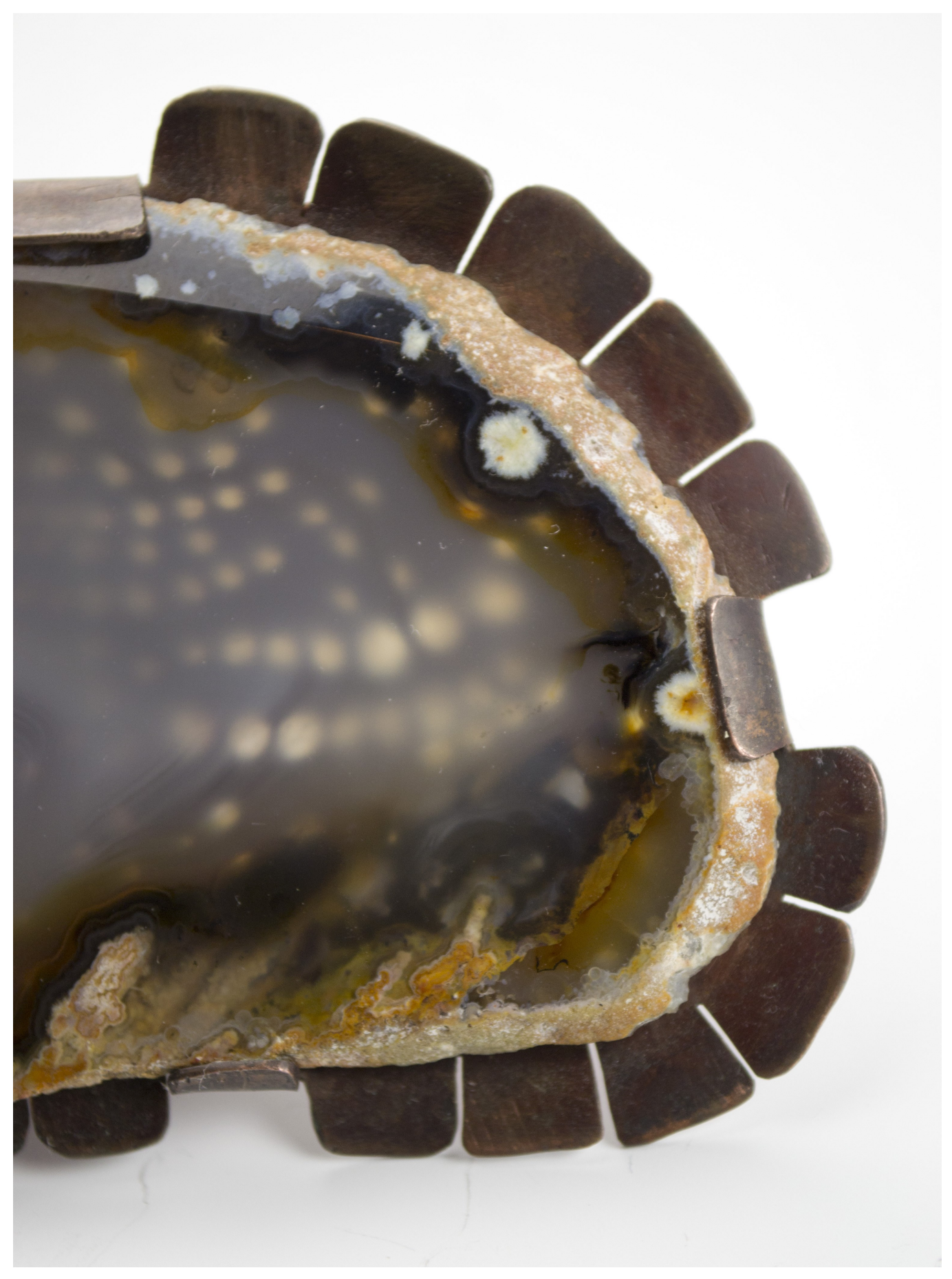
Figure 2: Agate Brooch Close-Up