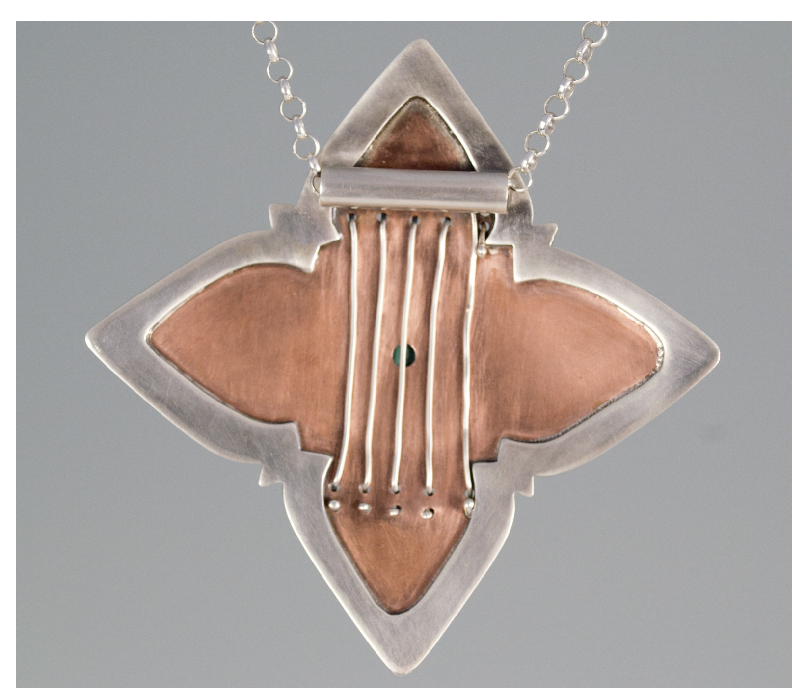
Figure 11: Mirror The Soul Back