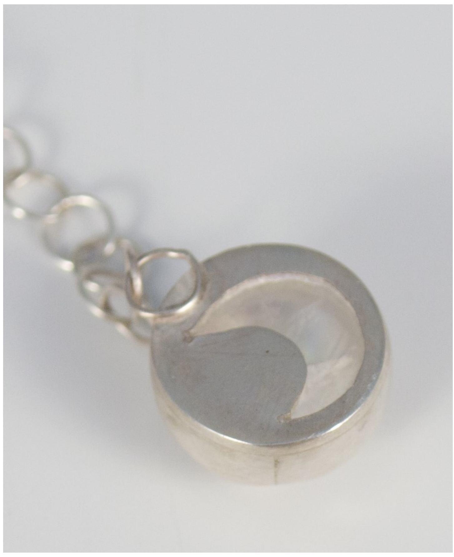
Figure 9: Moon-Phase Bezel Close-up