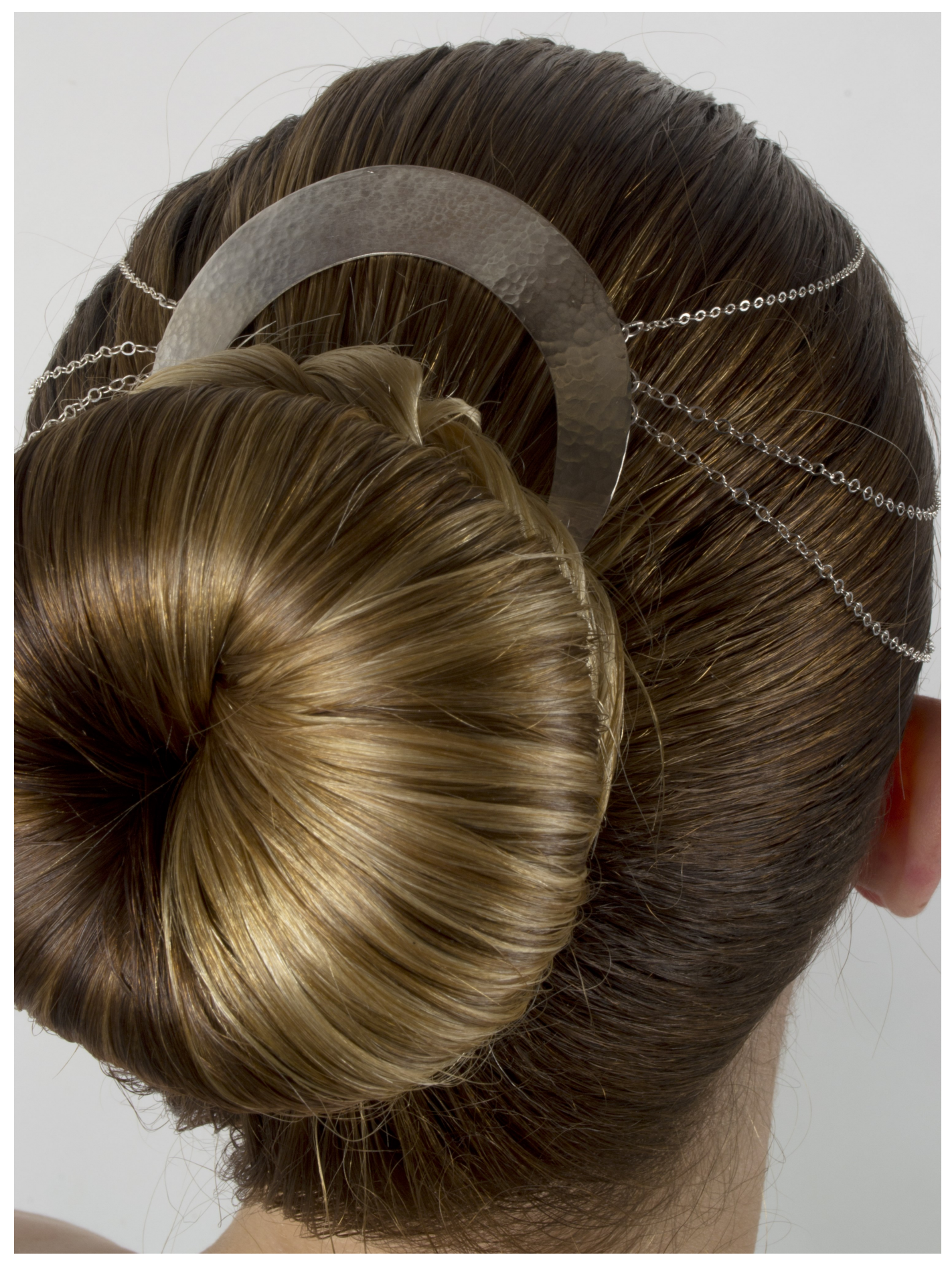
Figure 7: Awakening Introspection Back