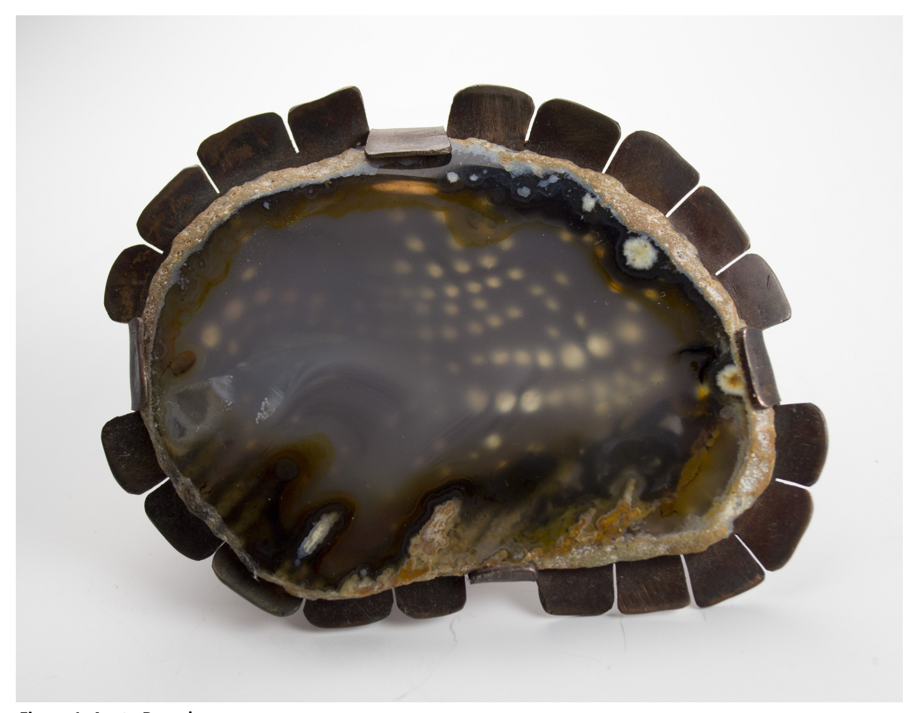
Figure 1: Agate Brooch