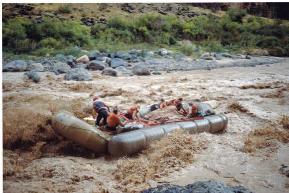
Under That Spray, Maybe A Deadly Rock . . . ... One Never Knows When Shooting Rapids

STEEL TOWERS, TEST borings, at "mile 39" mark the Marble Canyon damsite. We are reminded of the Bureau of Reclamation's proposal, now temporarily withdrawn, to flood with 275 feet of water the area we have been enjoying, destroying the first of the great Grand Canyon gorges. At the prospect of Marble Canyon's extinction we talk wistfully of what Glen Canyon once was. This was the place no one knew, or ever can know now. Those few who went there dubbed it the ladies choice among canyons for its calm waters beneath high cliffs of grandeur.