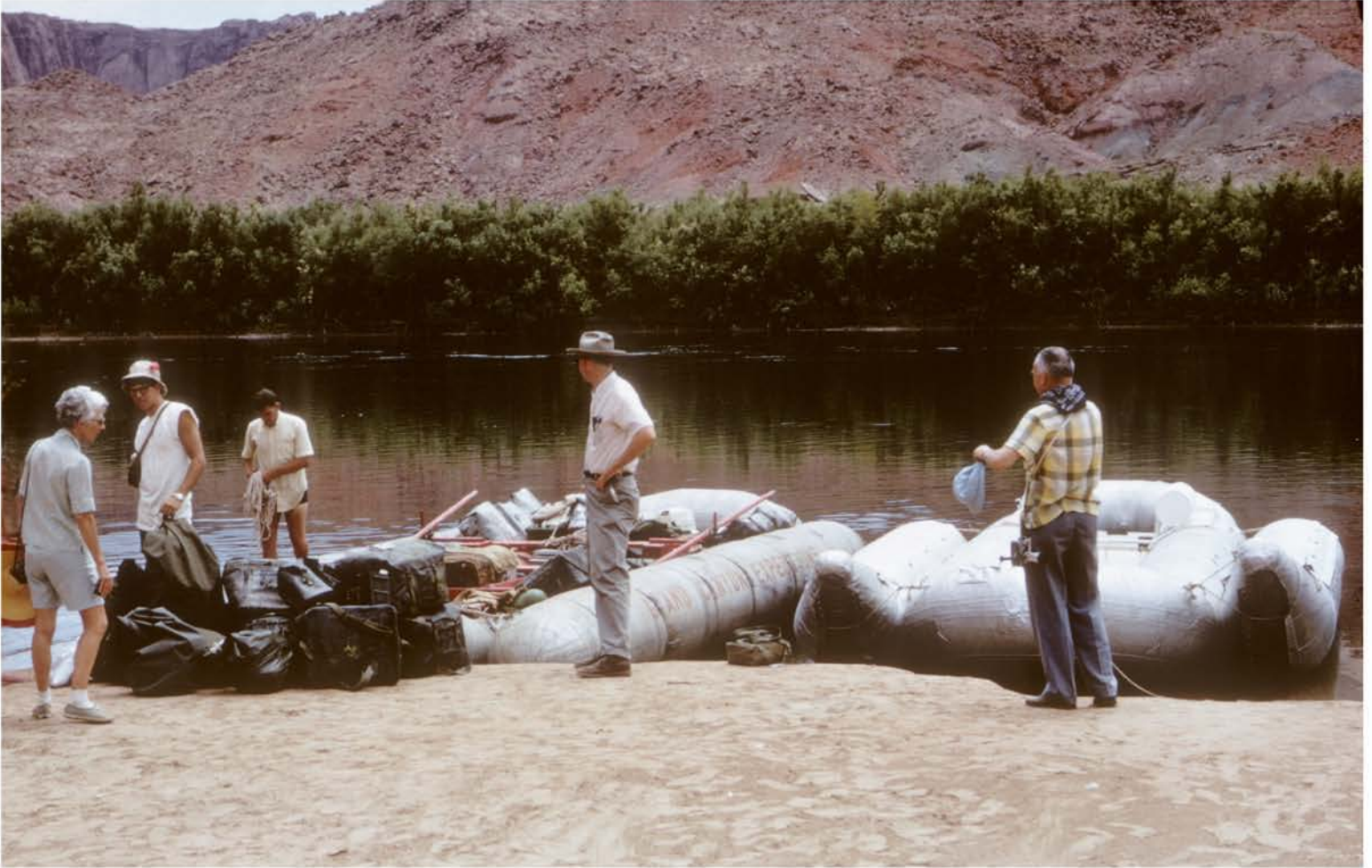
Party Prepares The Big 'River Dinosaur' ... ... River Is Even Rough On This Monster