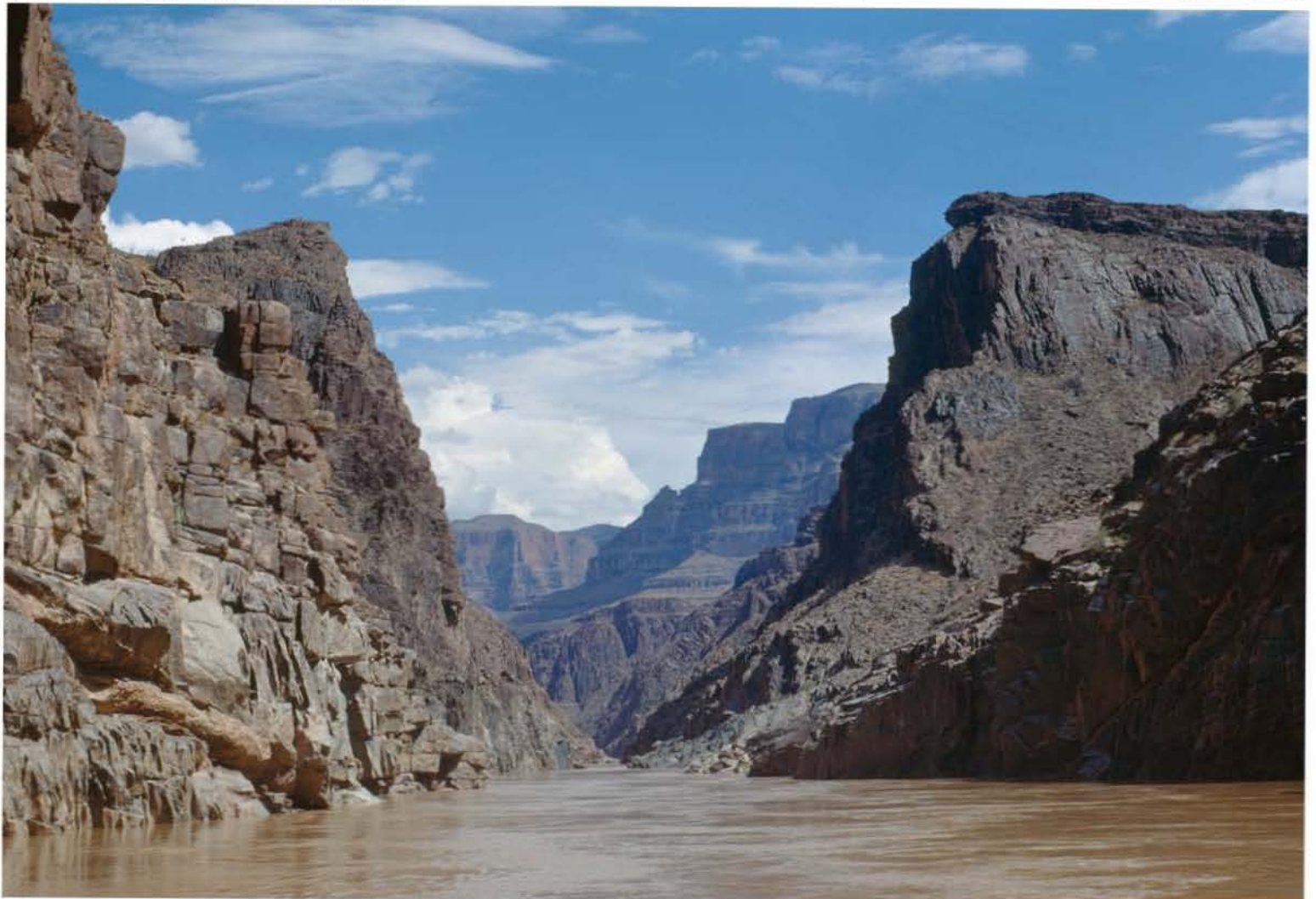
Colorado River Snakes Through Beautiful Walls Of Grand Canyon

Suddenly we come down hard, with a loud crash that jars the whole boat. We have hit a rock, a big one. A grinding crash follows as wood and fiberglass splinter. Blinded by the water, it is difficult to see just what