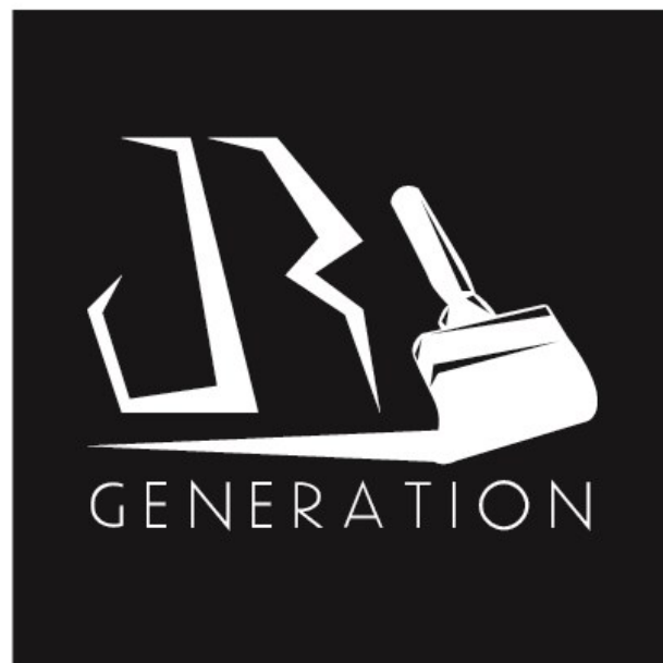
Figure 2: JR Logo Design.