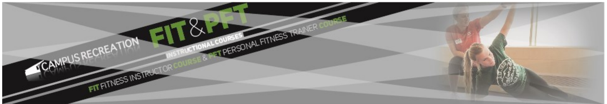
Figure 10: Fitness Digital Banner.