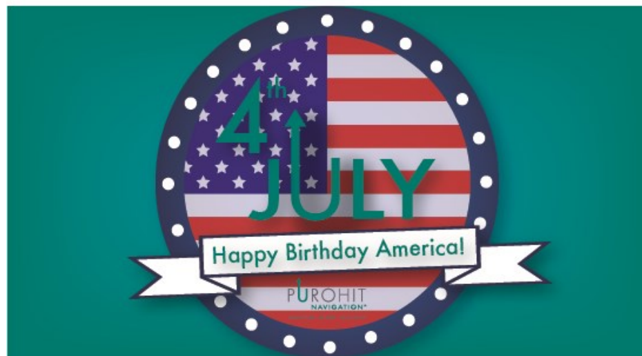
Figure 4: Social Media.