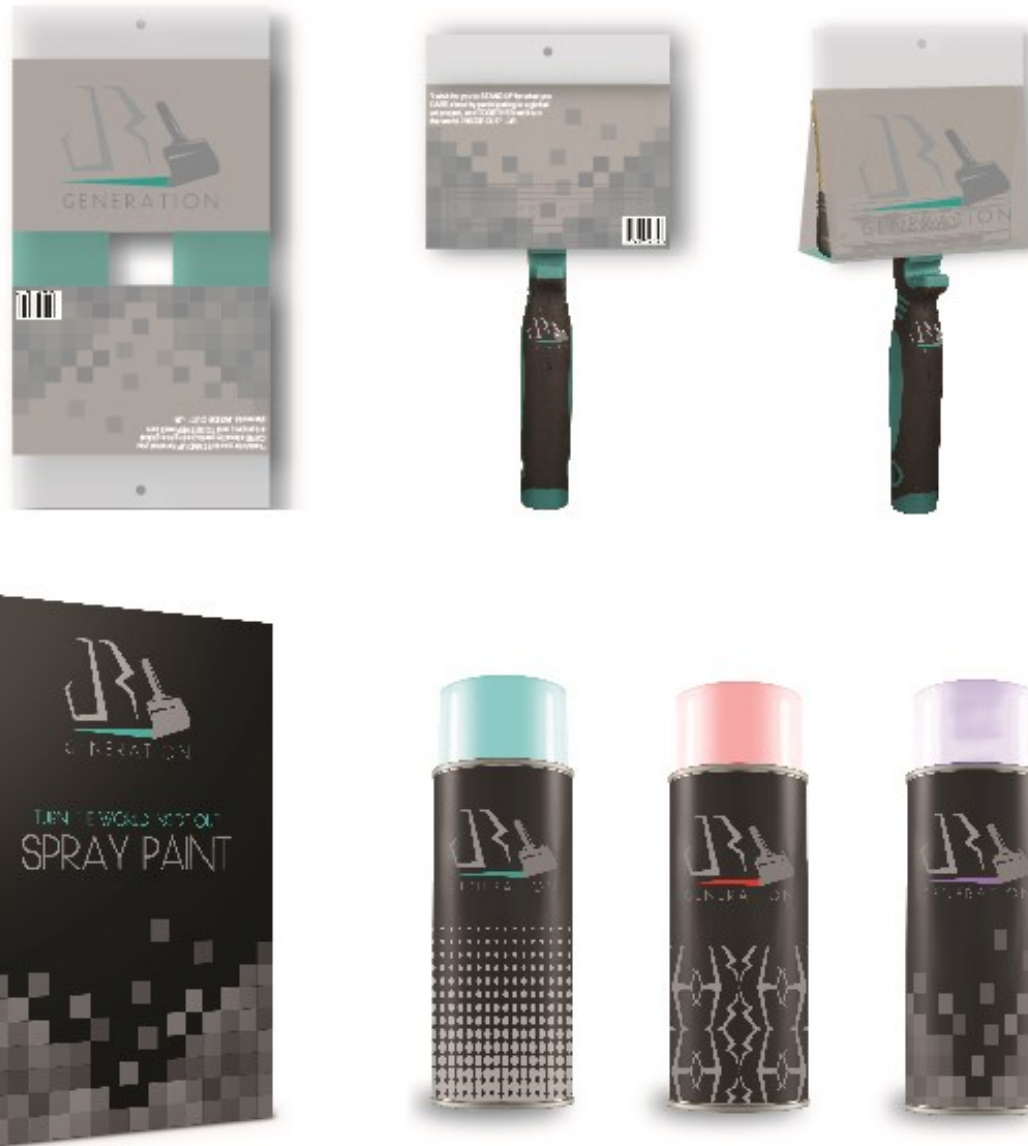
Figure 3: JR Packaging.