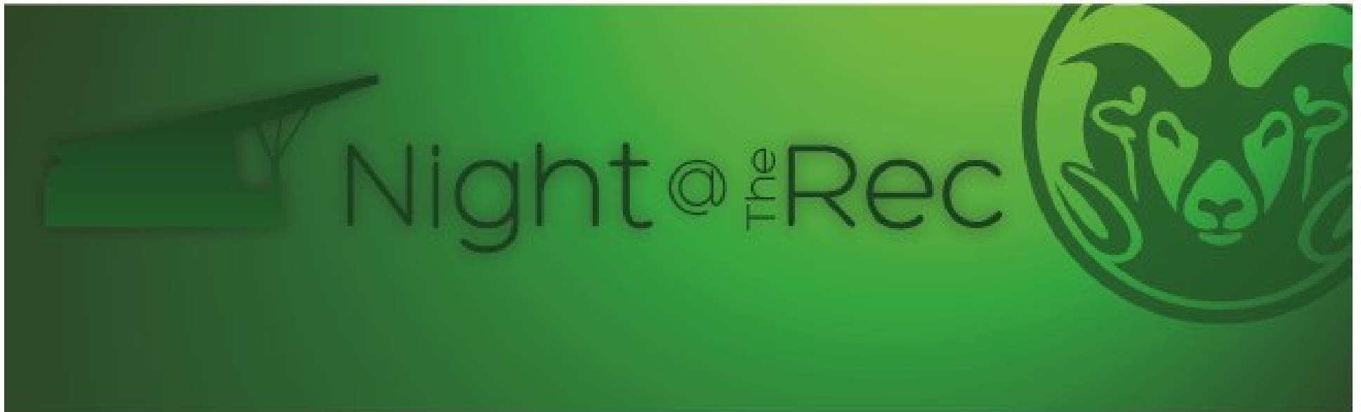
Figure 7: Night @ the Rec Website Banner.