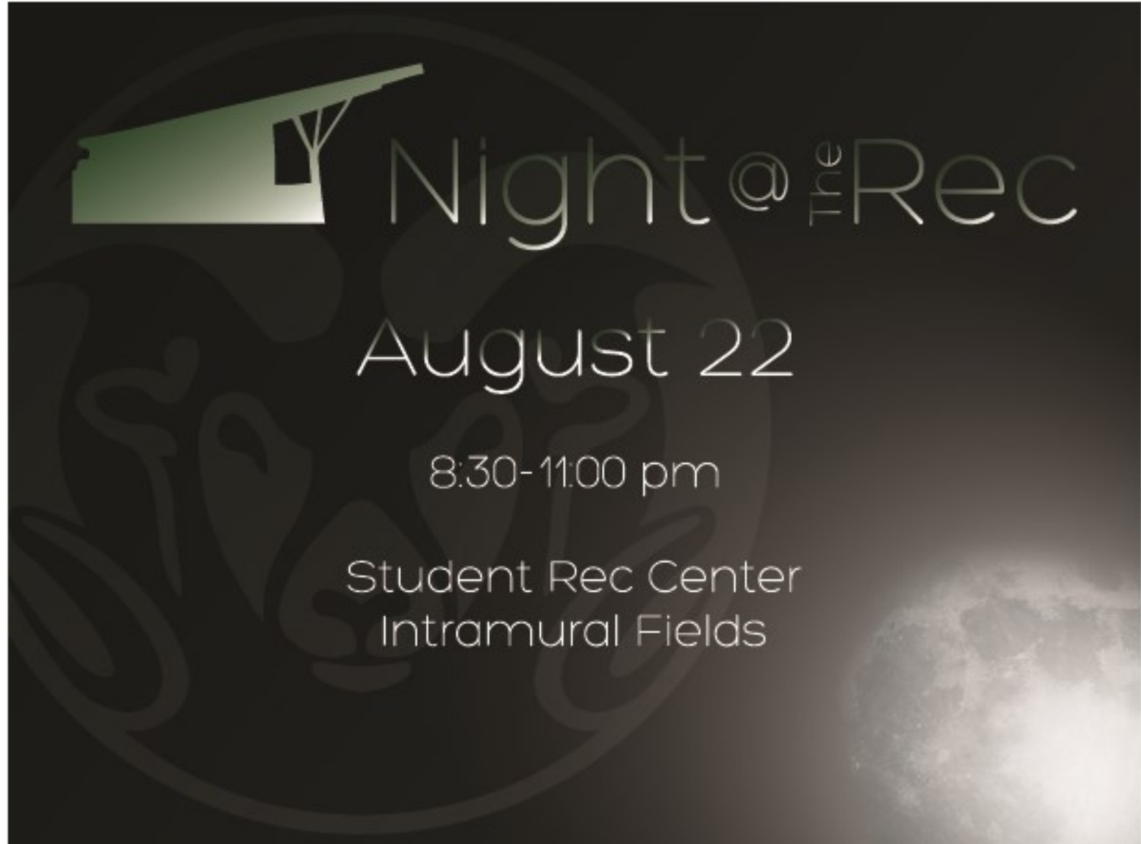
Figure 6: Night @ the Rec Digital Screen.