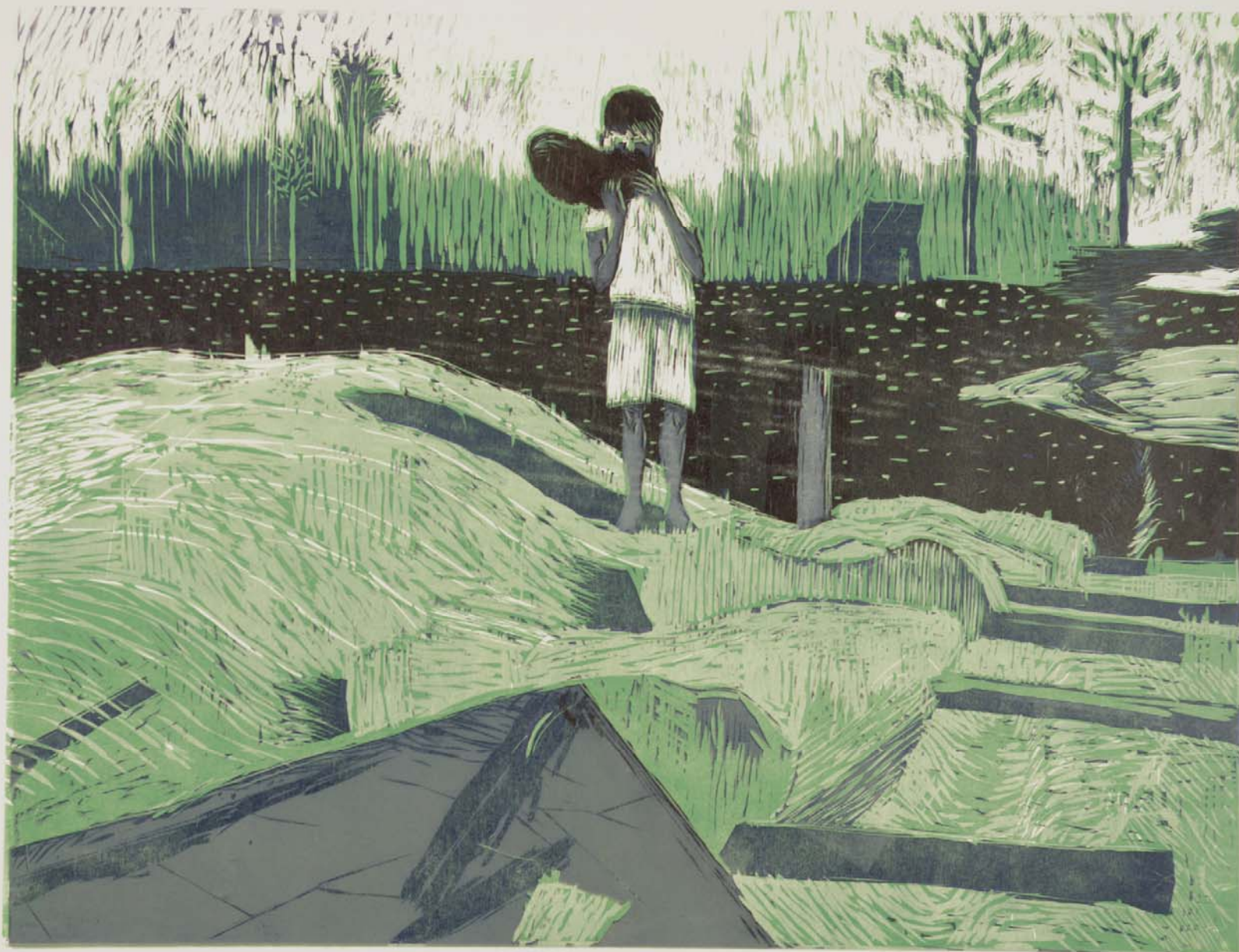
Figure 10: The Last Bite.