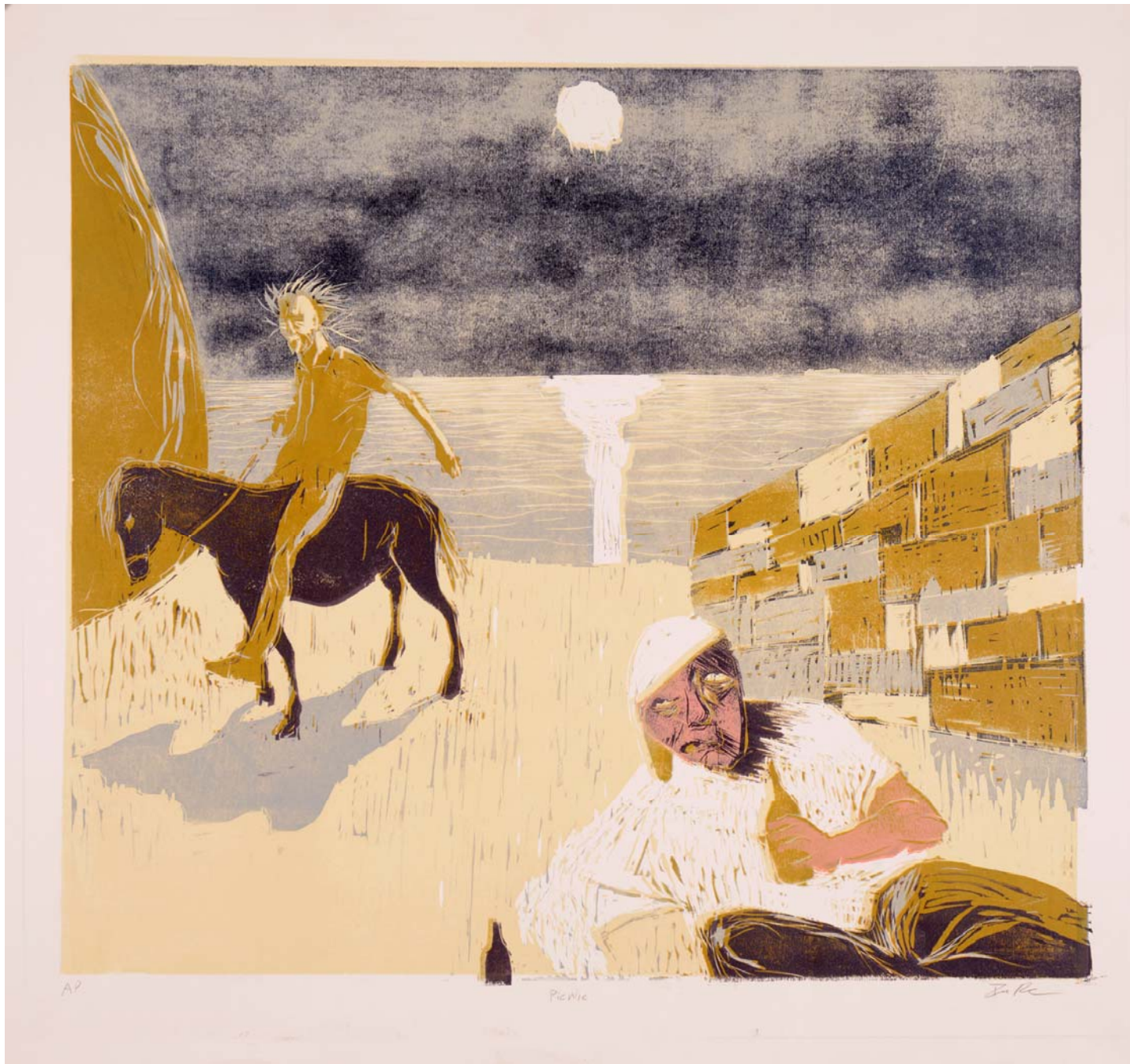
Figure 5: Picnic.