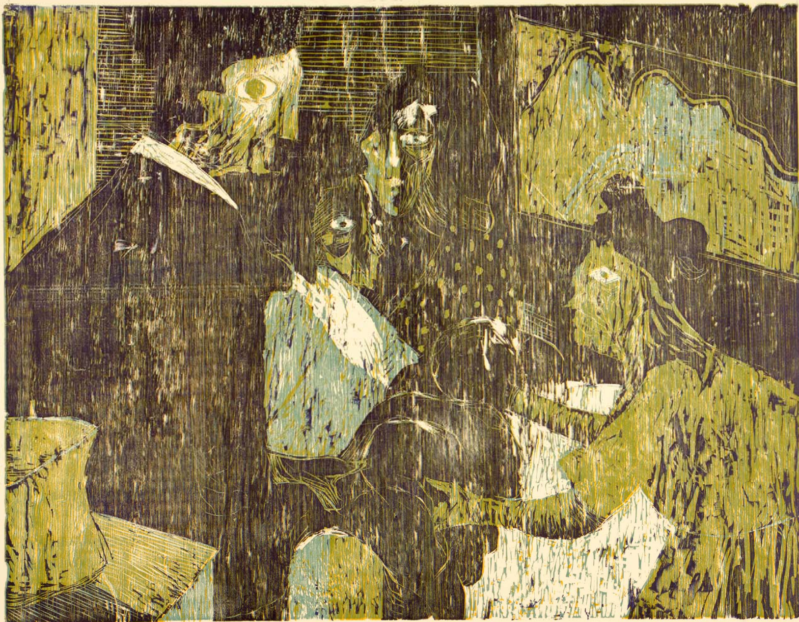
Figure 1: Exchange.