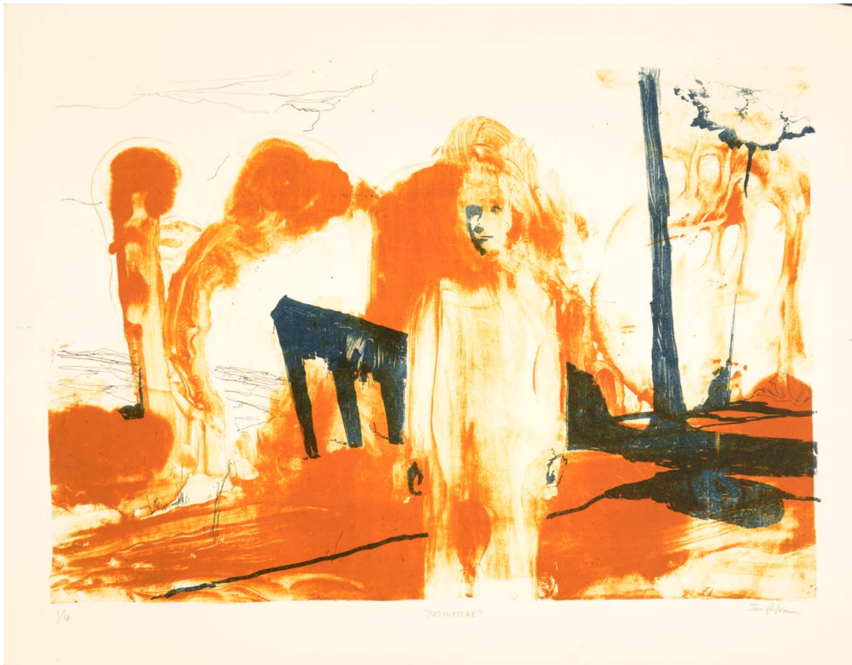
Figure 4: Nowhere.