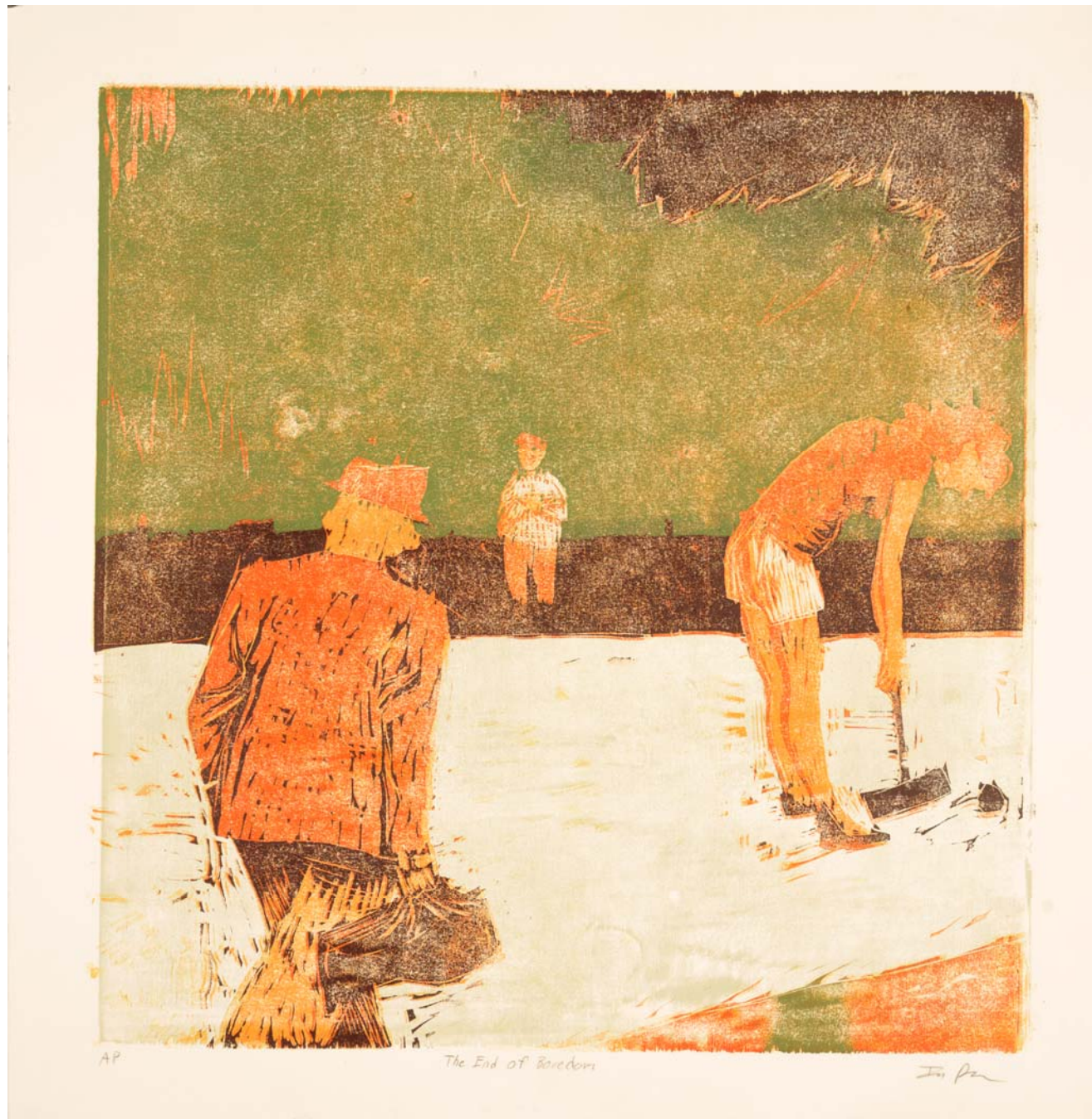
Figure 9: The End of Boredom.