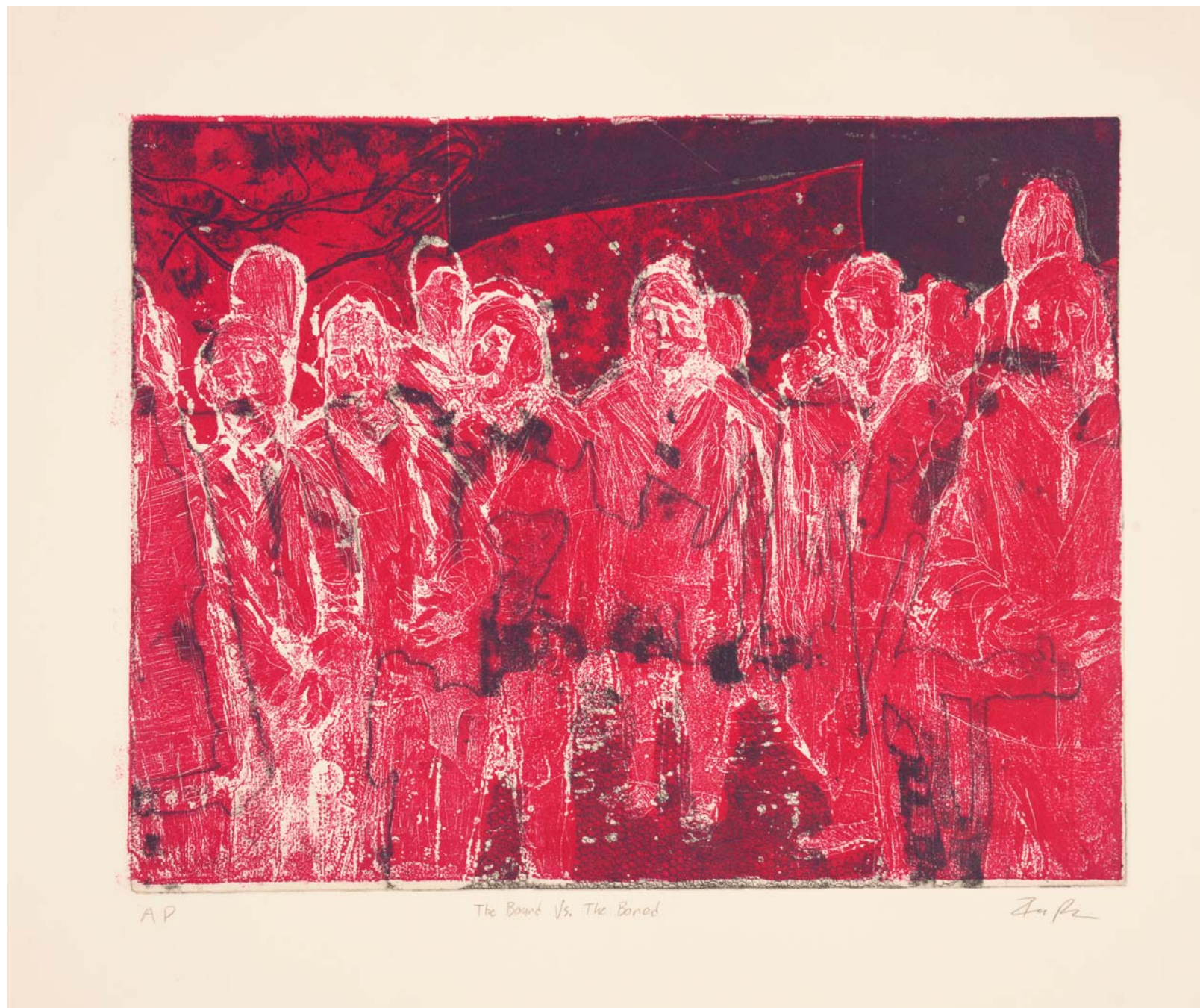
Figure 8: The Board Vs The Bored.