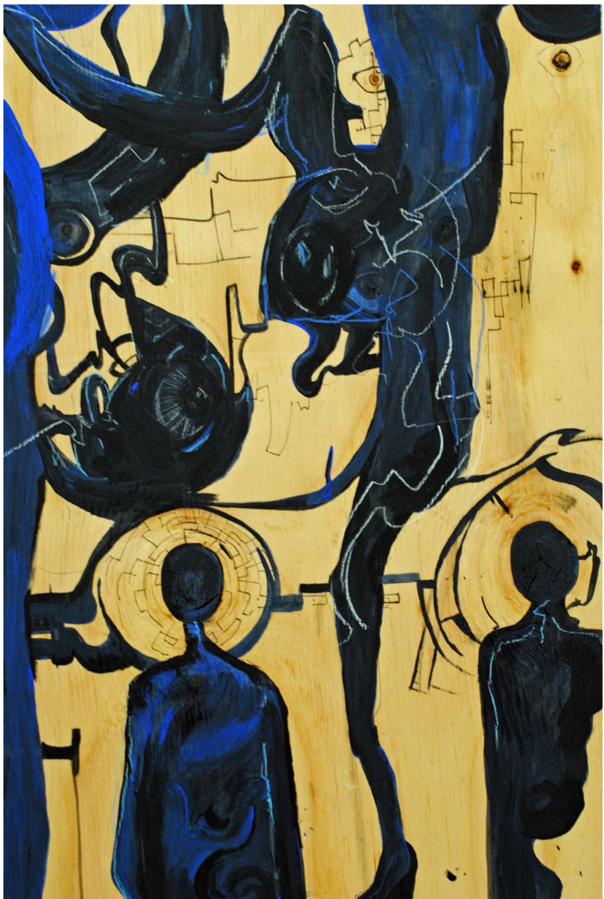
Figure 8: Unknown Title.