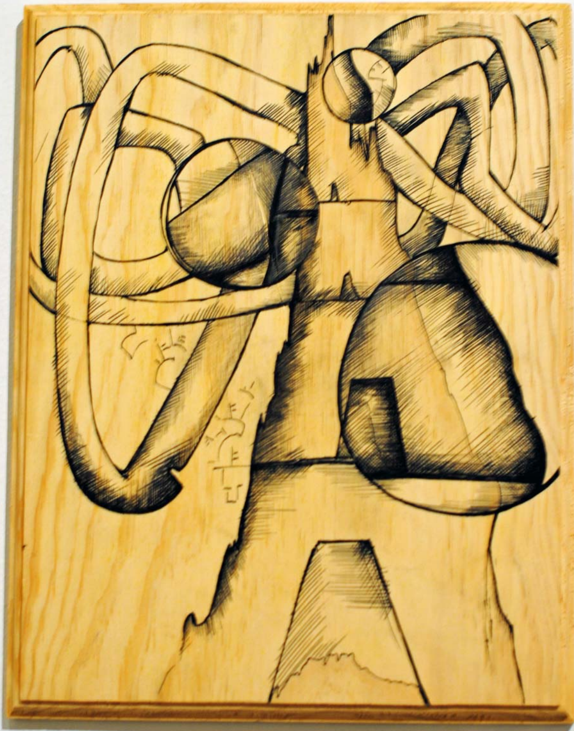
Alice Getz Tower Mixed Media 14 in x 10 1/2 in