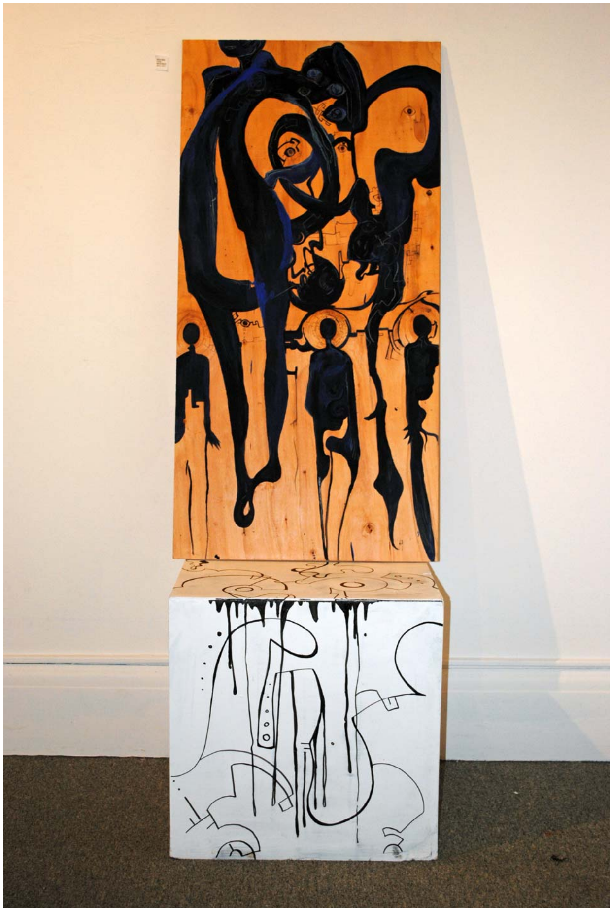
Figure 6: Unknown Title.