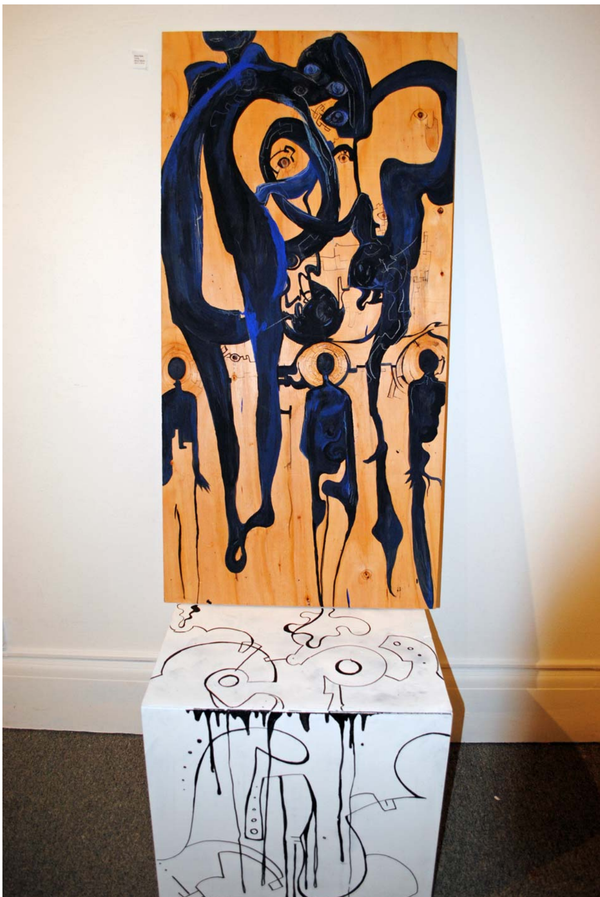
Figure 7: Unknown Title.