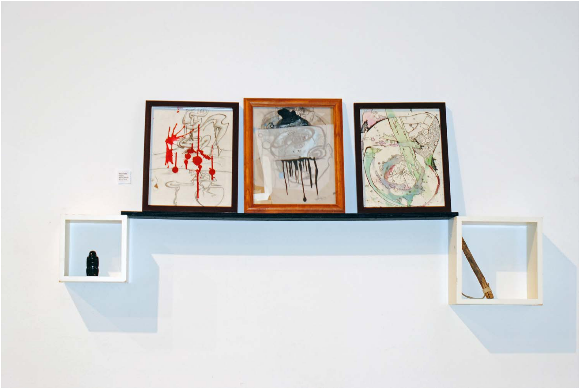
Figure 10: Unknown Title.