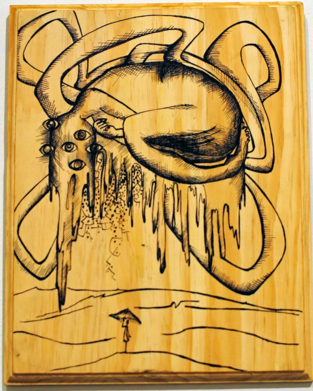
Alice Getz Rain Mixed Media 14 in x 10 1/2 in