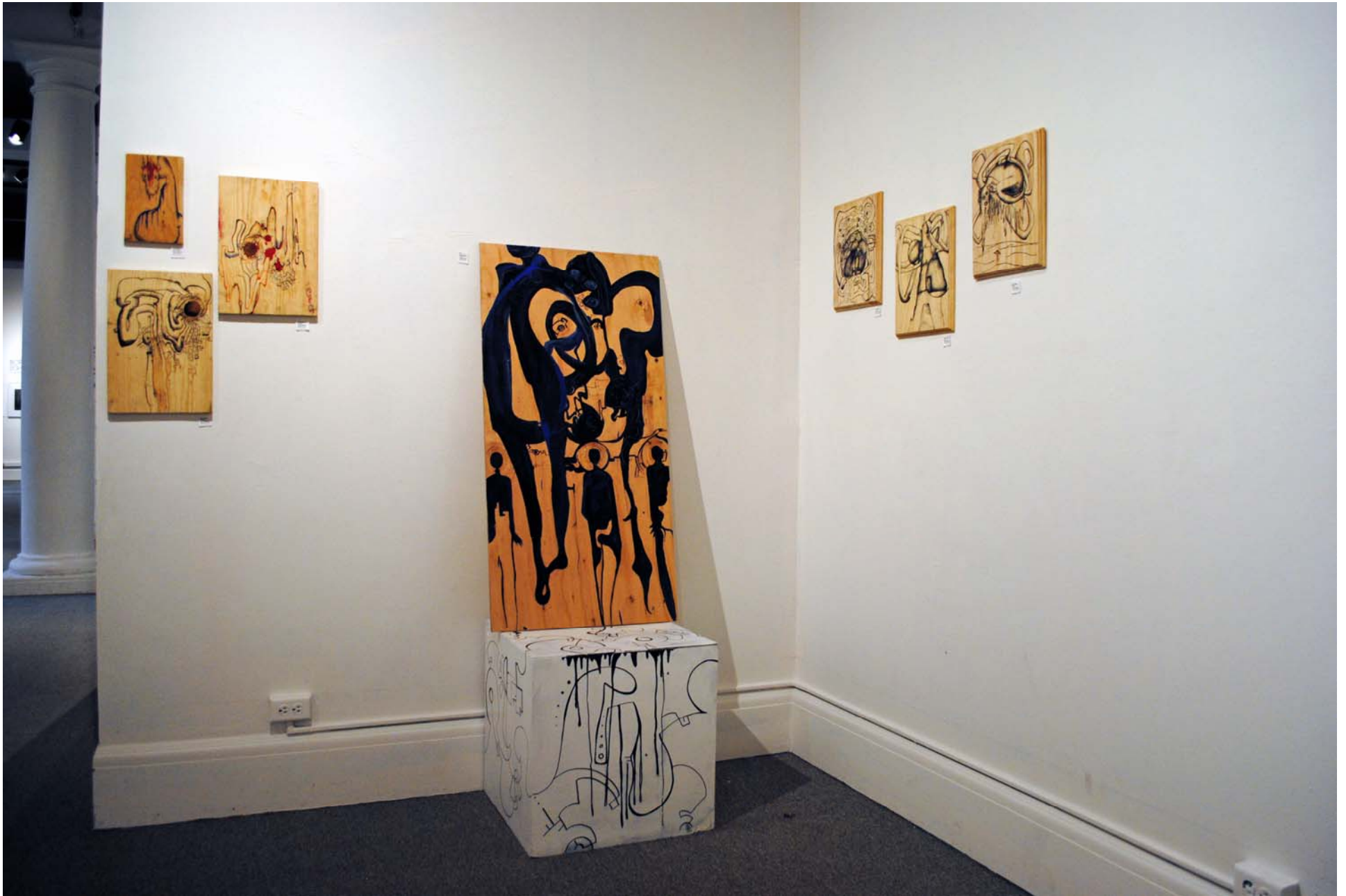
Figure 2: Unknown Title.