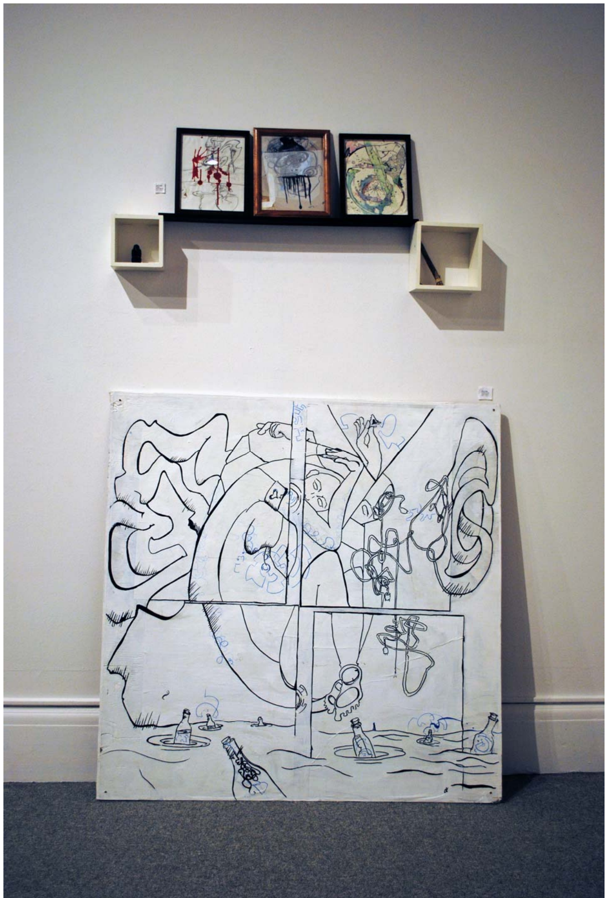
Figure 9: Unknown Title.