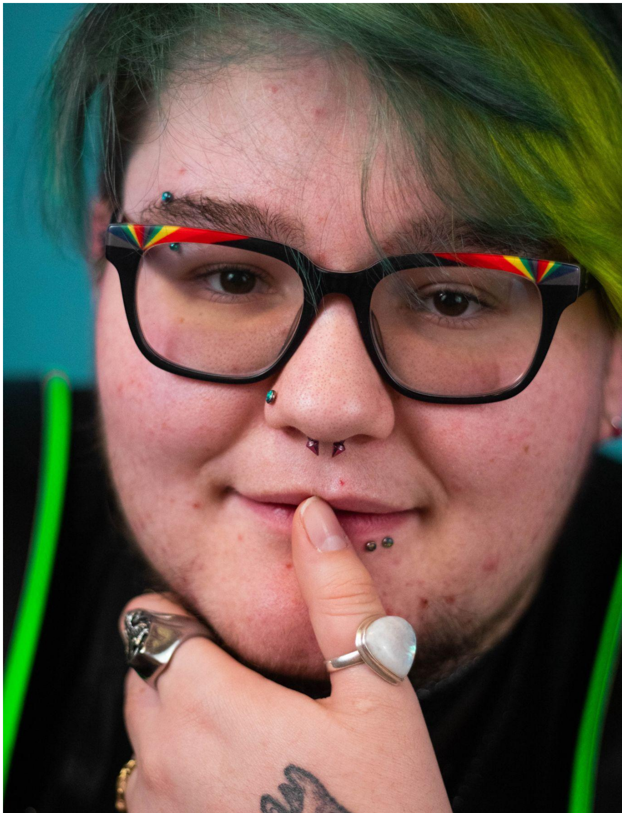
Figure 8: Q, 2