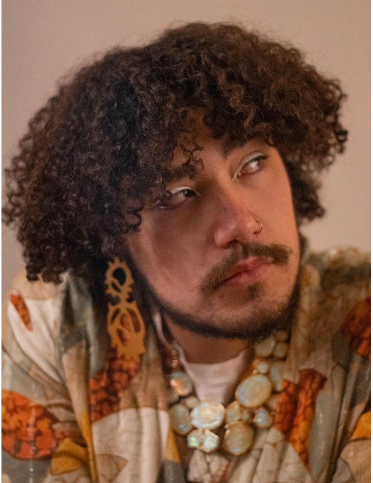
Figure 11: V, 1