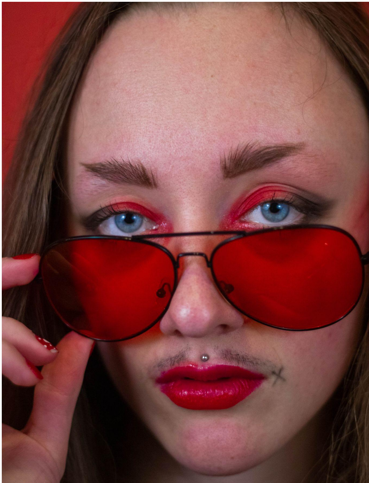
Figure 6: Kase, 2