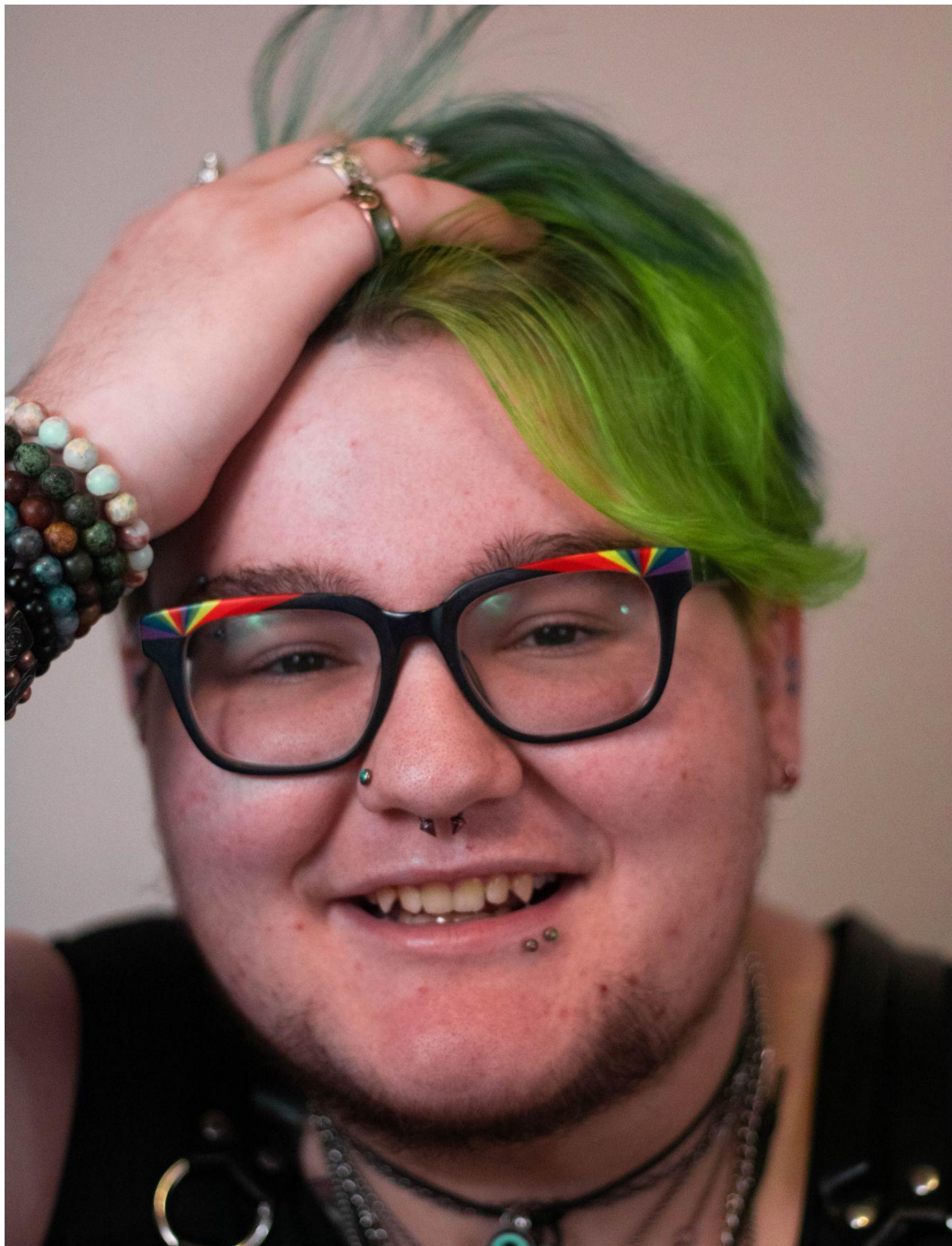
Figure 7: Q,1