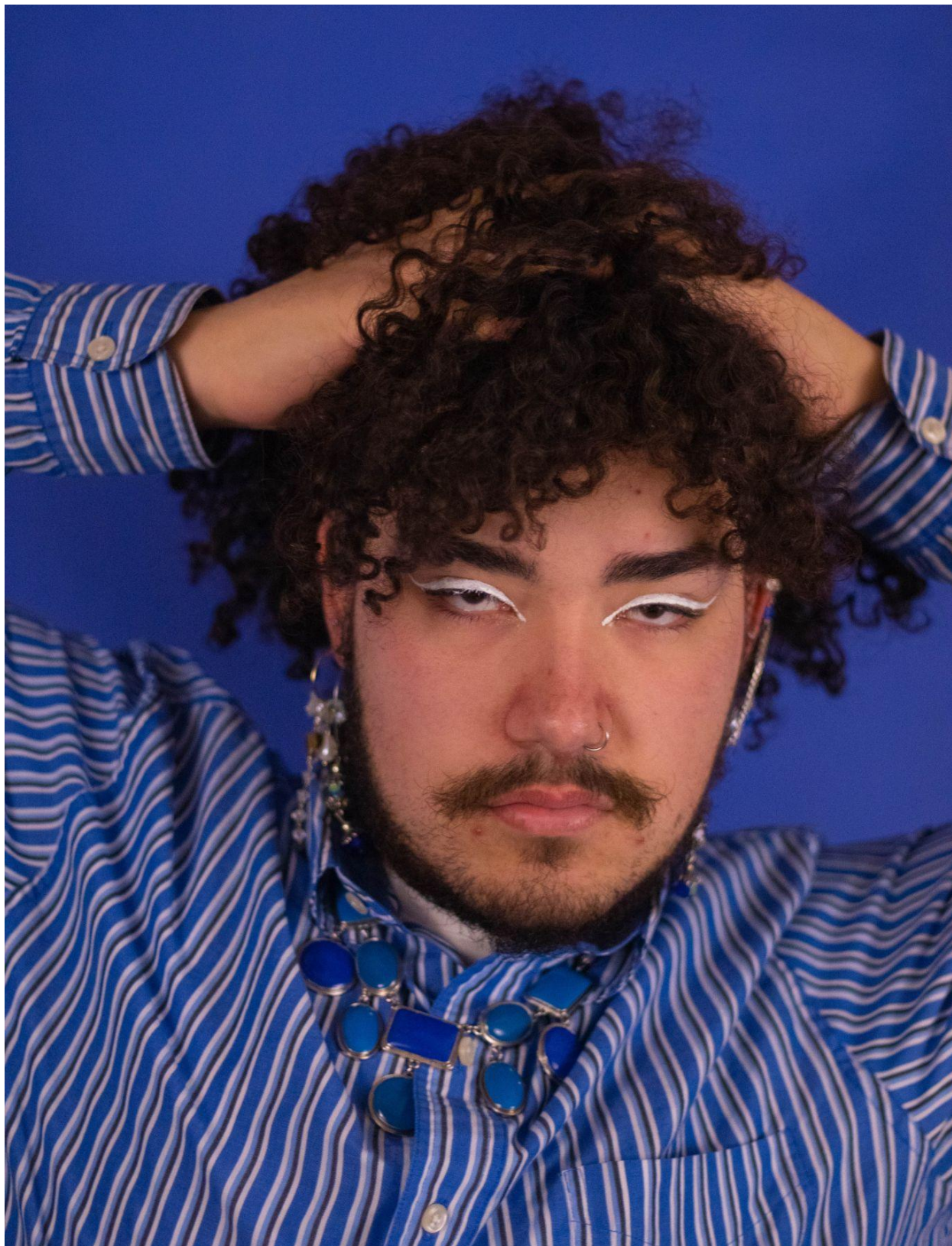
Figure 12: V, 2