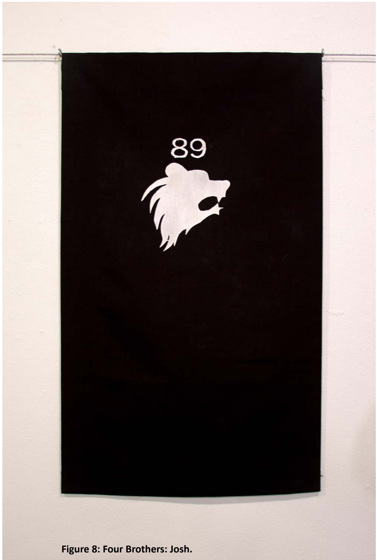
Figure 8: Four Brothers: Josh.