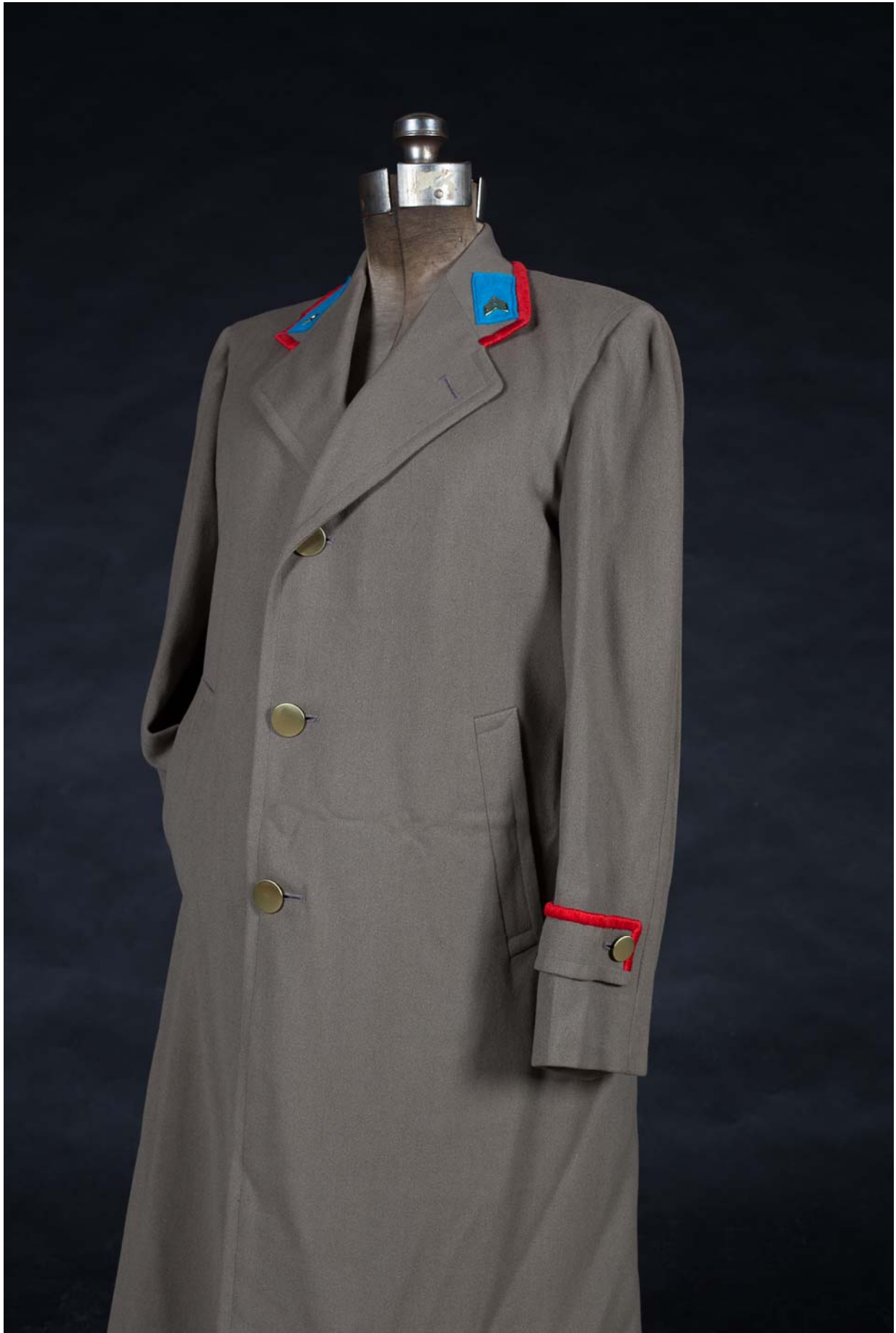
Figure 4: Uniform: Roklund.