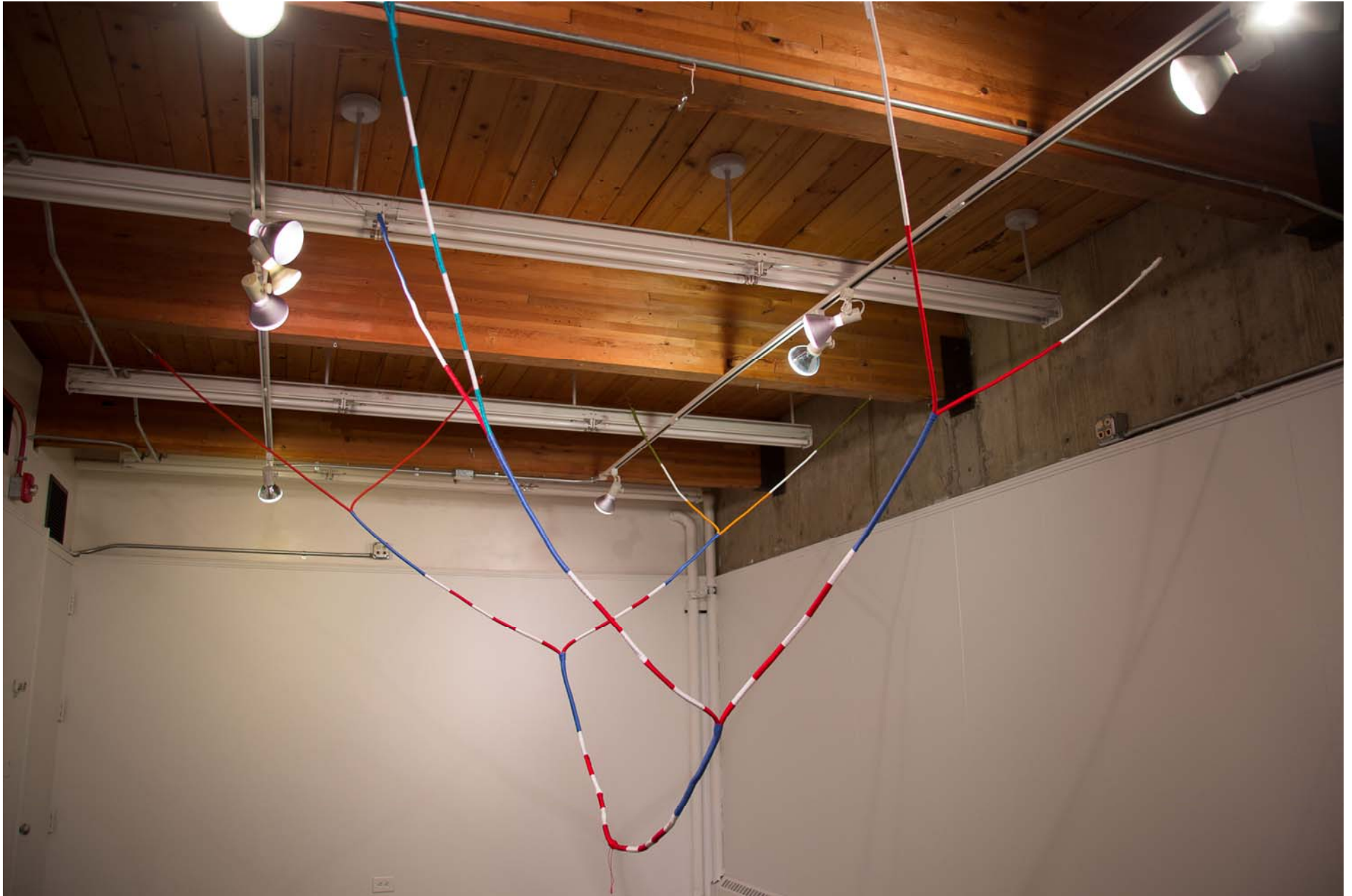
Figure 5: Family Tree.