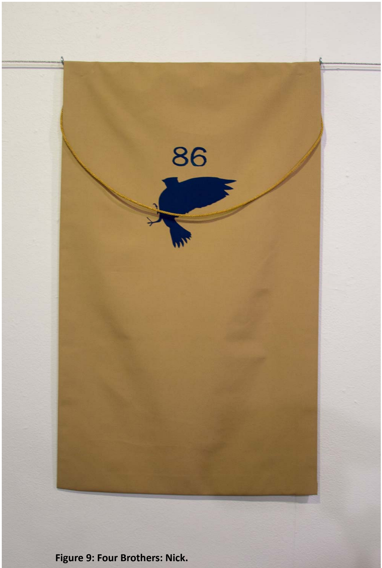
Figure 9: Four Brothers: Nick.