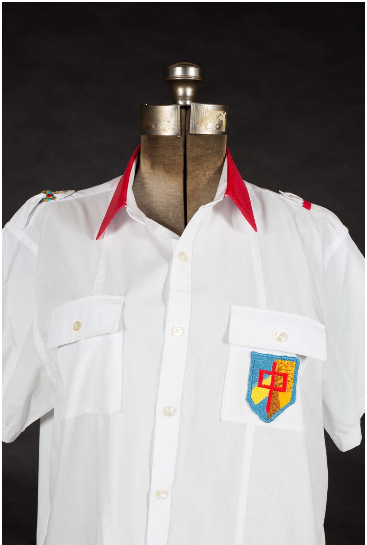
Figure 1: Uniform: Nakaku.