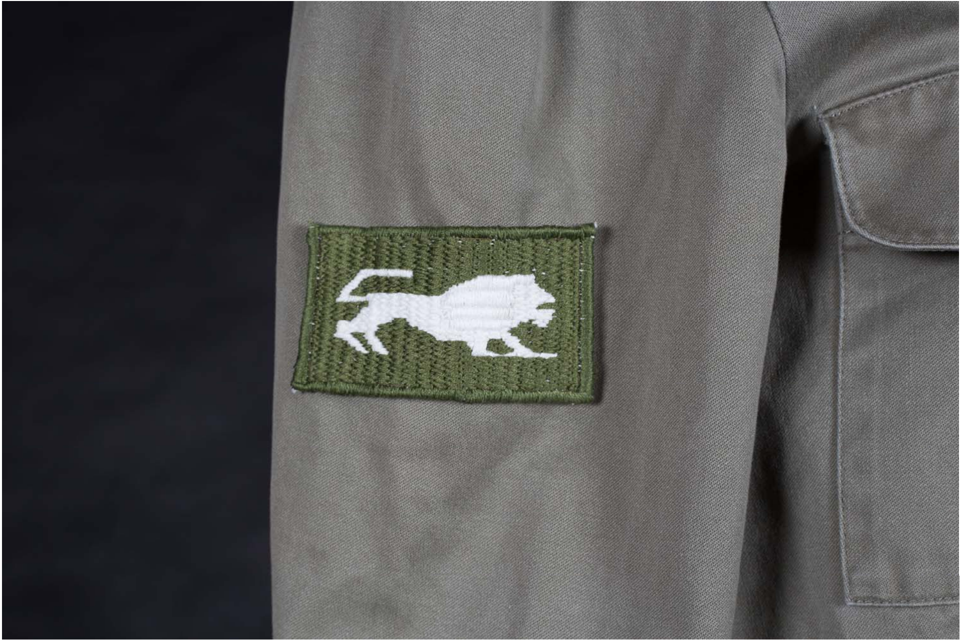
Figure 3: Uniform: Singriar (detail).