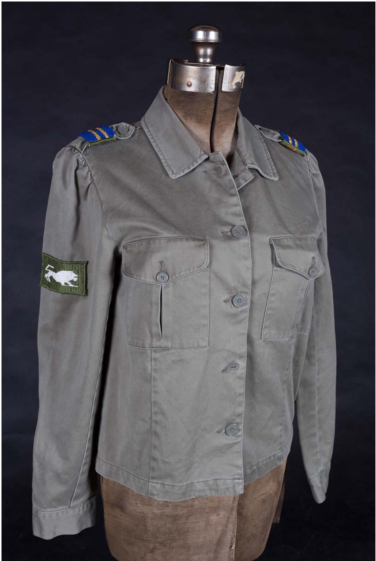
Figure 2: Uniform: Singriar.