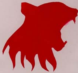
Figure 7: Four Brothers: Matthew.