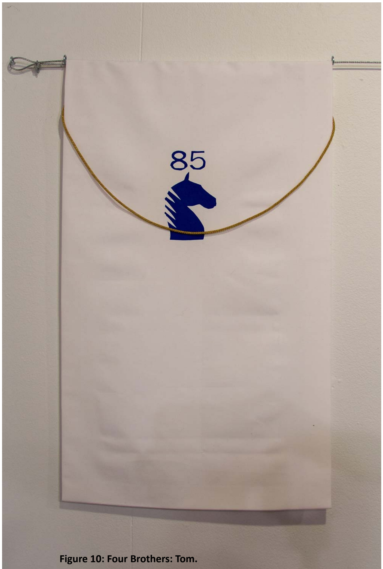
Figure 10: Four Brothers: Tom.