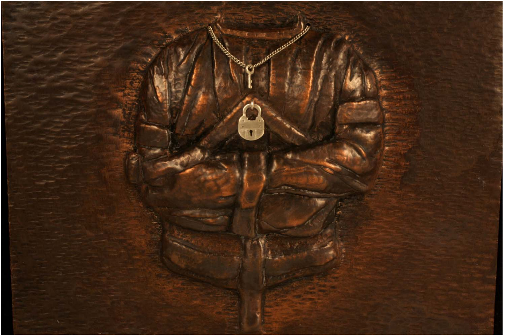
Figure 2: Self Imprisonment (detail).