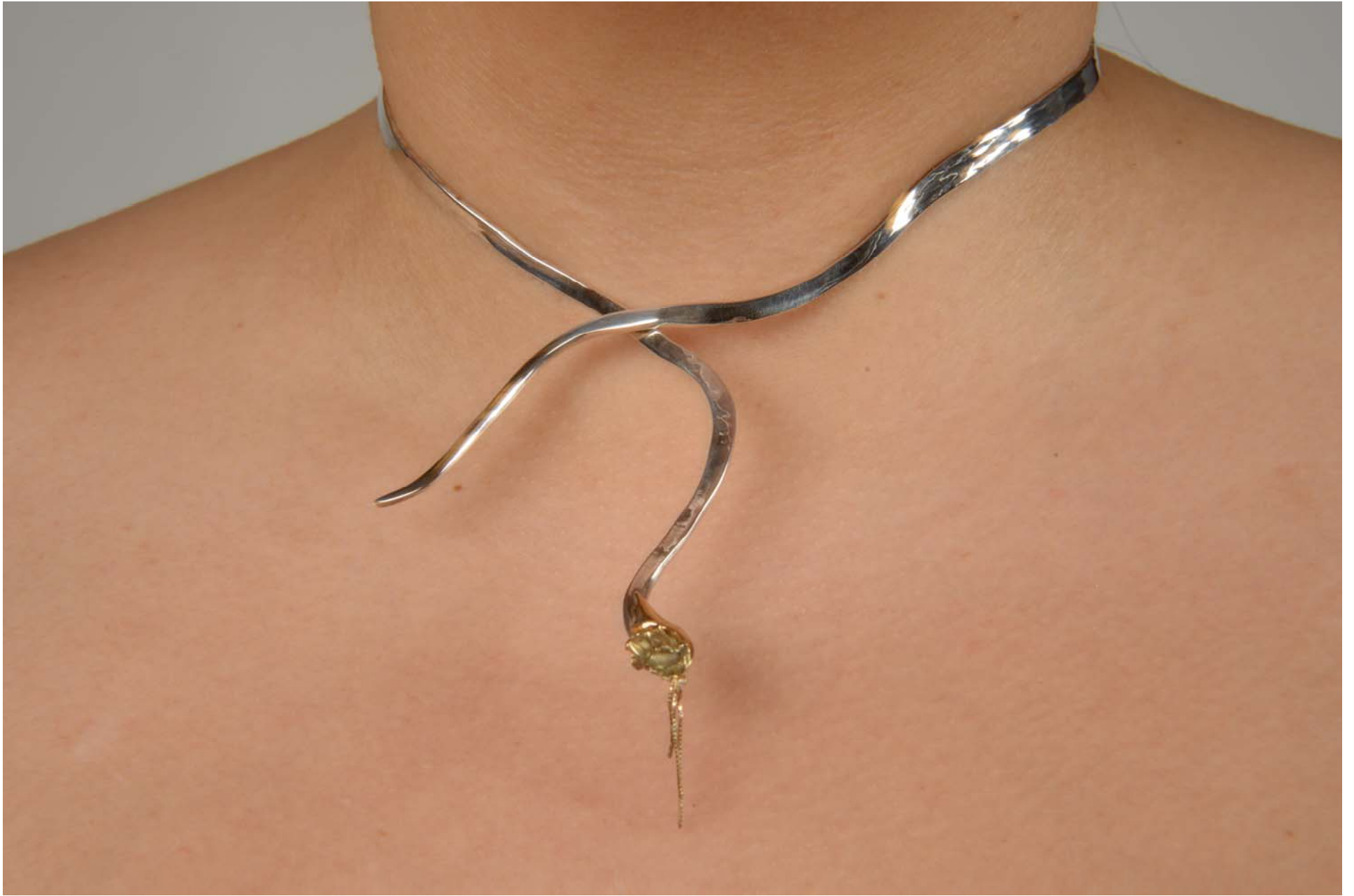
Figure 12: Beauty in the Eye of the Beholder.