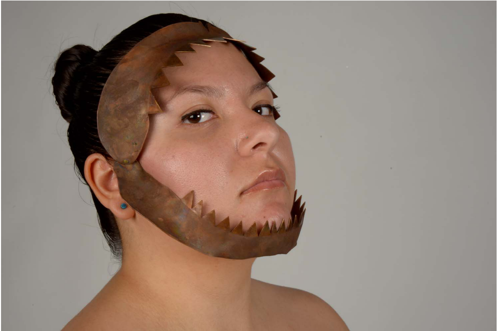
Figure 16: Shark Bait (Detail).