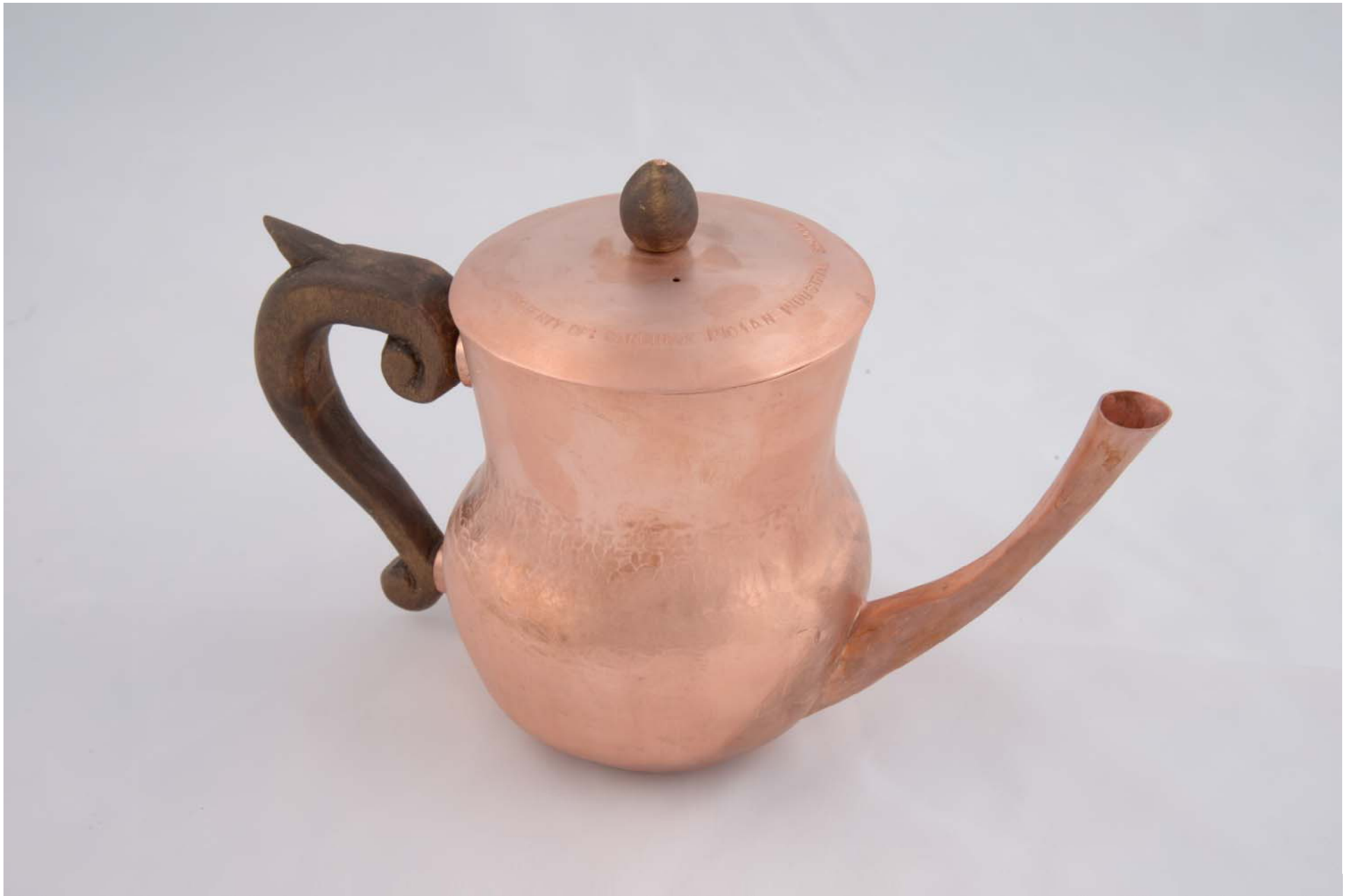
Figure 11: Kill the Indian, Save the Man.