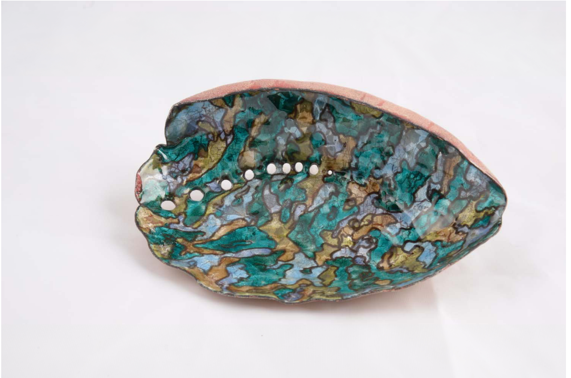
Figure 10: Smudge Bowl.