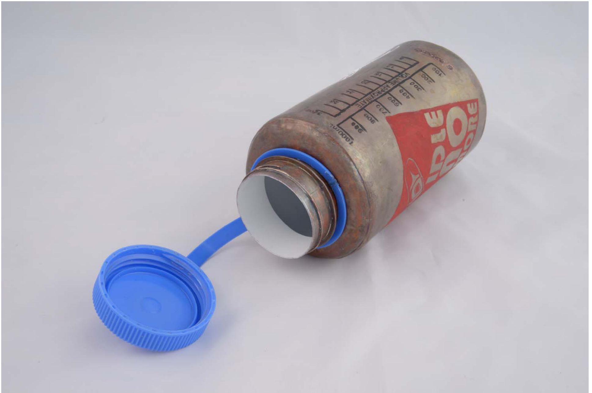
Figure 9: Activist Paraphernalia (Inside Detail).