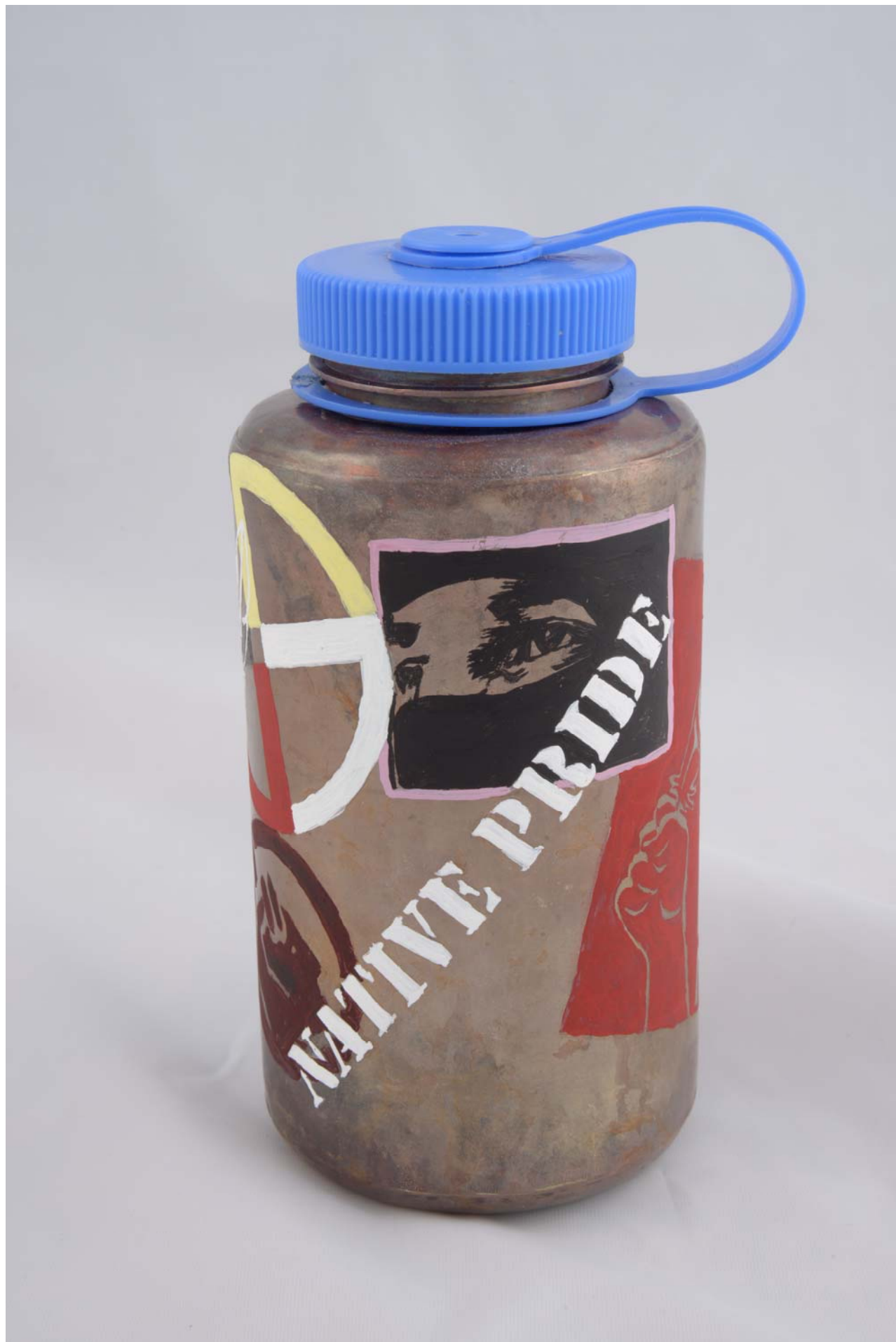
Figure 8: Activist Paraphernalia.