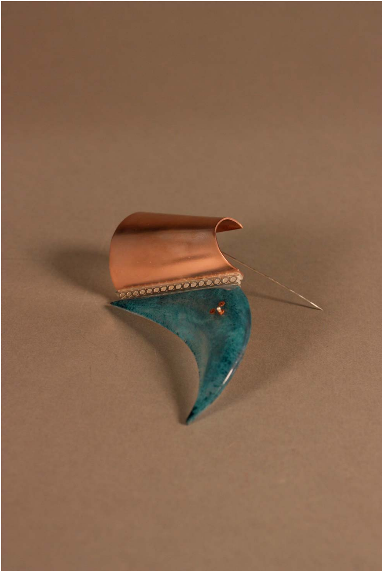
Figure 6: Copper Brooch (Front).