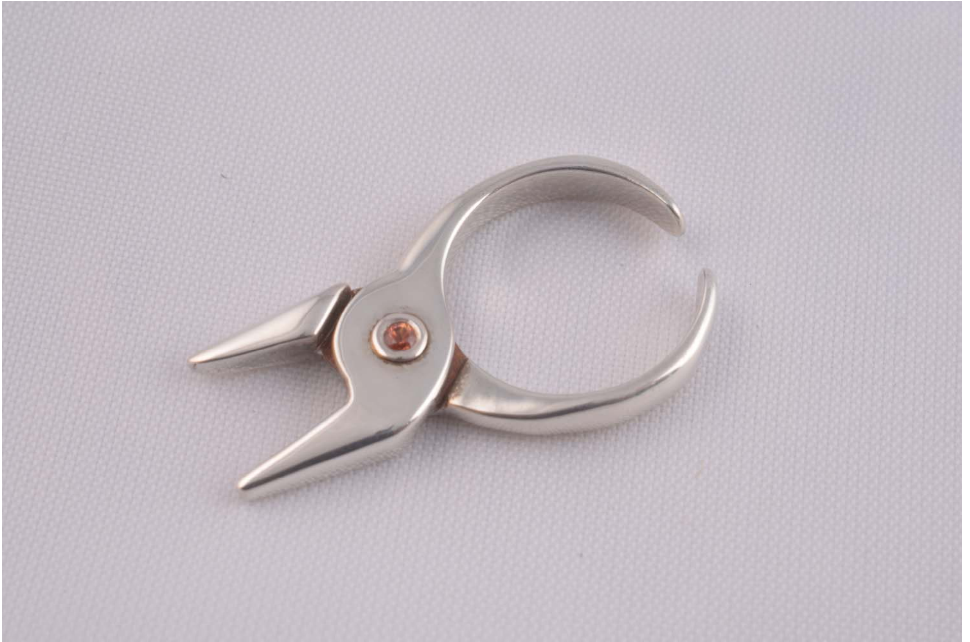
Figure 14: Pliers.