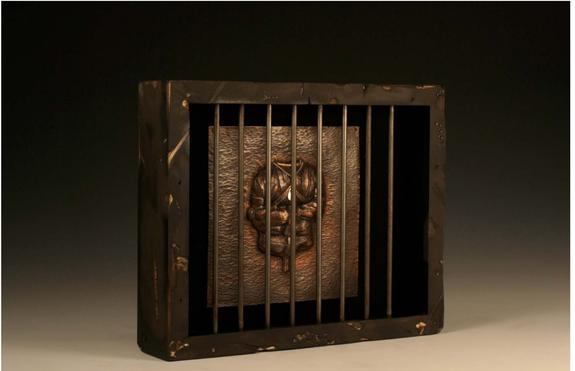
Figure 1: Self Imprisonment.