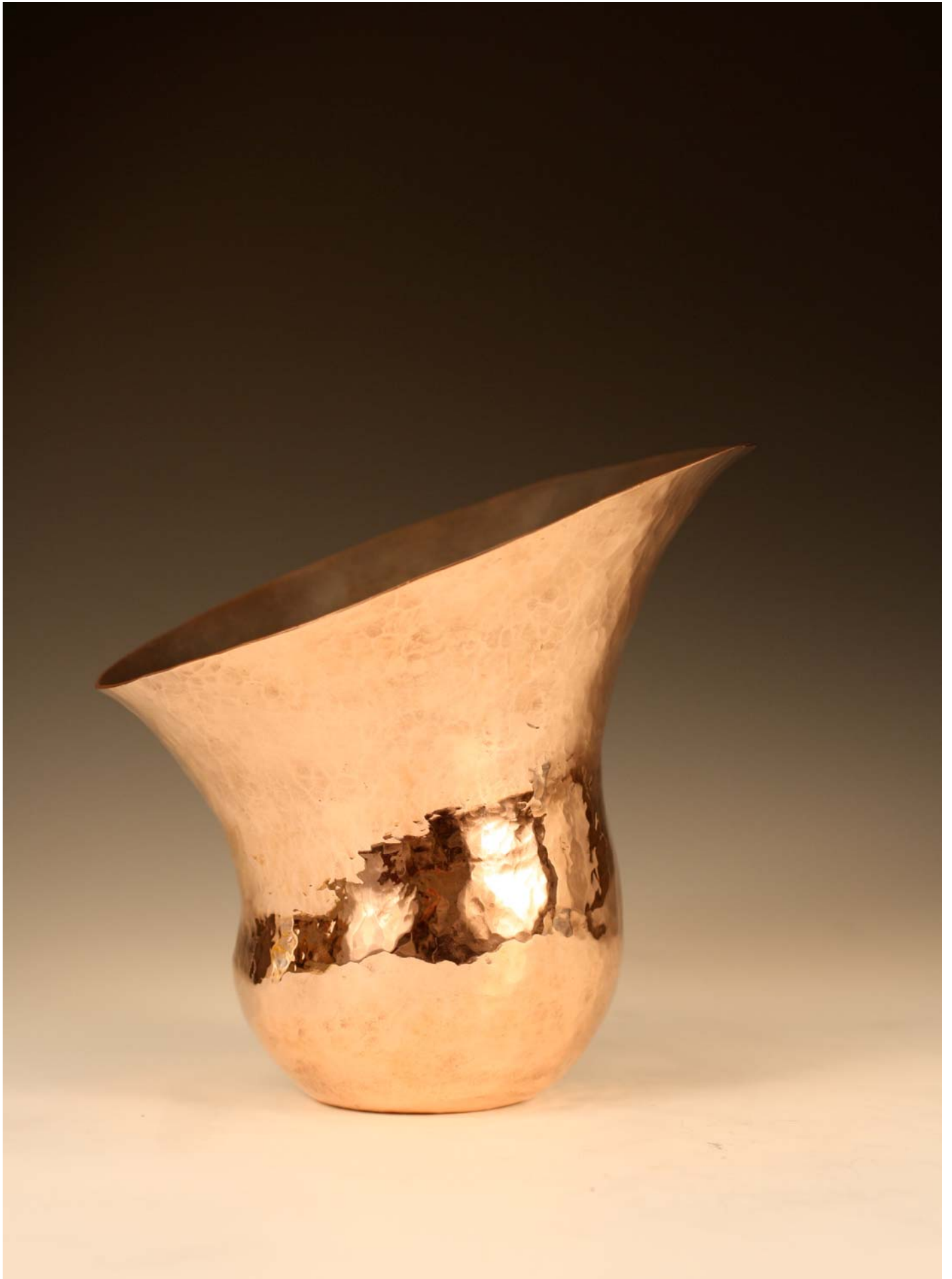
Figure 3: Vessel.