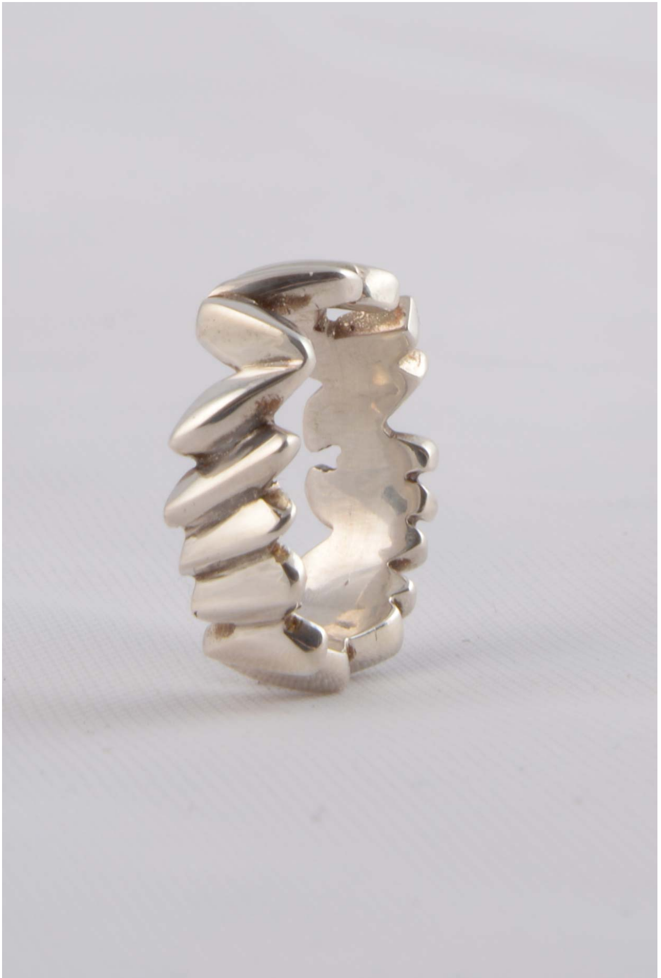
Figure 13: Cast Ring.