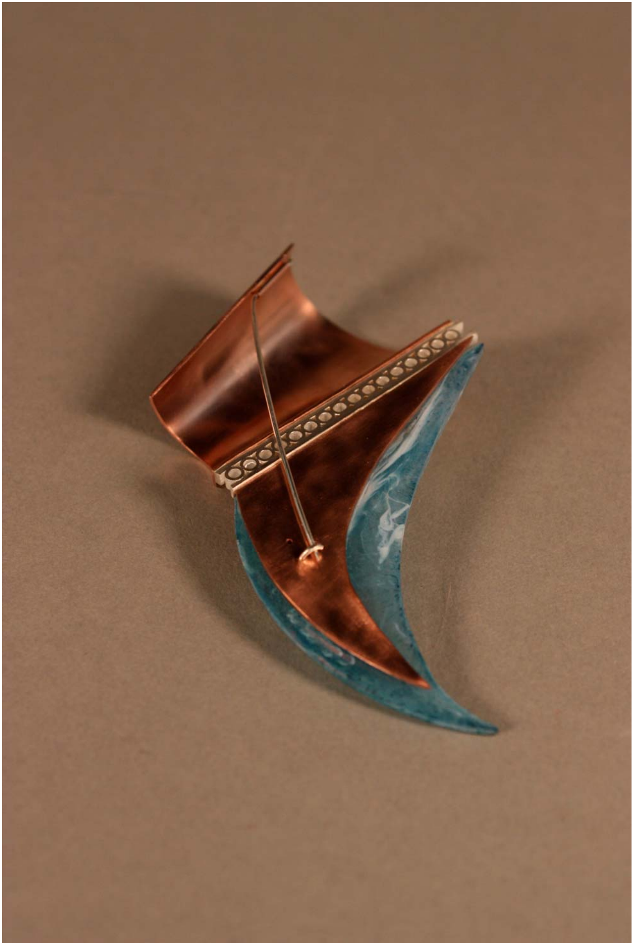
Figure 7: Copper Brooch (Back).