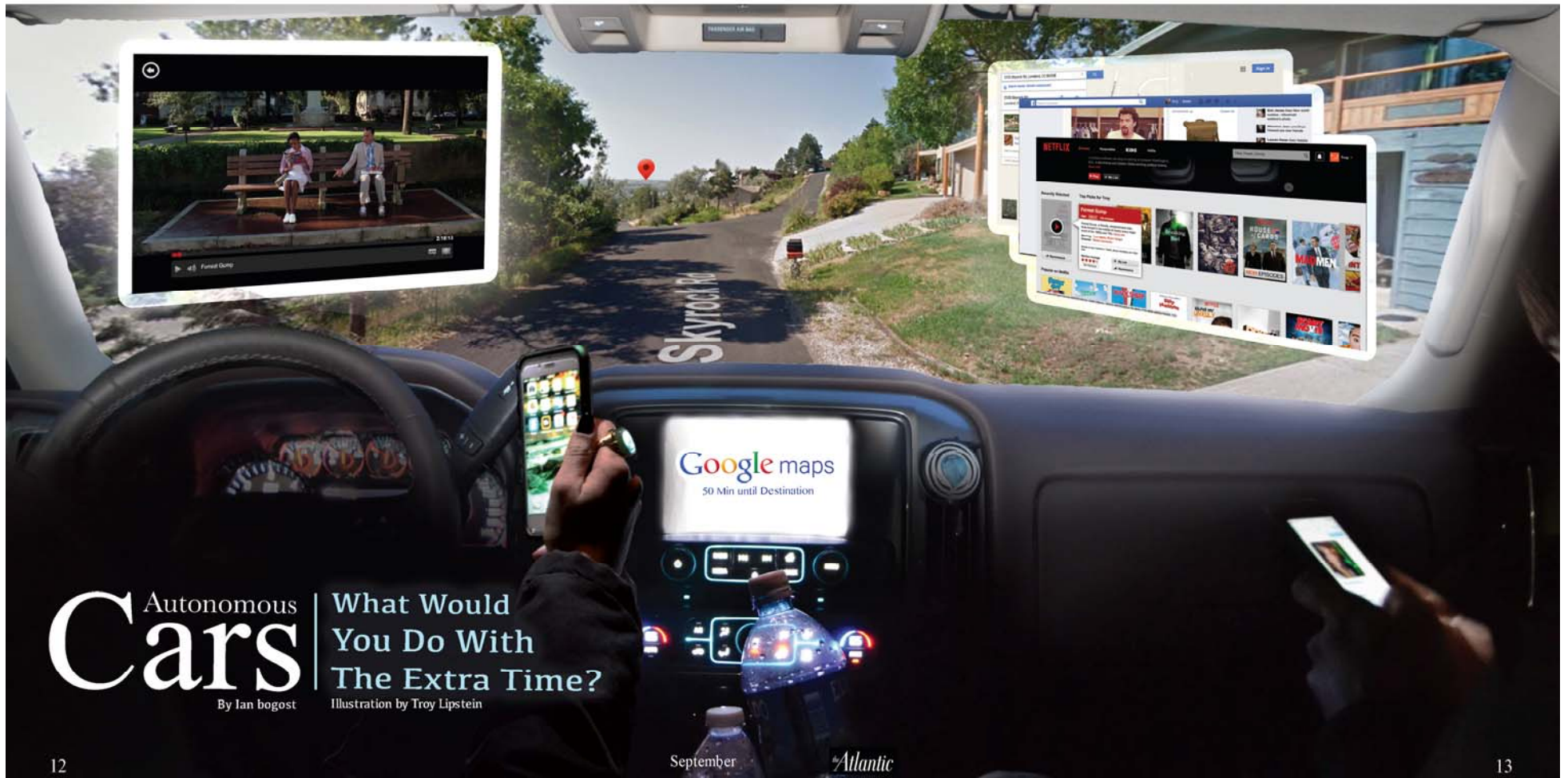
Figure 11: Autonomous cars.