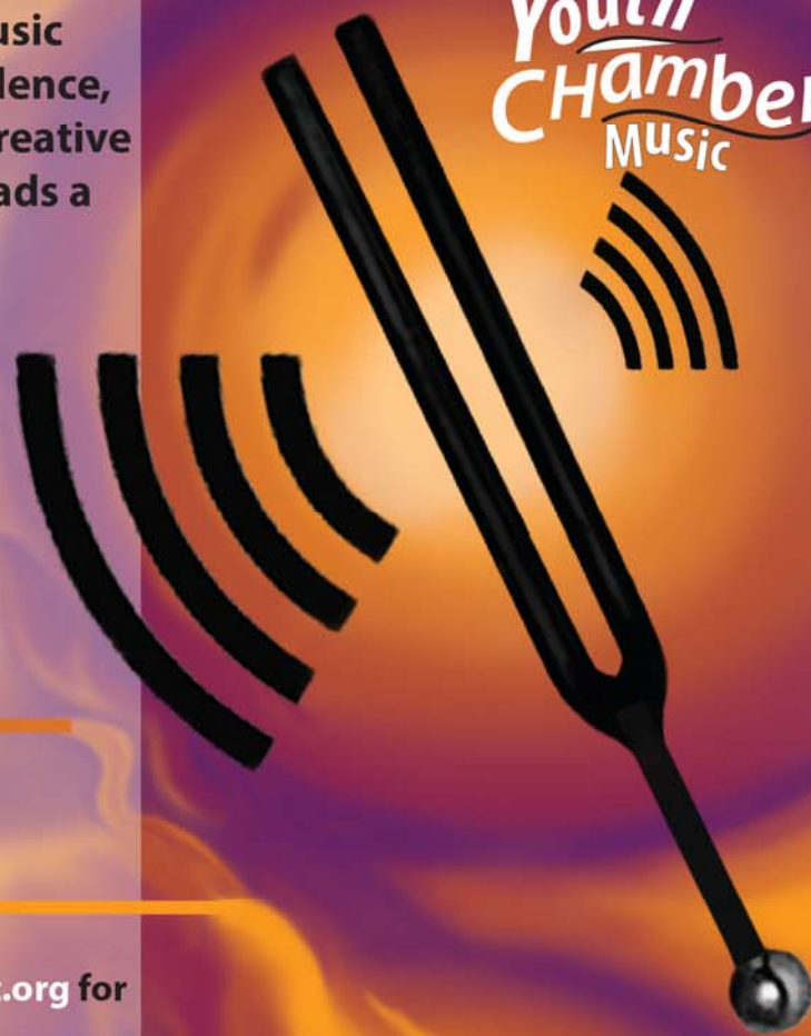
Figure 8: Brochure outside, PYCH.