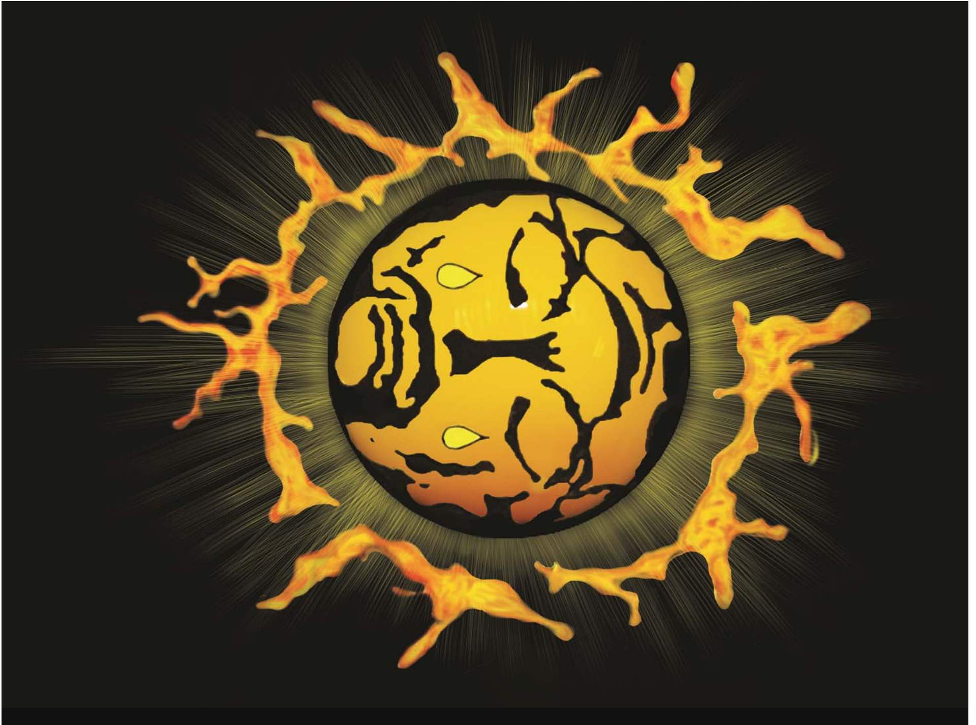
Figure 6: Sublime-Sun.