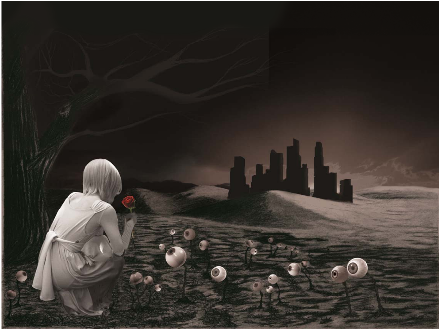
Figure 4: 1984.