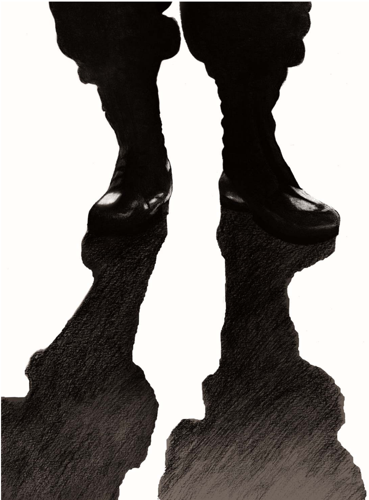
Figure 5: 1984-part2.