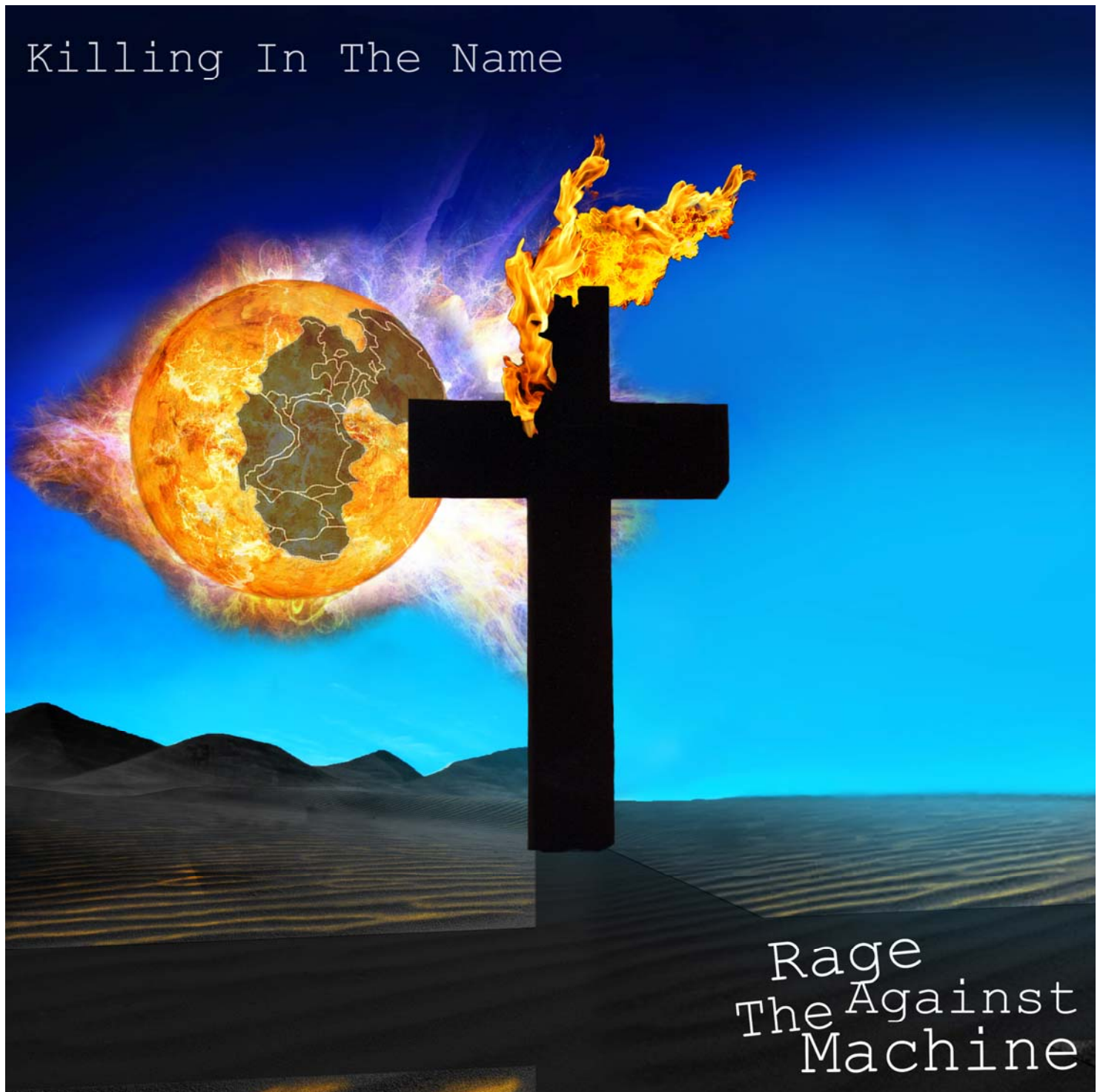
Figure 1: Rage Against the Machine, Part 1.