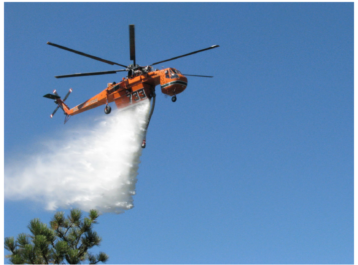
Helicopter utilization during the Fourmile Canyon Fire.