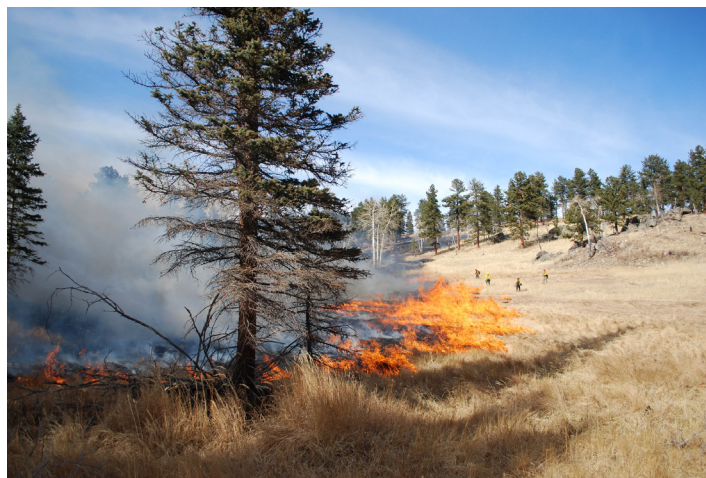
Prescribed fire at Mount Evans State Wildlife Area, December 2010.

The CSFS Golden District conducts prescribed fire with state and county agencies every year in the spring and fall. In 2010, a total of 271 acres were treated during broadcast burns at Golden Gate Canyon State Park and Mount Evans State Wildlife Area. Historically, 200-300 acres have been treated annually in these areas and on other properties such as White Ranch Open Space Park, Mount Falcon Open Space Park, Elk Meadow Open Space Park and Staunton State Park.