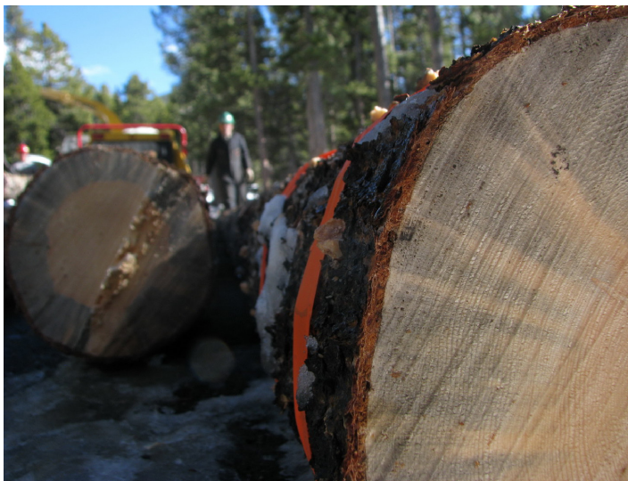
Mountain pine beetle-infected log showing blue-stain fungus.

Foresters on the Golden District continue to develop management plans for landowners to help guide their forest management decisions. In 2010, Golden District foresters wrote a forest management plan for Silver Spruce Springs Ranch and a stewardship plan for a Forest Legacy Program participant.