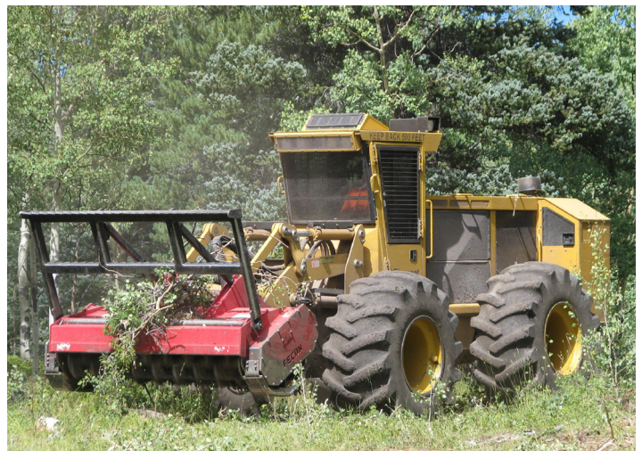
Mechanical treatment at Golden Gate Canyon State Park.