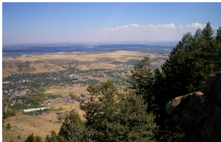
View of Golden, Colo., from Lookout Mountain.

More than 500 Christmas trees were removed from Chief Hosa Campground and Genesee Park during the first weekend in December with the assistance of seasonal and permanent Golden District staff, Denver Mountain Parks staff and several CSFS volunteers. We always welcome volunteers from Colorado State University and from local communities. Thanks to everyone for helping us make the project a success once again.