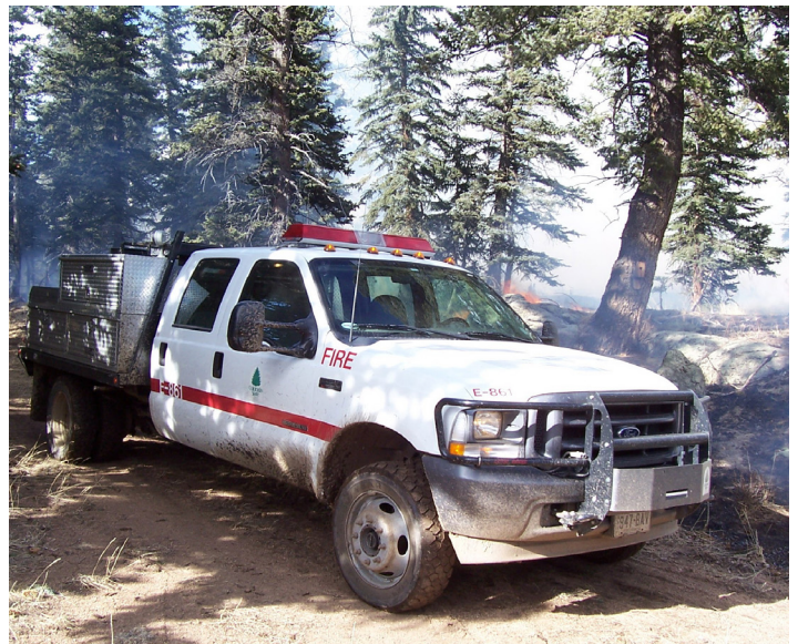
Engine 861 at the Fourmile Canyon Fire.

Fire in late June as personnel time recorder-trainee with Pueblo zone IMT3. Golden personnel also assisted Jefferson County with fire suppression on the Blackhawk and Blue Mountain incidents in May.