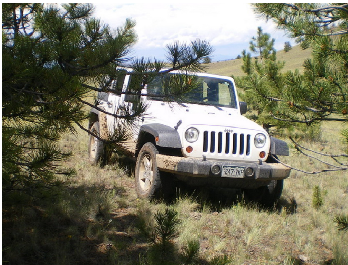
The FIA jeep on an inventory plot in southern Colorado.