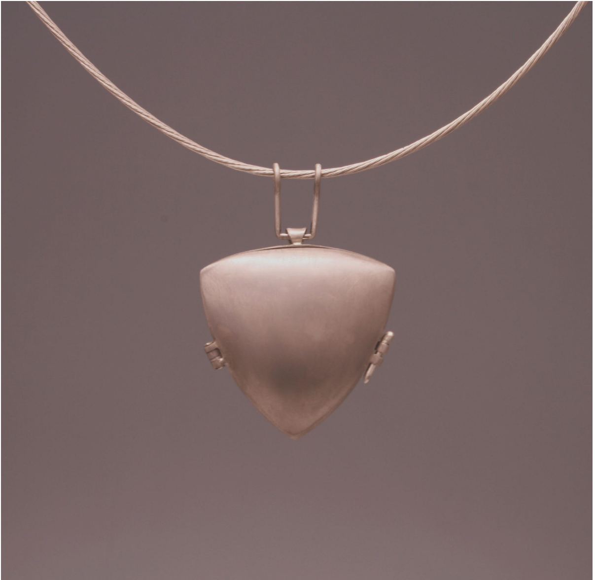
Figure 5: Wrinkle Amulet