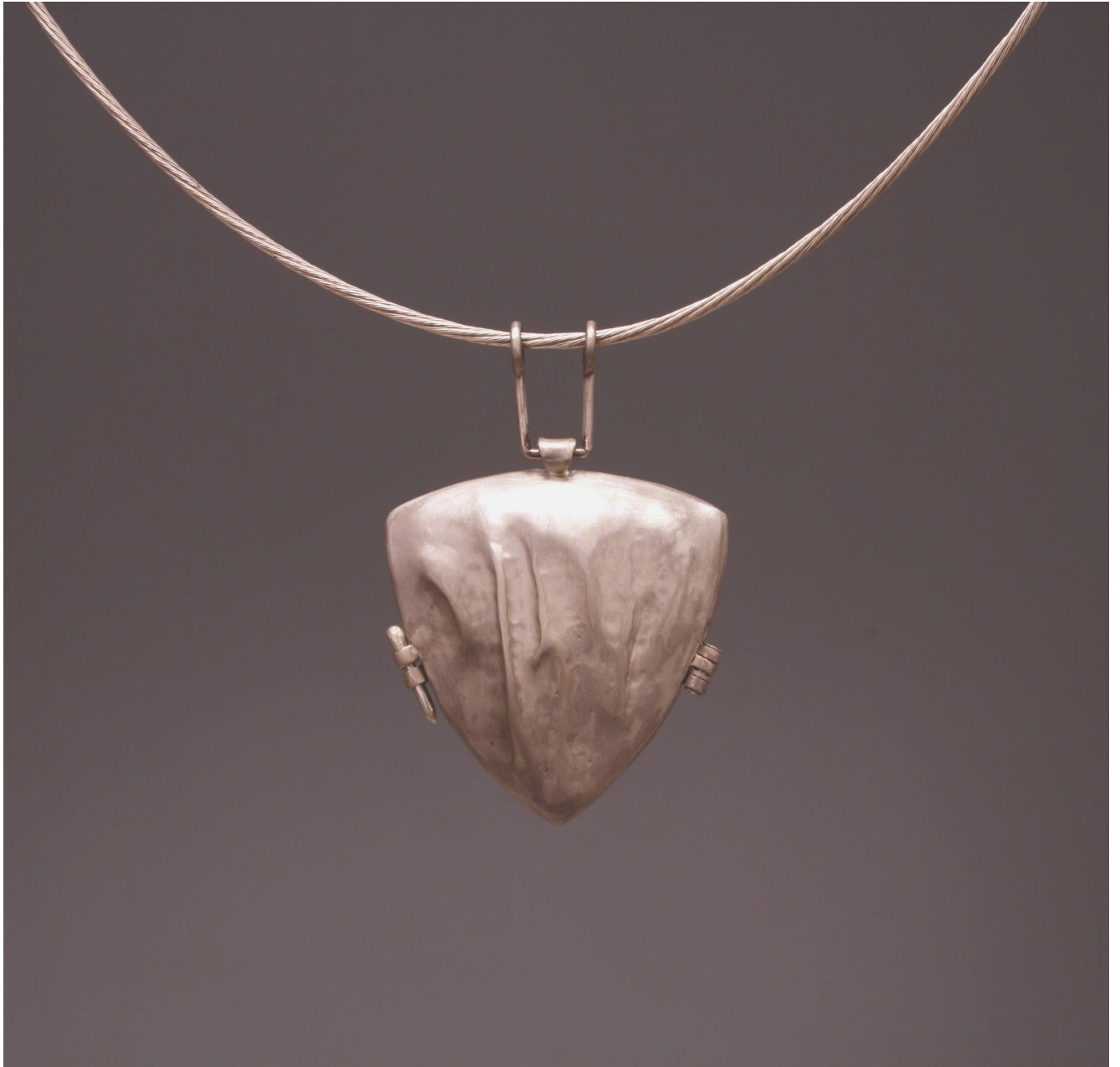
Figure 3: Wrinkled Amulet