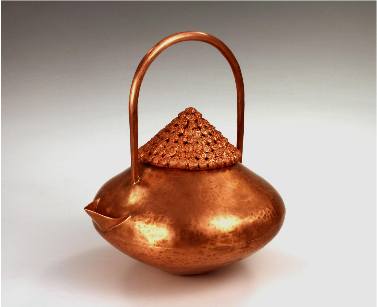
Figure 1: Willendorf