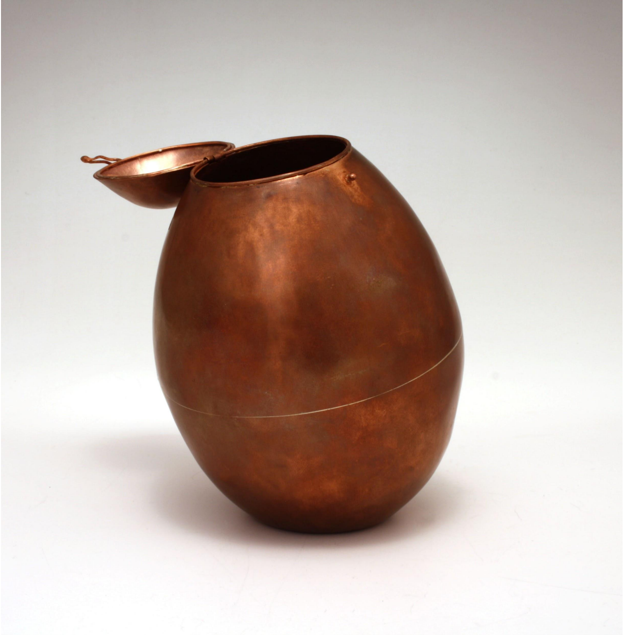
Figure 9: In-Fertility