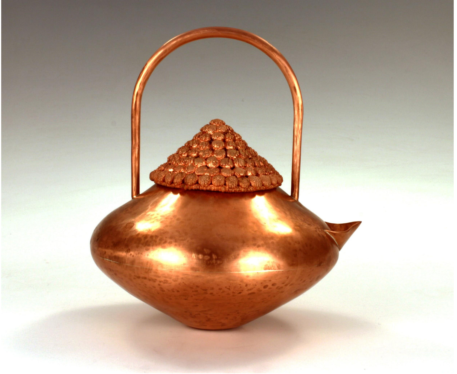
Figure 2: Willendorf