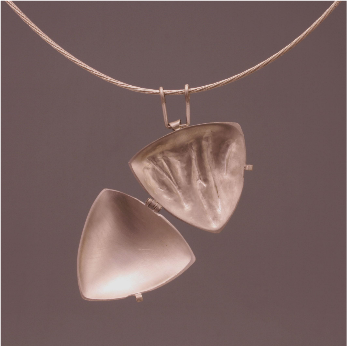
Figure 4: Wrinkled Amulet