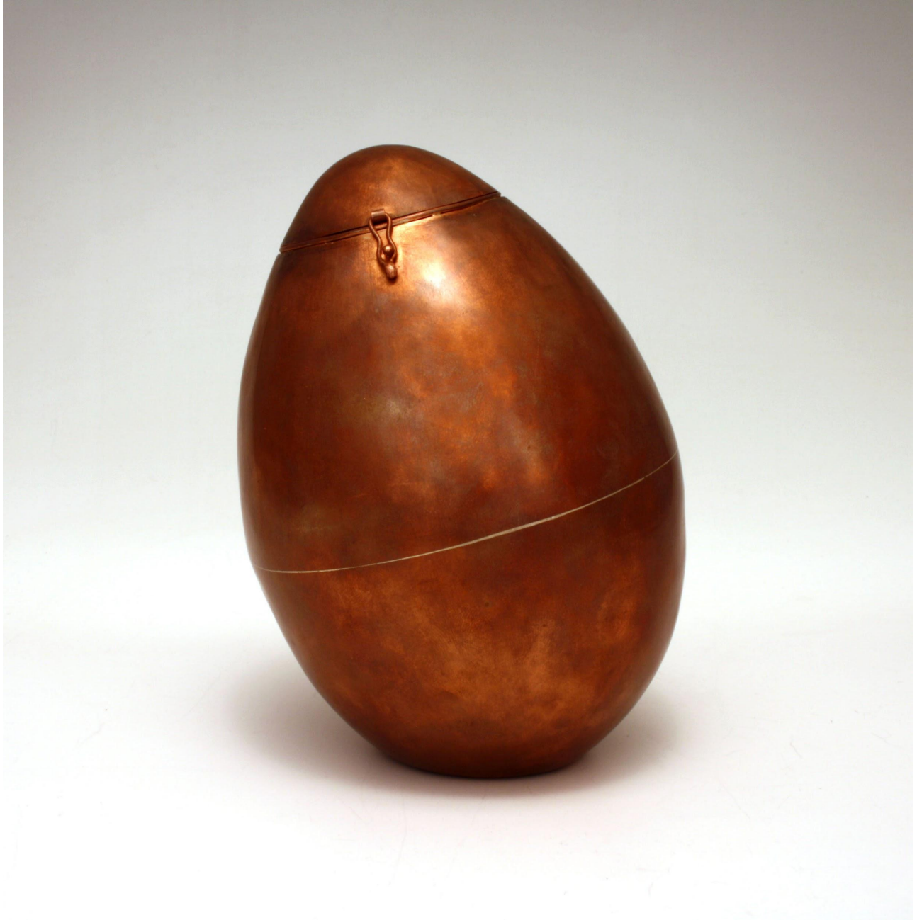
Figure 8: In-Fertility