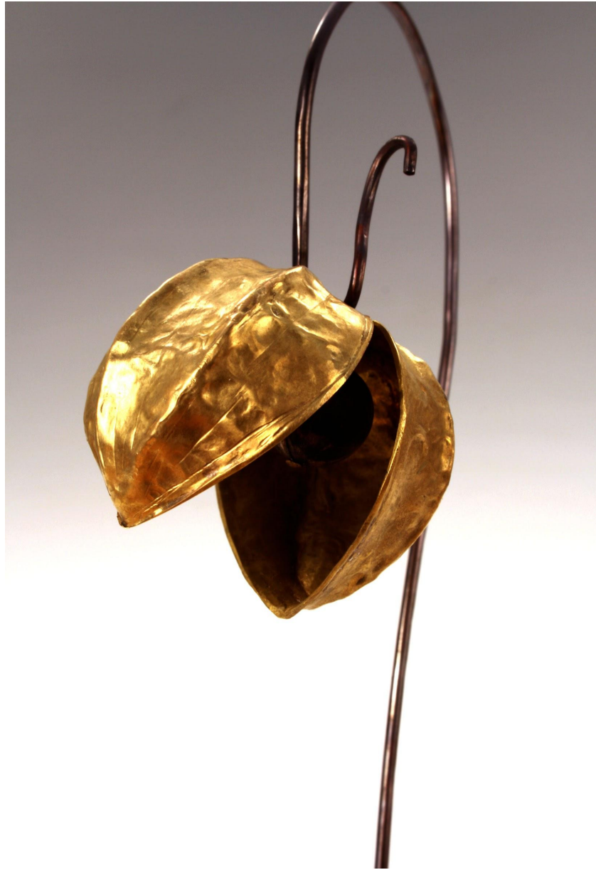
Figure 9: Seed Within