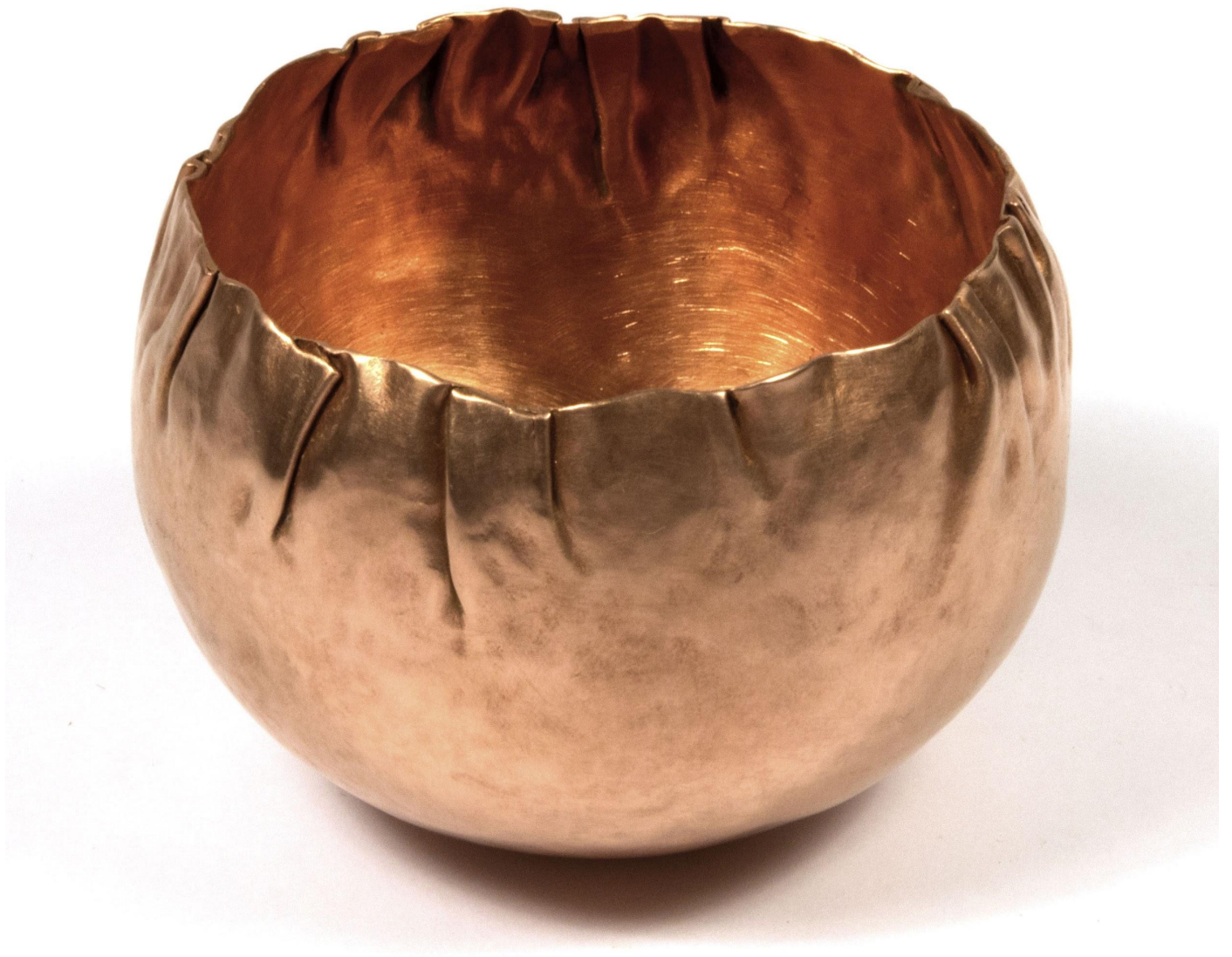
Figure 7: Belly