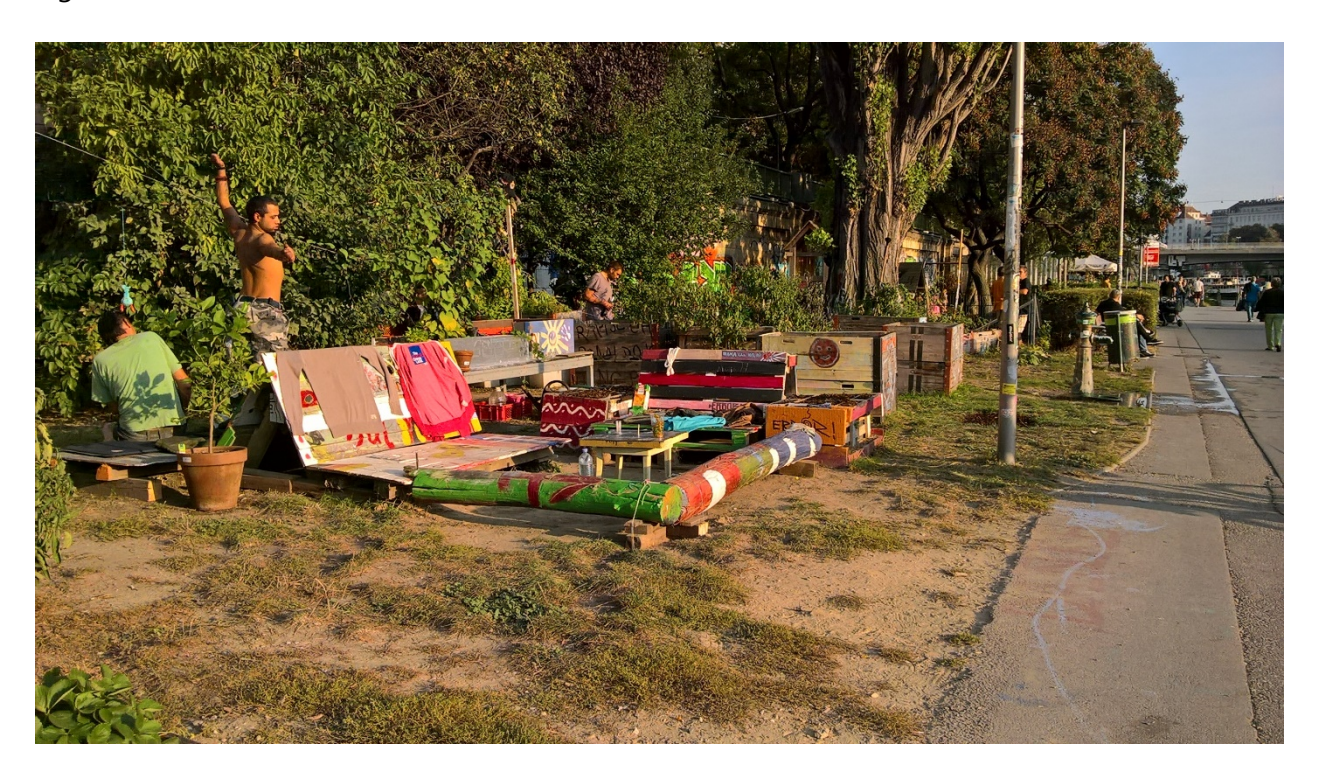
Fig. 2: Urban Gardens on the Donaukanal (Second District), Vienna

Finally, the high percentage of social housing and the rent control measures seem to be able to contain or, at least, decelerate processes of gentrification in Vienna (Franz, 2015). However, areas such as the Second District in Vienna seem to be affected by huge transformations although only partially fostered by strategies of green urban renewal. As a matter of fact, in large part of the city the rent affordability has been decreasing (Kadil, 2015). However this is particularly true for this District, characterized by processes of gentrification in the area of the Market (Karmelitermark-today devoted to organic-locally grown food products), the development of the underground system, large urban development on the waterfront and projects of urban renewal to make more pedestrian friendly such areas.