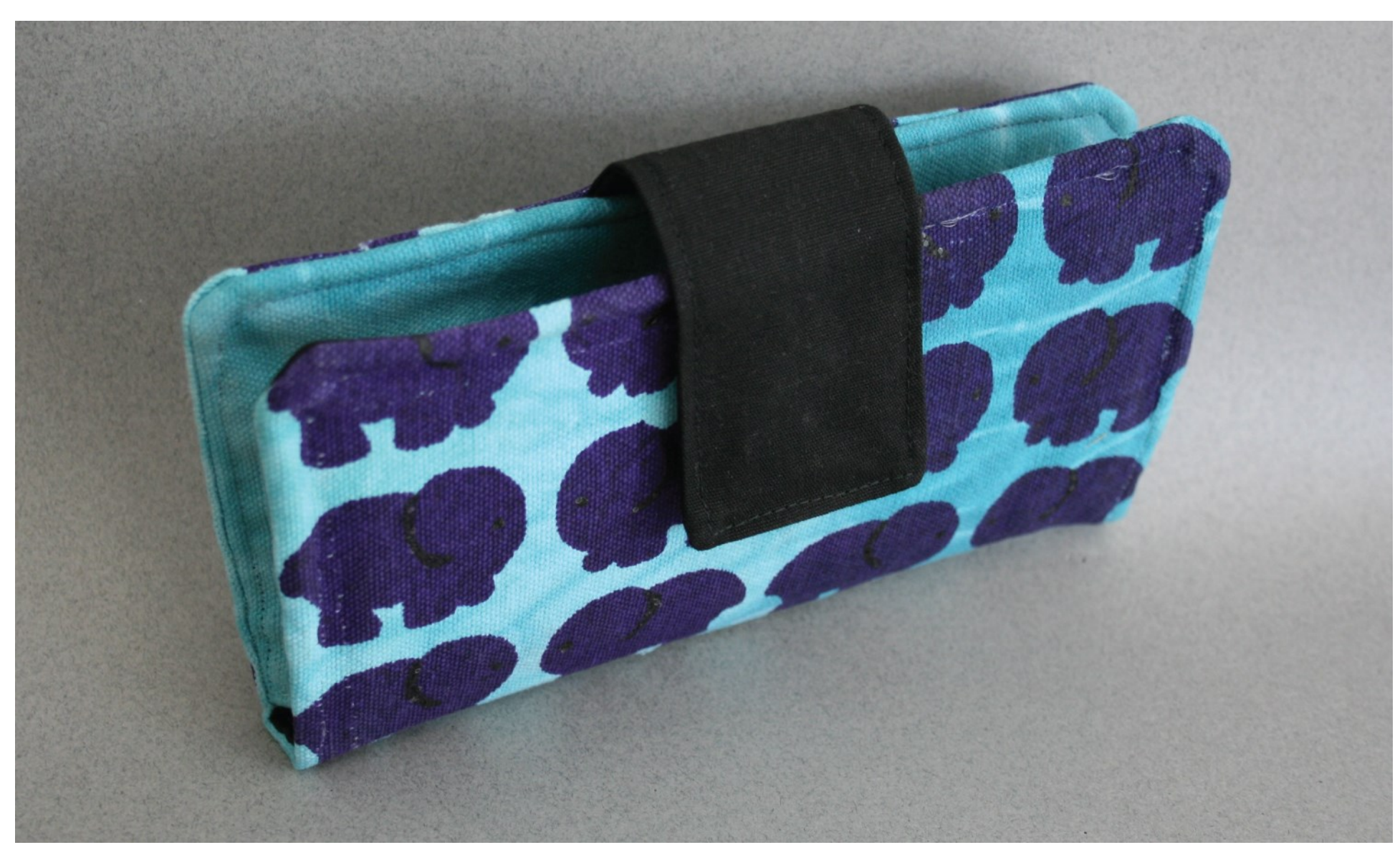
Figure 5: Elephant Wallet