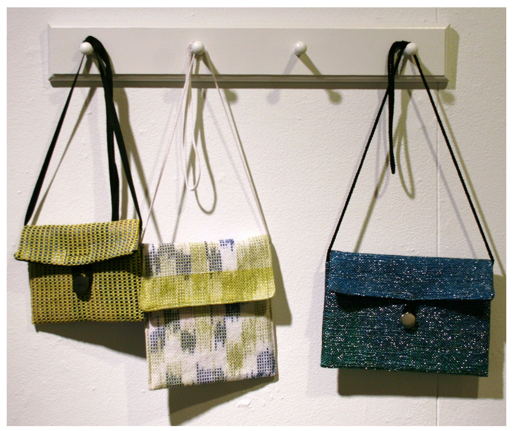
Figure 8: Woven Bags Trio