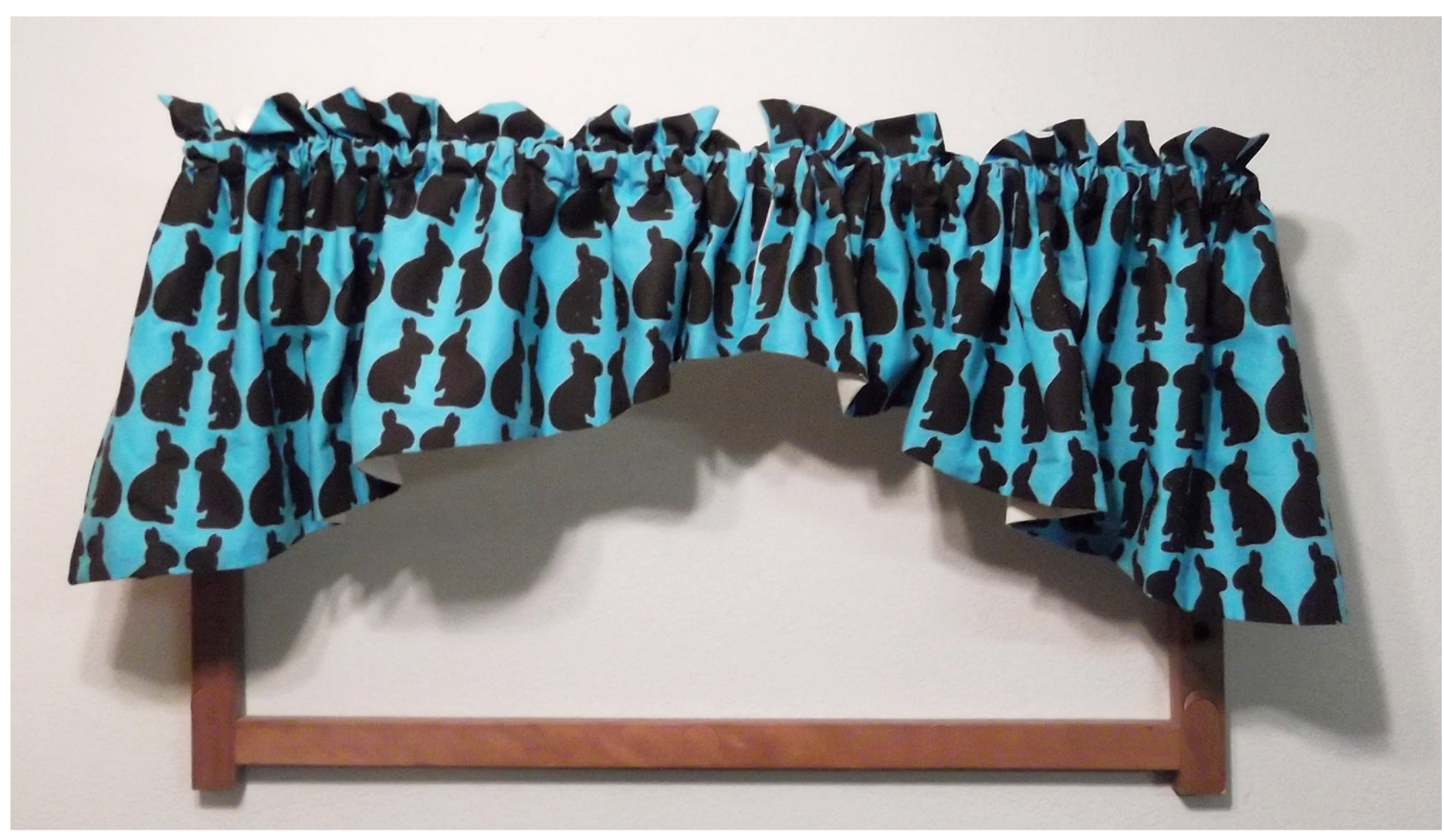
Figure 2: Bunny Curtains