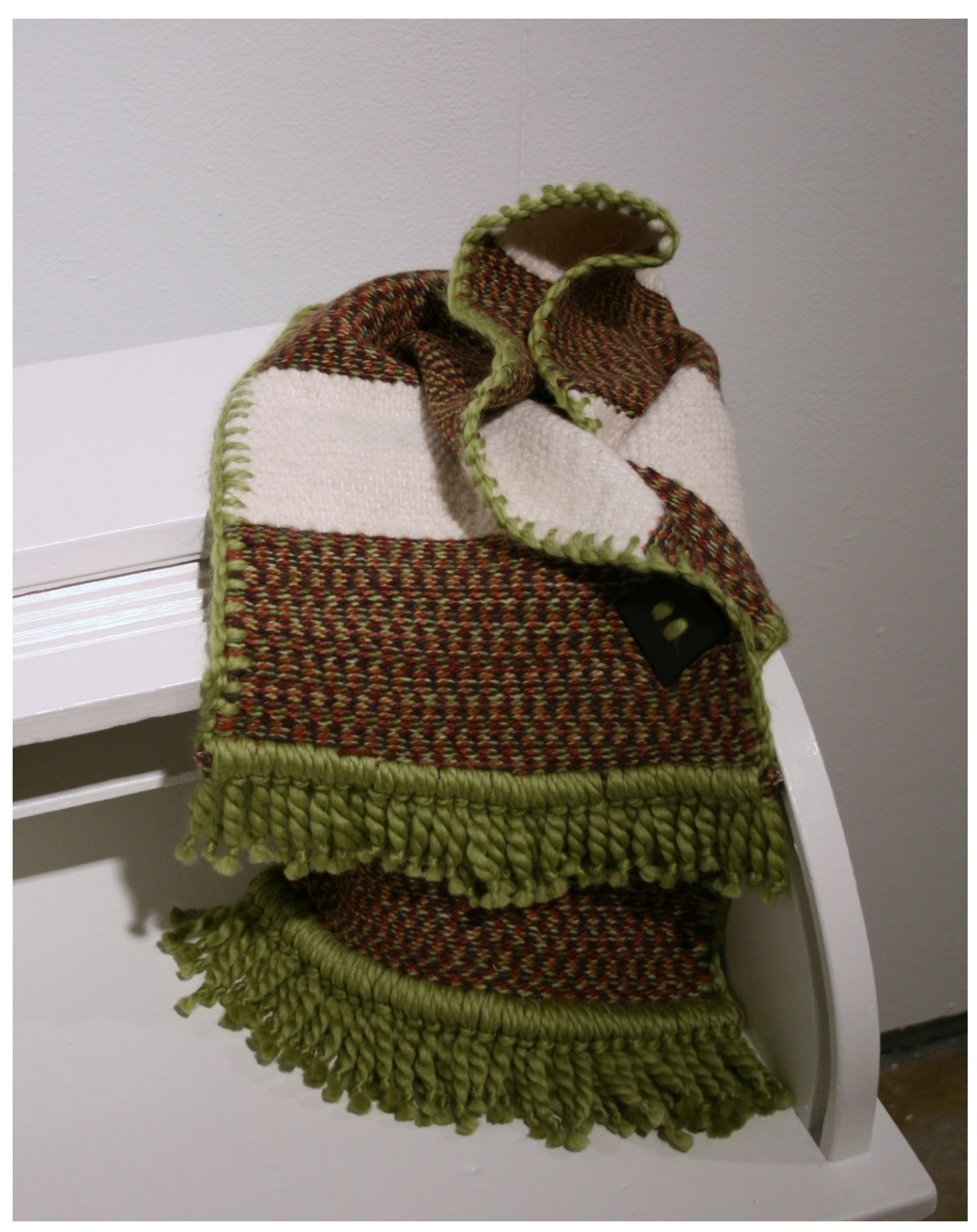
Figure 9: Button Scarf Pouf