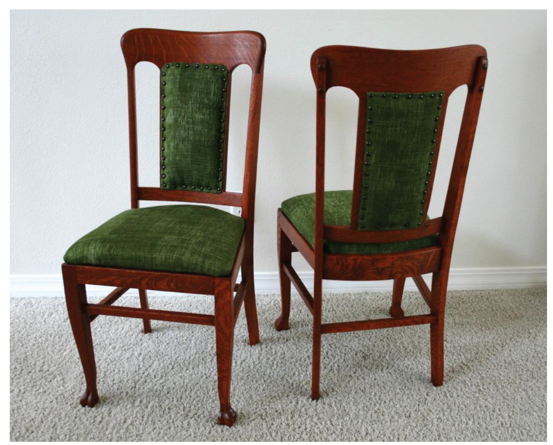
Figure 3: Chairs