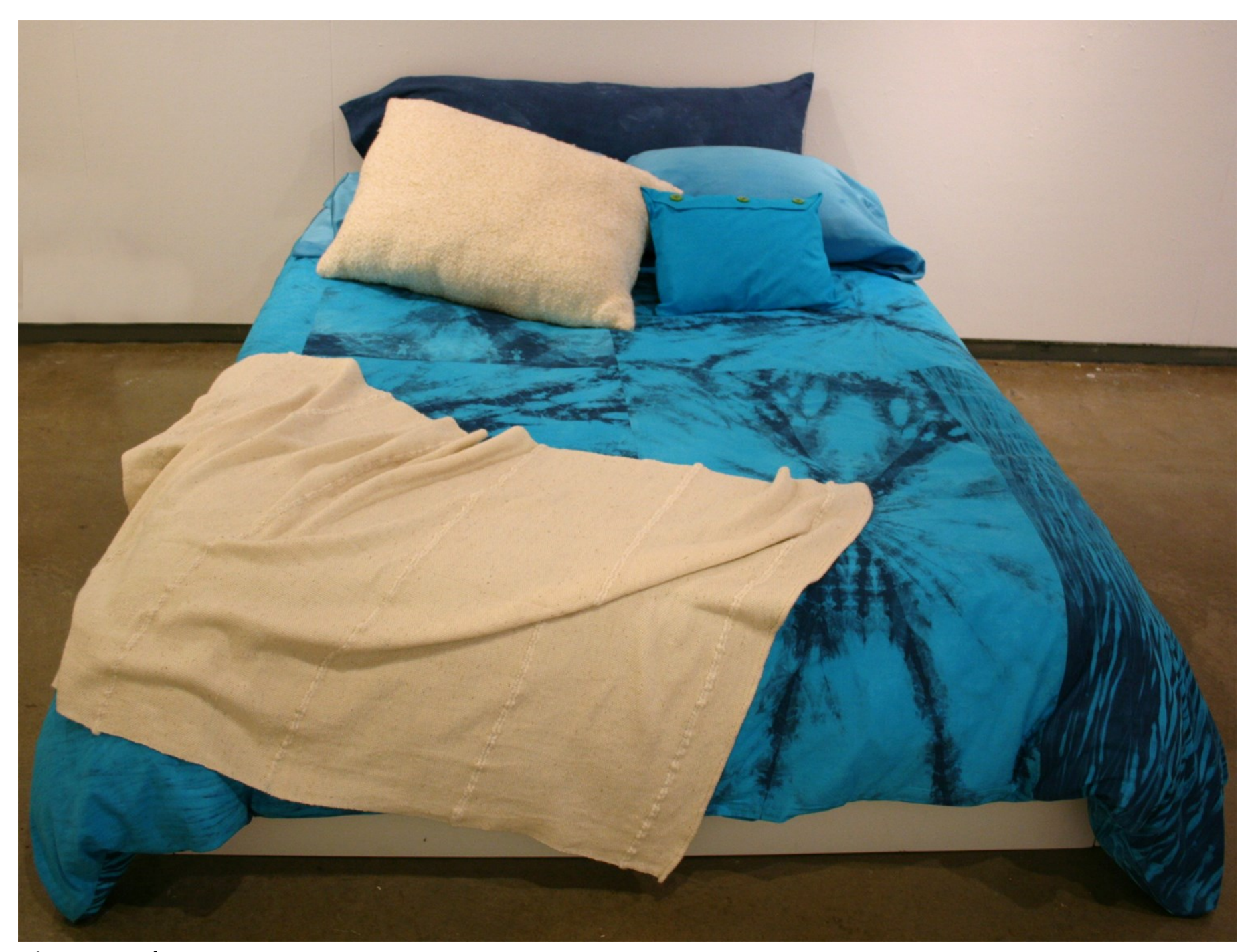
Figure 1: Bed Set