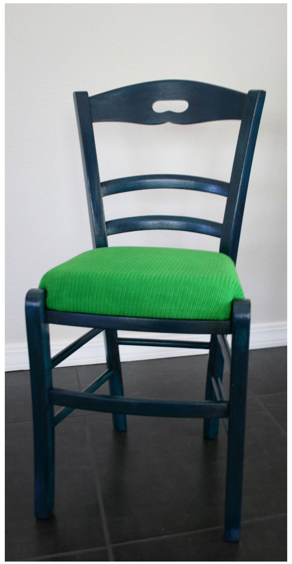
Figure 4: Chromatic Chair