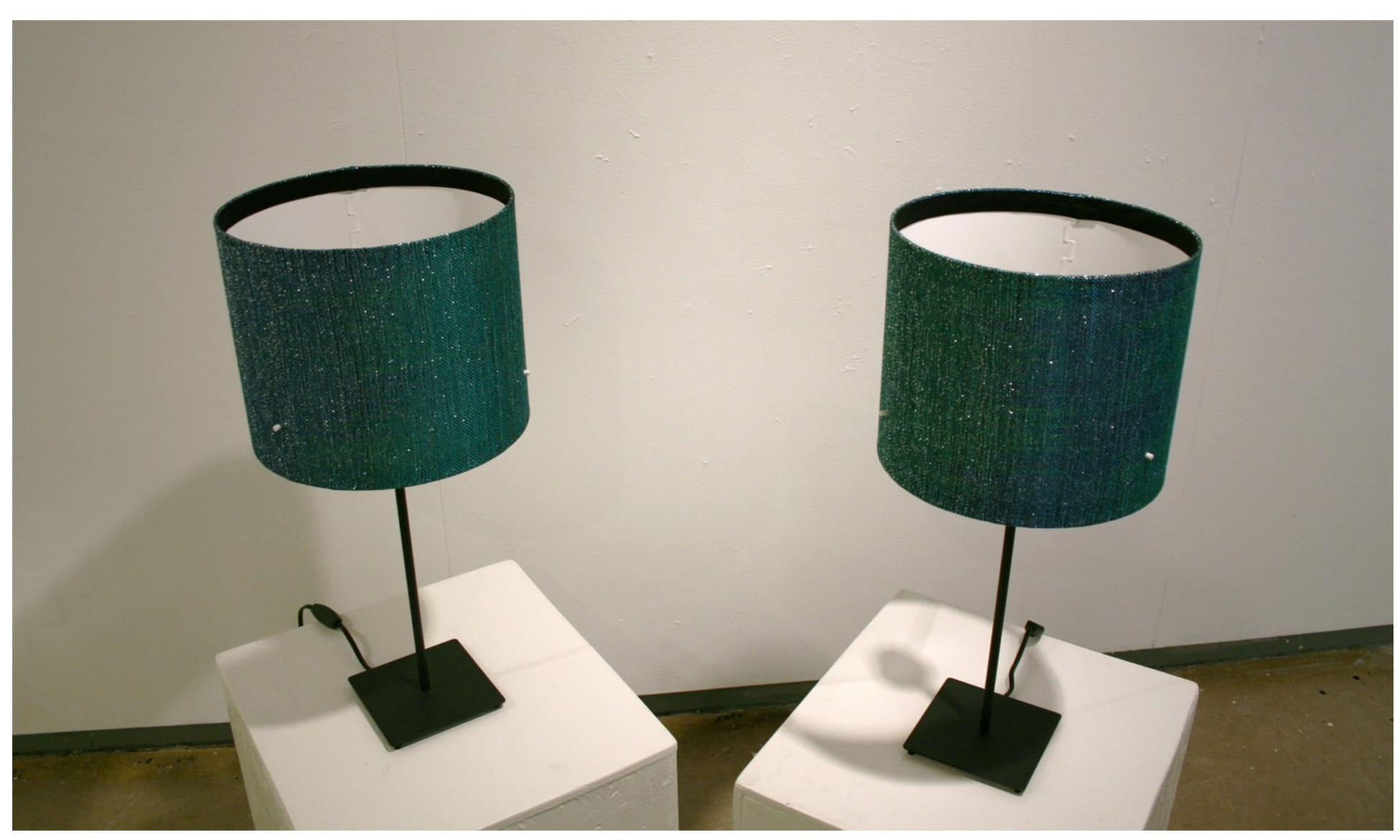
Figure 7: Shimmery Shades