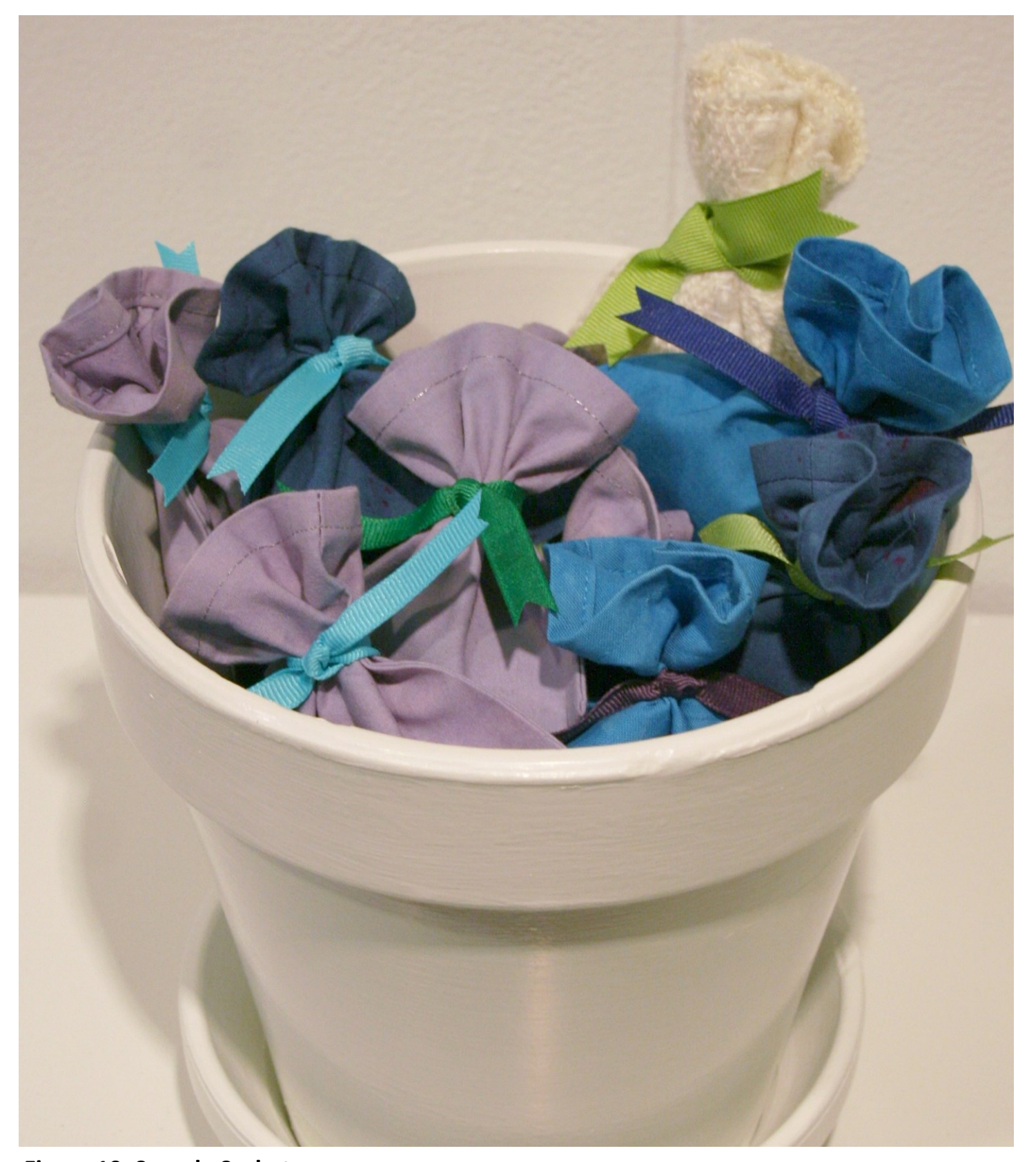
Figure 10: Sample Sachets