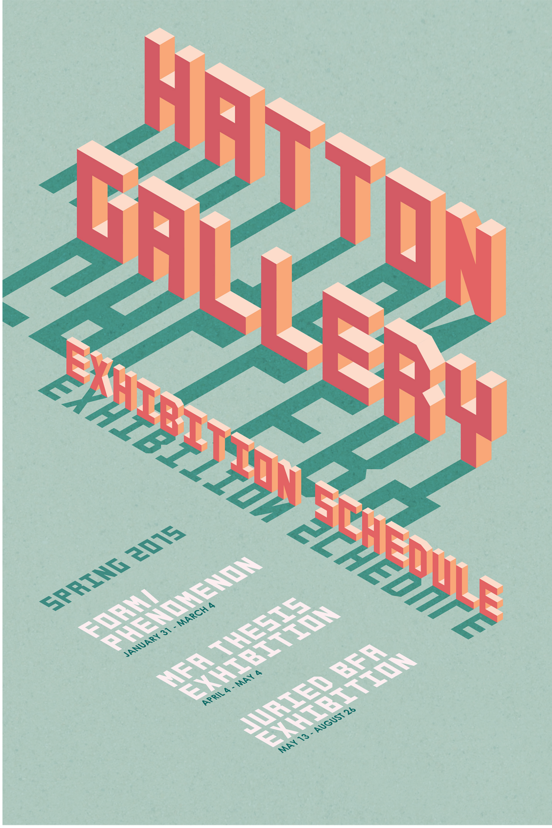
Figure 2: Hatton Gallery Spring Schedule