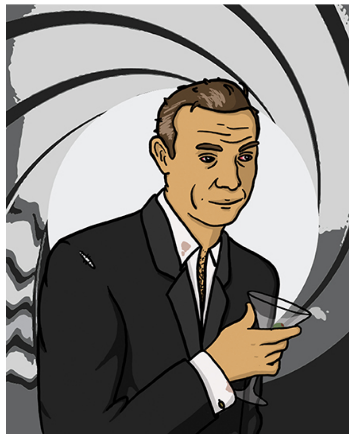
Figure 4: Shaken, Not Stirred