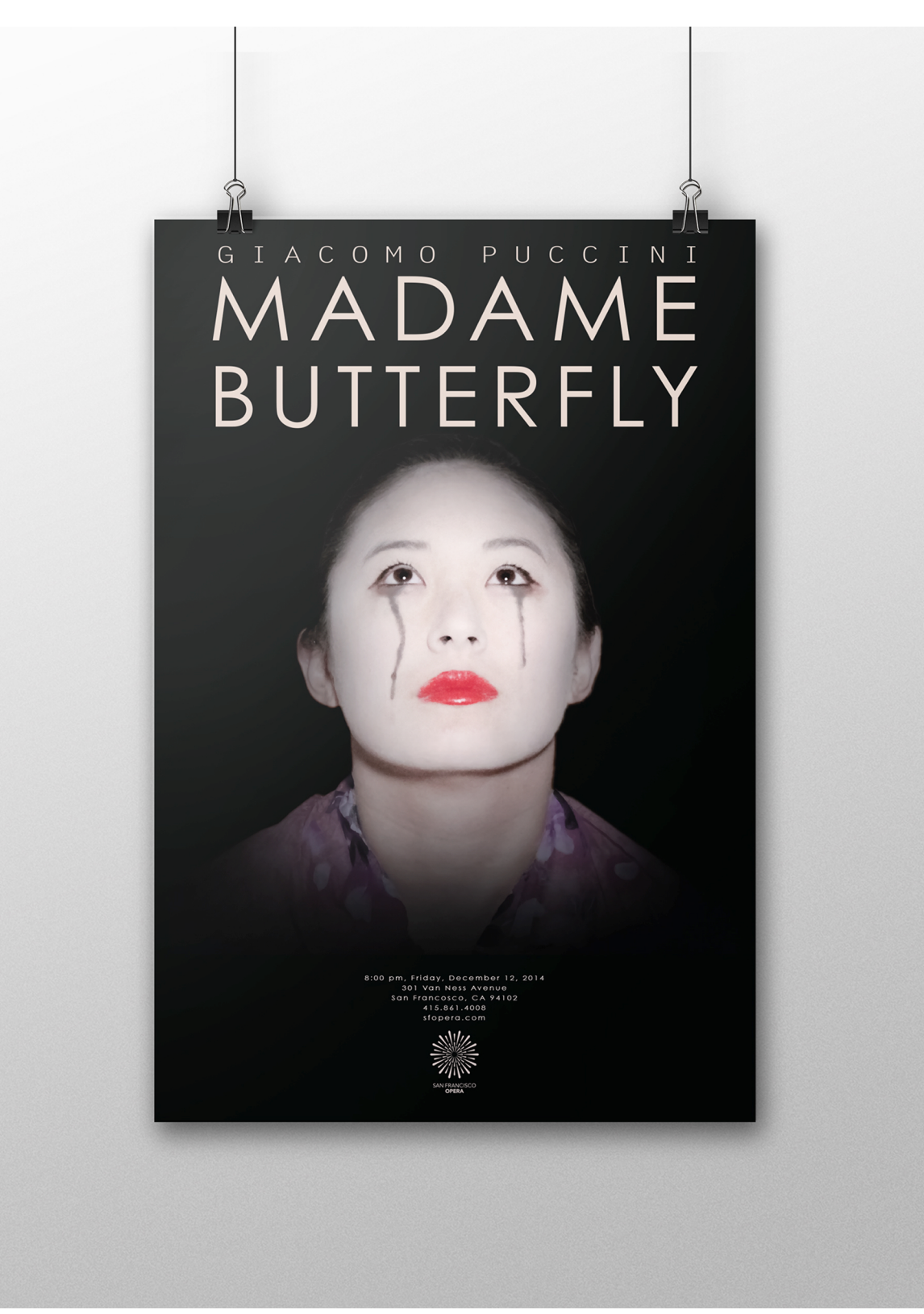
Figure 3: Madame Butterfly