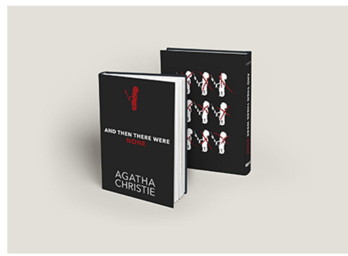
Figure 5: And Then There Were None