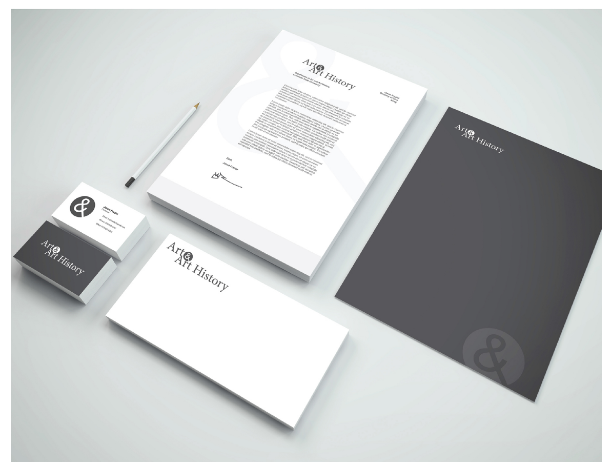
Figure 7: Art & Art History Stationery