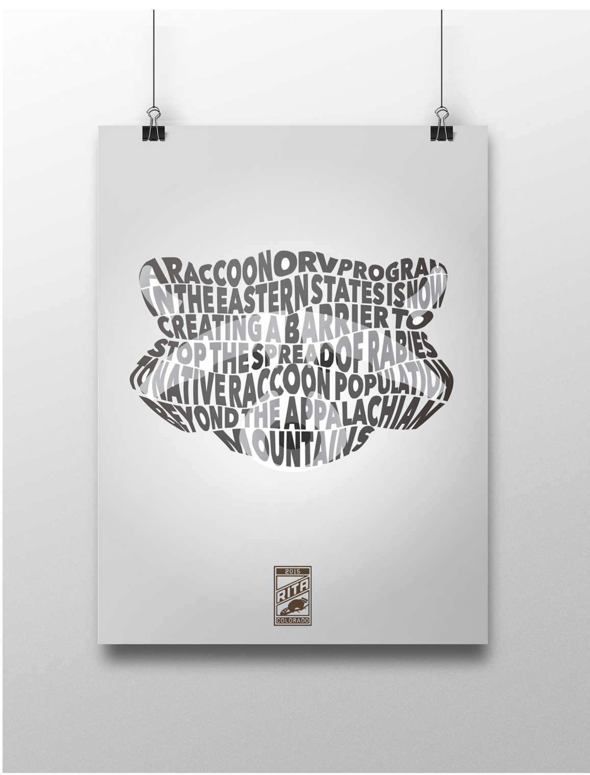
Figure 10: RITA Poster