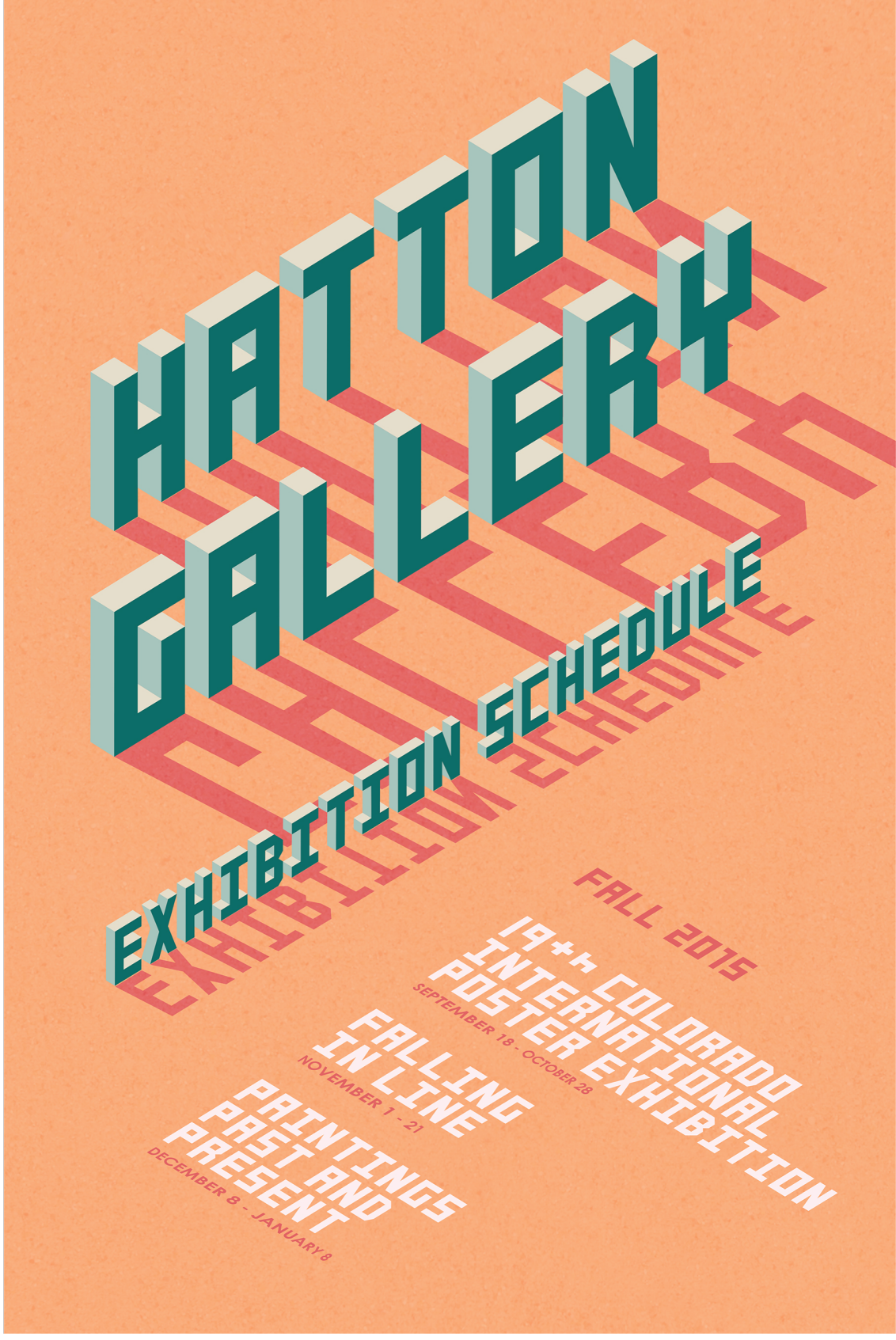
Figure 1: Hatton Gallery Fall Schedule