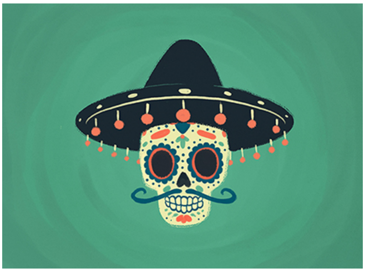
Figure 8: Sugar Skull Illustration