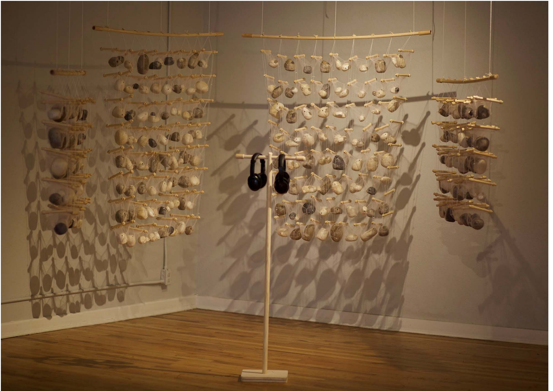
Figure 1: Stonebirds in Conversation.