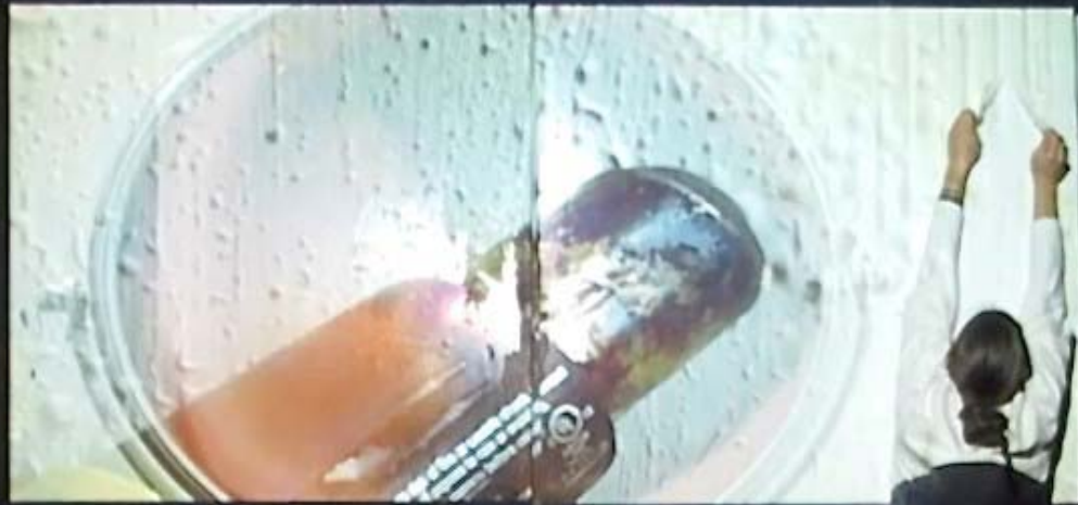
Figure 11: PAT Performance, film still 2.