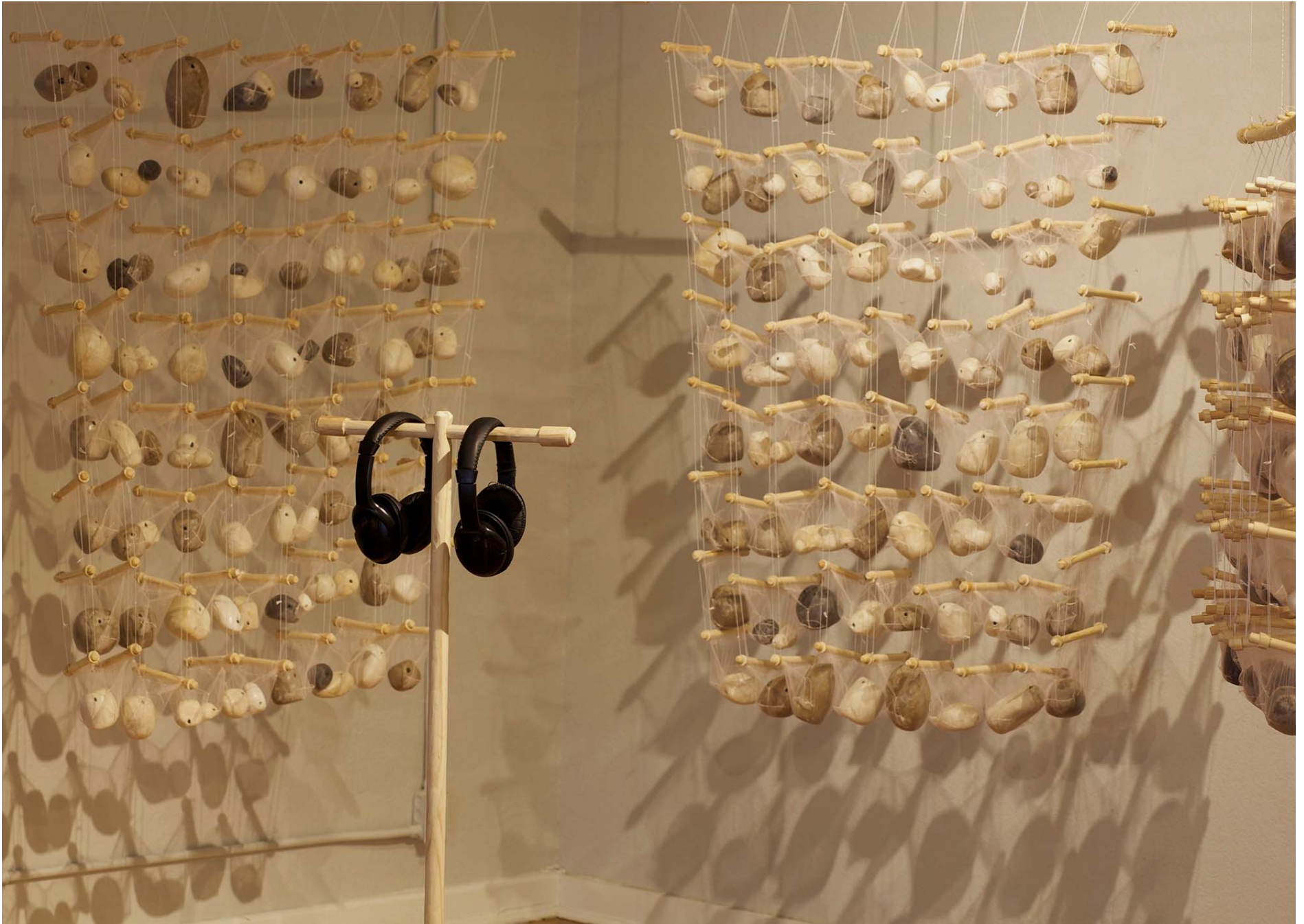
Figure 2: Stonebirds in Conversation.