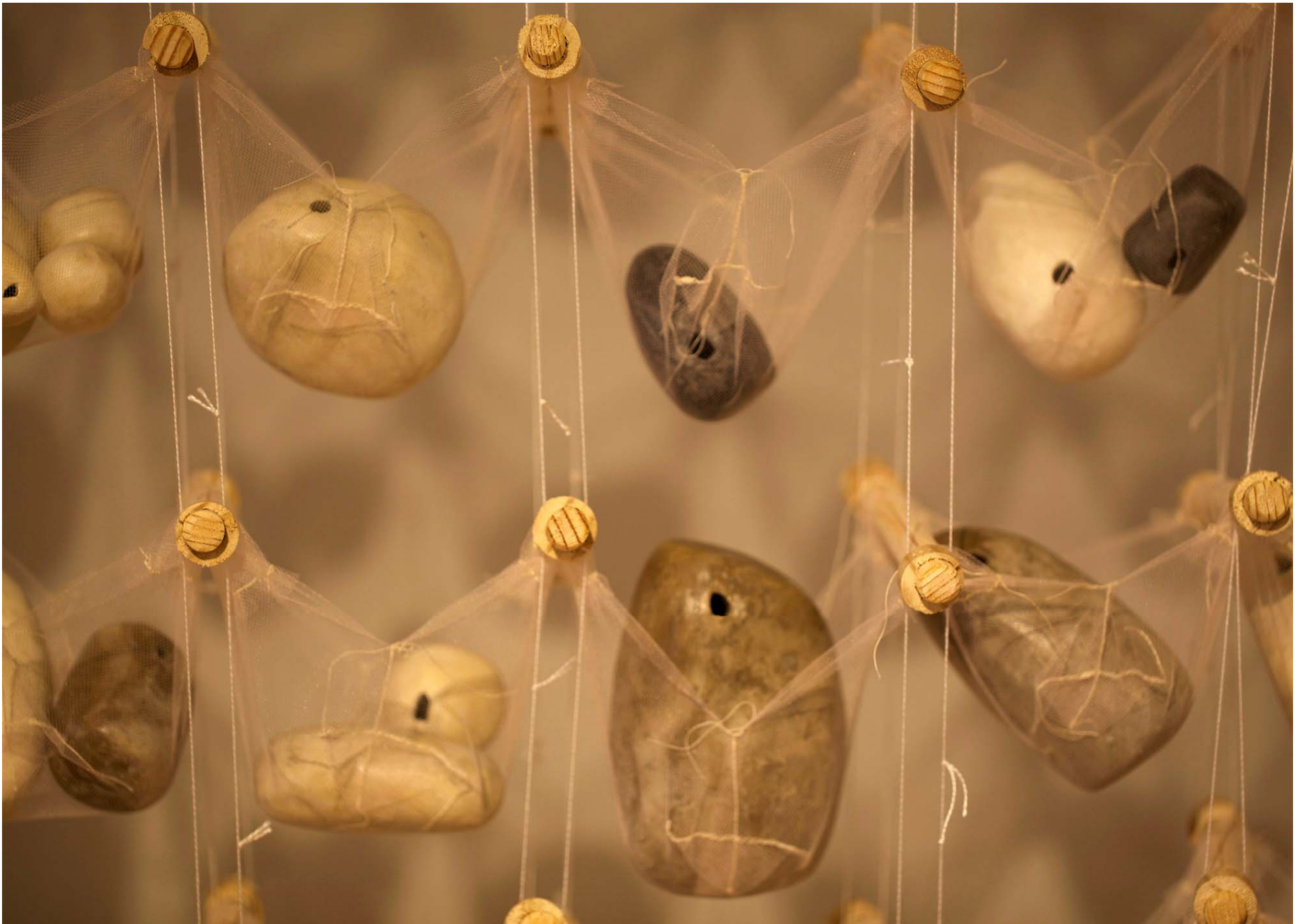
Figure 4: Stonebirds in Conversation-Detail.