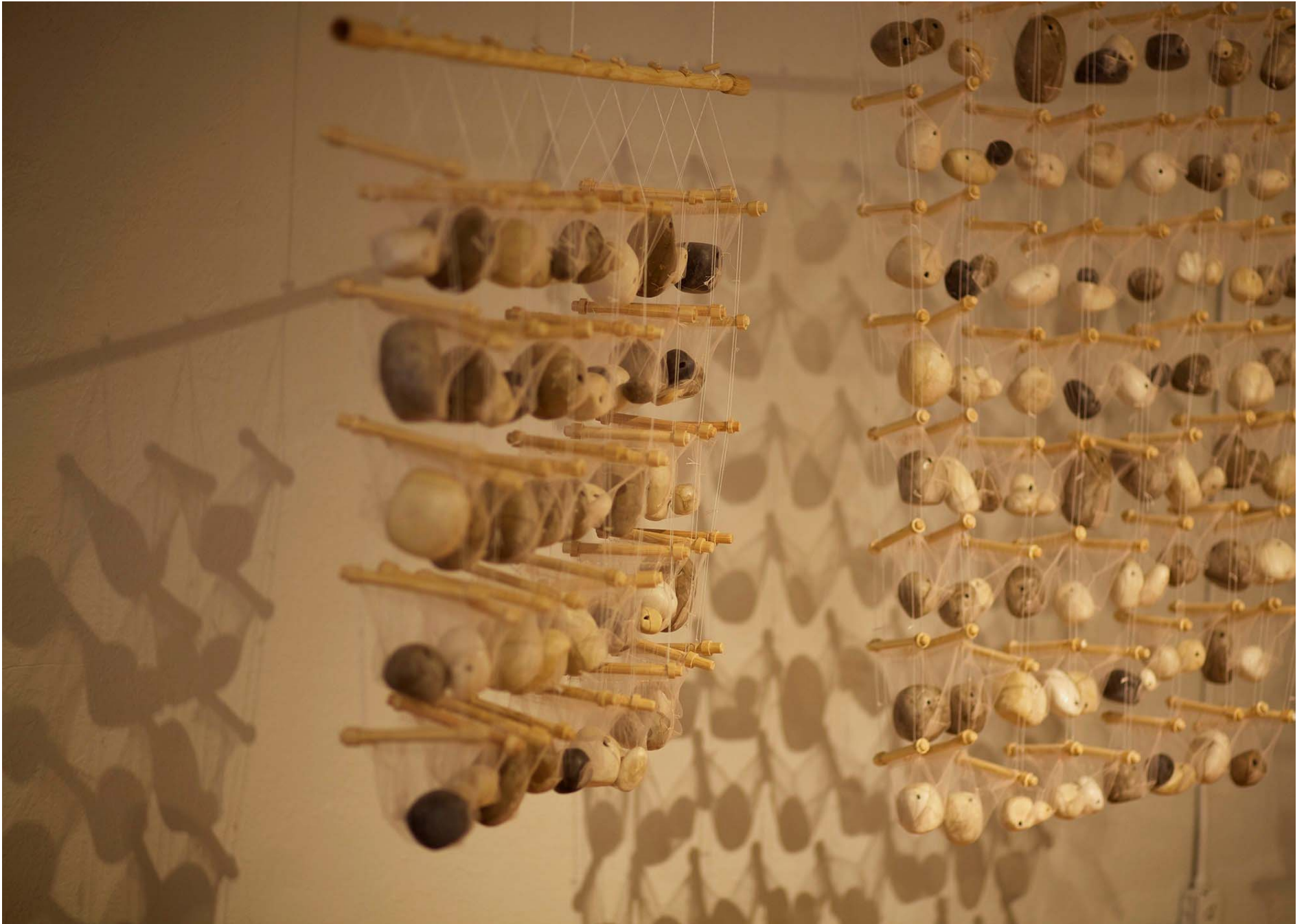
Figure 3: Stonebirds in Conversation.