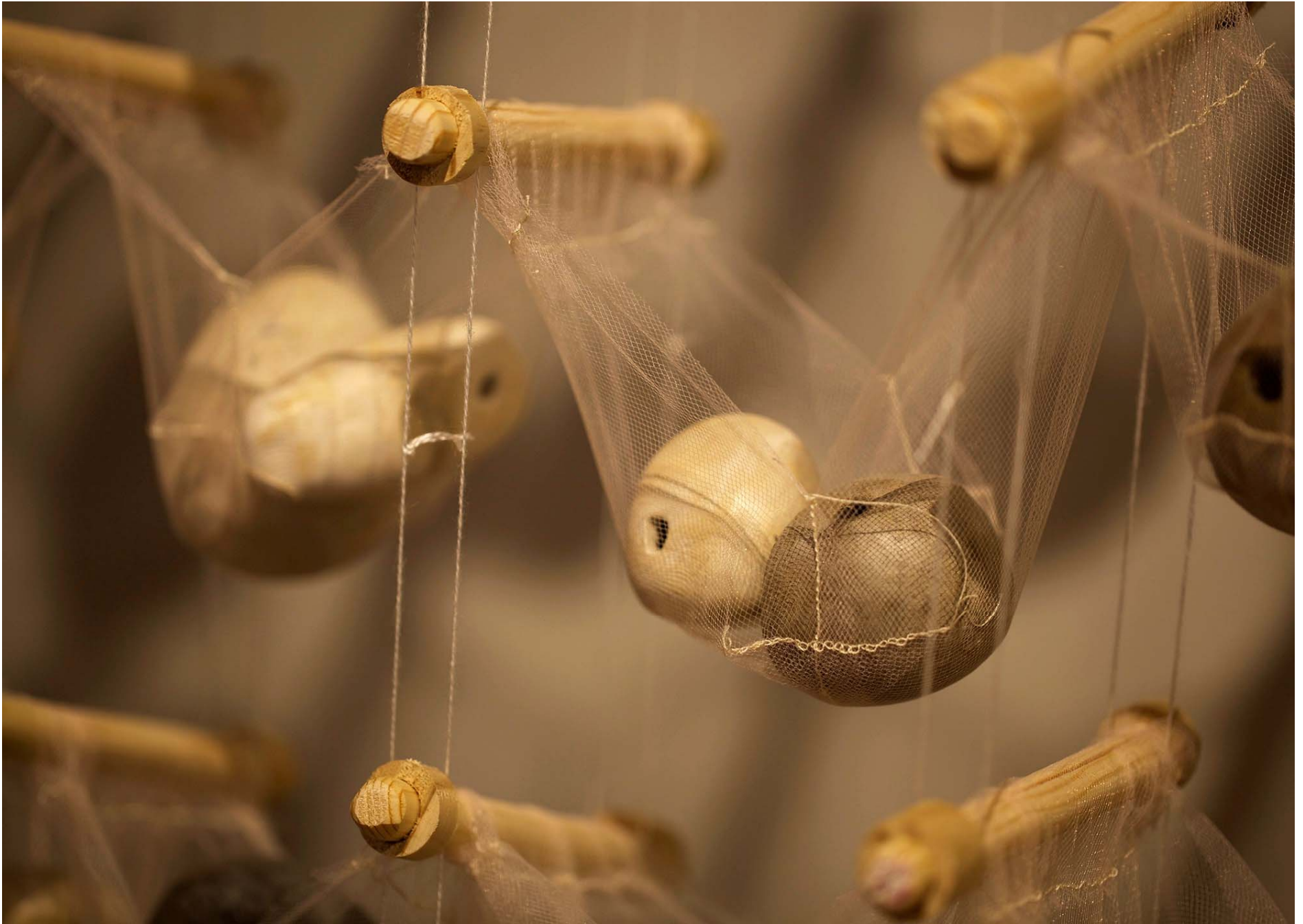
Figure 5: Stonebirds in Conversation-Detail.