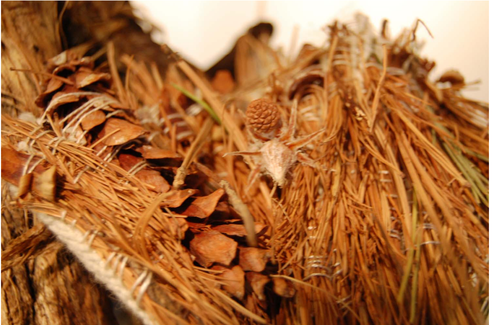
Figure 8: Fir Coat, Artifact-Detail.