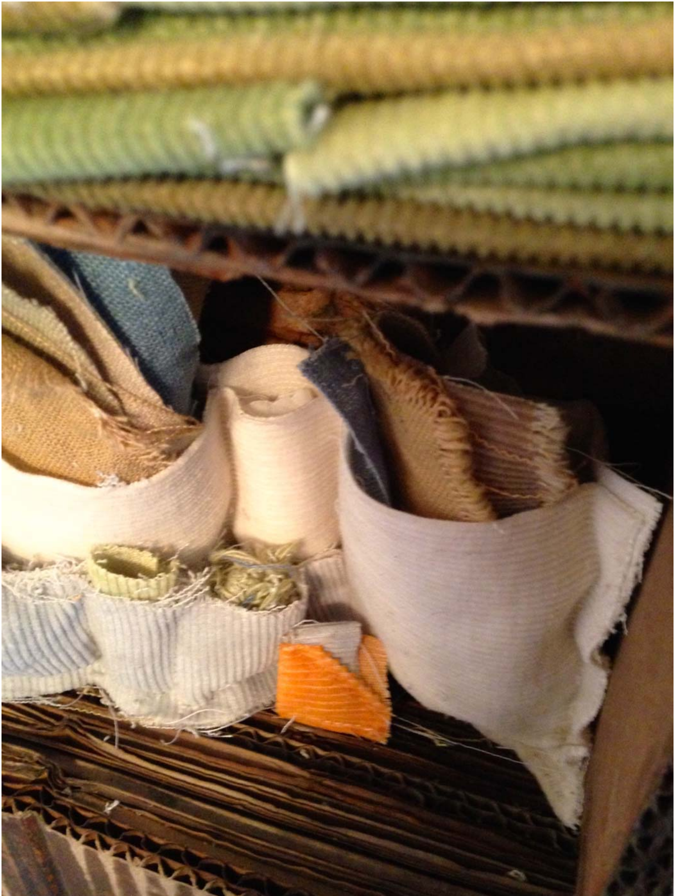
Figure 13: Irma's Shadowbox-Detail.