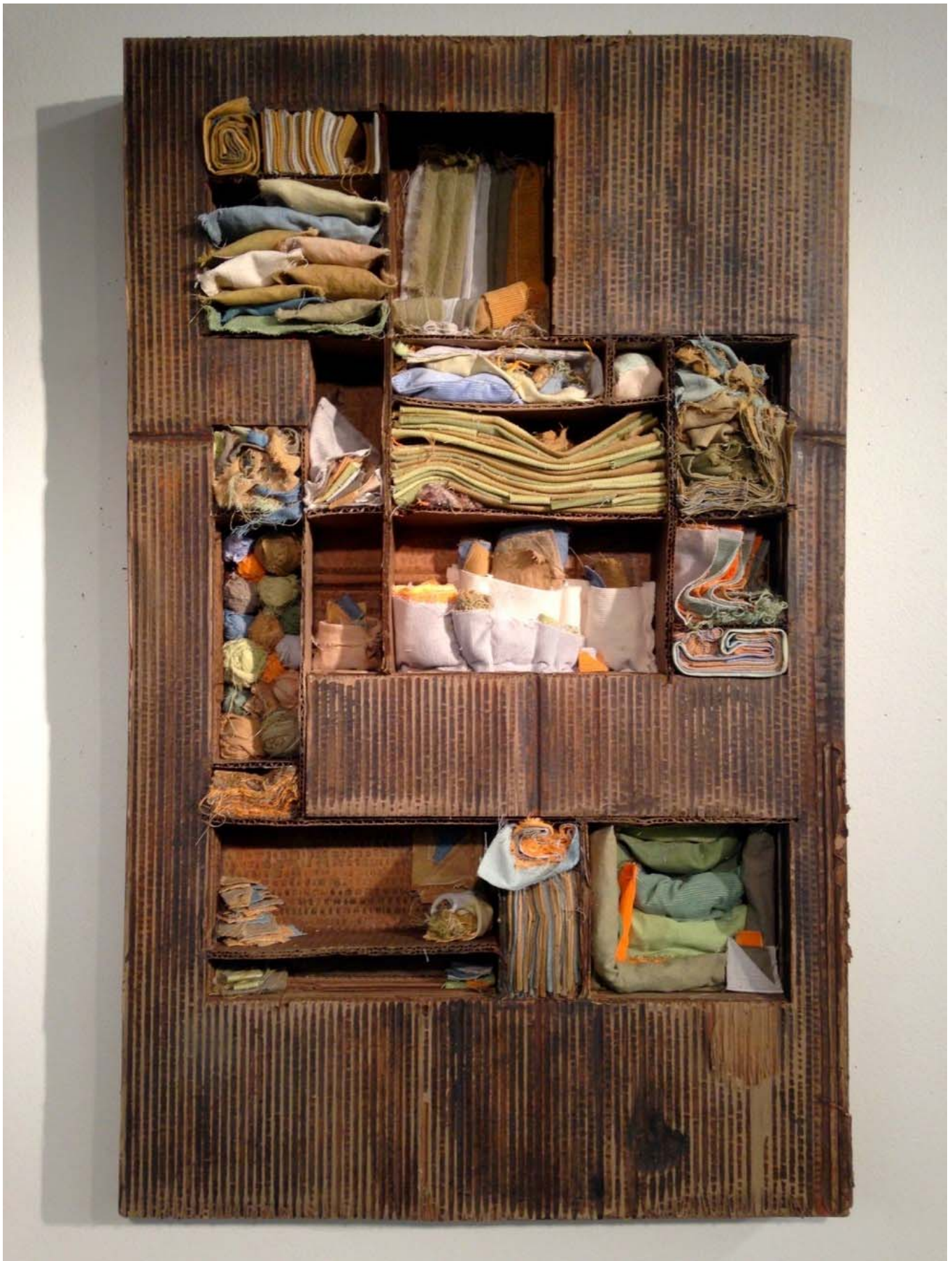
Figure 12: Irma's Shadowbox.