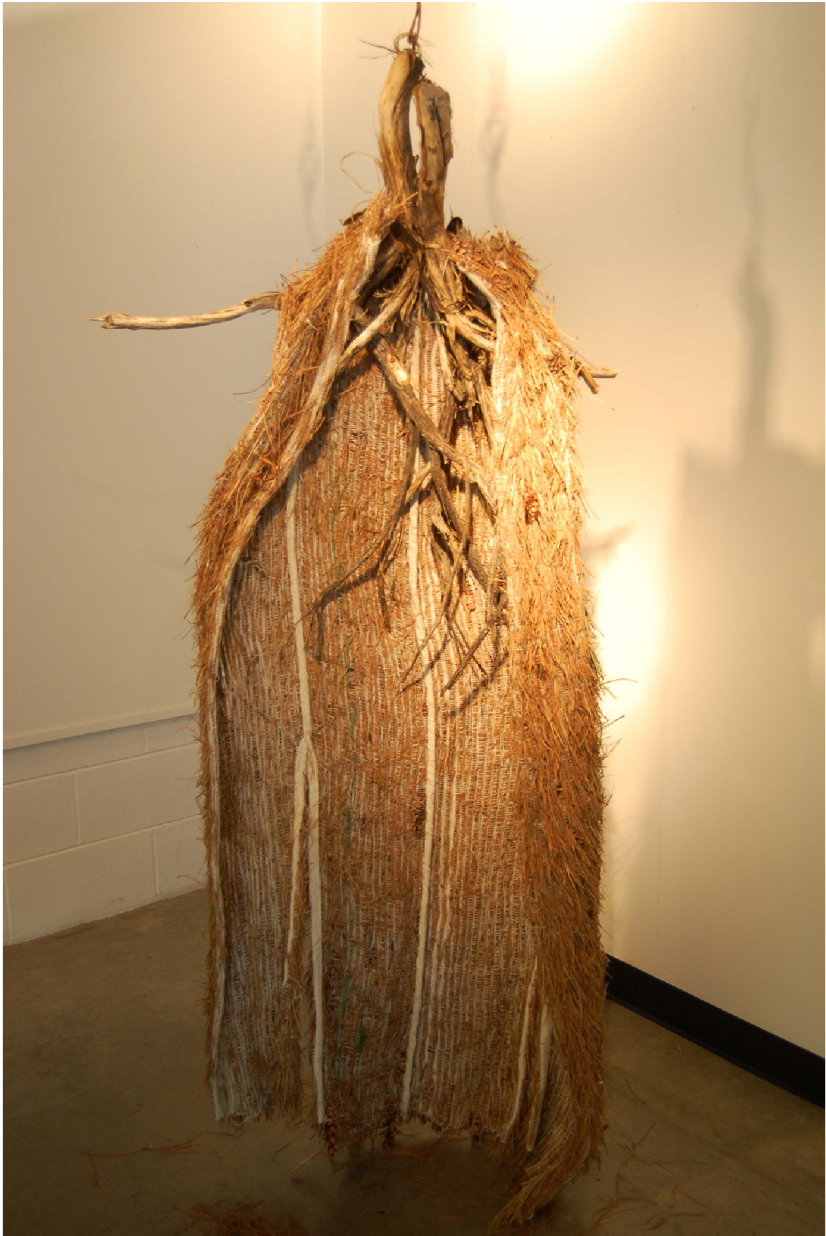
Figure 7: Fir Coat, Artifact.