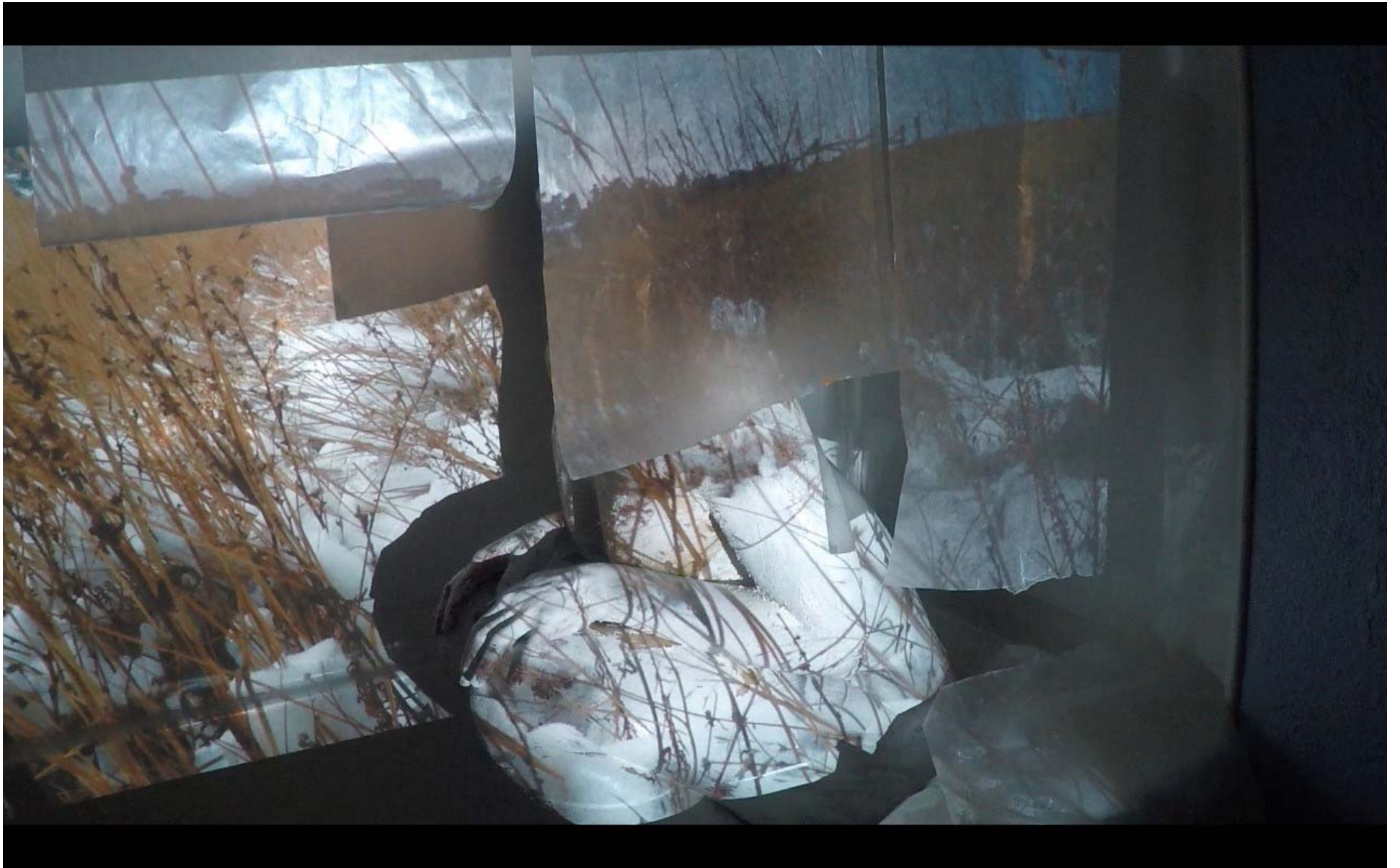
Figure 6: Skincycle, film still 1.