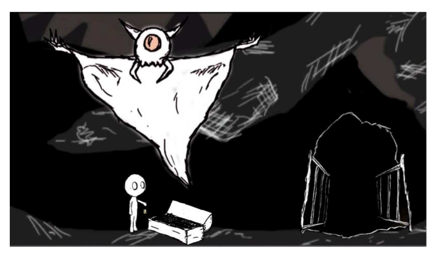
Figure 5: Divine Intervention (Detail)