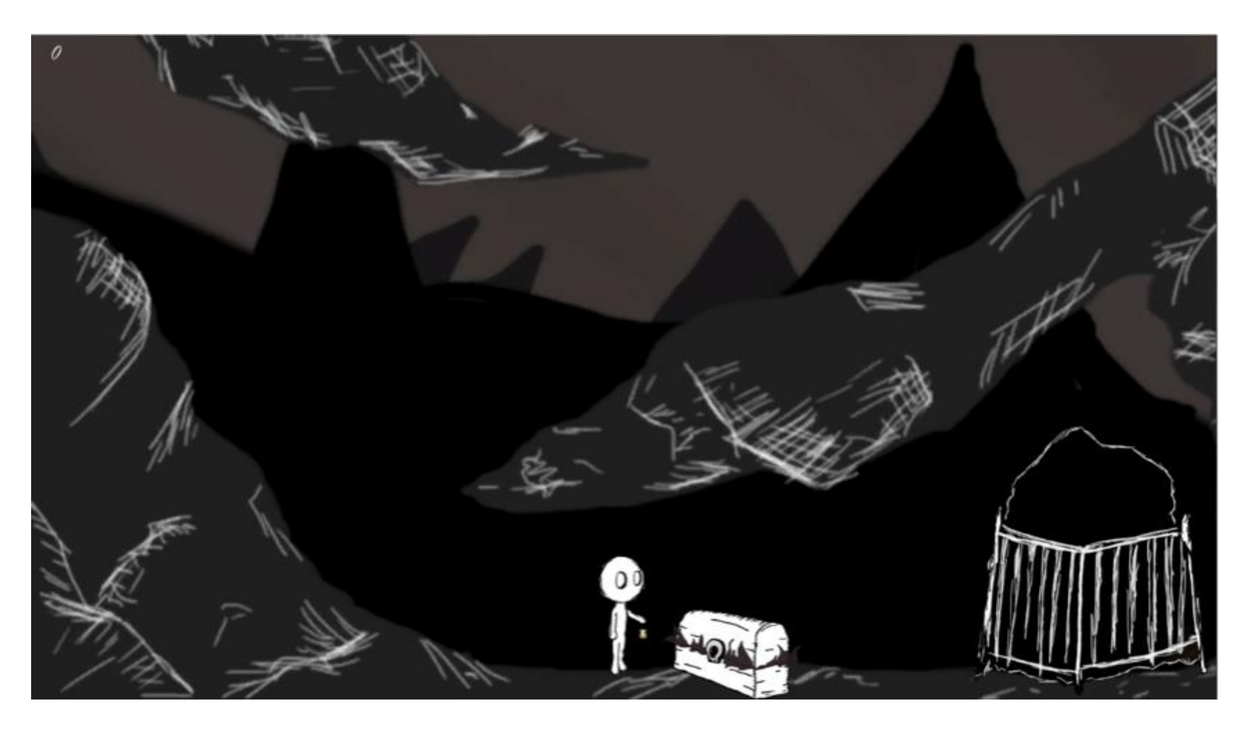
Figure 4: Divine Intervention (Detail)