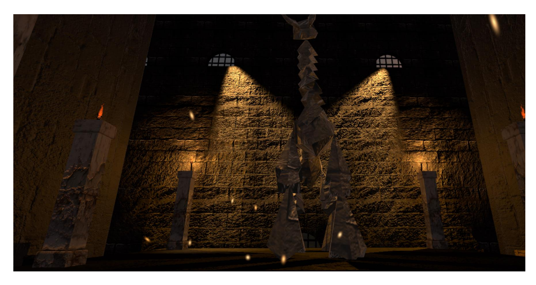
Figure 10: Remnant (Detail)