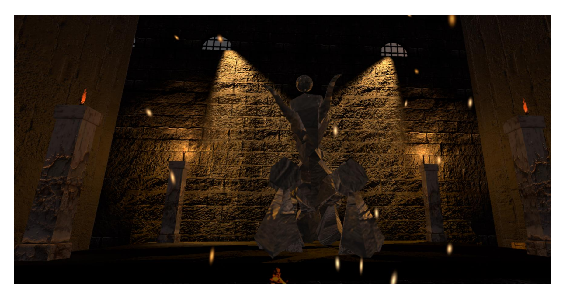
Figure 8: Remnant (Detail)