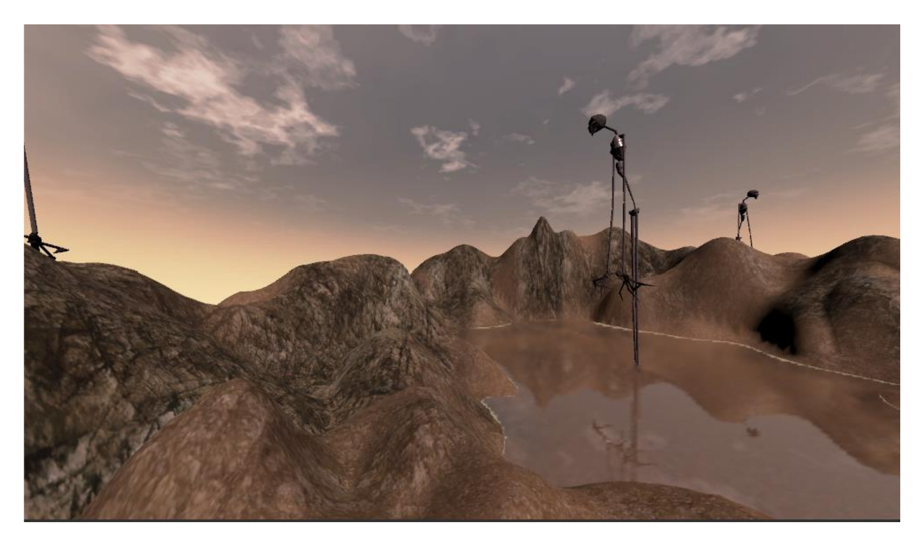
Figure 6: Migration: Oasis (Detail)