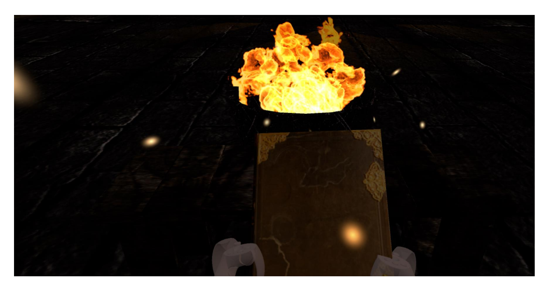
Figure 9: Remnant (Detail)