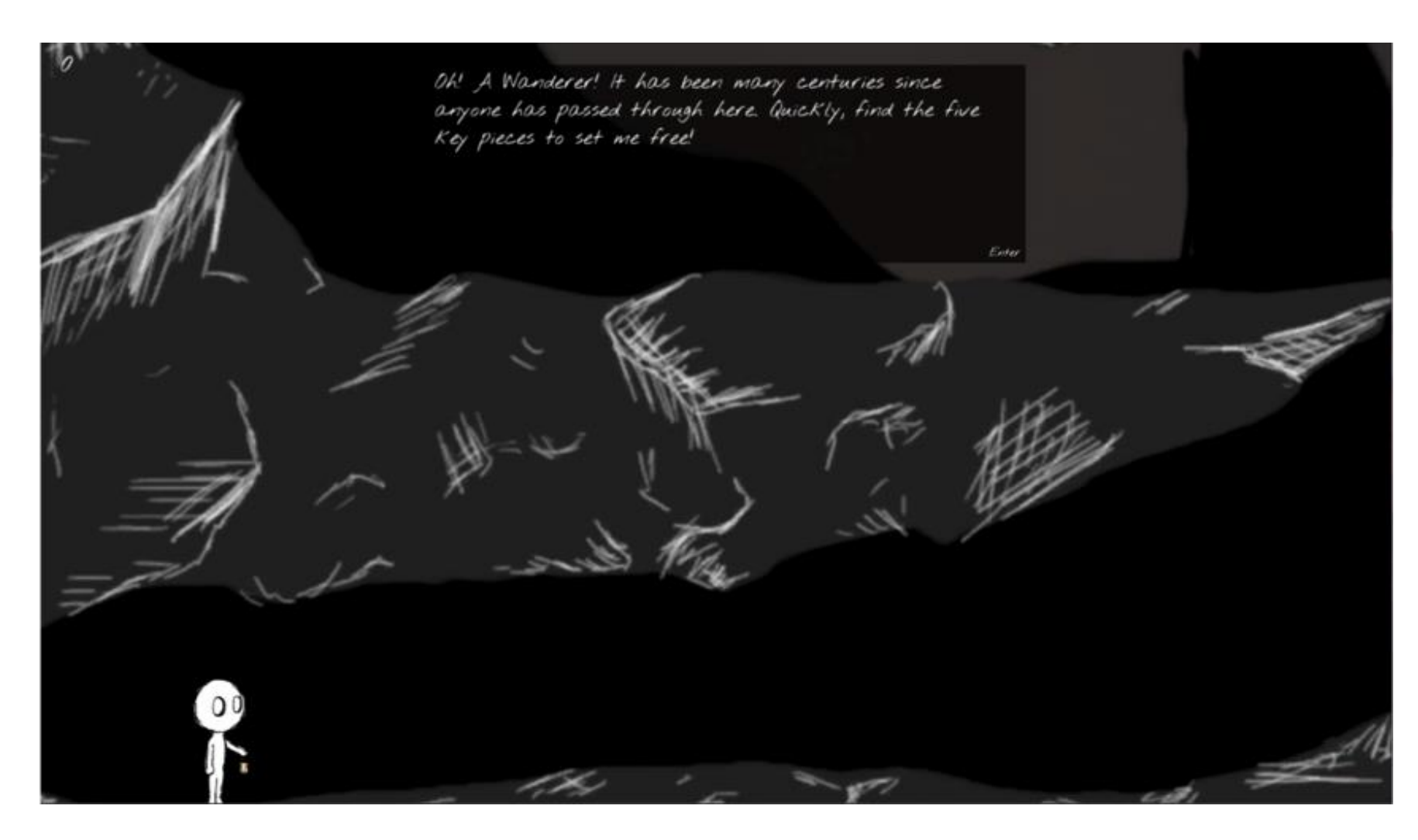
Figure 3: Divine Intervention (Detail)