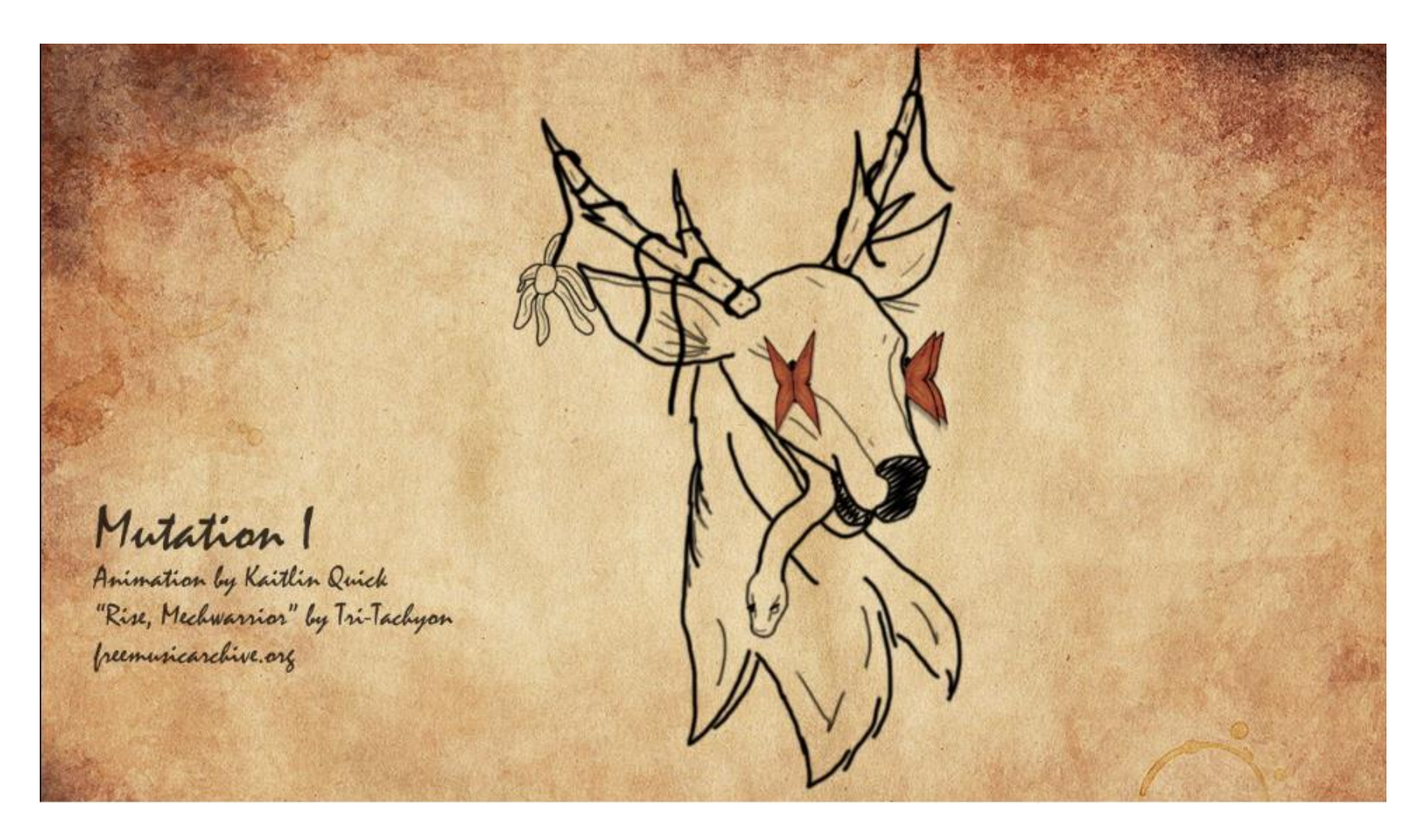
Figure 1: Mutation I (Detail)