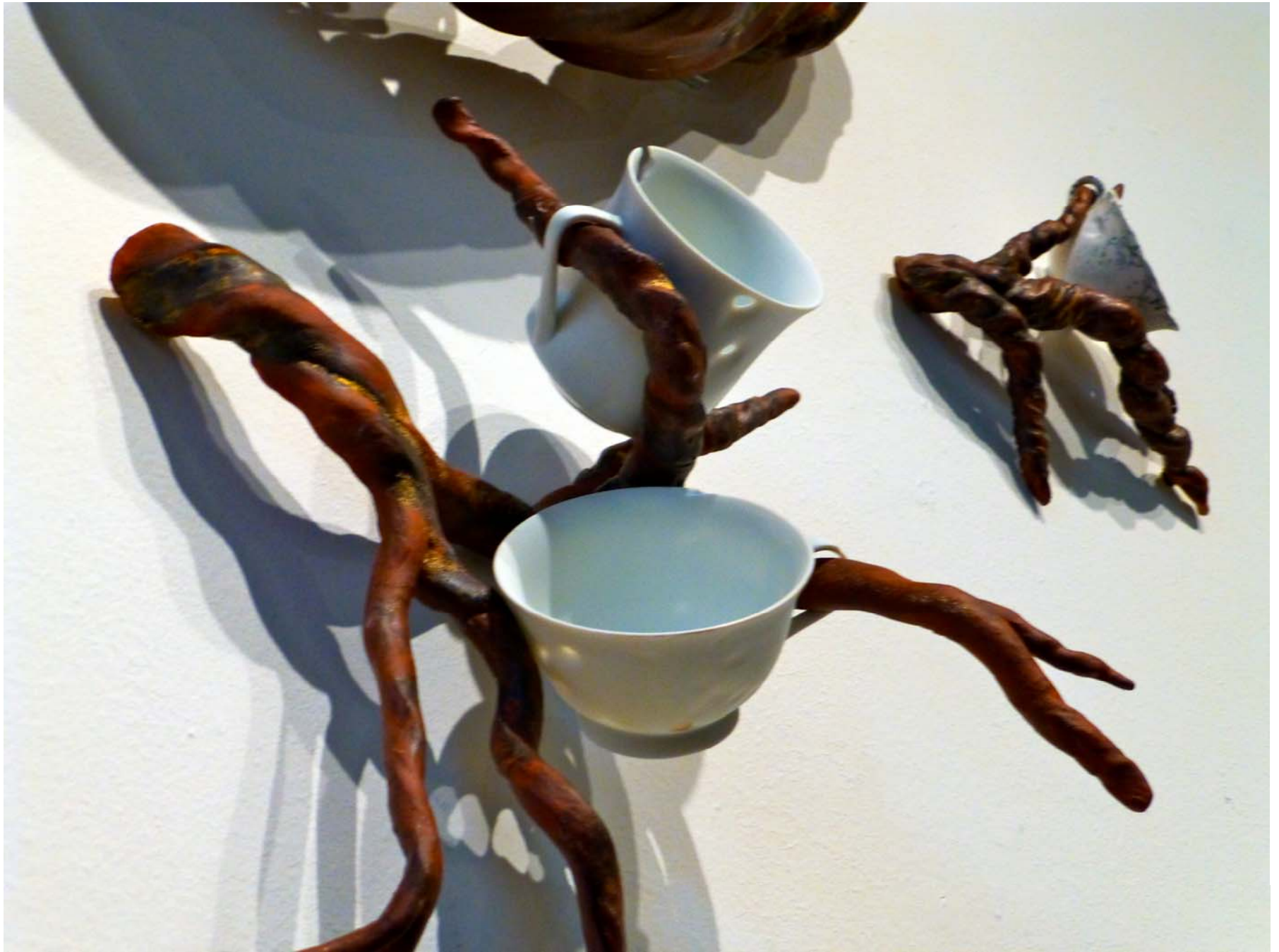
Figure 6: Timeless- Close up 1.