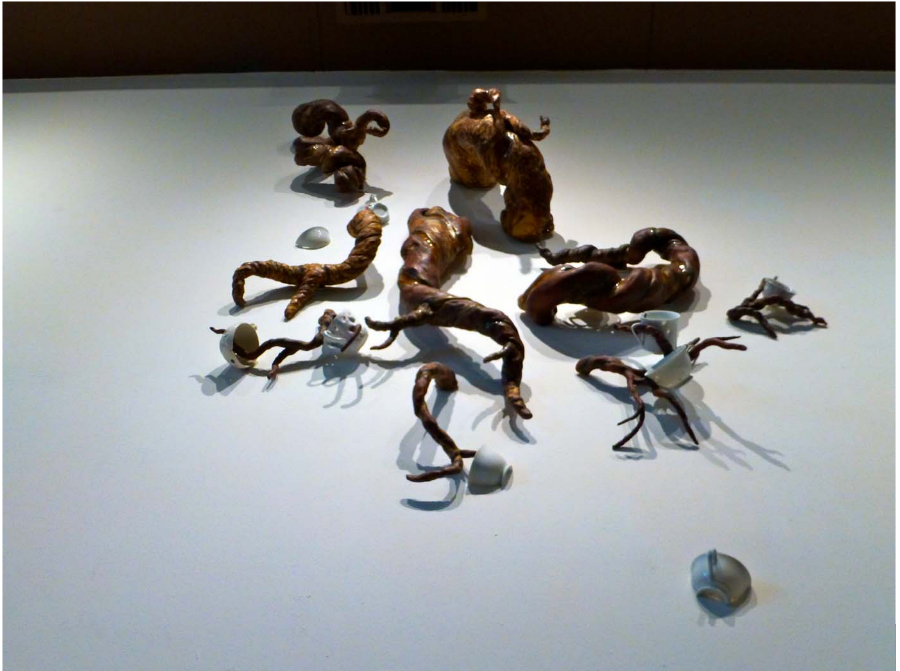
Figure 7: Timeless- Close up 2.