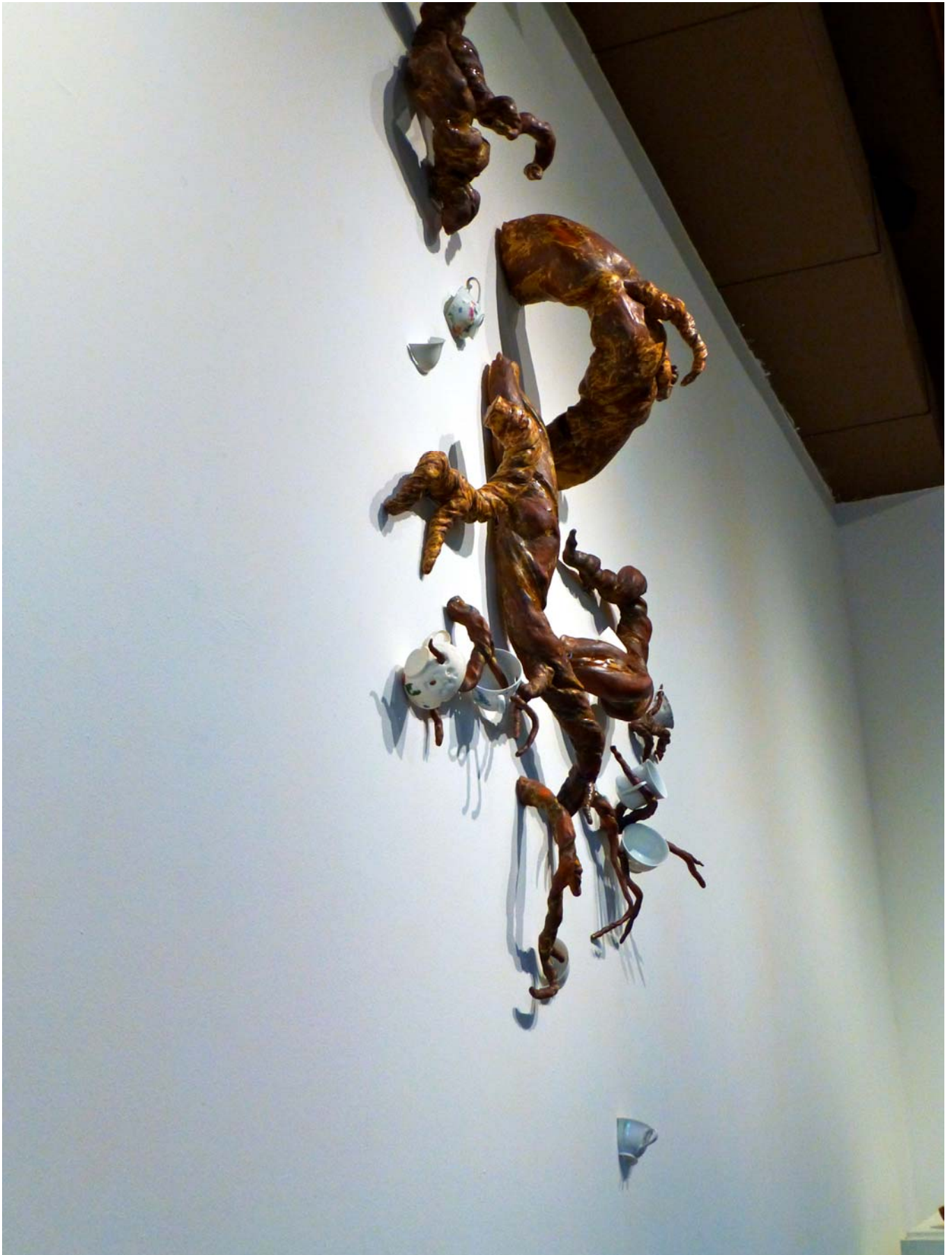
Figure 5: Timeless- Left Side.