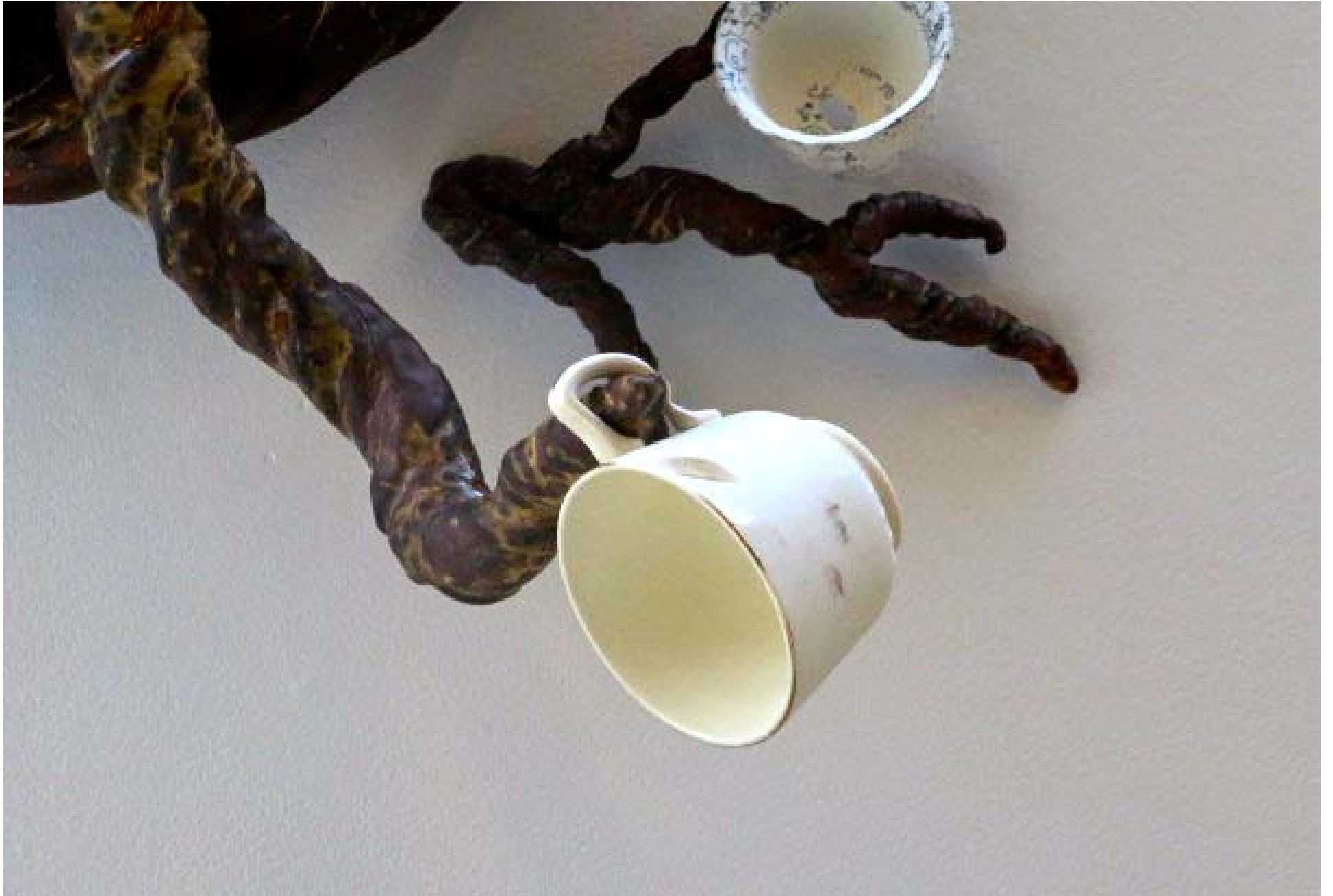
Figure 10: Composition 2- Close up 2.