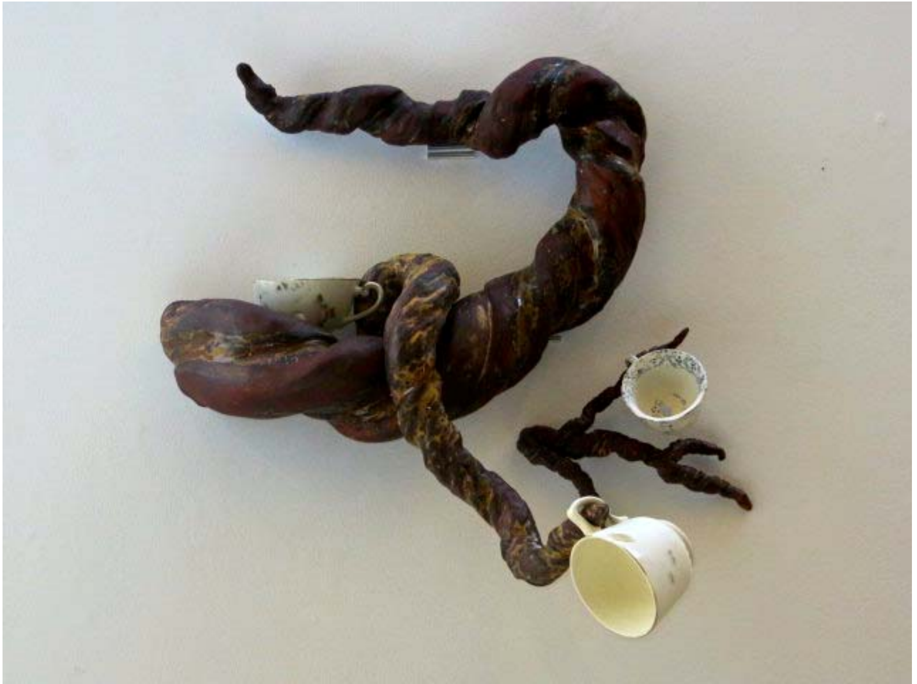
Figure 8: Timeless-Composition 2.