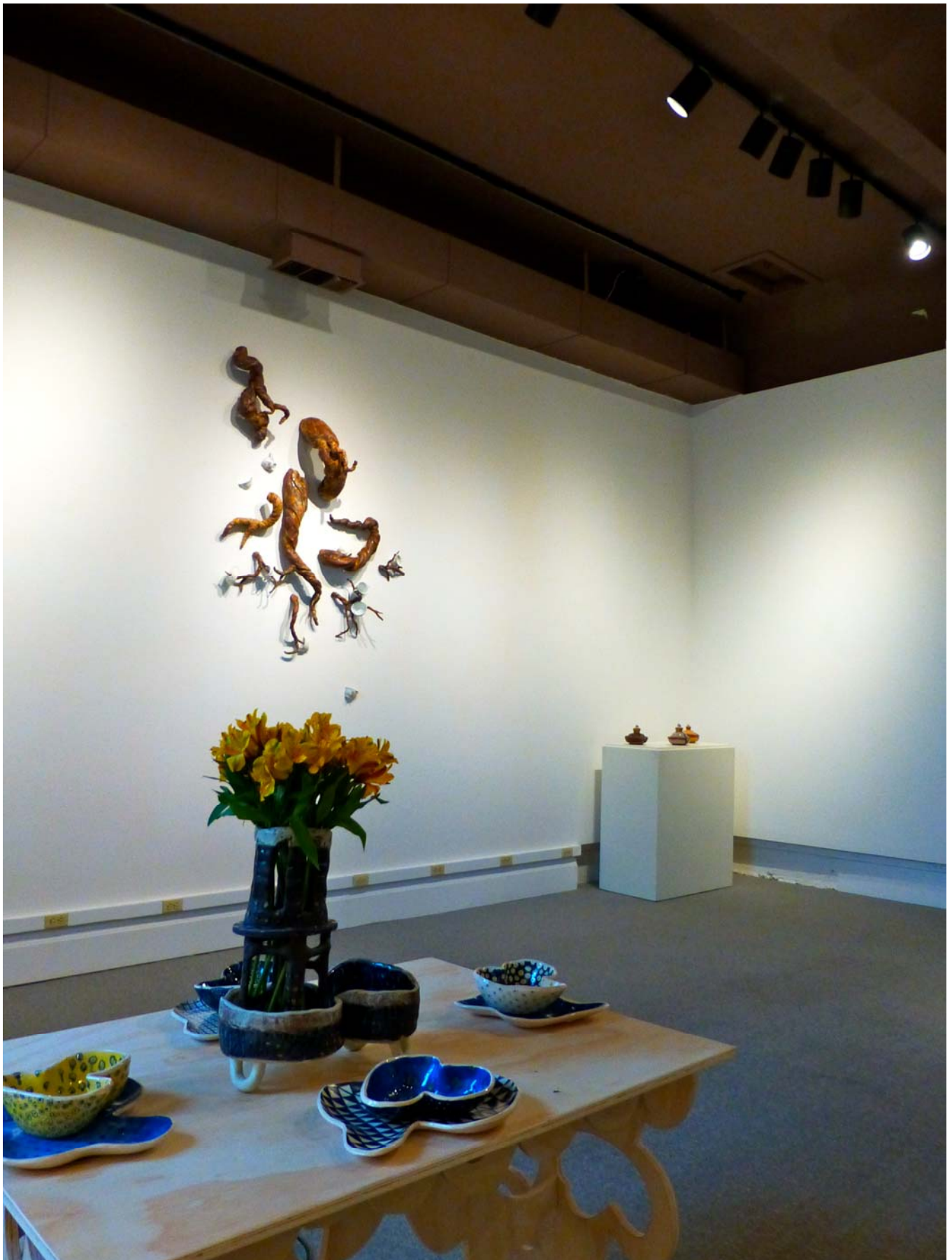
Figure 3: Timeless- View 2.