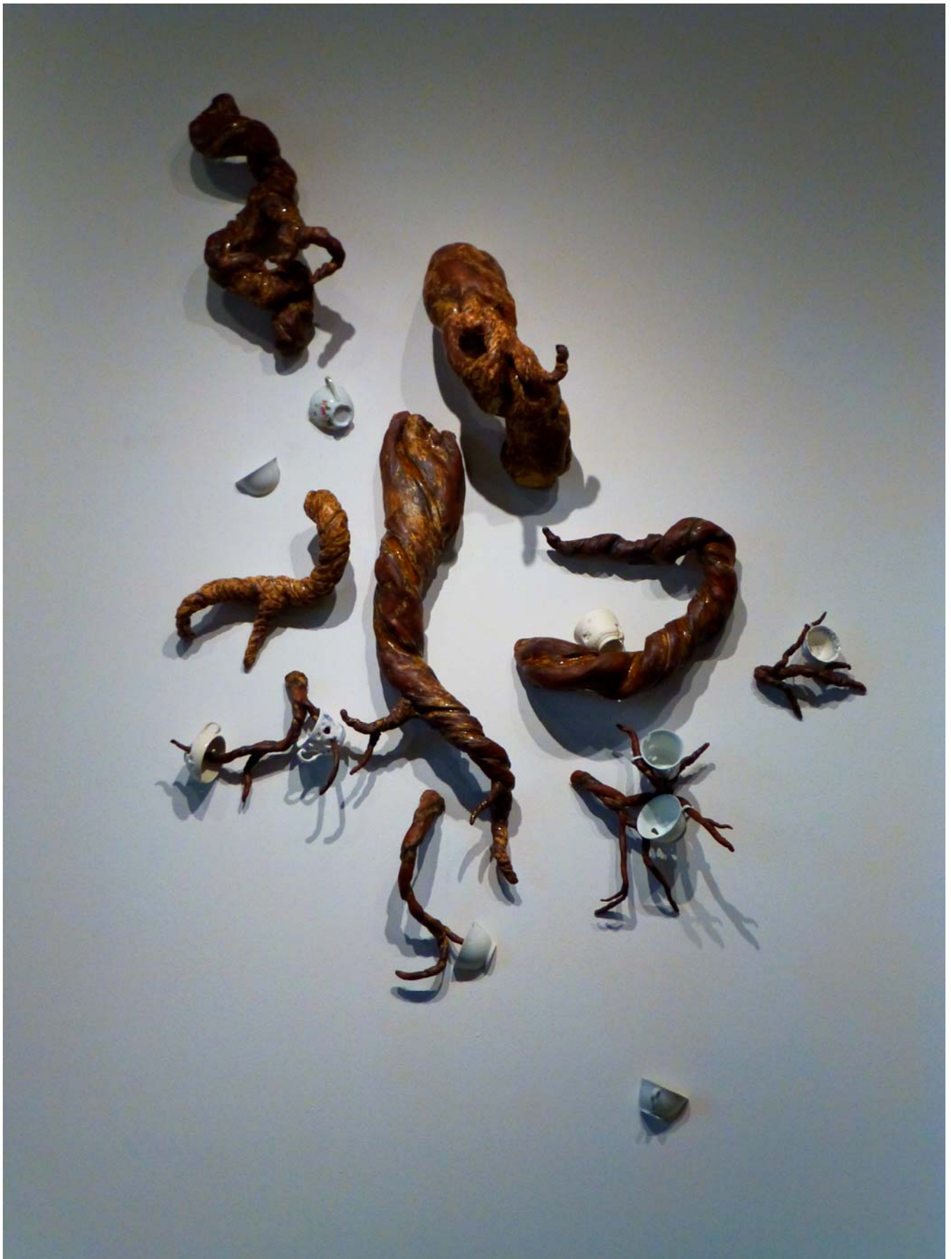
Figure 1: Timeless- Composition 1.