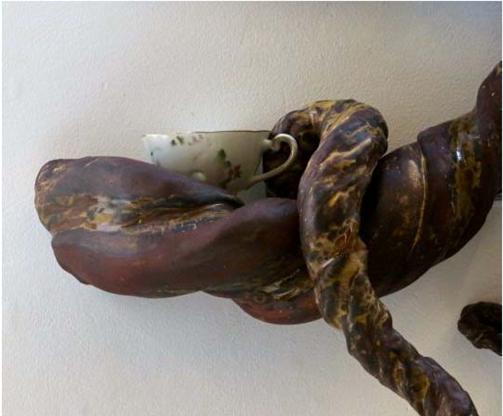
Figure 9: Composition 2- Close up 1.