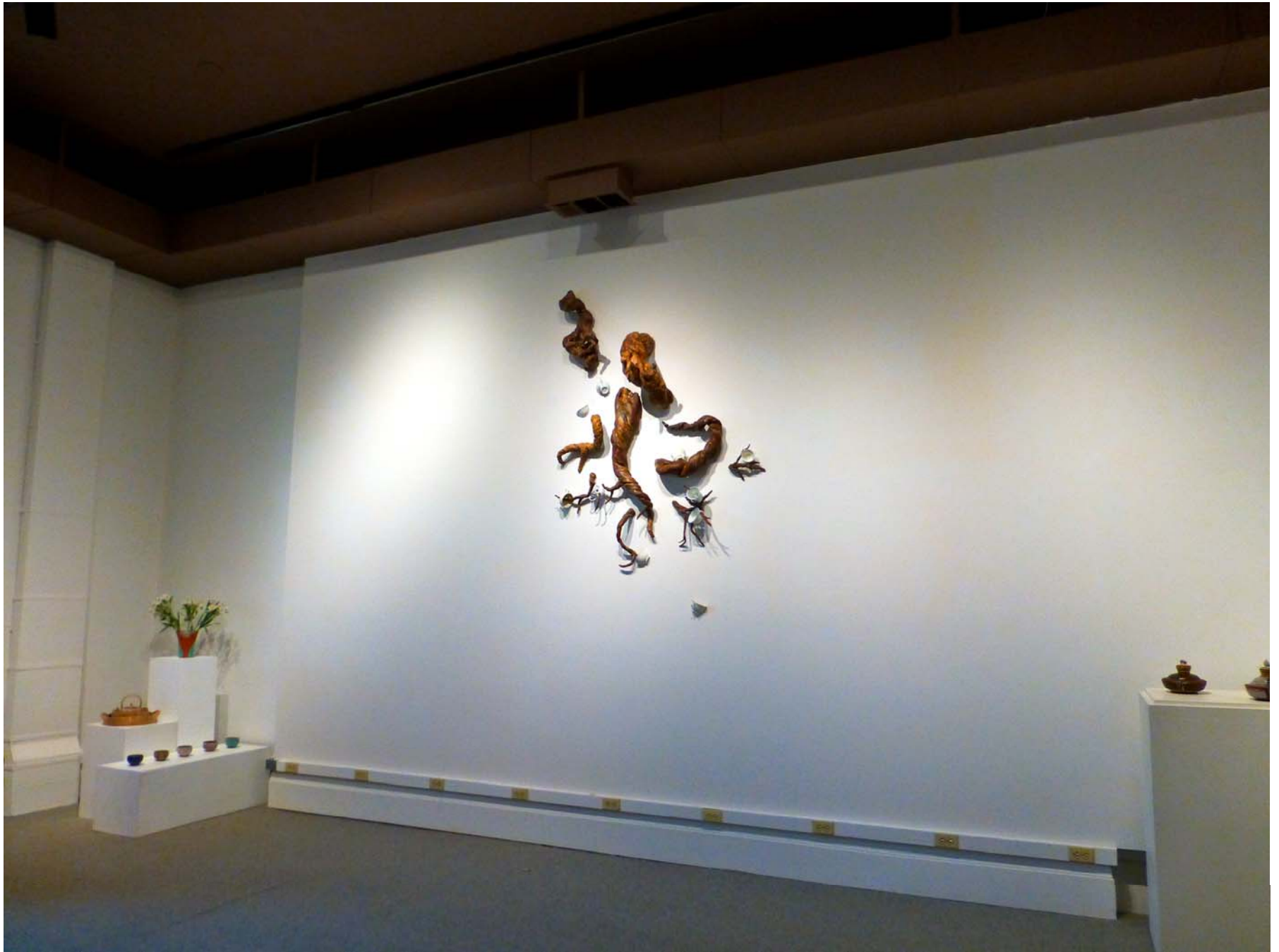
Figure 2: Timeless- View 1.