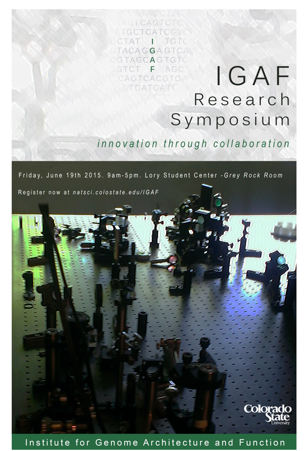
Figure 5: IGAF Research Symposium Poster