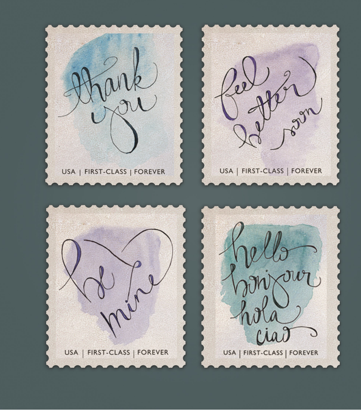
Figure 8: Forever Postage Stamp Set