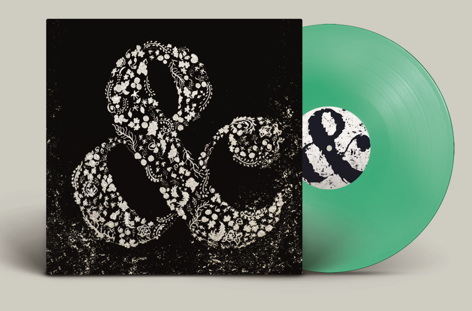
Figure 9: Vinyl Record Album and Jacket: Ed Sheeran (Front)