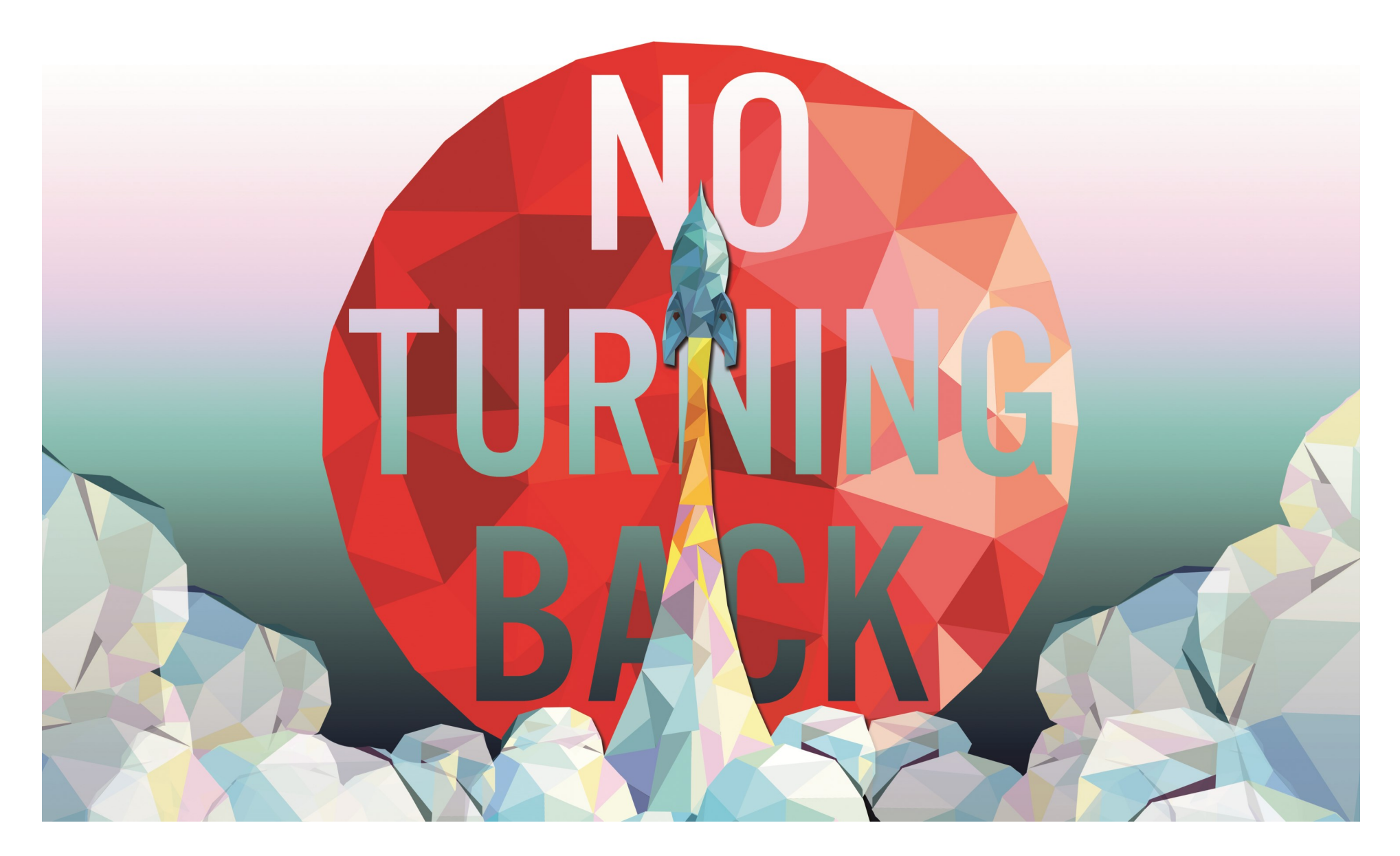
Figure 7: Living on Mars