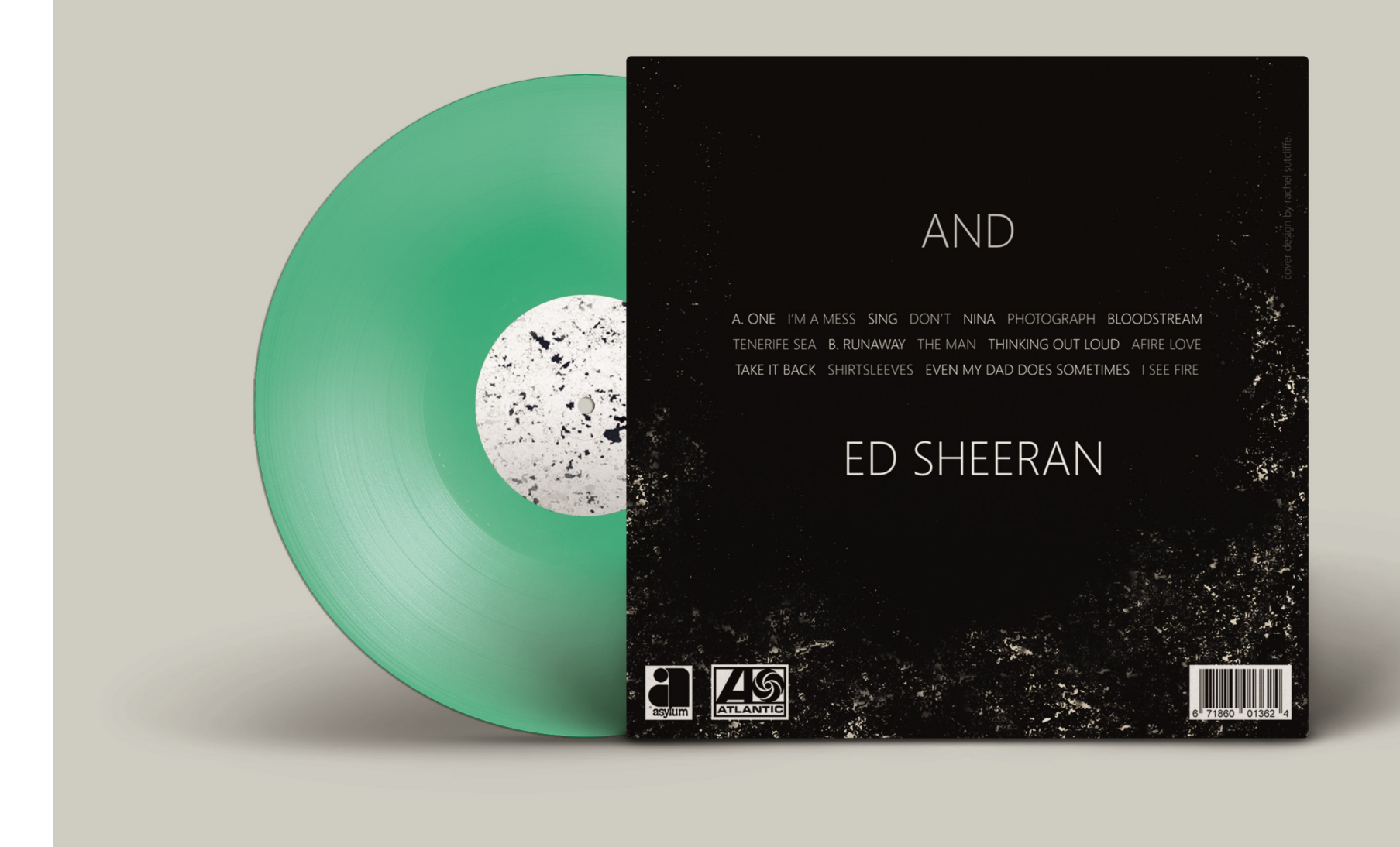
Figure 10: Vinyl Record Album and Jacket: Ed Sheeran (Back)