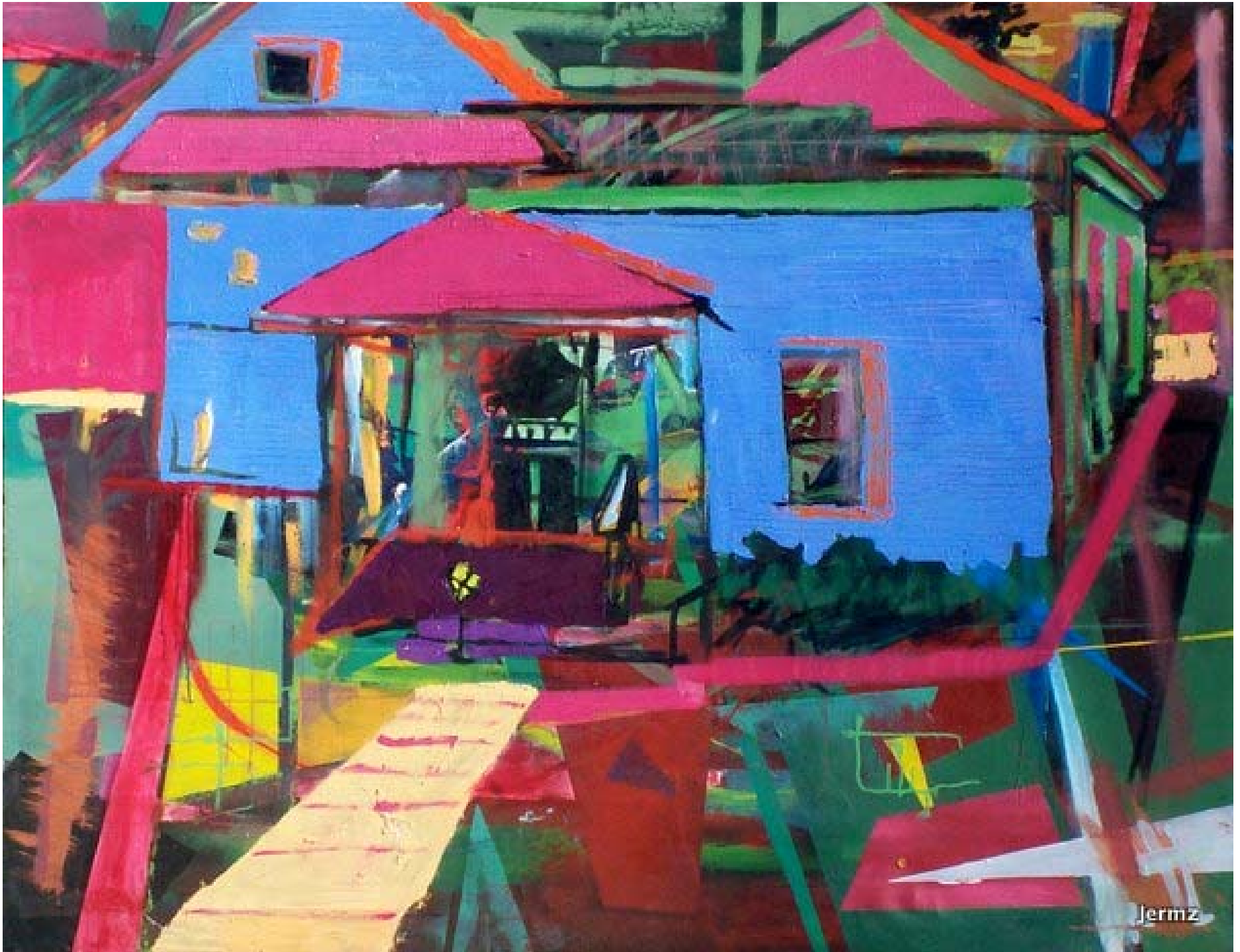
Figure 8: Party in the Back Yard.