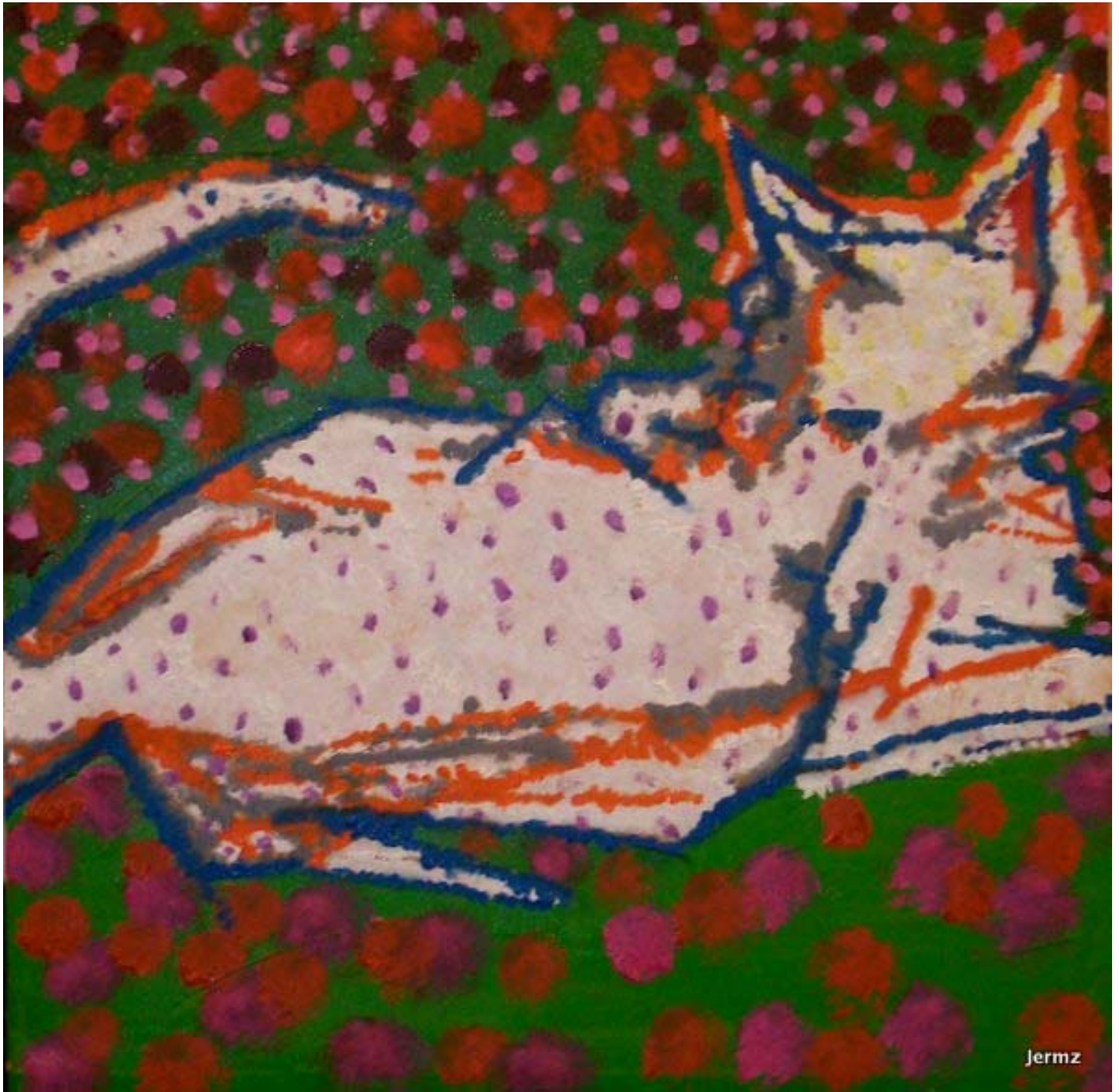
Figure 6: Litter Box Hero.