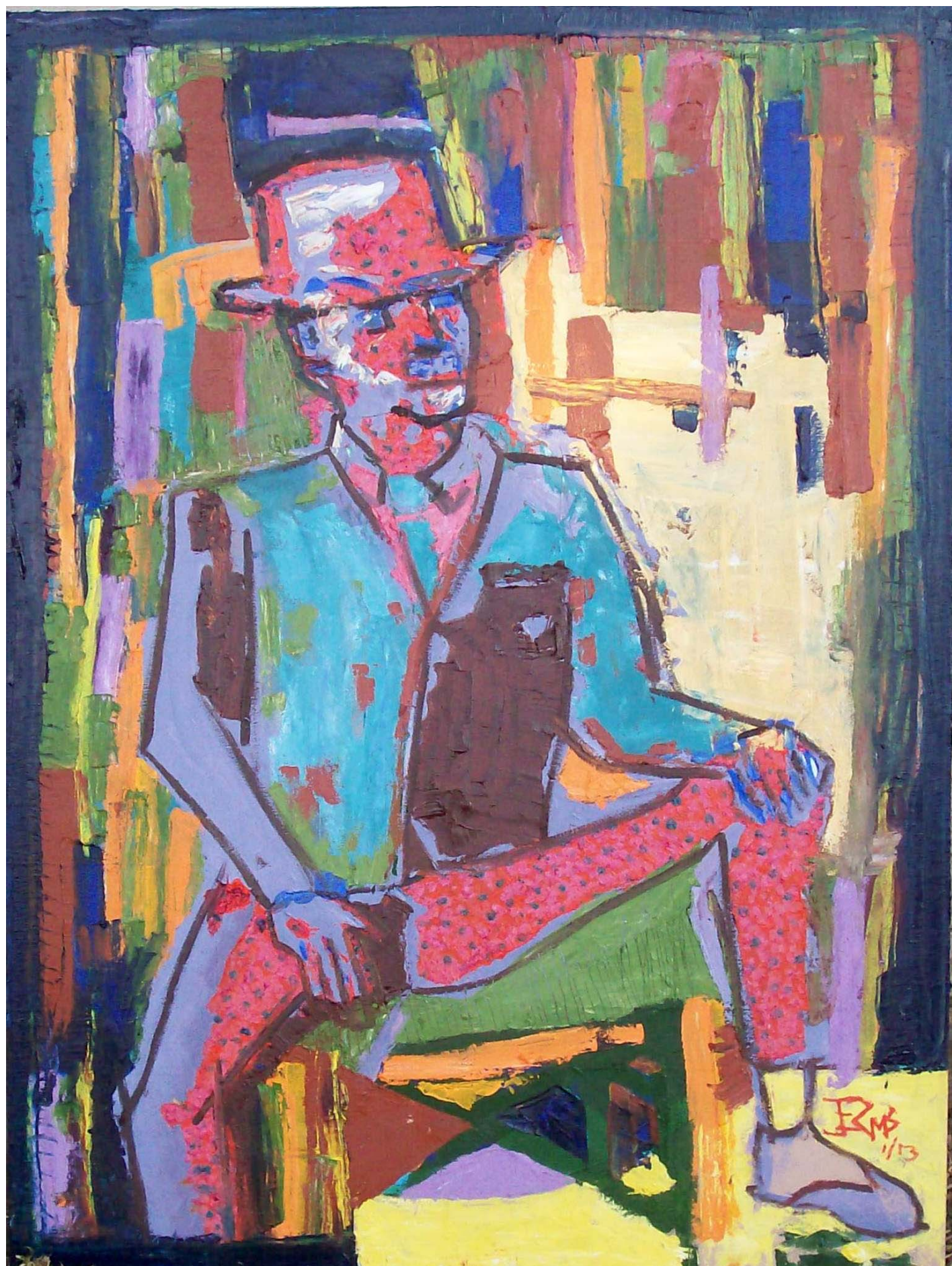
Figure 10: The Duke of Crandalstein.