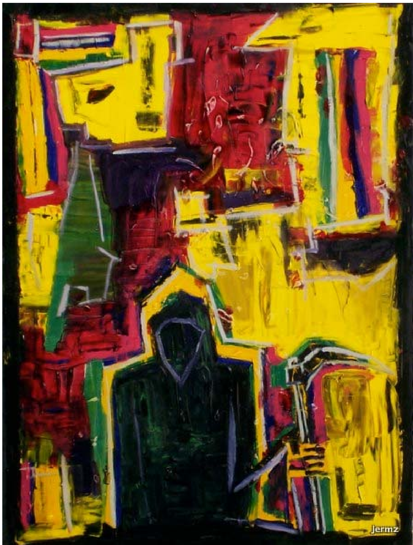
Figure 2: All Encompassing Death.