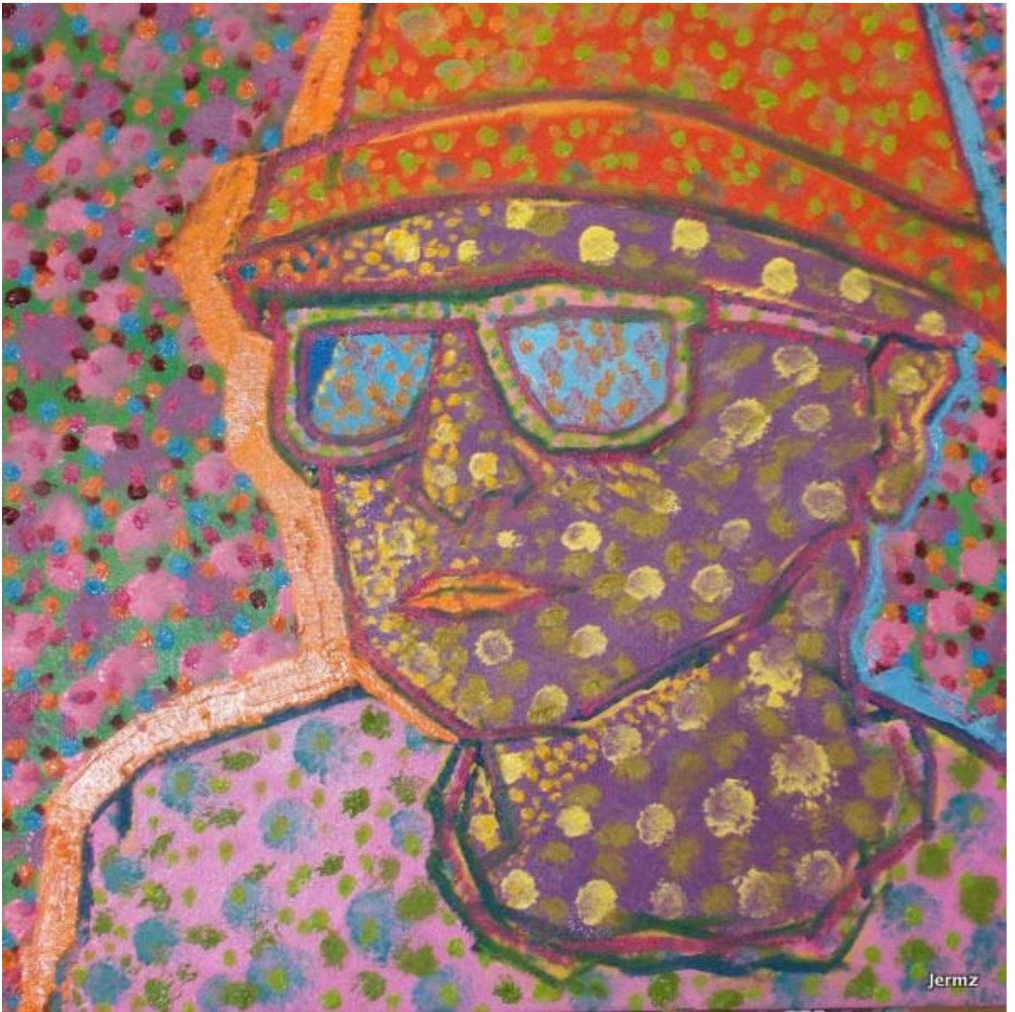
Figure 9: Self Portrait.