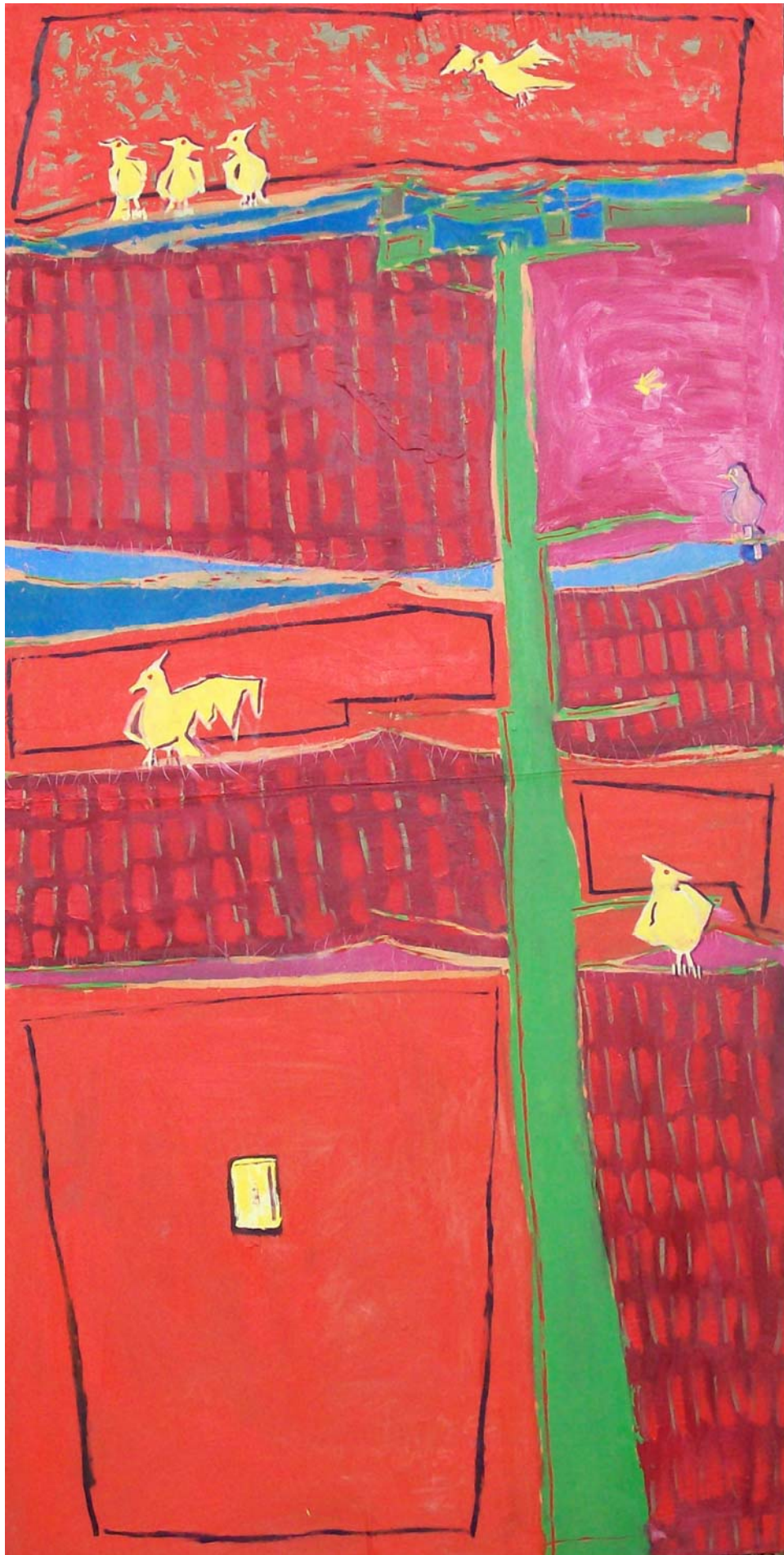
Figure 12: When the Birds Chirp.