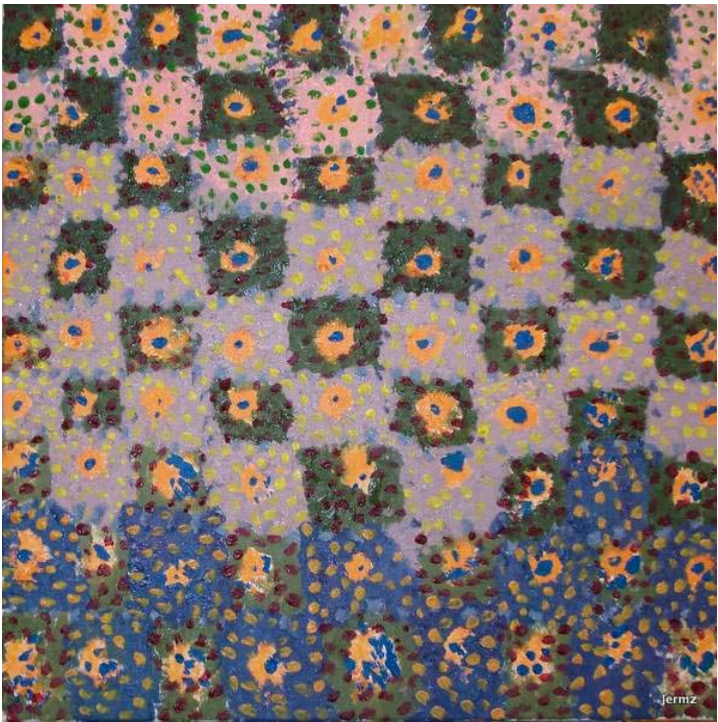
Figure 11: Neutralizer 3.