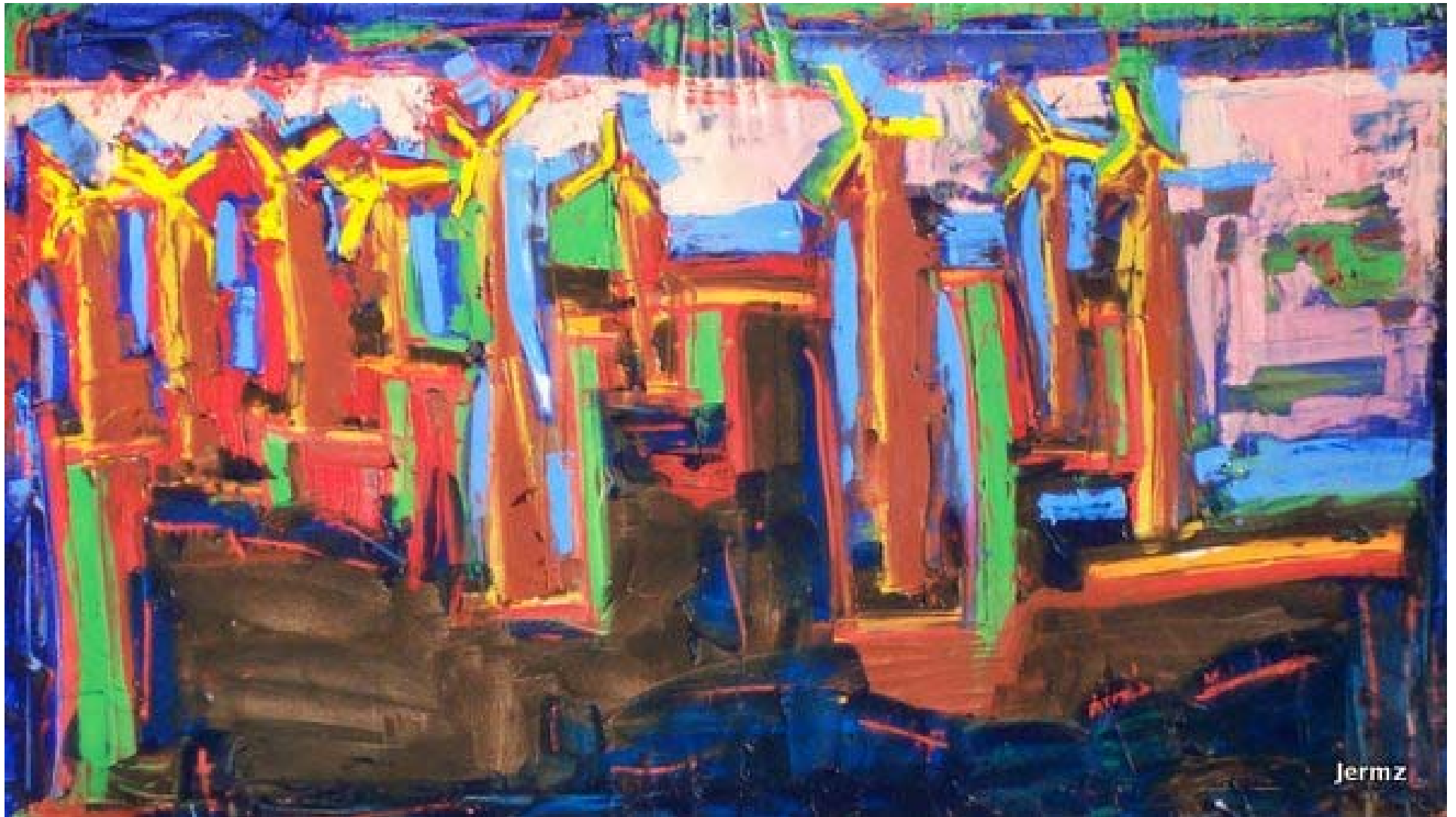
Figure 13: Windy Wyoming.