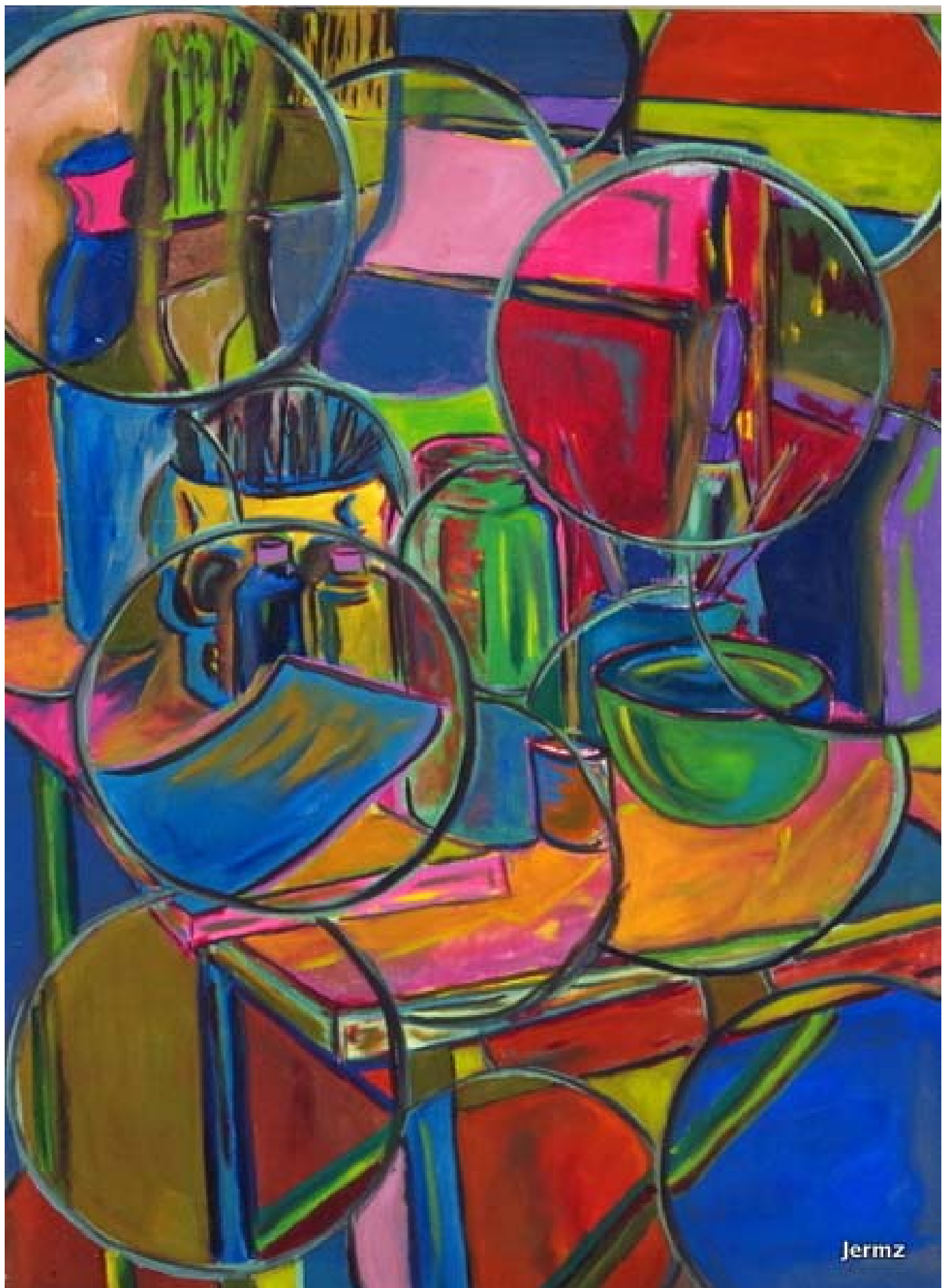
Figure 3: Bubble Bath Desk Party.