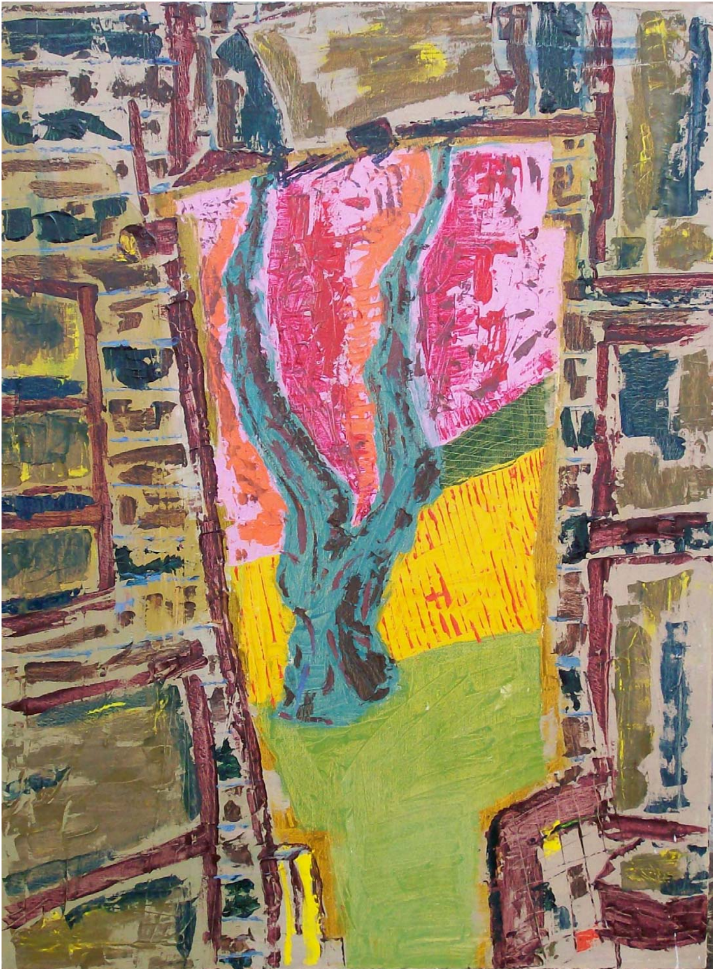
Figure 5: Lets Go Outside, It's Nicer Out There.