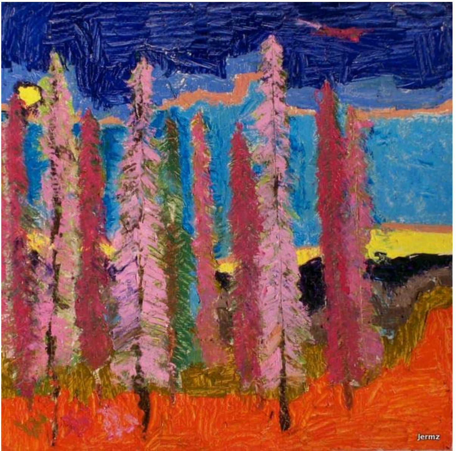
Figure 1: A Forest of Happy Little Trees.