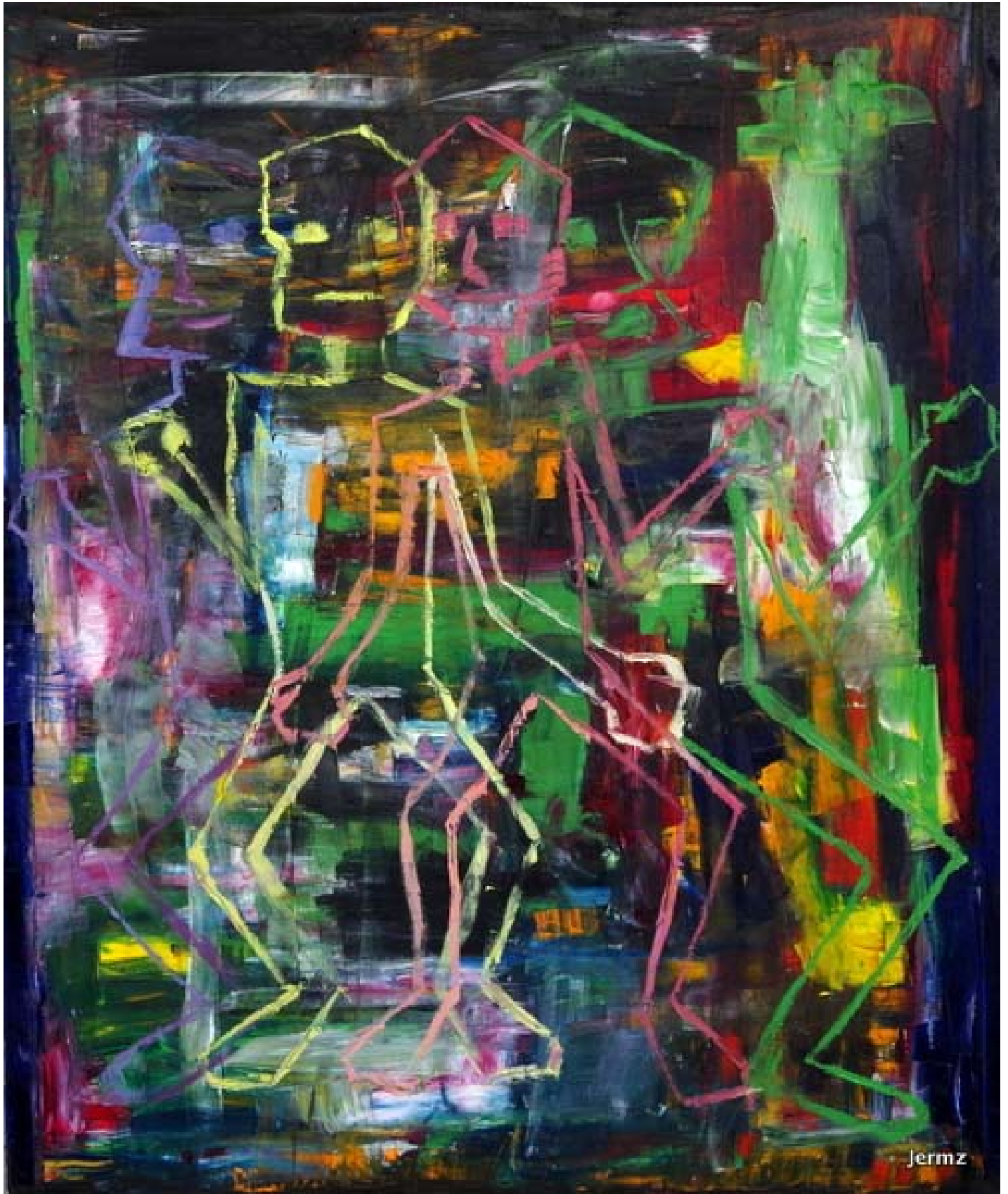
Figure 7: Party All the Time.