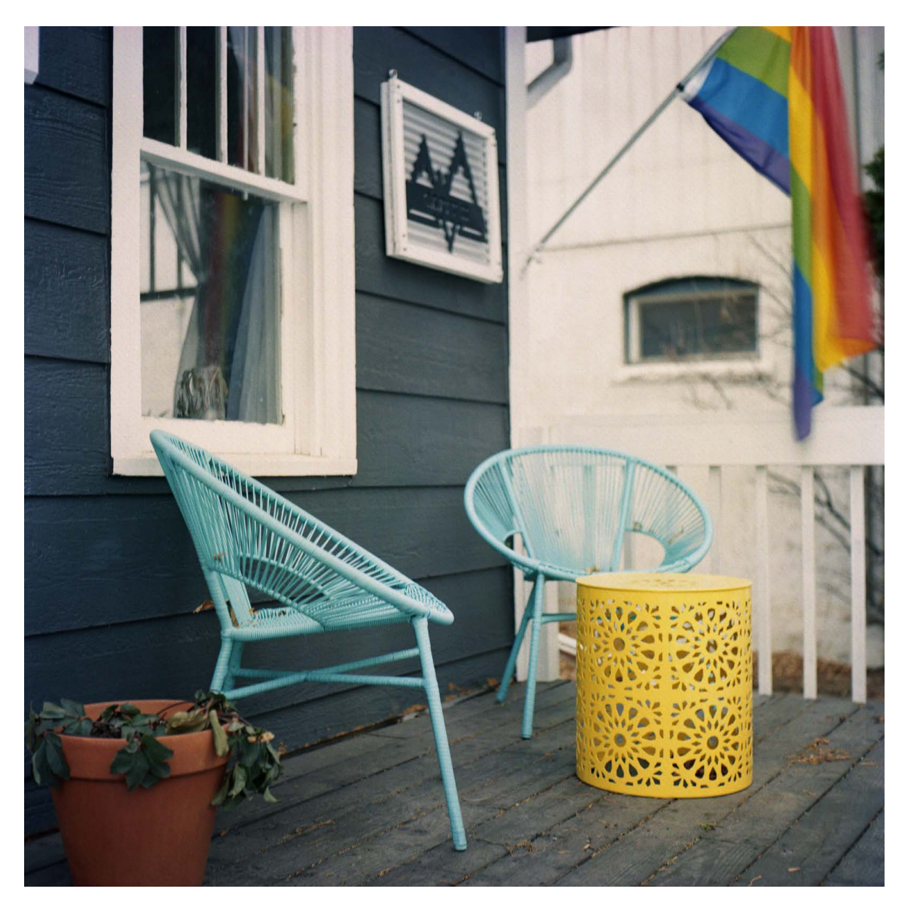
Figure 11: Edwards St #2, 2022