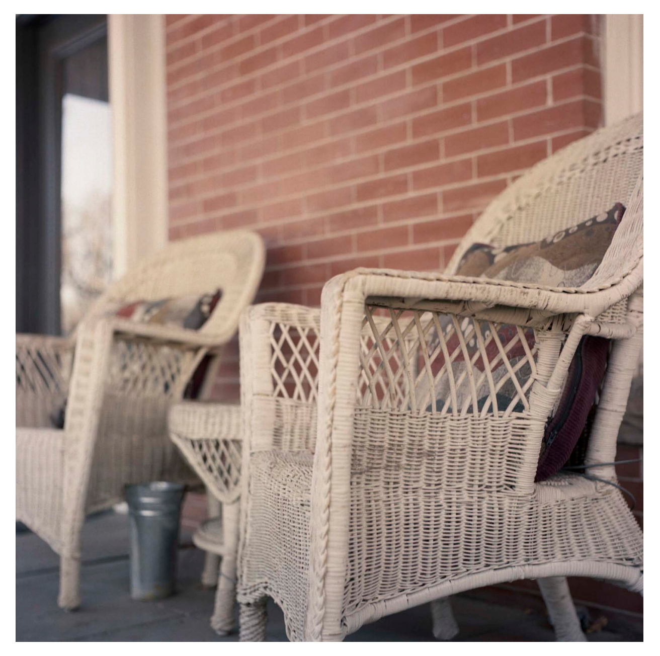
Figure 10: Matthews St #3, 2022