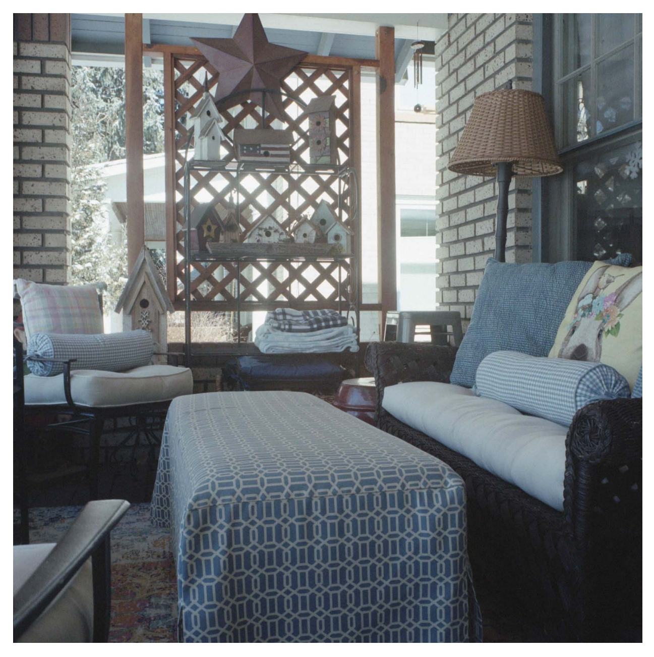
Figure 8: Matthews St #2, 2022