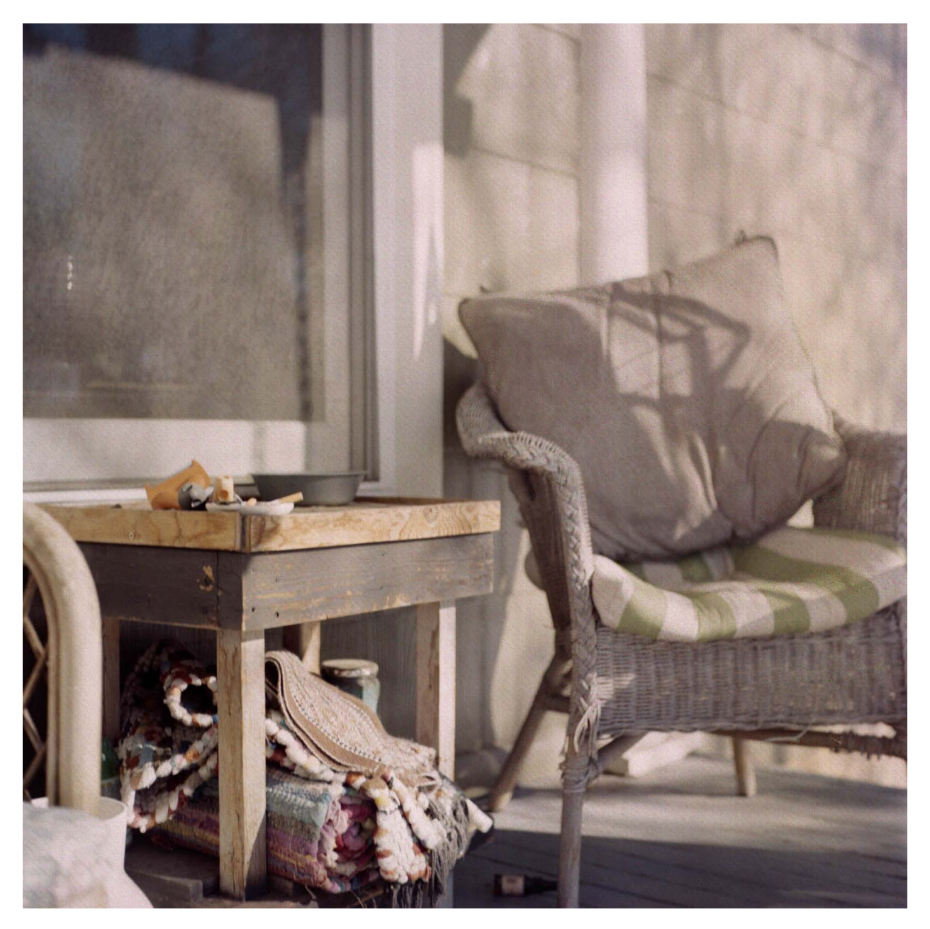
Figure 3: E Plum St #2, 2022