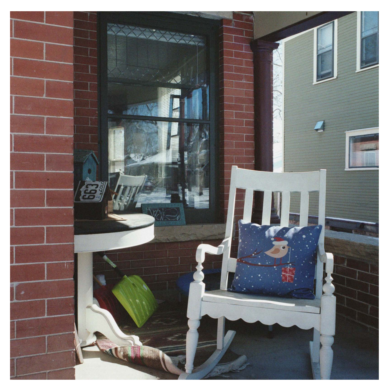
Figure 6: Peterson St, 2022