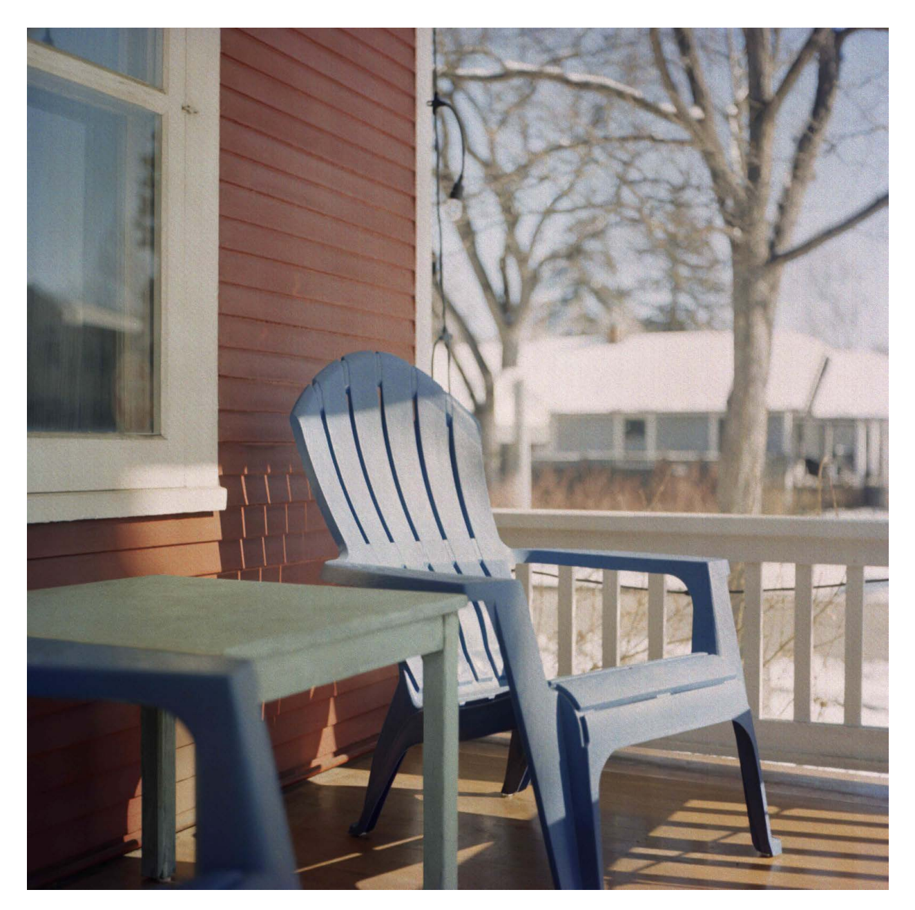
Figure 9: Locust St, 2022