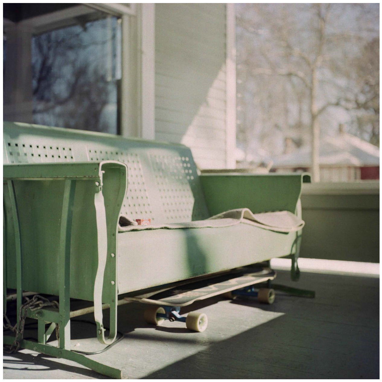
Figure 2: E Plum St #1, 2022