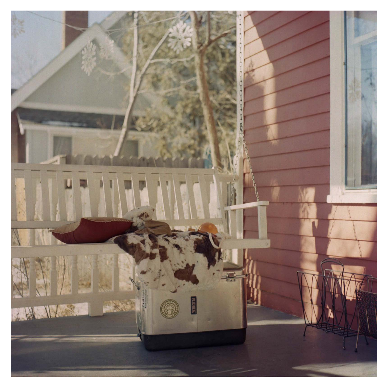
Figure 7: E Laurel St, 2022