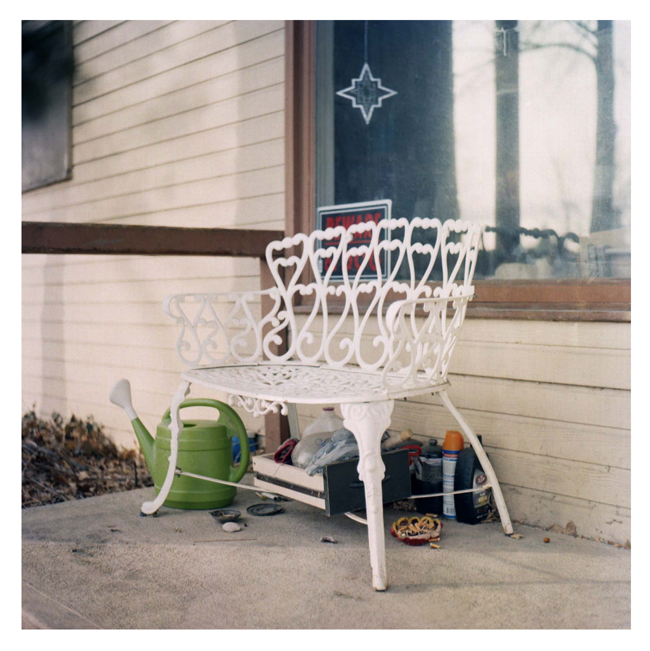
Figure 1: E Pitkin St, 2022