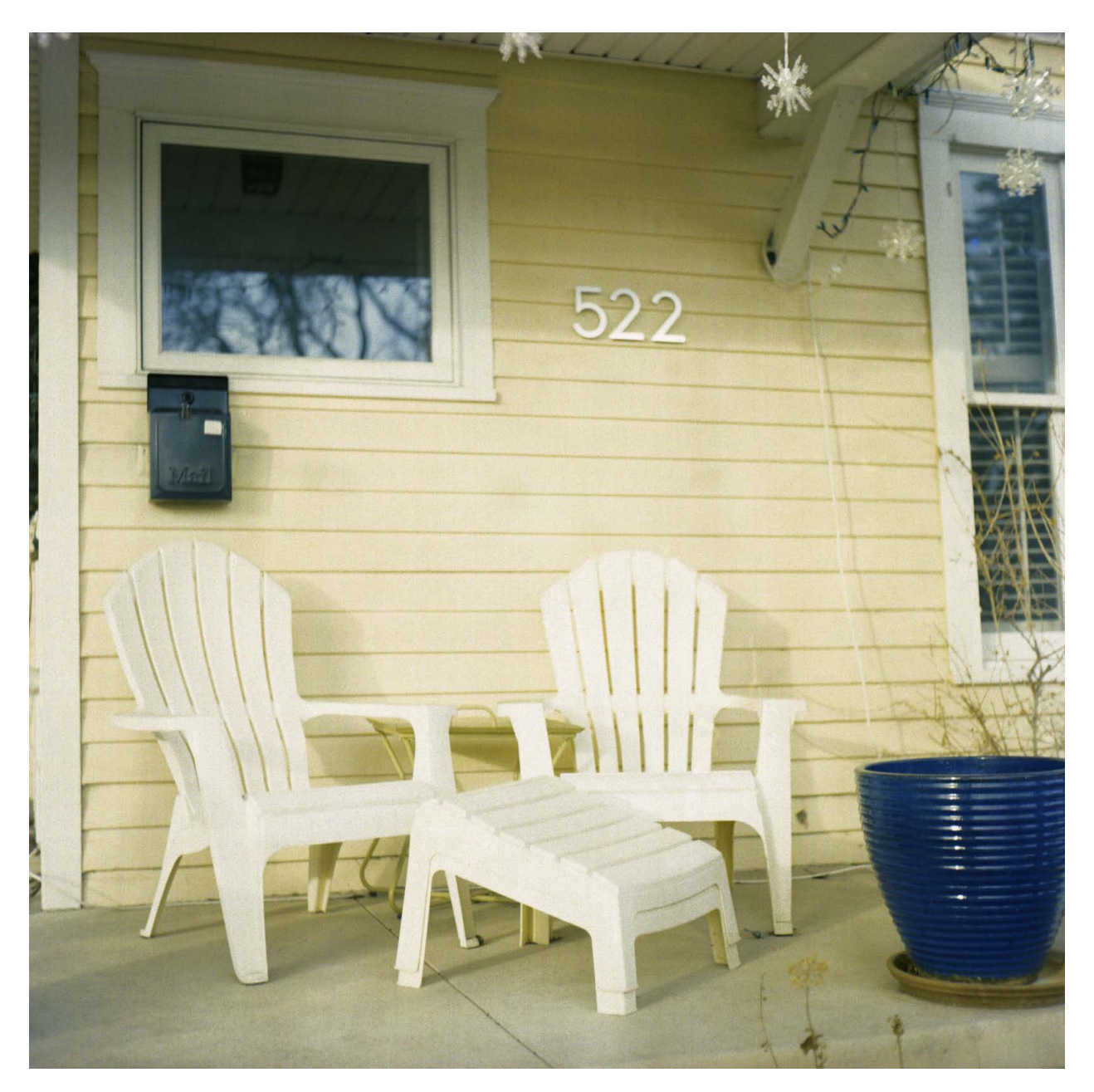
Figure 5: Edwards St #1, 2022