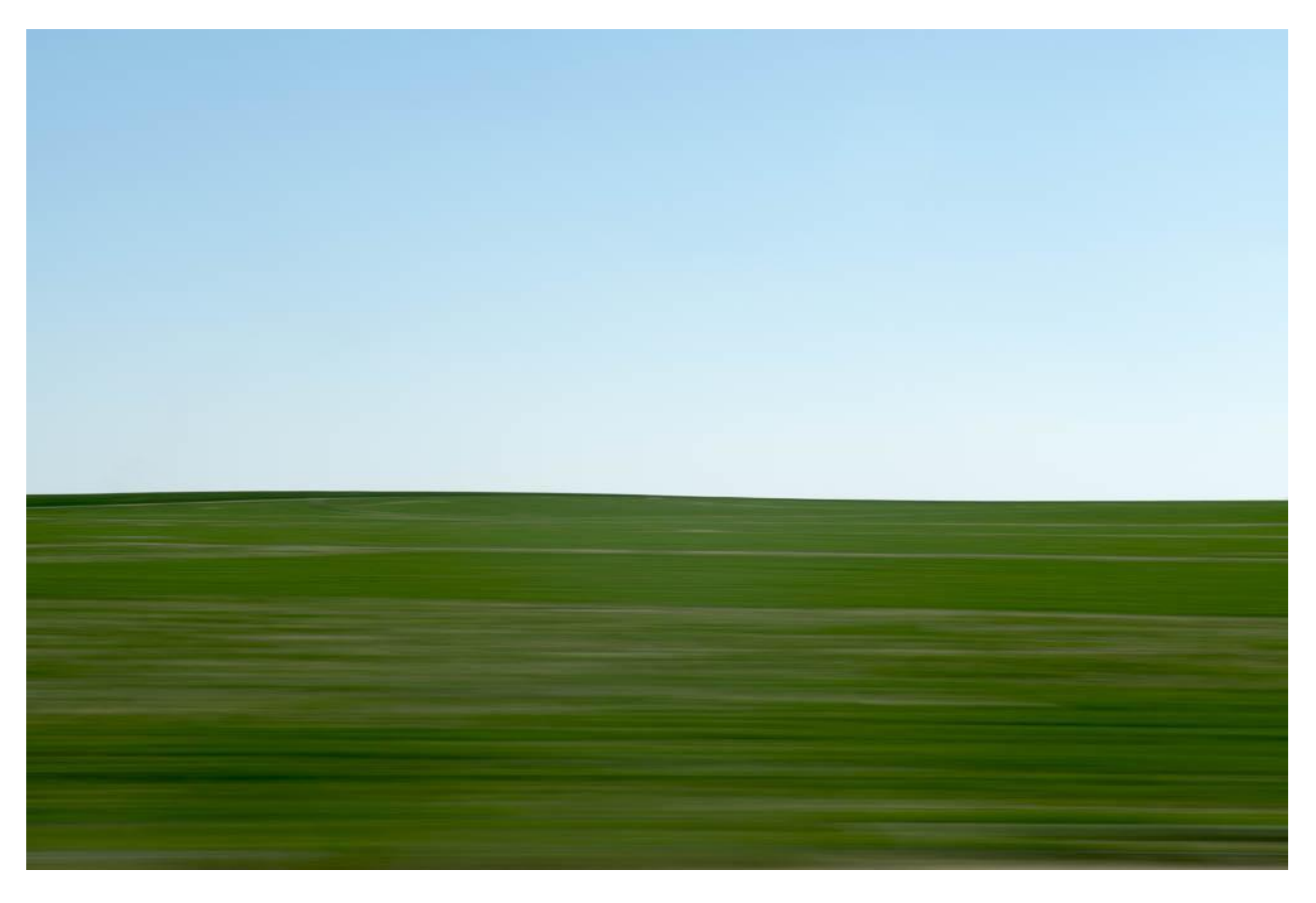
Figure 3: April 22nd, III