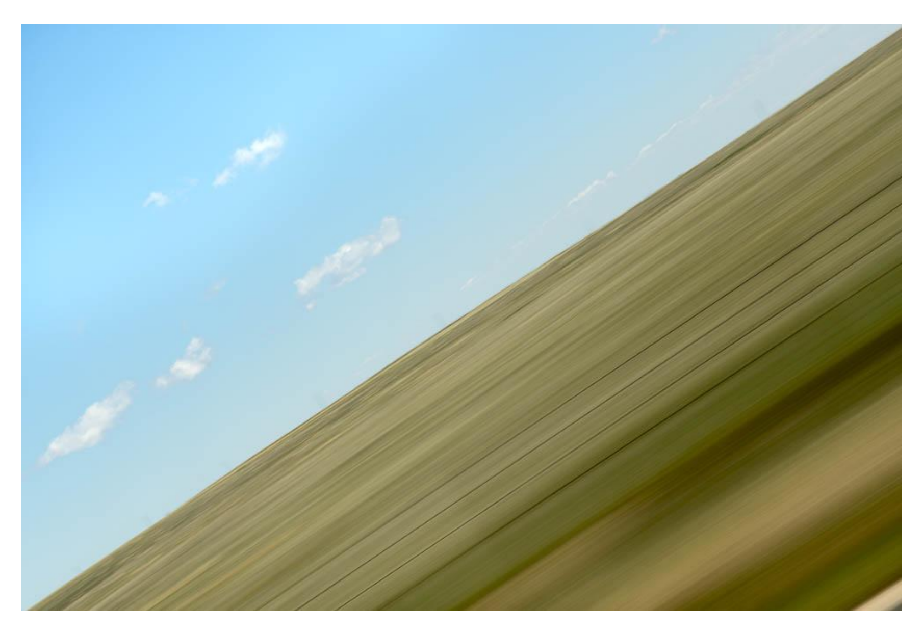
Figure 1: April 22nd, I