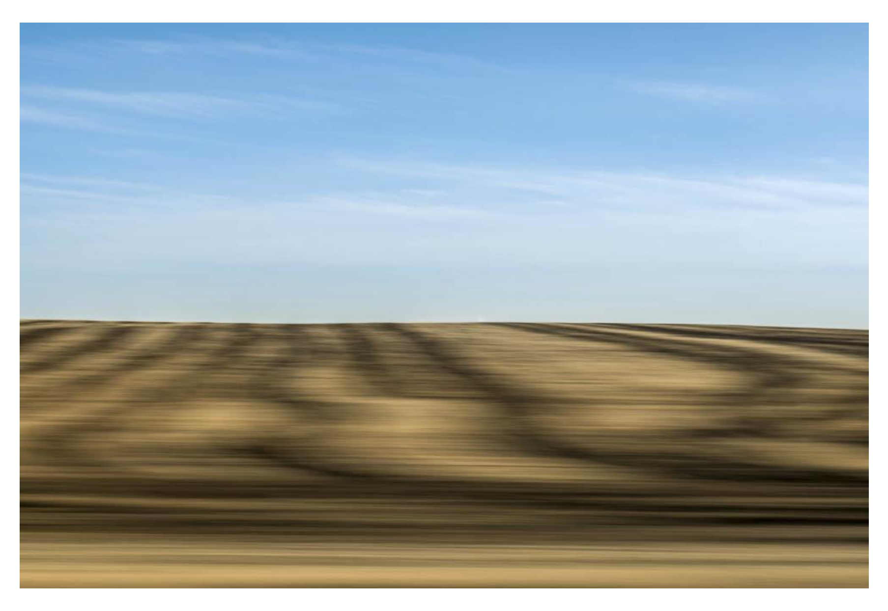
Figure 5: March 7th, I