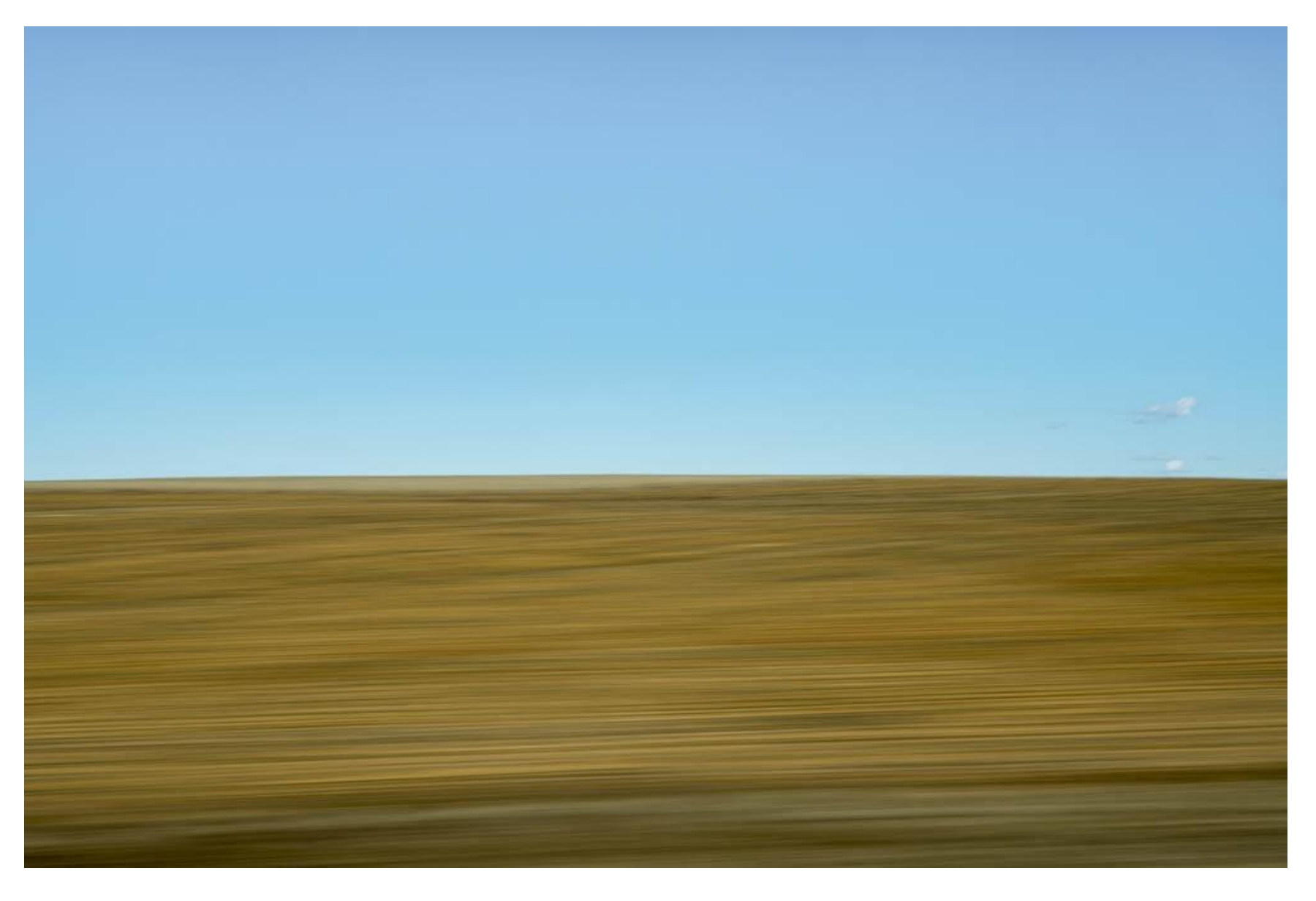
Figure 4: February 17th