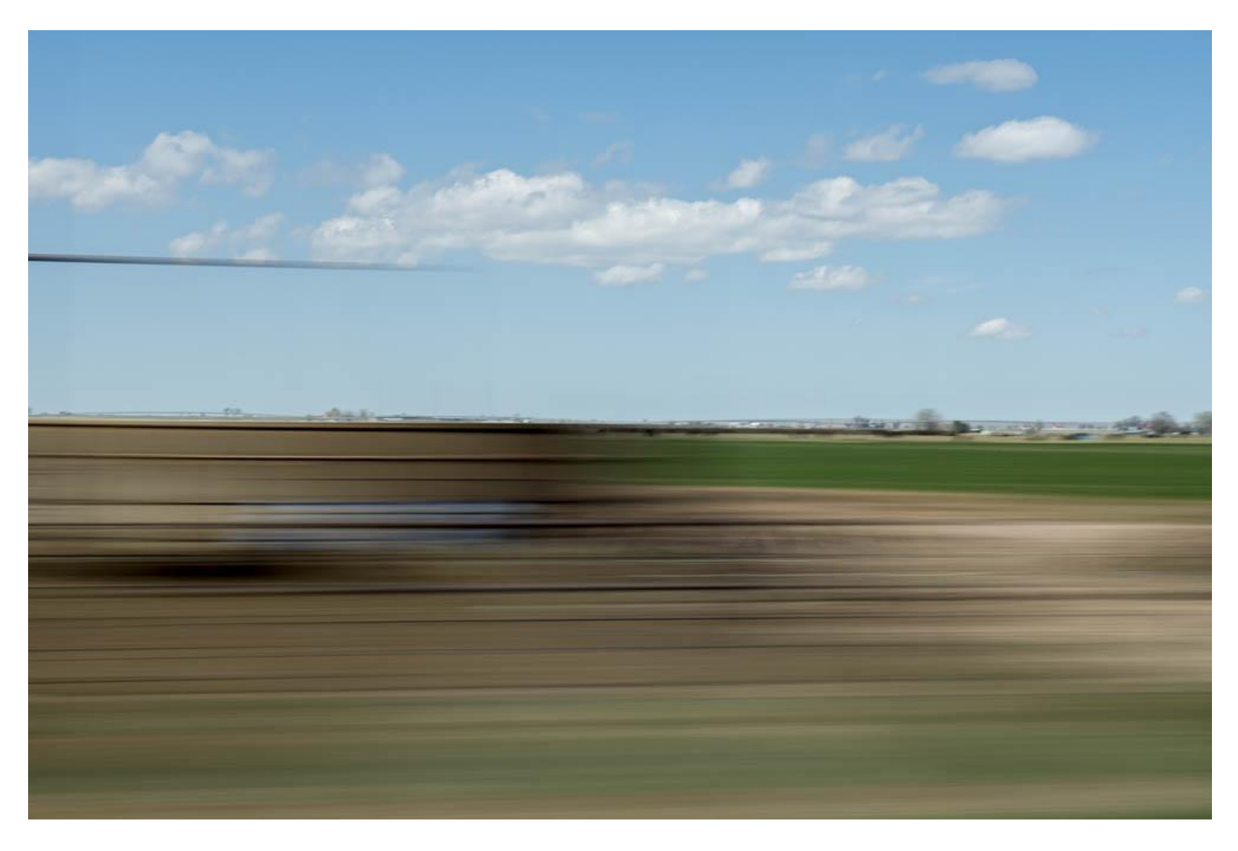
Figure 11: April 22nd, VII