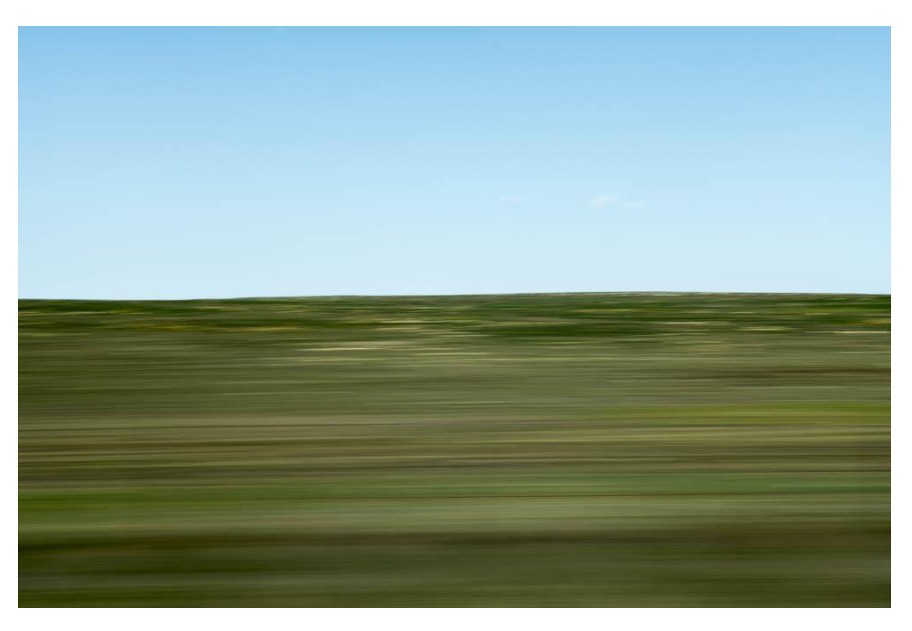
Figure 10: April 22nd, VI