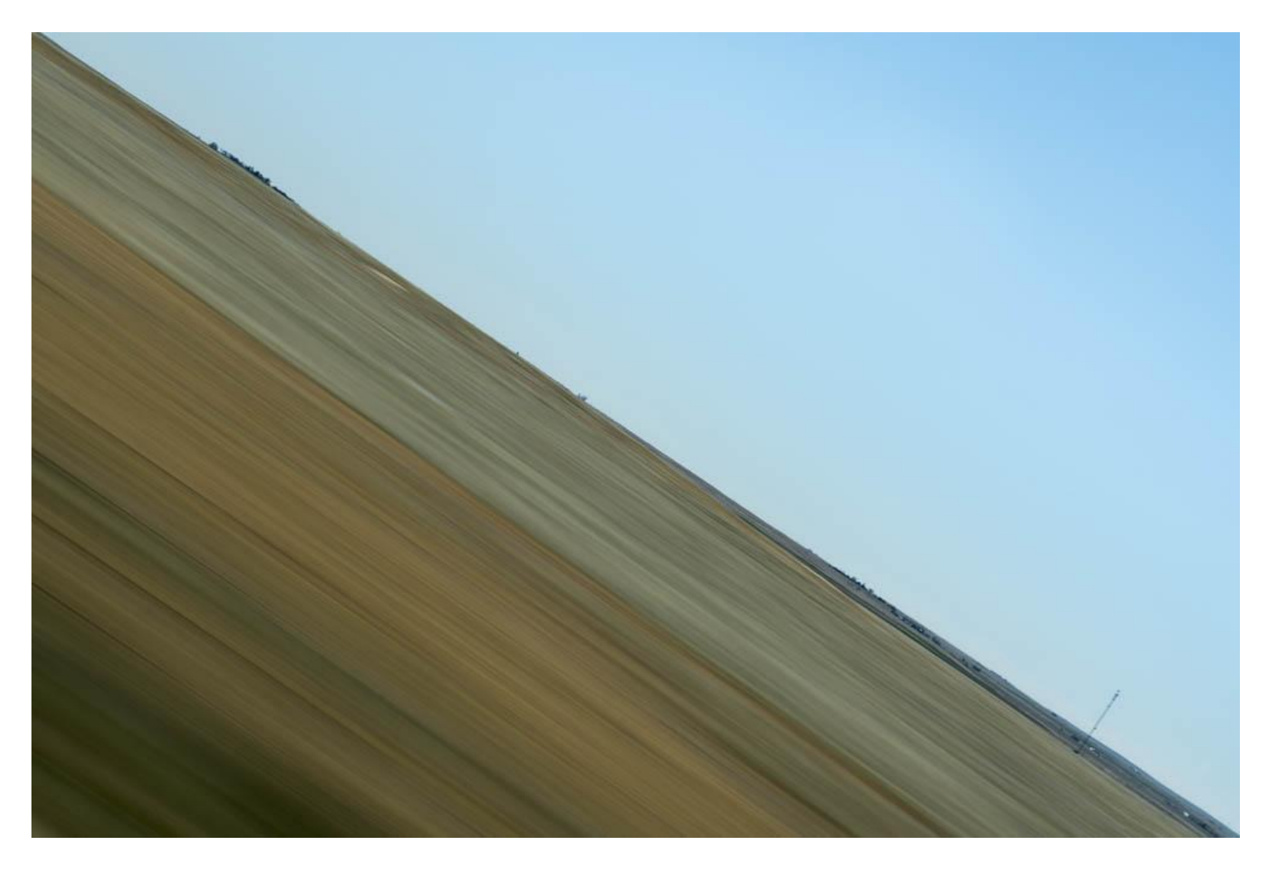
Figure 12: April 22, VIII