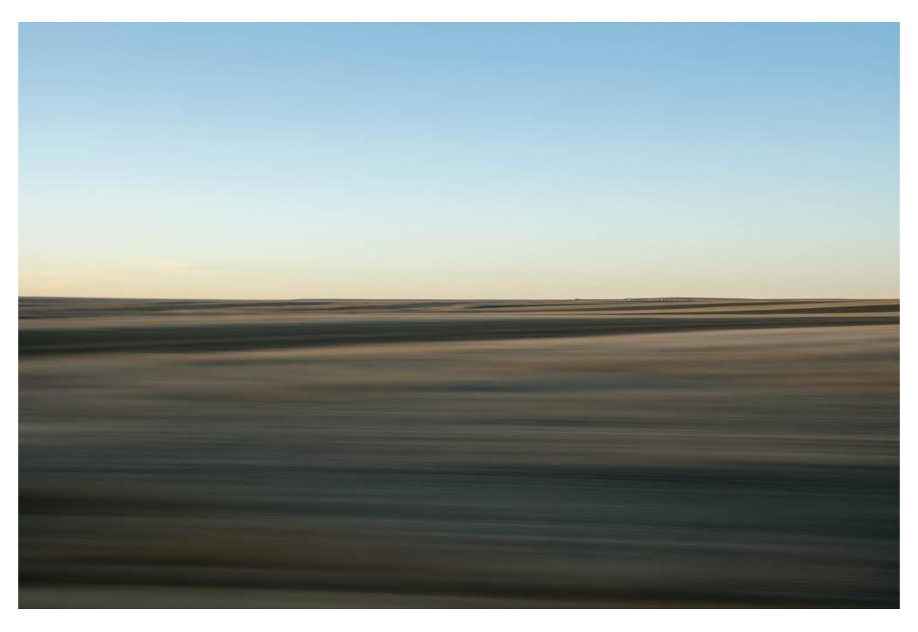
Figure 8: March 7th, II