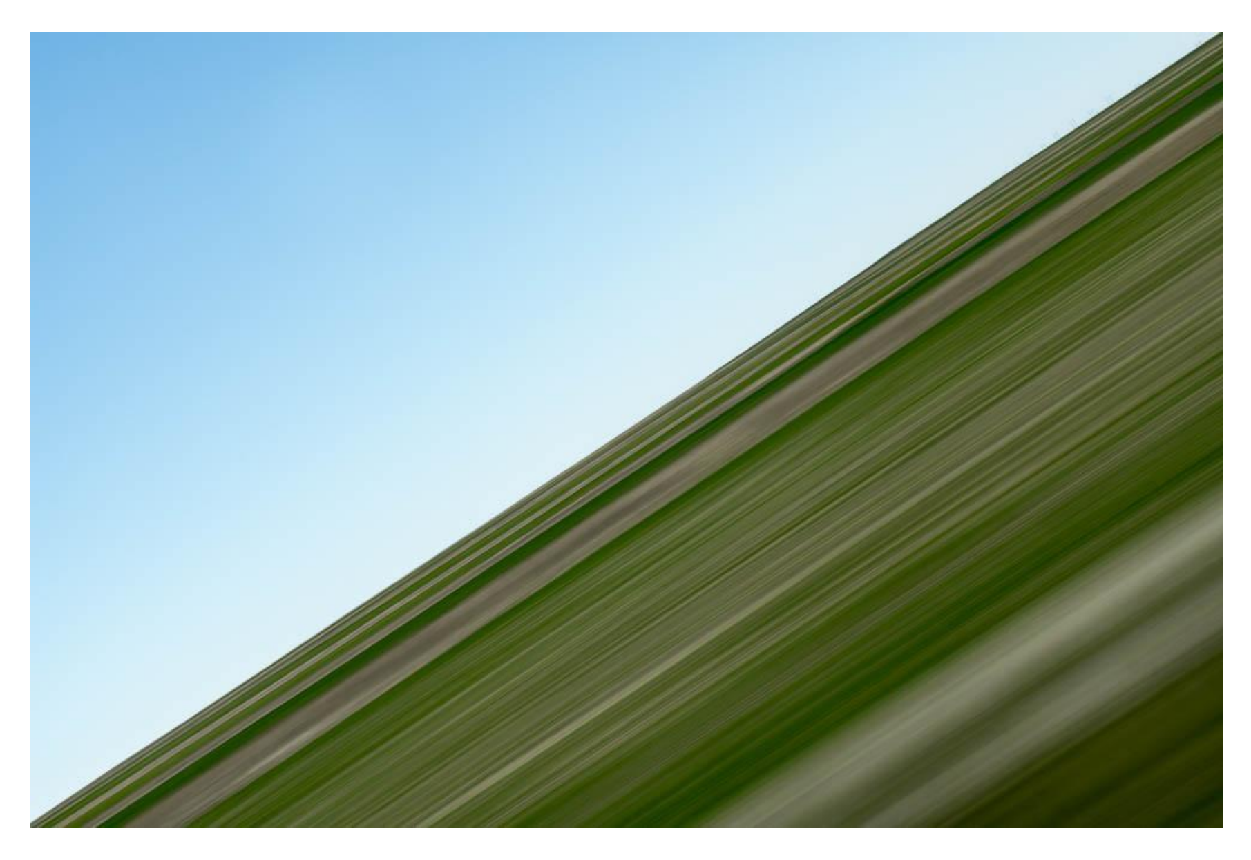
Figure 7: April 22nd, V