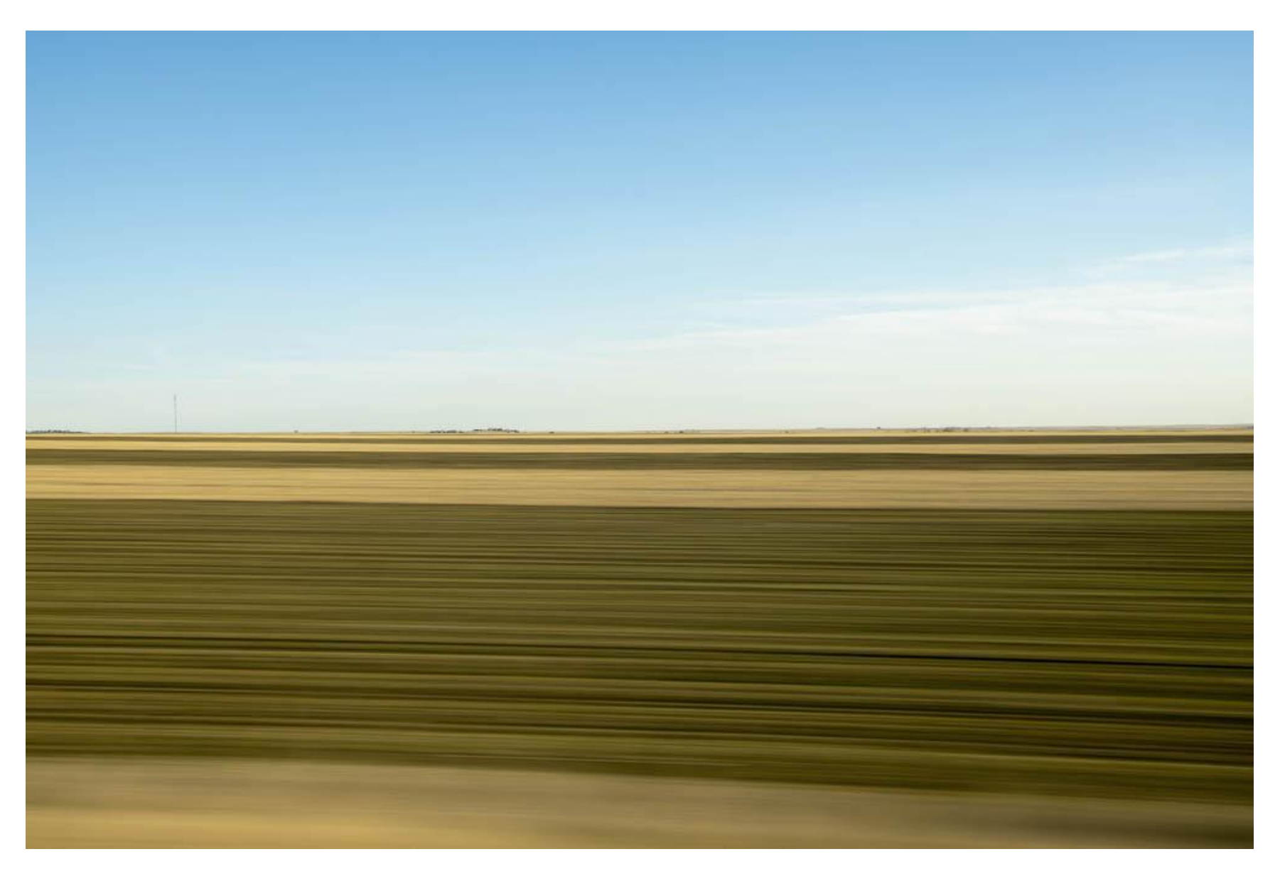
Figure 9: March 7th, III