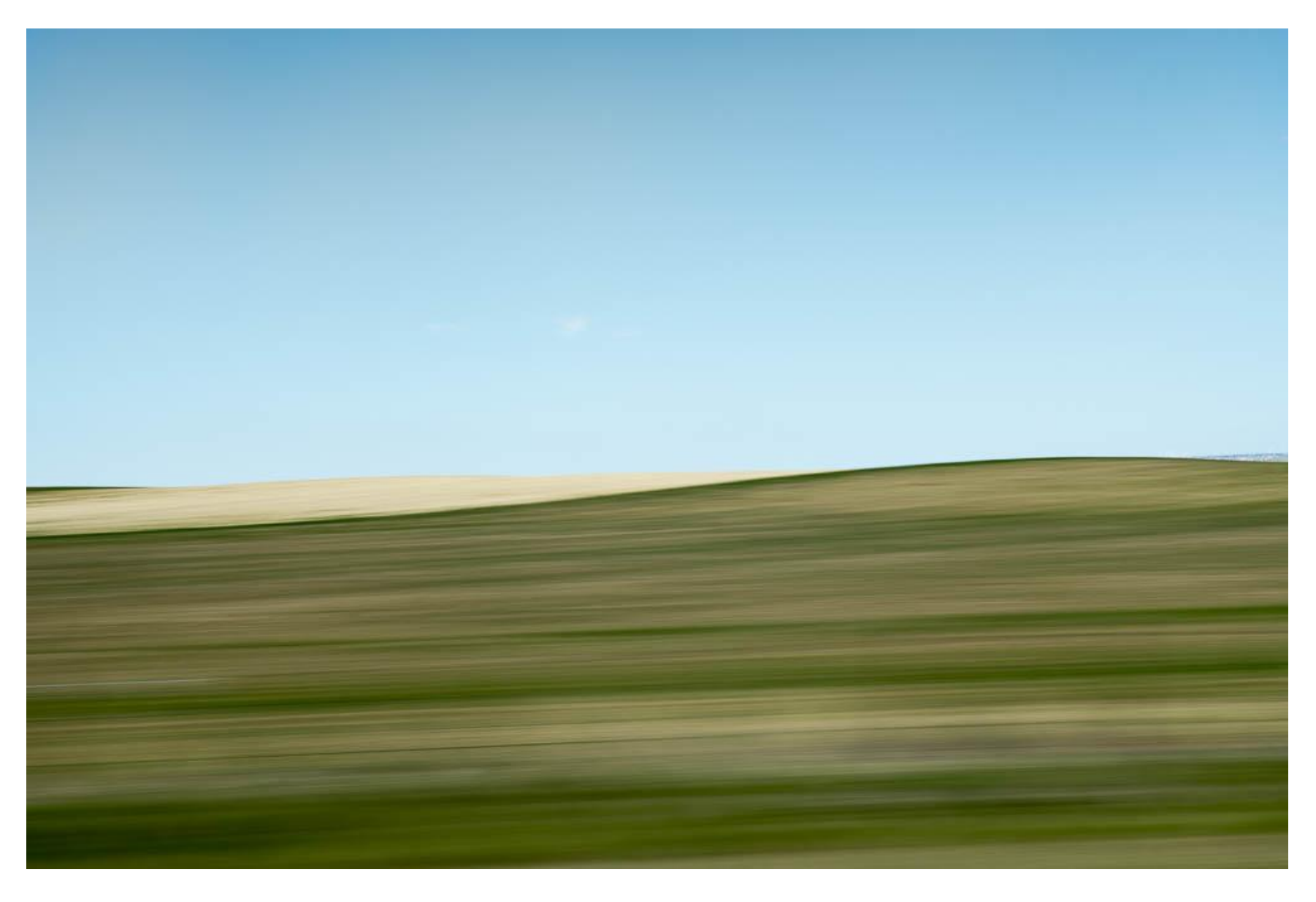
Figure 2: April 22nd, II