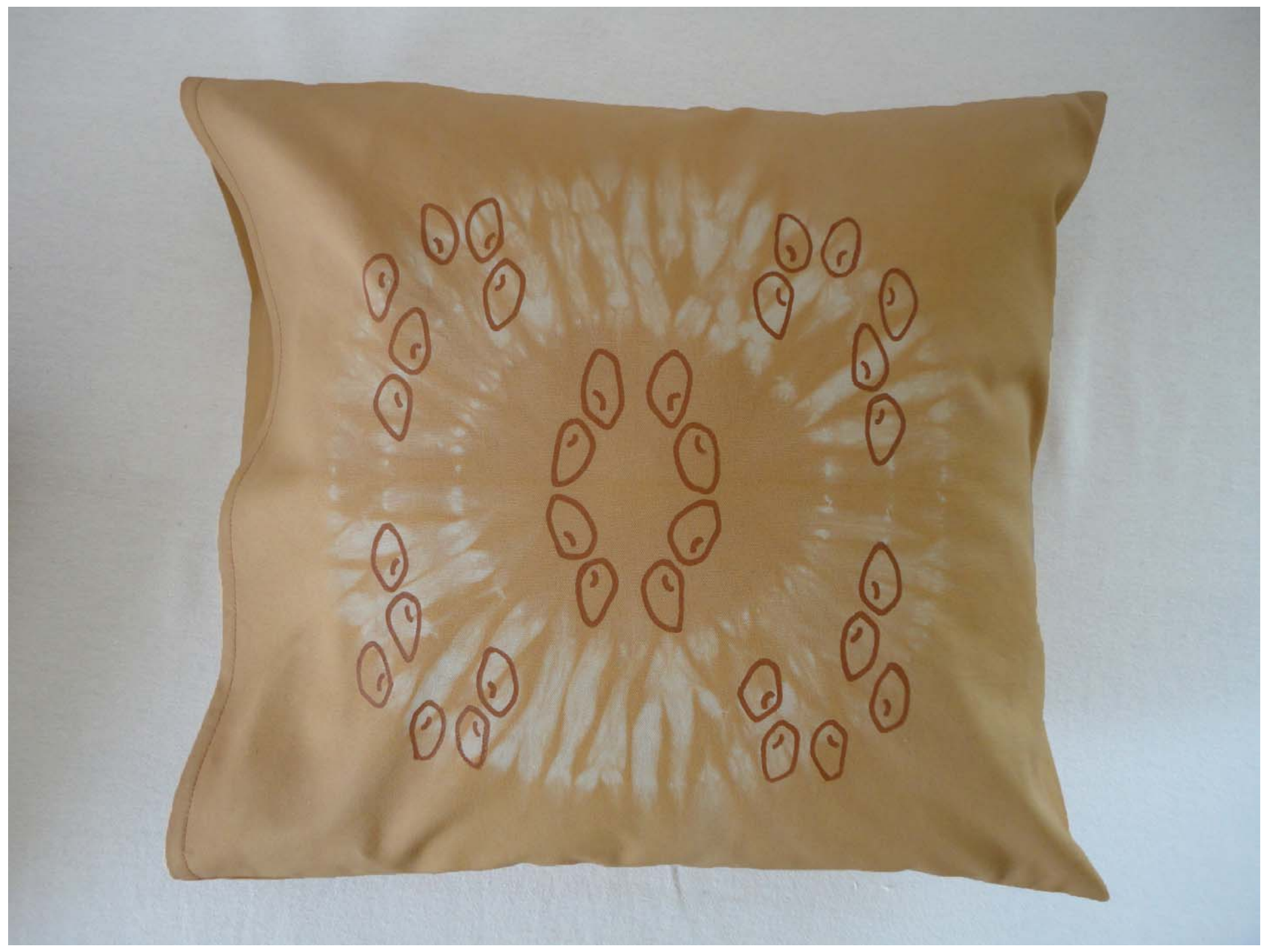
Figure 11: Teosinte Inspiration.