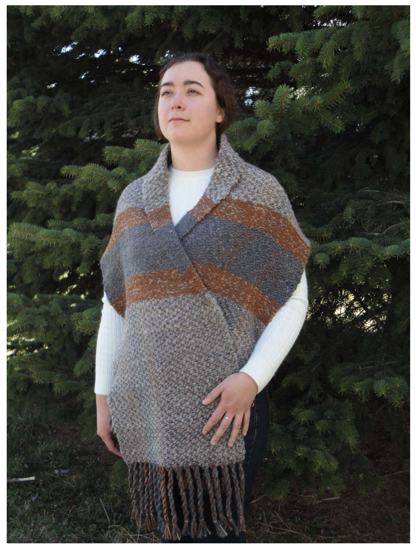
Figure 2: Wabi sabi Wrap.