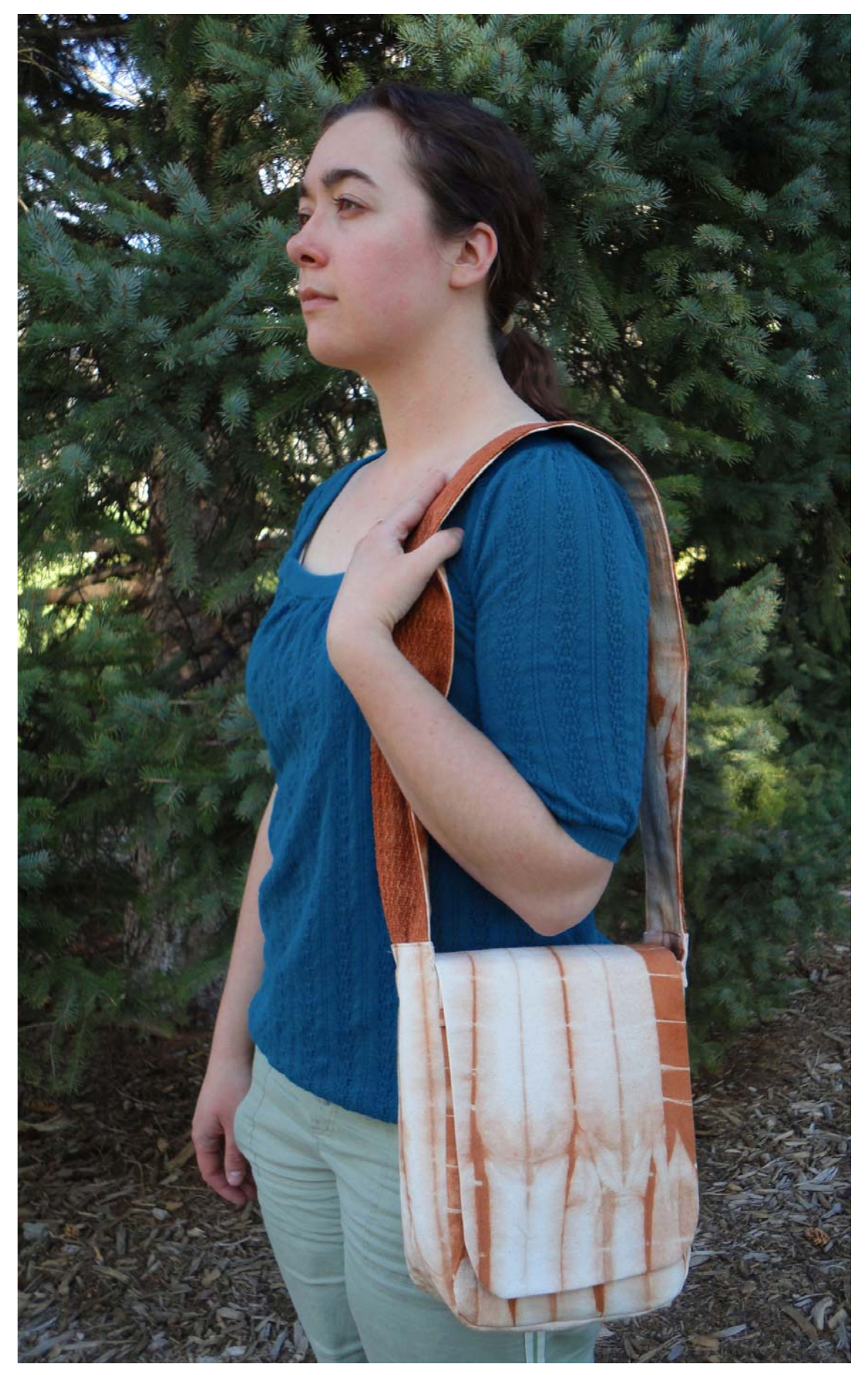
Figure 4: Khair Handbag.