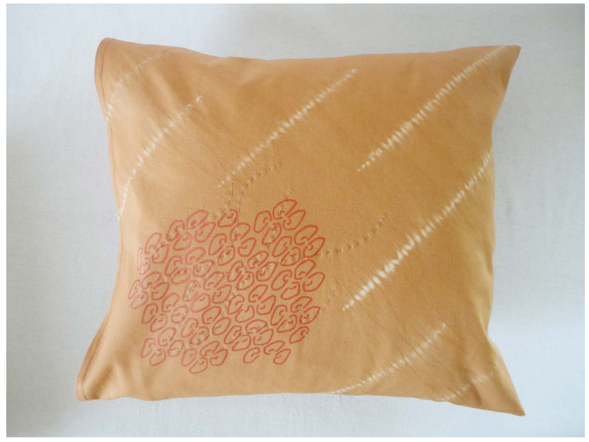
Figure 12: Figure 11: Teosinte Inspiration no. 2.