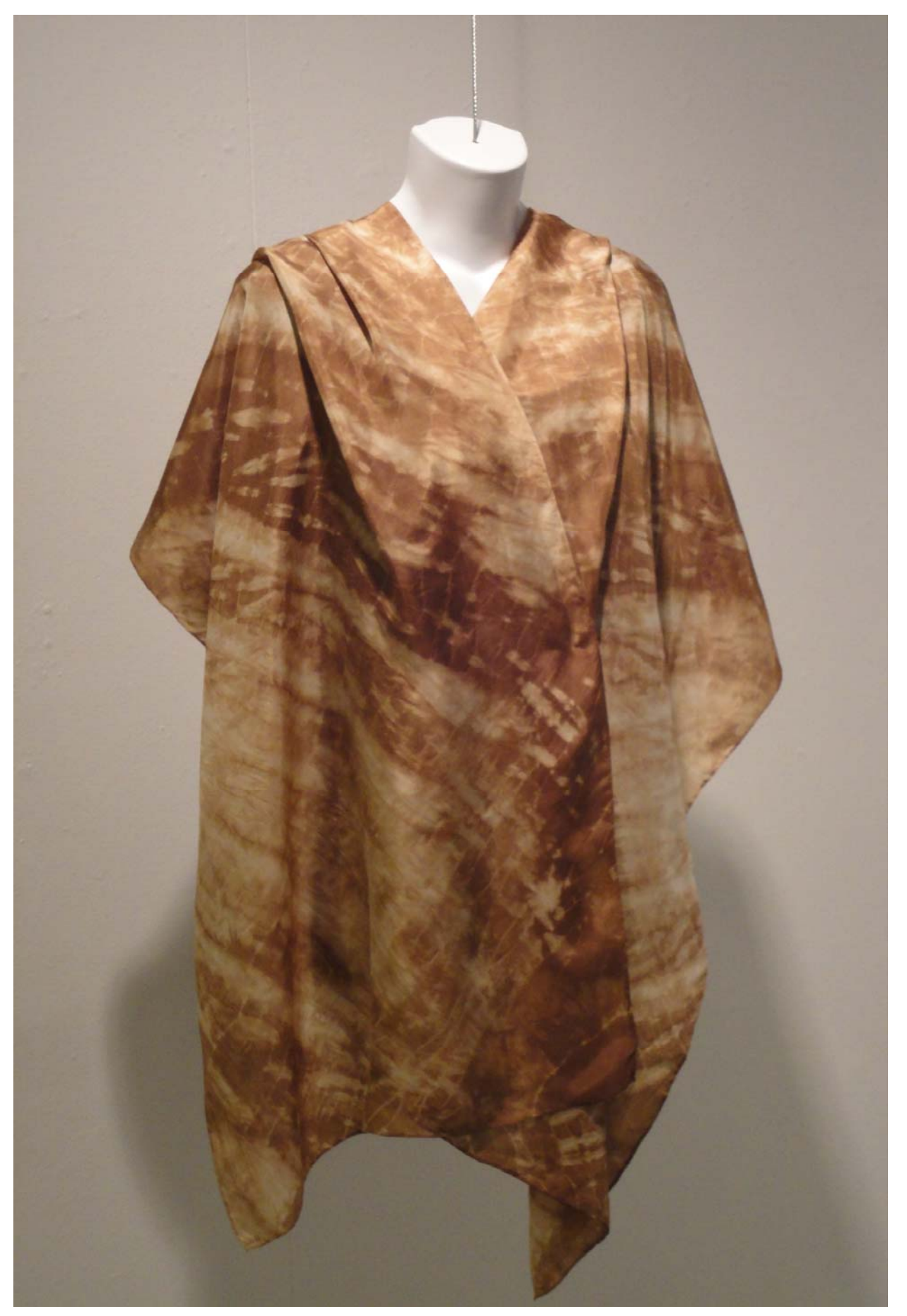
Figure 8: Walnut Silk.