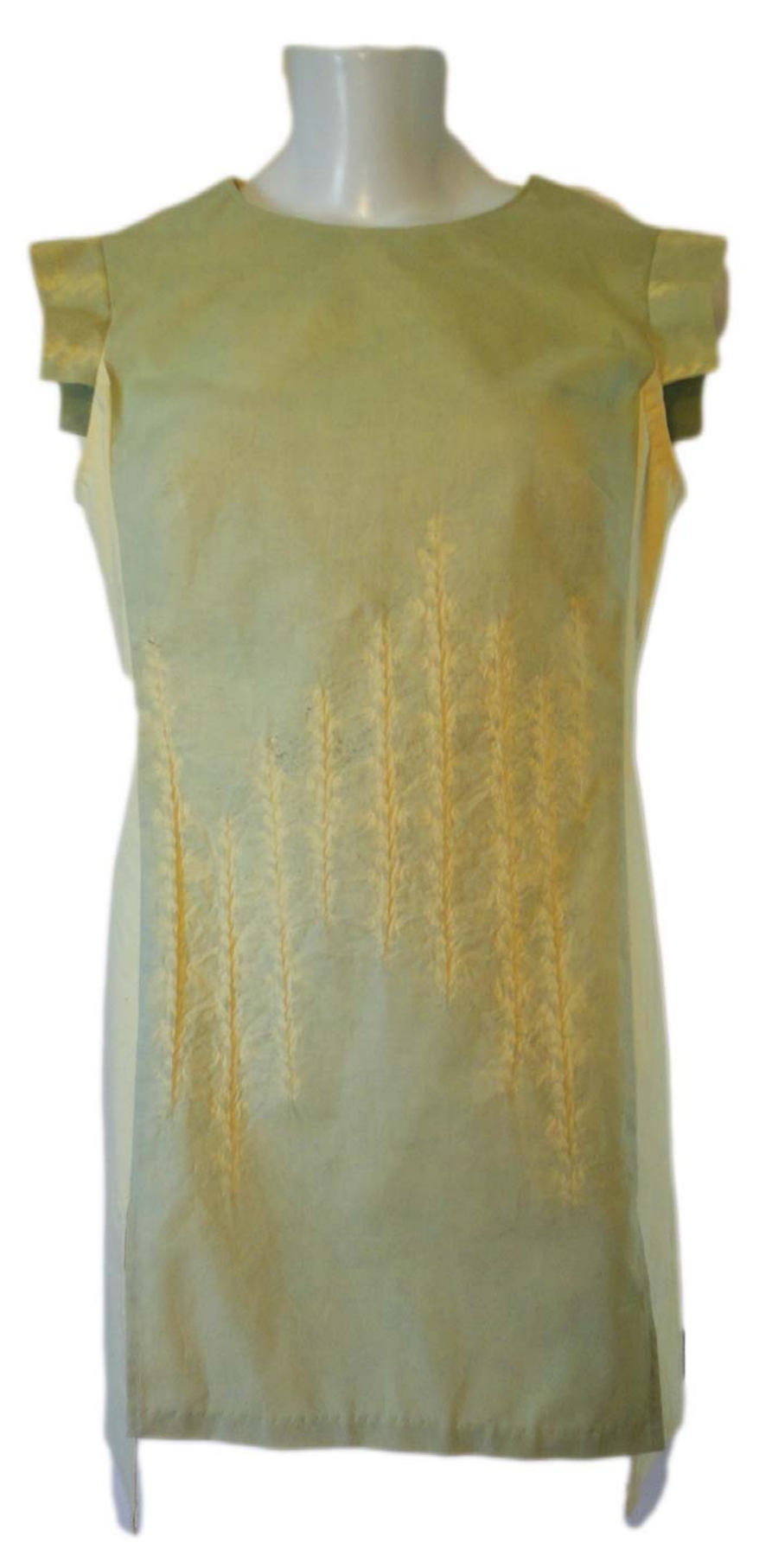
Figure 10: Indigo Maiz.