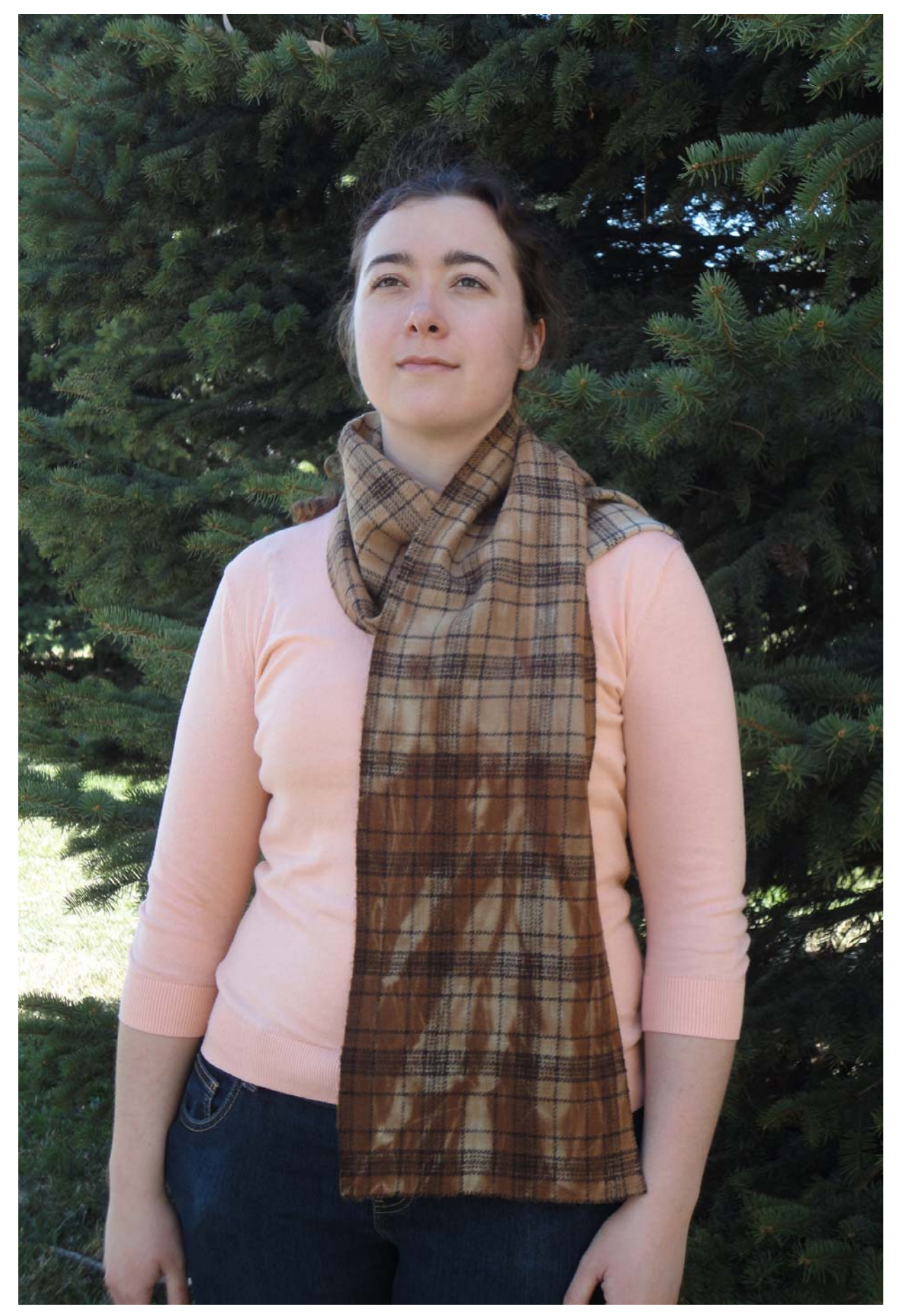
Figure 9: Walnut Wool.