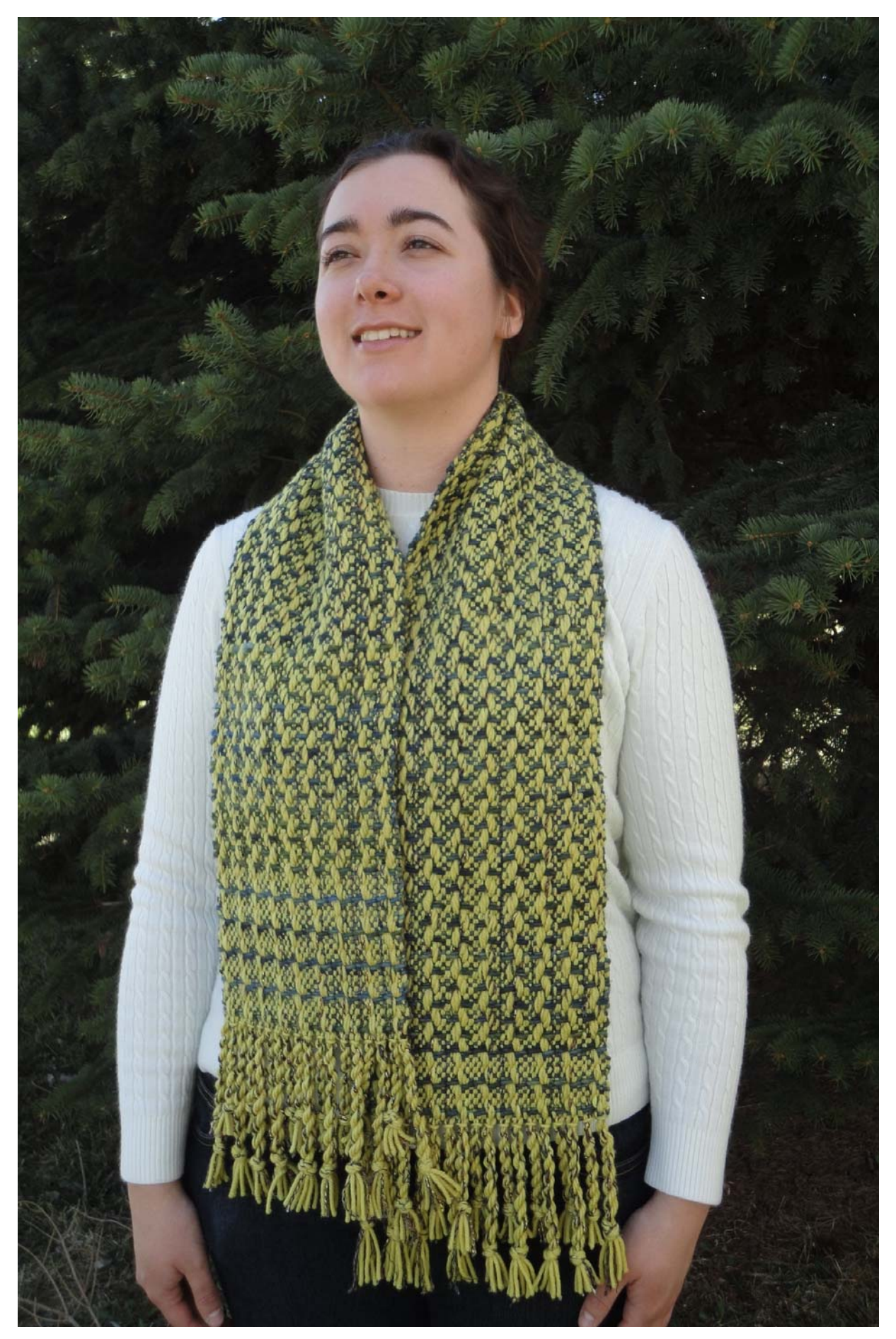
Figure 1: 180 Degrees.