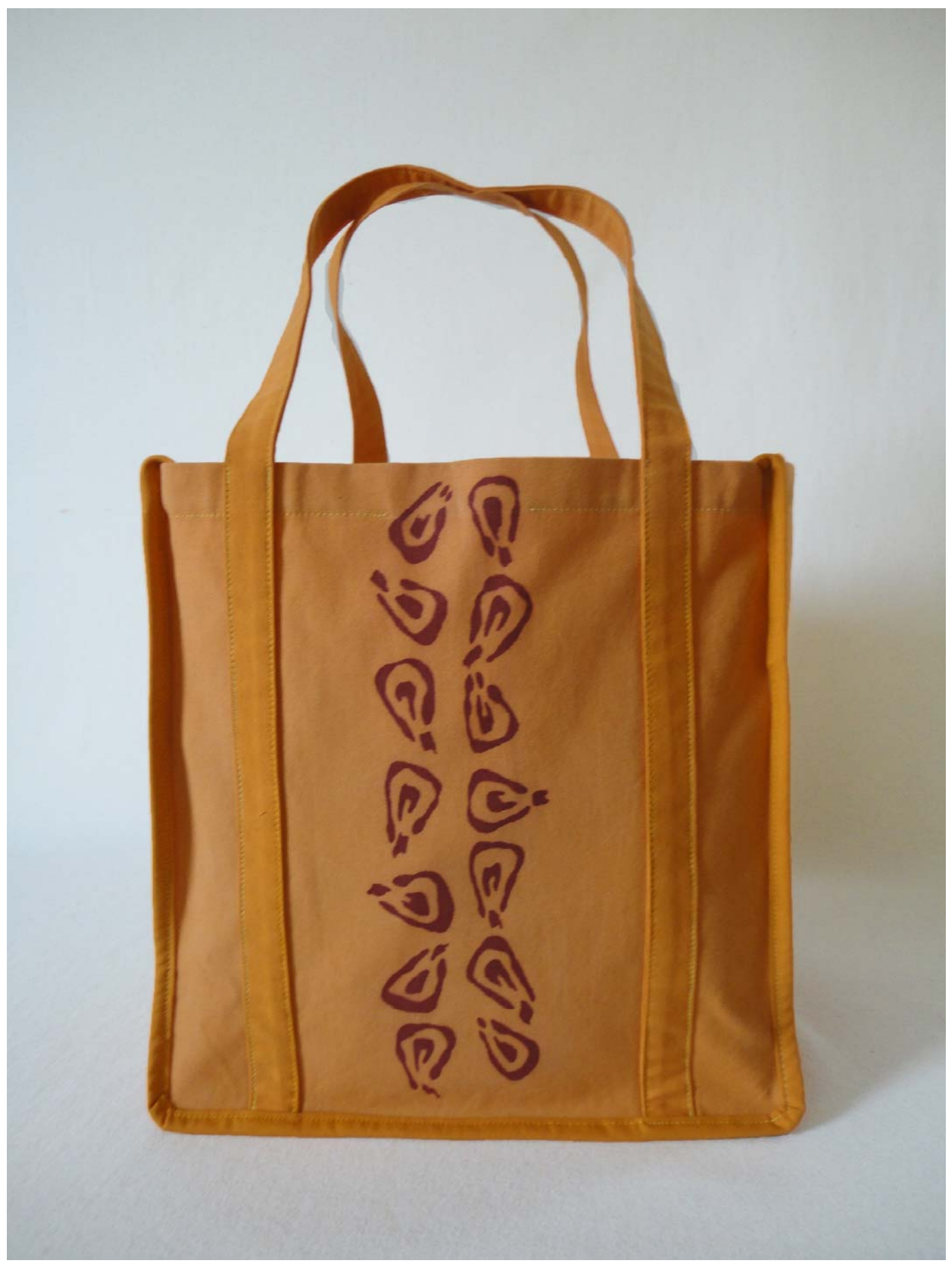
Figure 5: Canvas Tote.