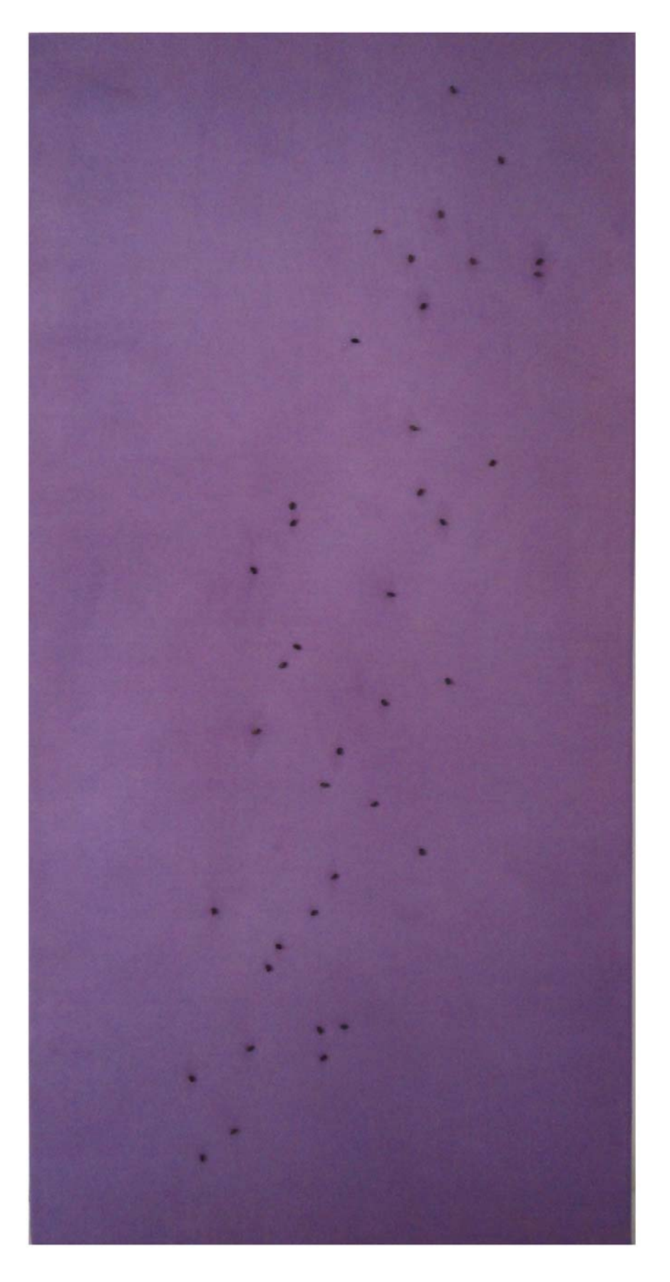
Figure 7: Life Given Life Giving.