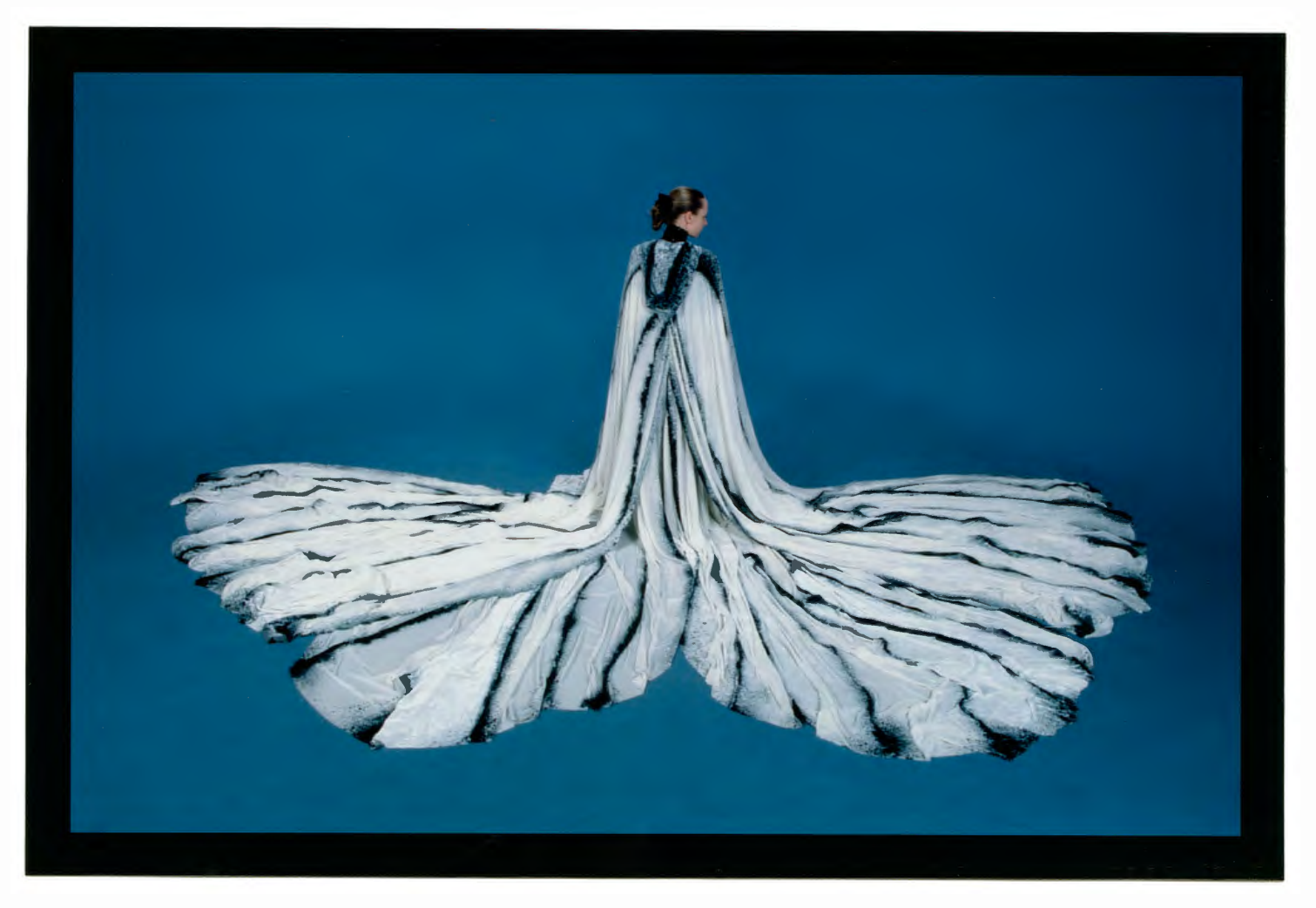
Fig. 2. Butterfly White. Procion Dye on Silk Velvet. 15' Diameter x 5' Height.