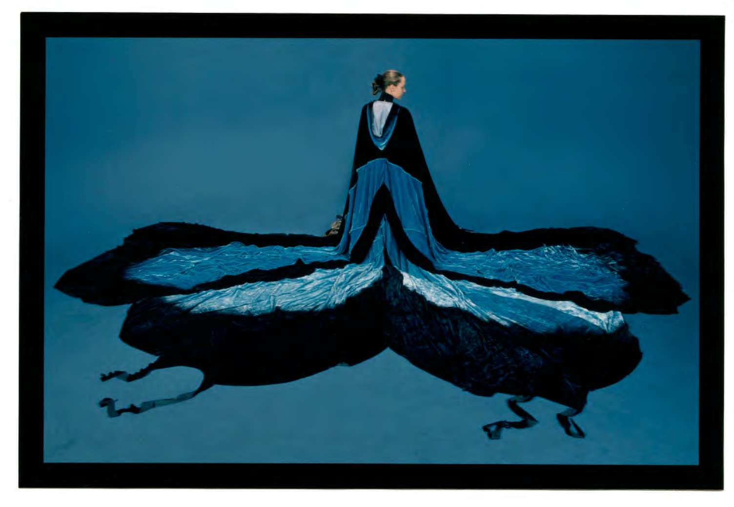
Fig. 3. Butterfly Blue. Procion Dye on Silk Velvet. 15' Diameter x 5' Height.