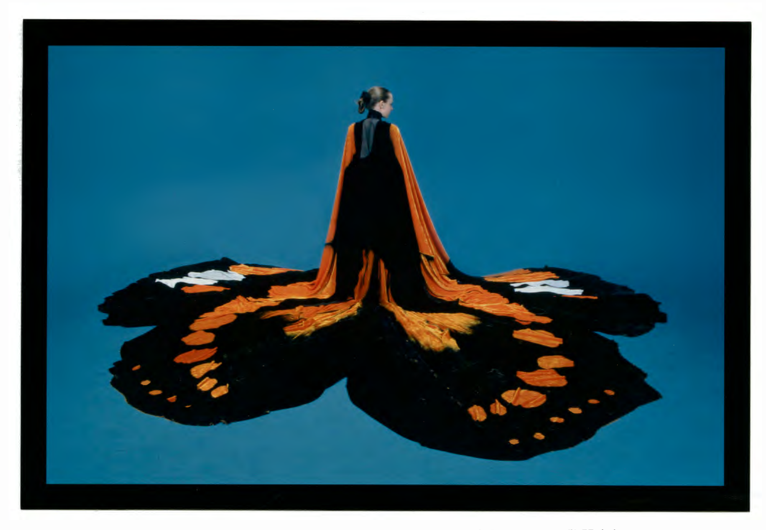
Fig. 1. Butterfly Brown. Procion Dye on Silk Velvet. 15' Diameter x 5' Height.