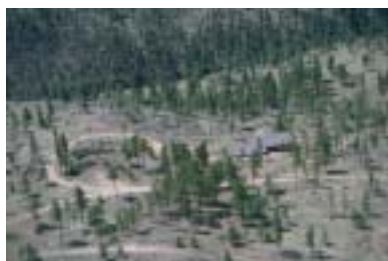
This home is more easily defensible.