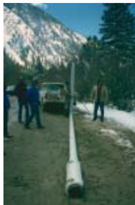
Construction of a dry hydrant system.

community water system. Cooperation with your neighbors can result in the development of a common emergency water storage facility to provide protection, not only for your home but for others. Finally, as a last resort, you may need to develop your own well.