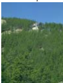
A disaster waiting to happen.

Your first defense against wildfire is to create and maintain a defensible space around your home. This does not mean your landscape must be barren. A defensible space is an area, either man-made or natural, where the vegetation is modified to slow the rate and intensity of an advancing wildfire. It also creates an area where fire suppression operations can occur and helps protect the forest from a structure fire.