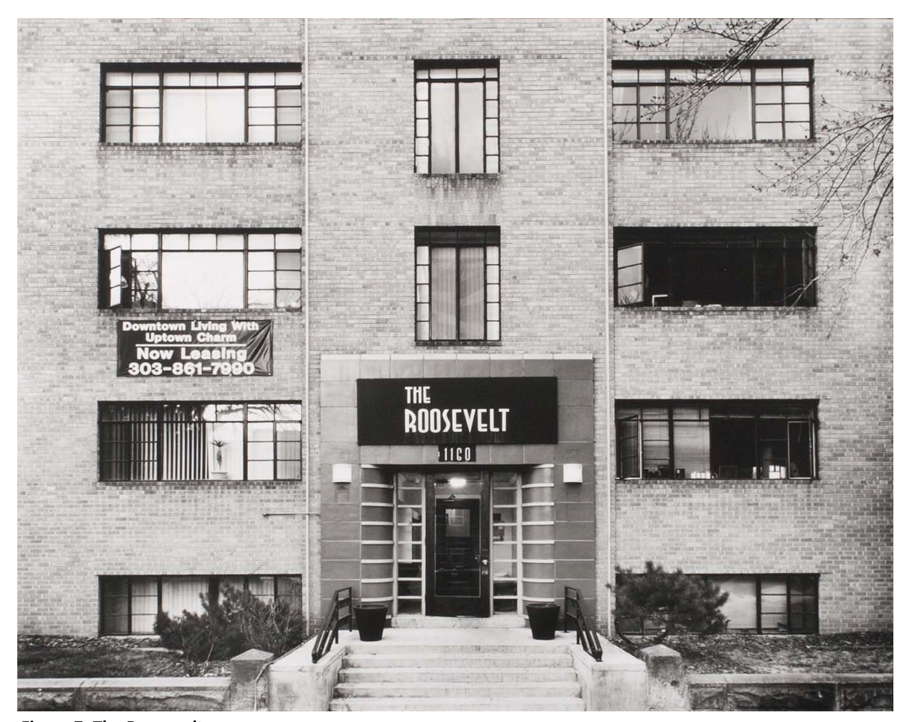
Figure 7: The Roosevelt.