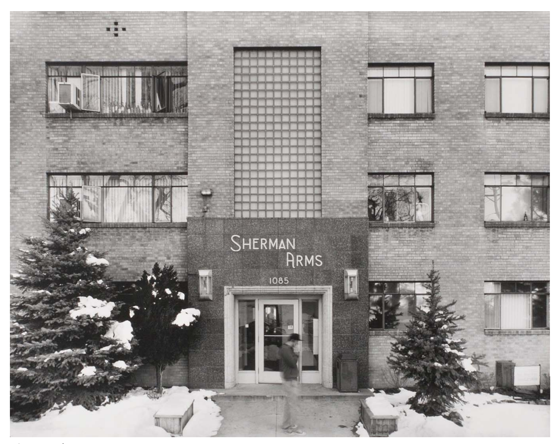
Figure 3: Sherman Arms.