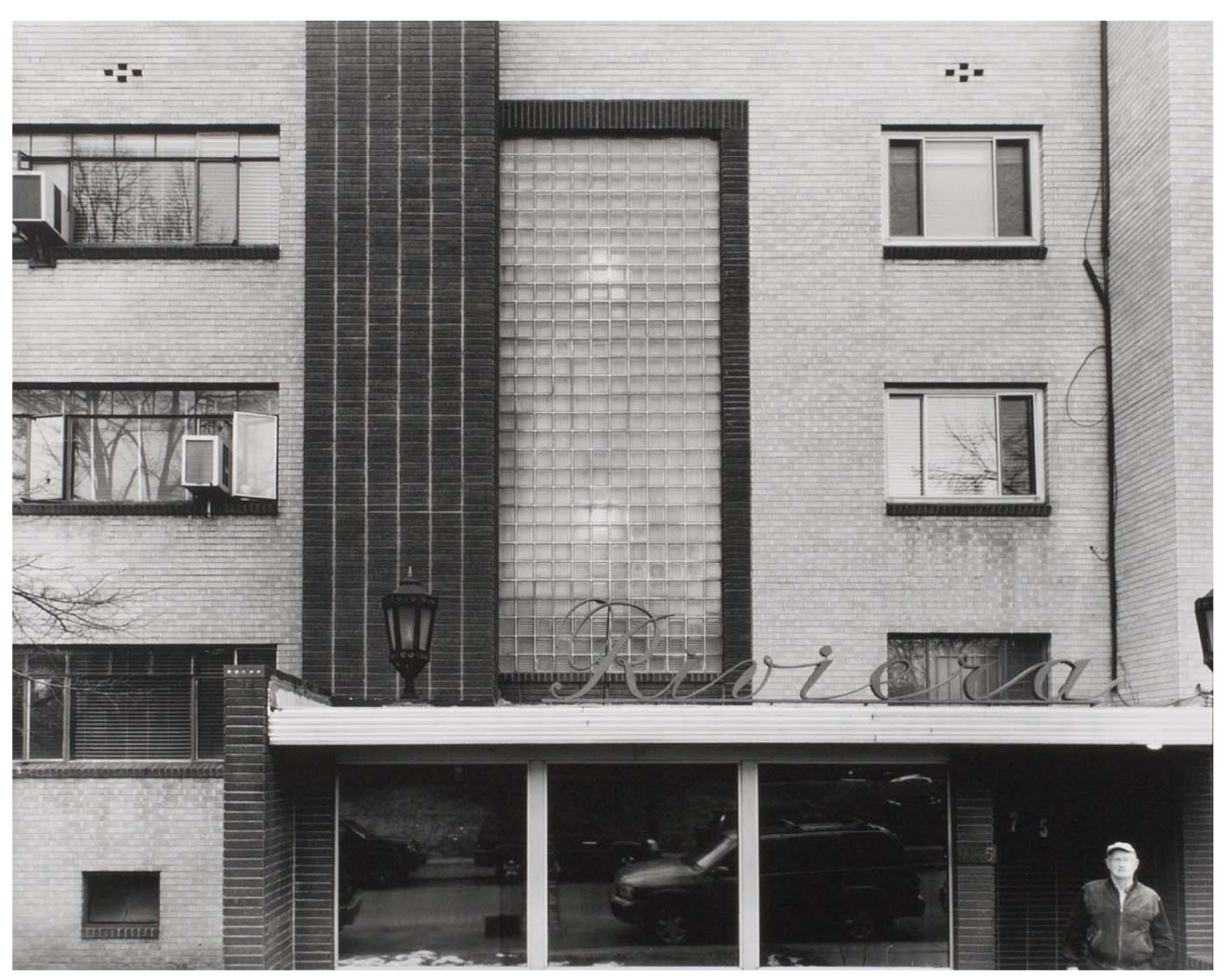
Figure 2: Riviera.