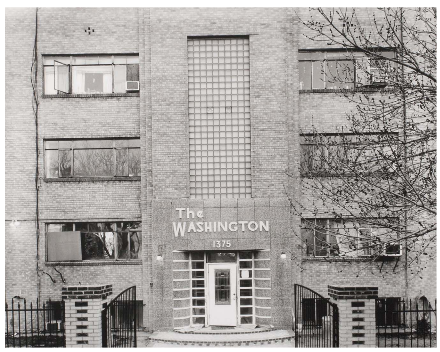
Figure 8: The Washington.