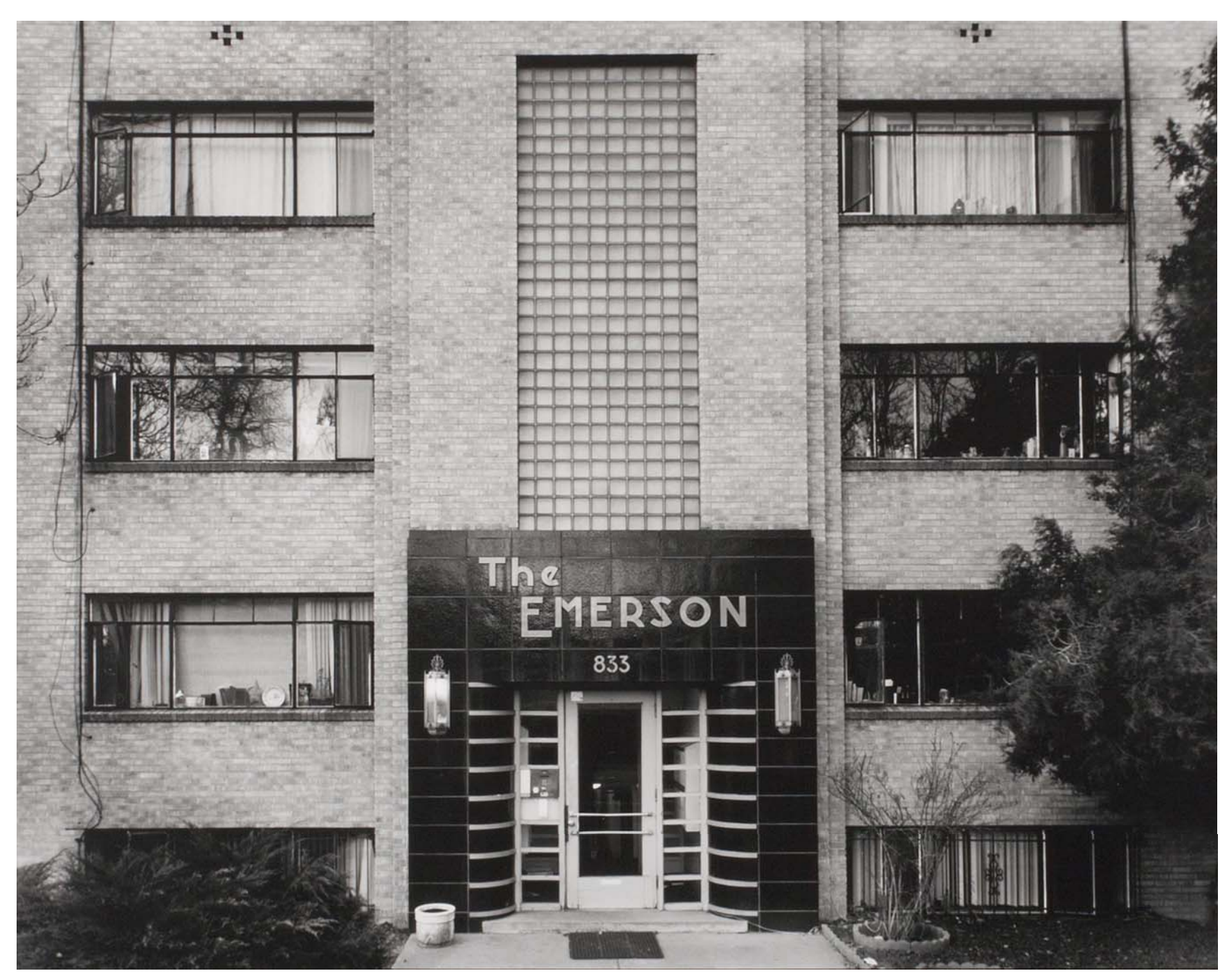
Figure 4: The Emerson.