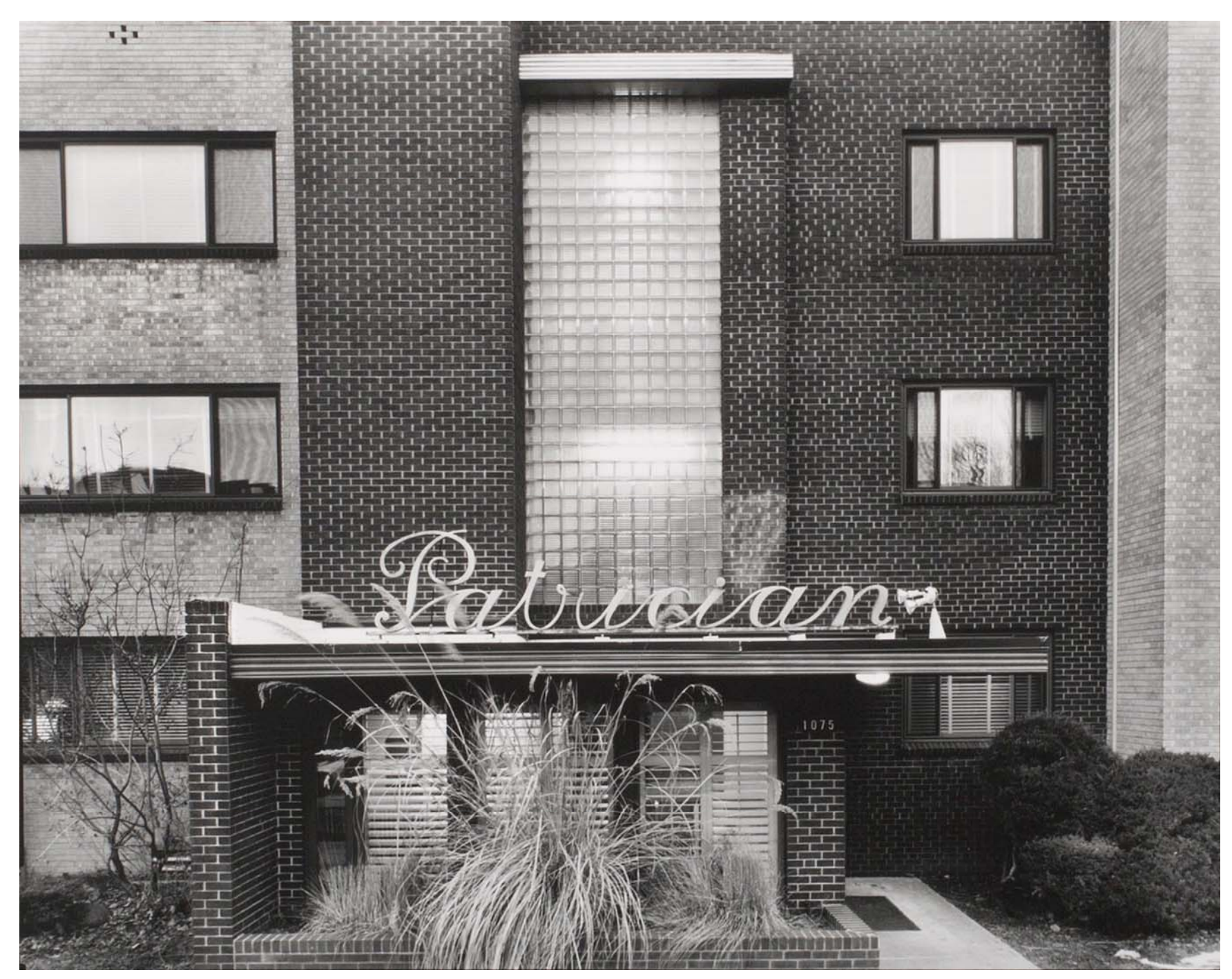
Figure 1: Patrician.