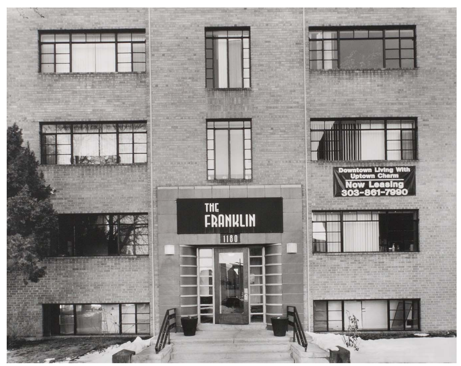
Figure 5: The Franklin.