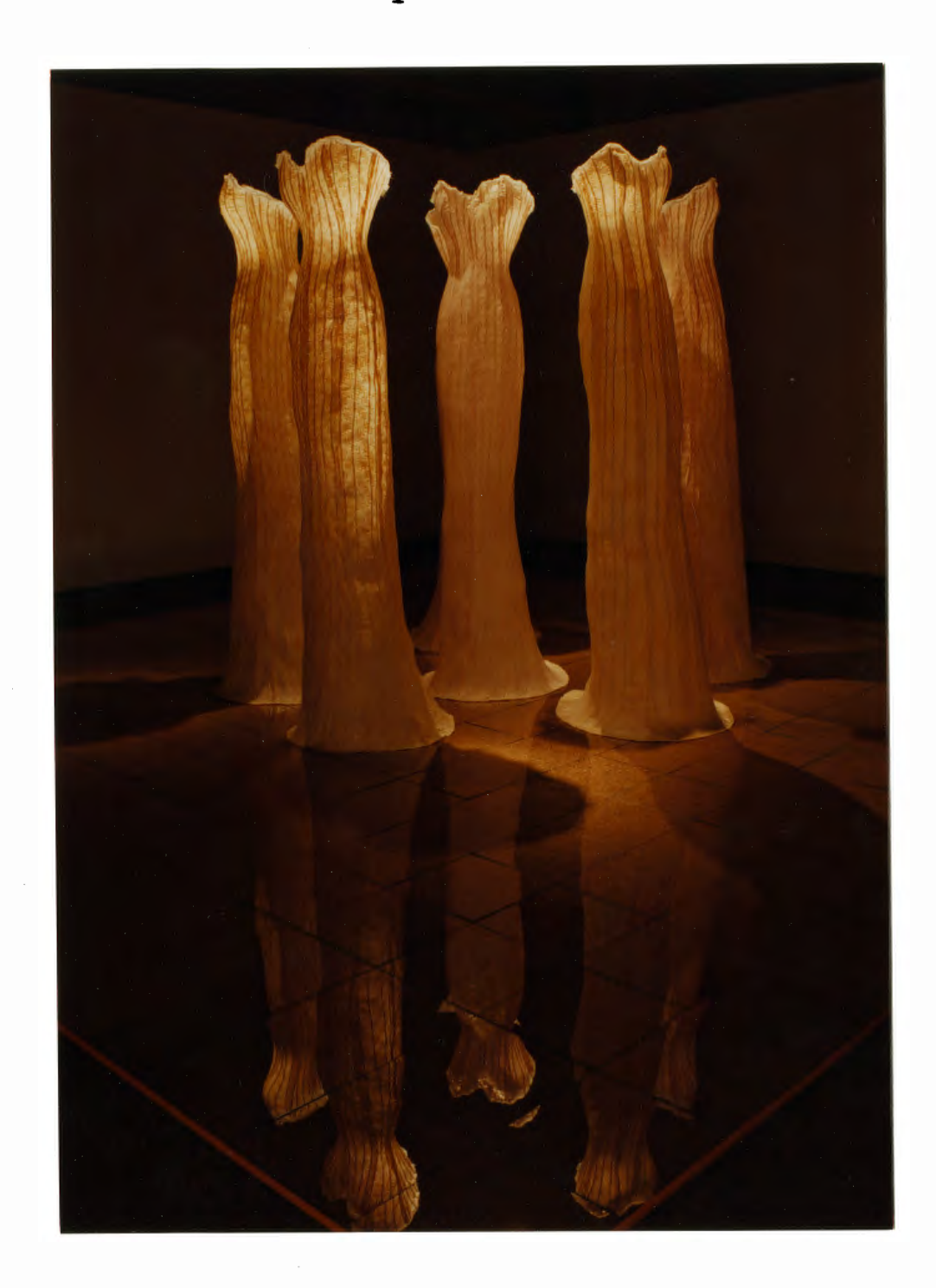
Plate I. <u>Masquerade</u> view of installation Mixed media consisting of crinoline, pigment, wire in dresses Floor is earth, plywood, glass tiles measuring 12" each 16' x 16' square