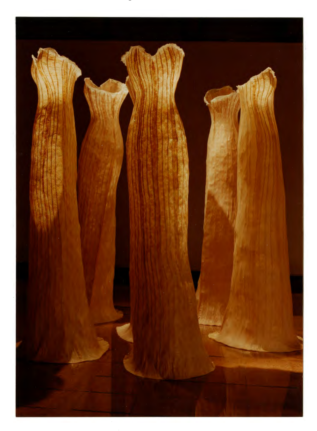
Plate III. Masquerade view of dress Crinoline, wire, pigment 7'4" tall