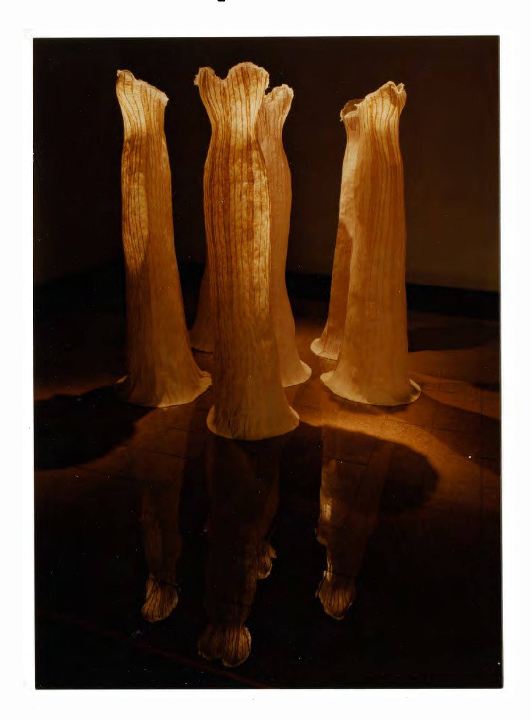
Plate II. \underline{\text{Masquerade}} view of installation \underline{\text{16'}} x \underline{\text{16'}} square