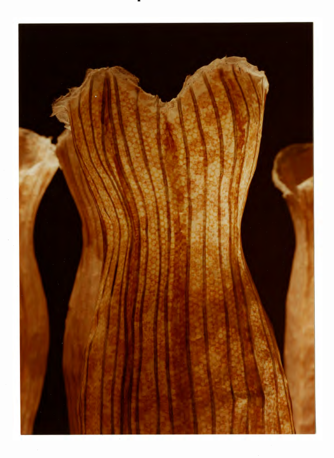
Plate IV. Masquerade view of dress Crinoline, wire, pigment 7'4" tall, 40" at top edge, 30" waist, 42" hip