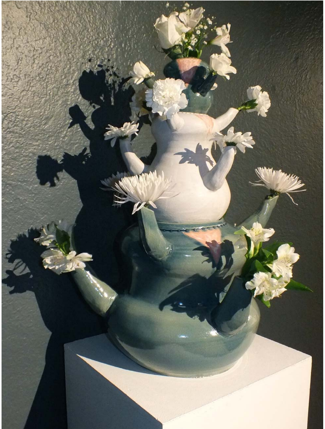
Figure 7: Large Three Part Stacked Vase (Installed)