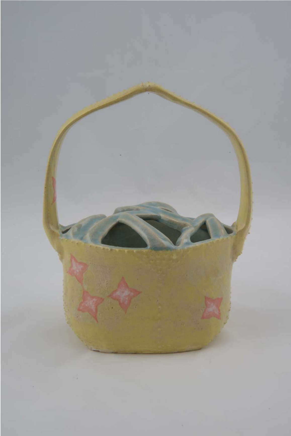
Figure 1: Flower Basket.