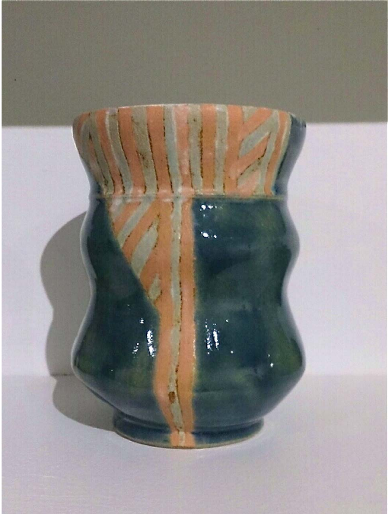
Figure 8: Cup (Installed).