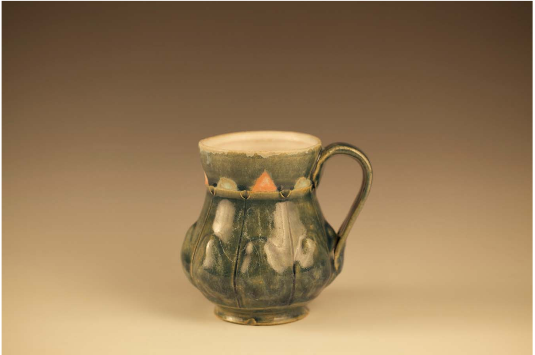
Figure 6: Cup.