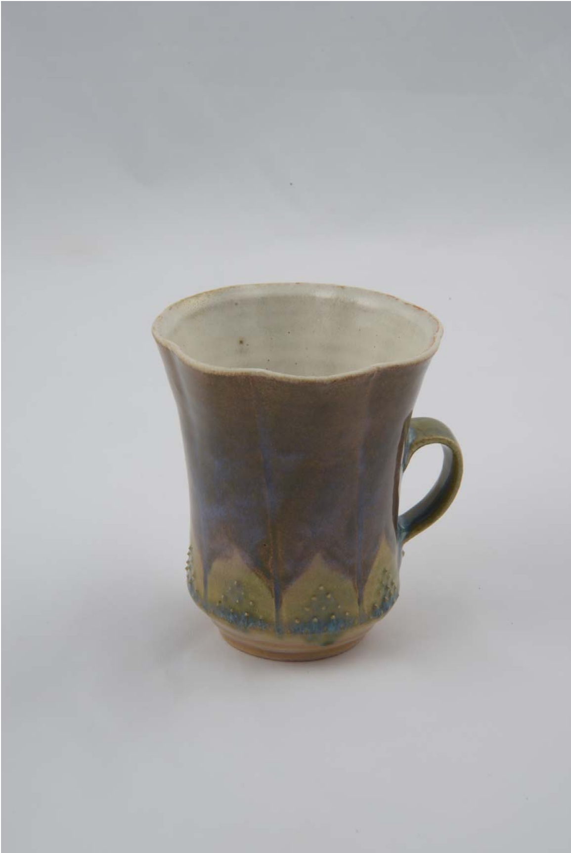
Figure 3: Cup.