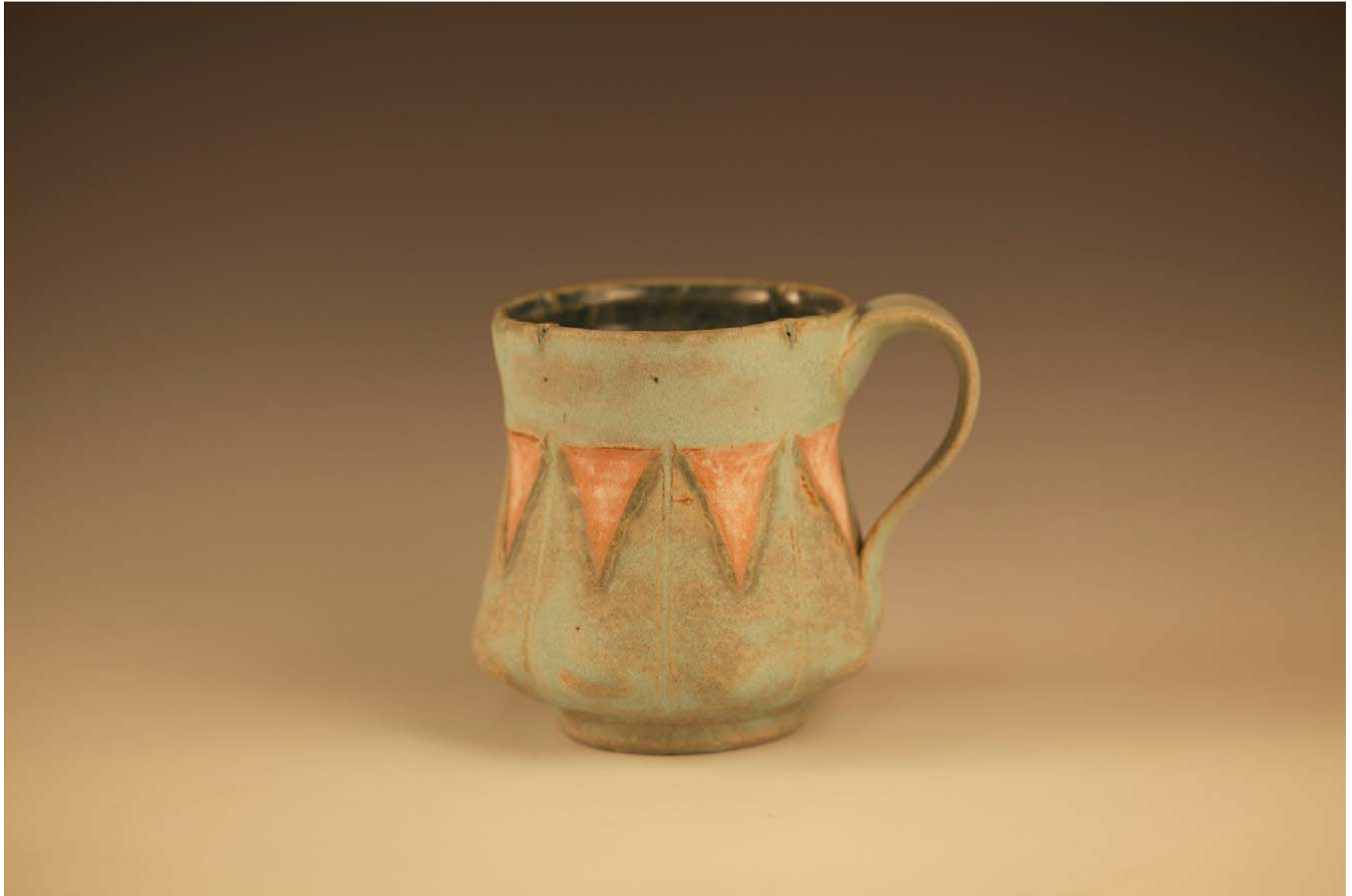
Figure 5: Cup.