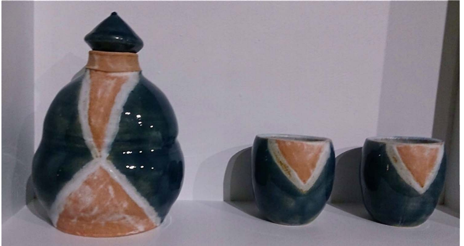
Figure 9: Liquor Set (Installed).