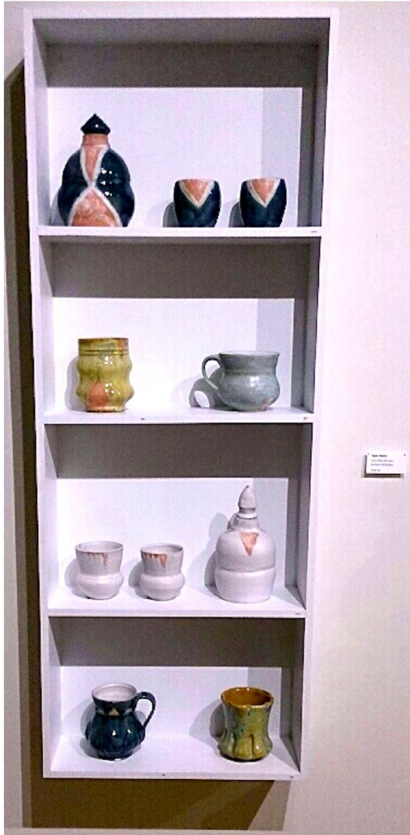
Figure 11: Liquor and Cup Cabinet (Installed).