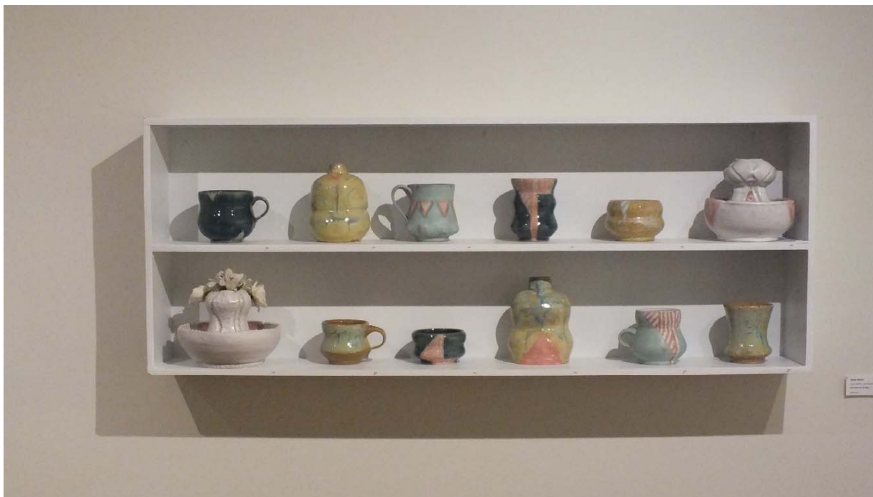
Figure 12: Cup and Bottle Cabinet (Installed).