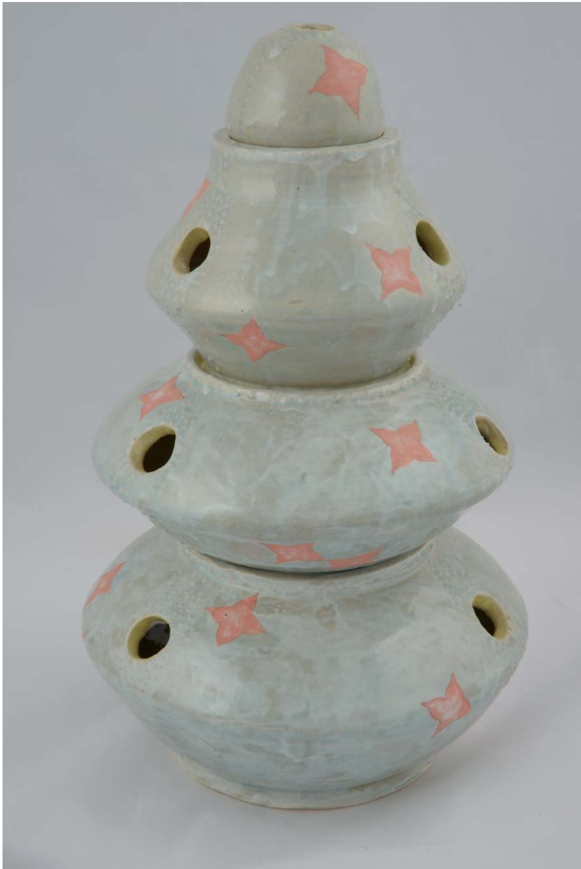
Figure 2: Medium Four Par Stacked Vase.