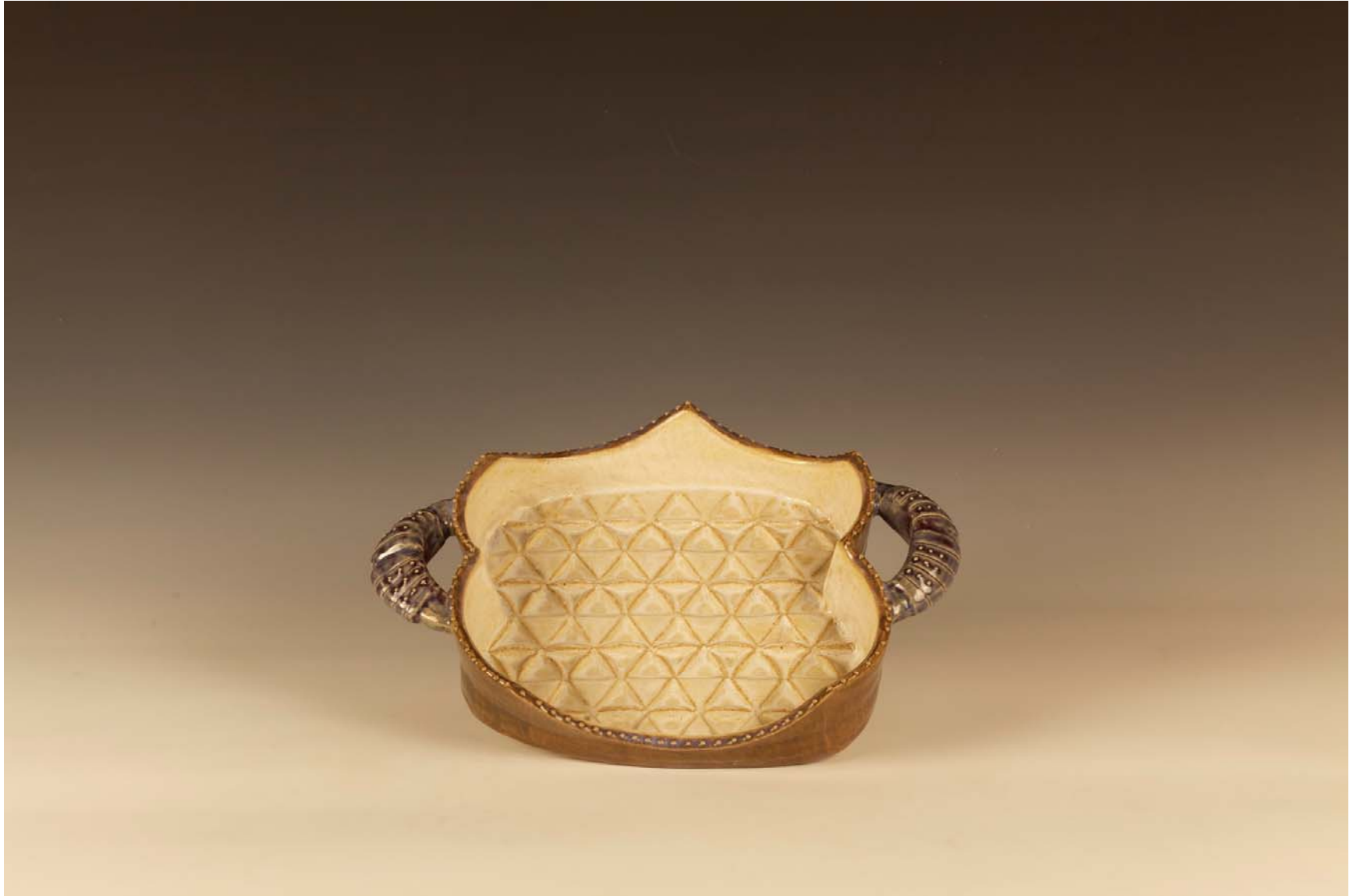
Figure 4: Tray.