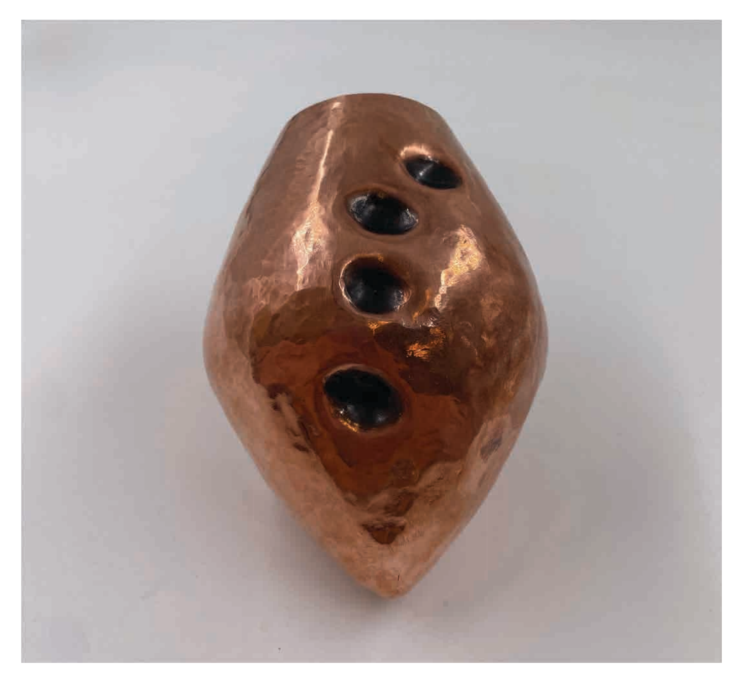
Figure 15: Impressions