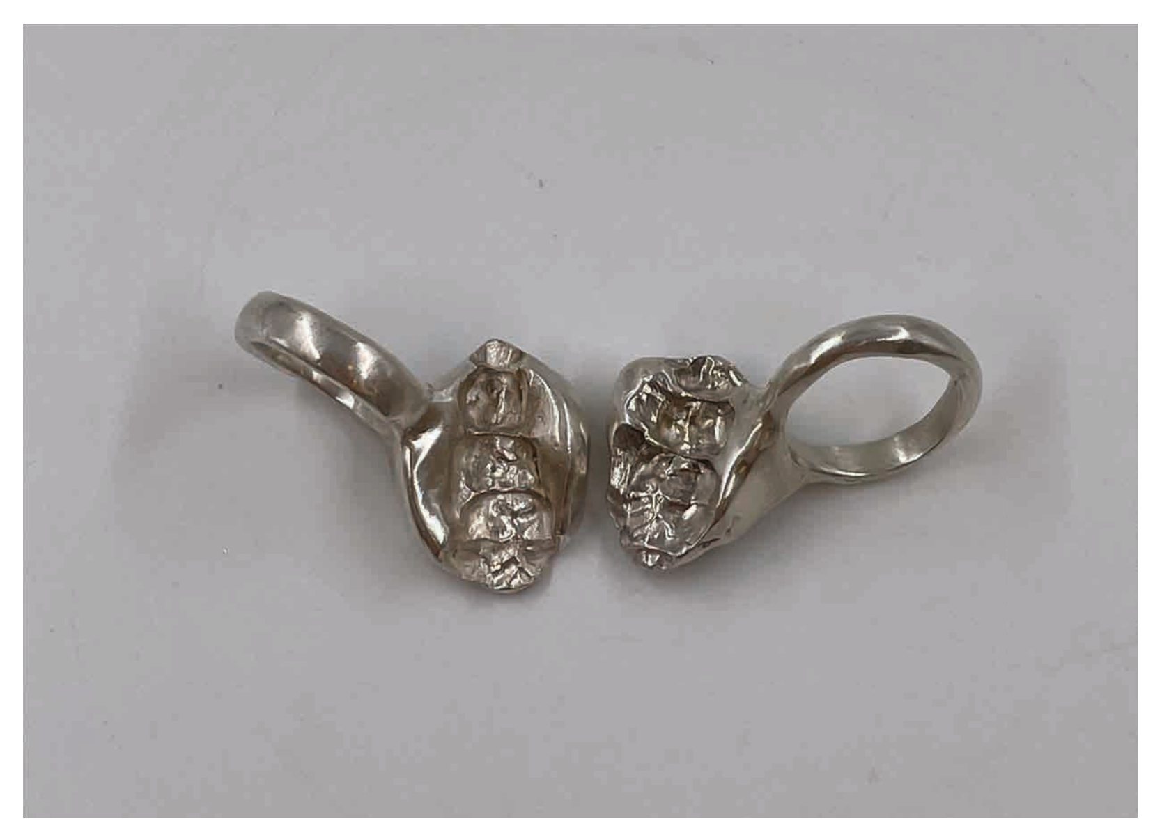
Figure 7: Holding Close Series - Bite