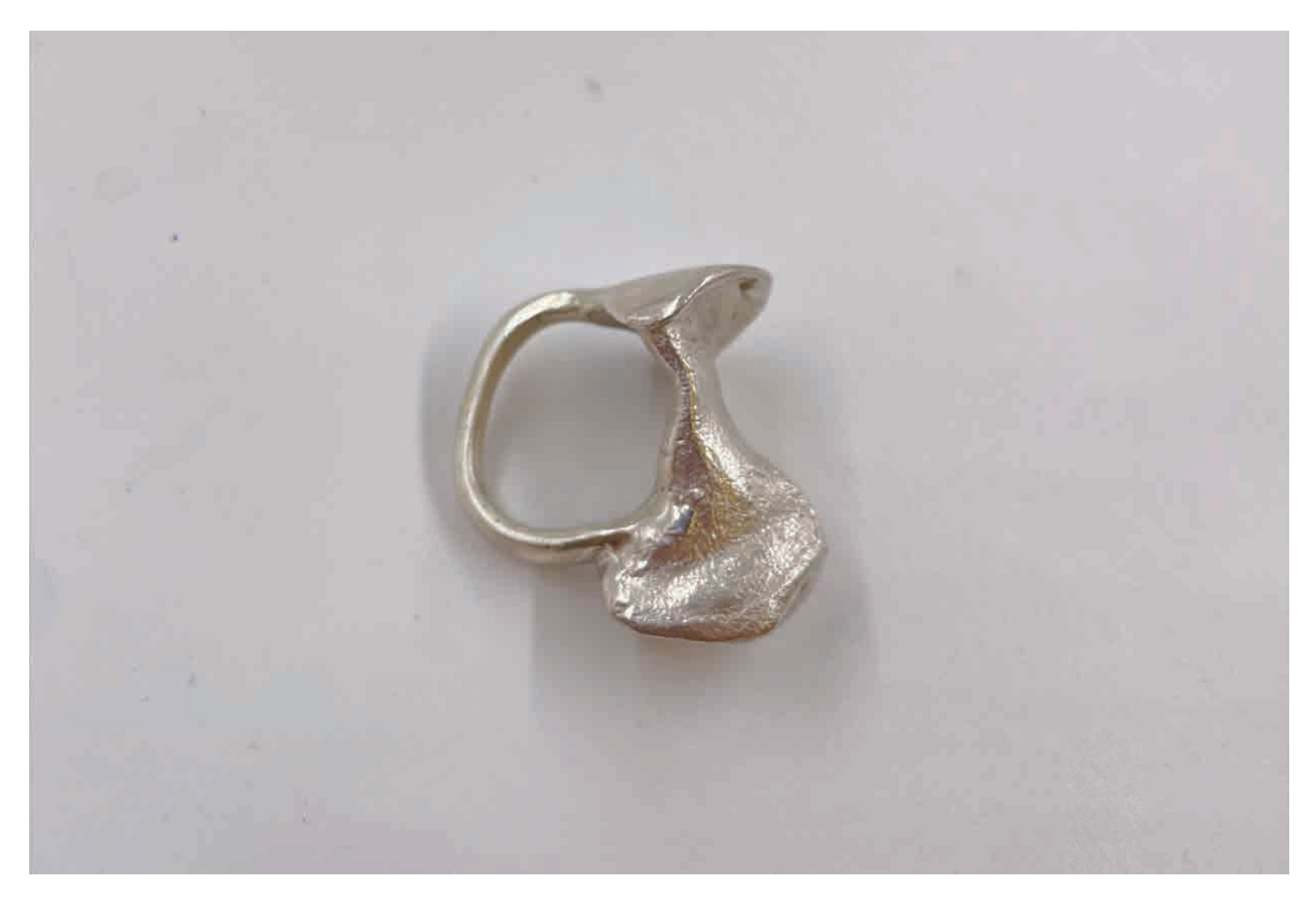
Figure 9: Holding Close Series - Squeeze