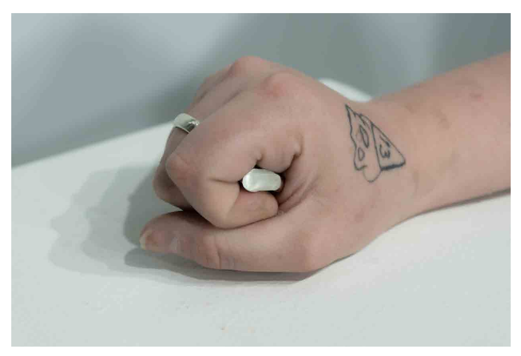
Figure 5: Holding Close Series - Clenched, worn