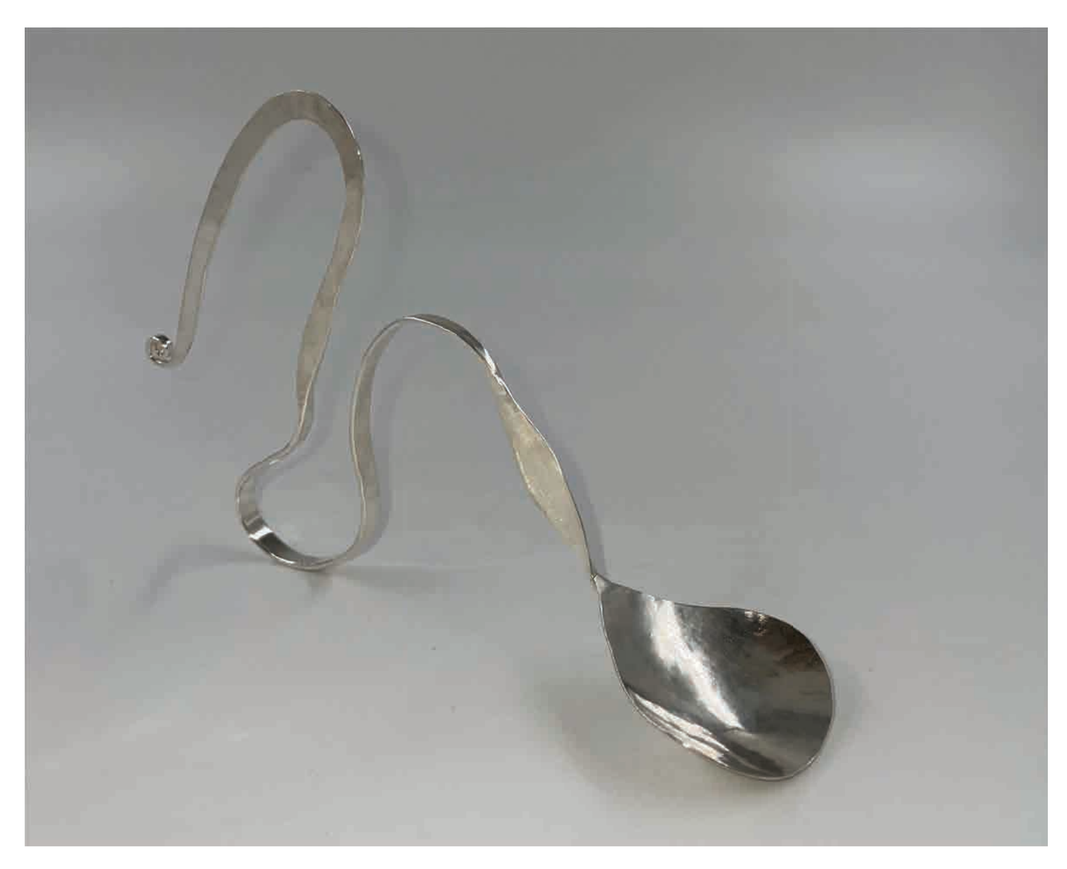
Figure 21: Wrapped