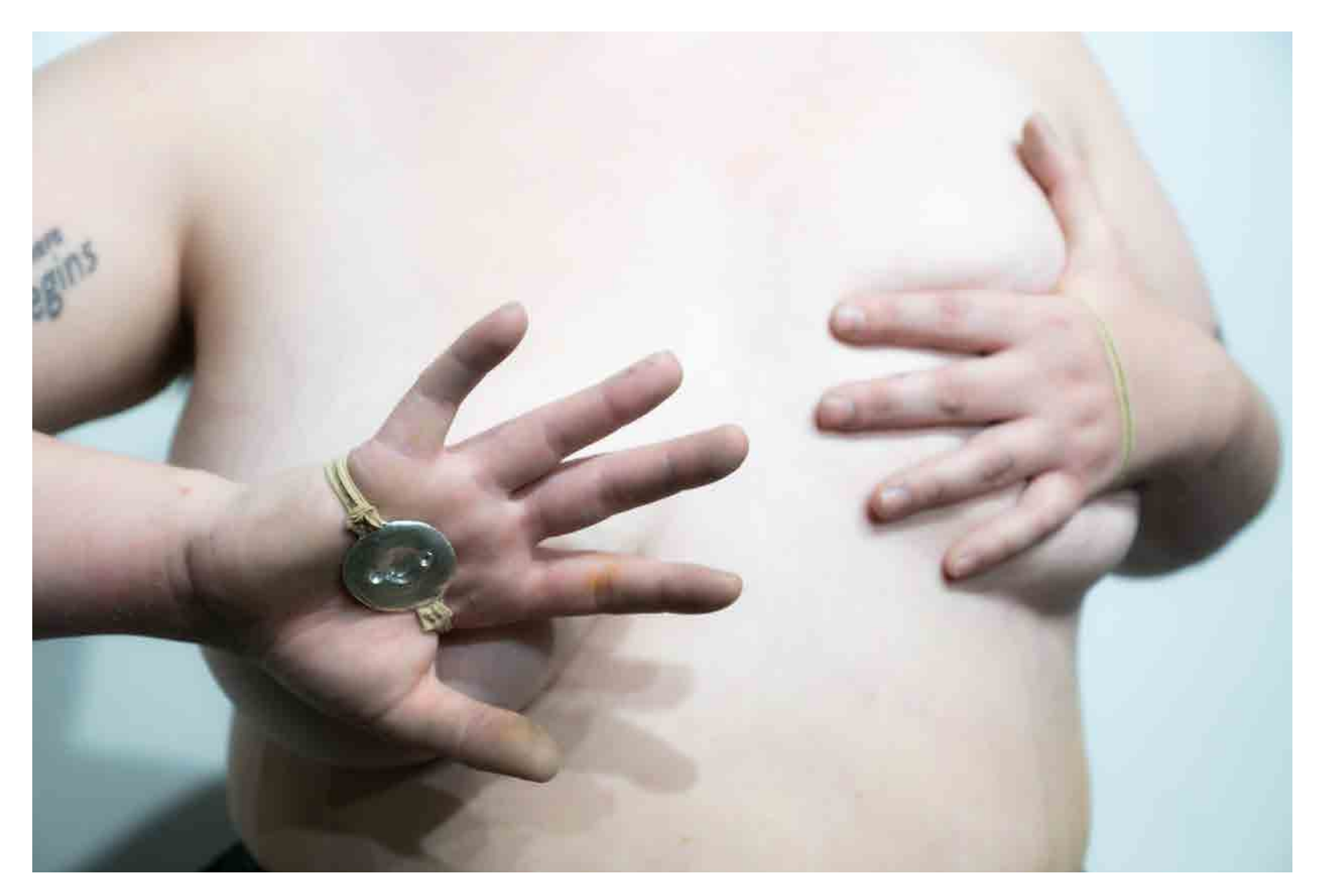
Figure 19: Bound, worn