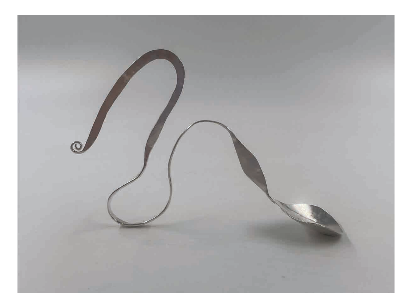
Figure 23: Wrapped, detail