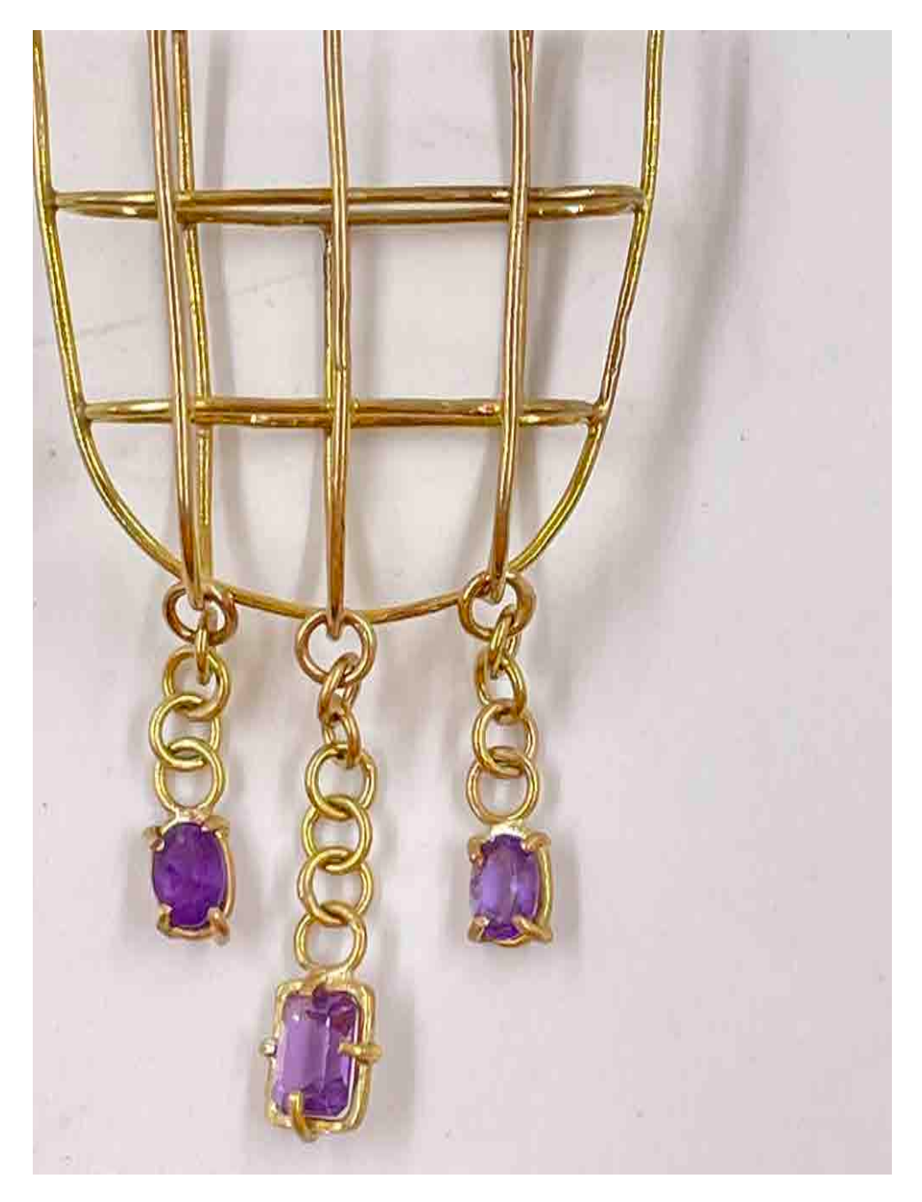
Figure 3: Traditions, detail