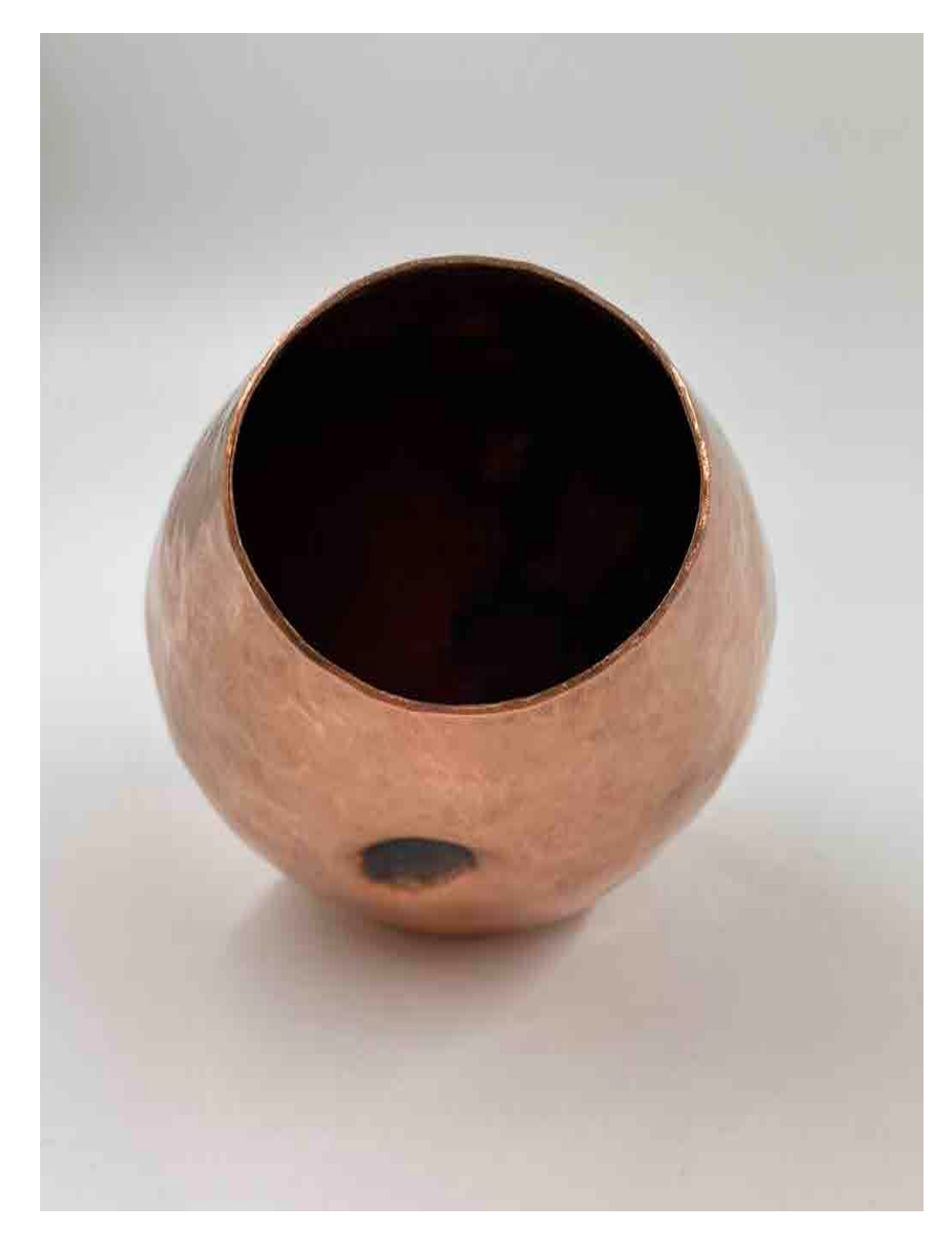
Figure 17: Impressions, detail