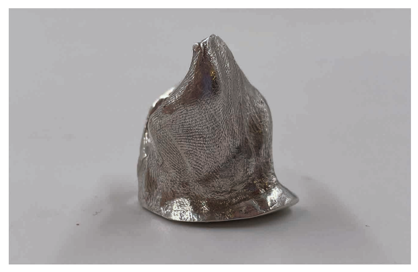
Figure 13: Holding Close Series - Grip