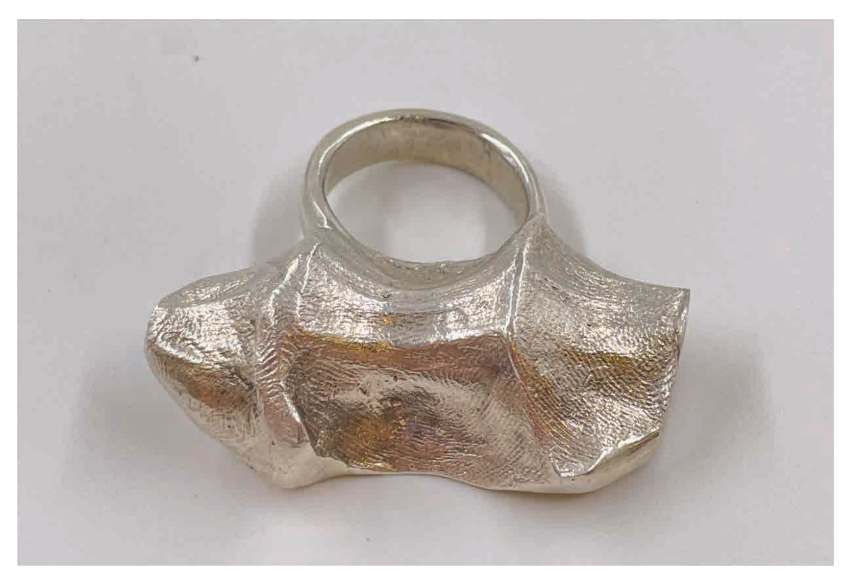
Figure 4: Holding Close Series - Clenched