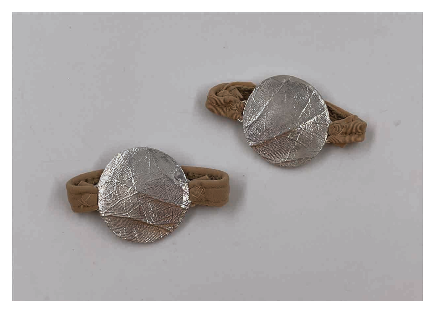
Figure 20: Bound, detail