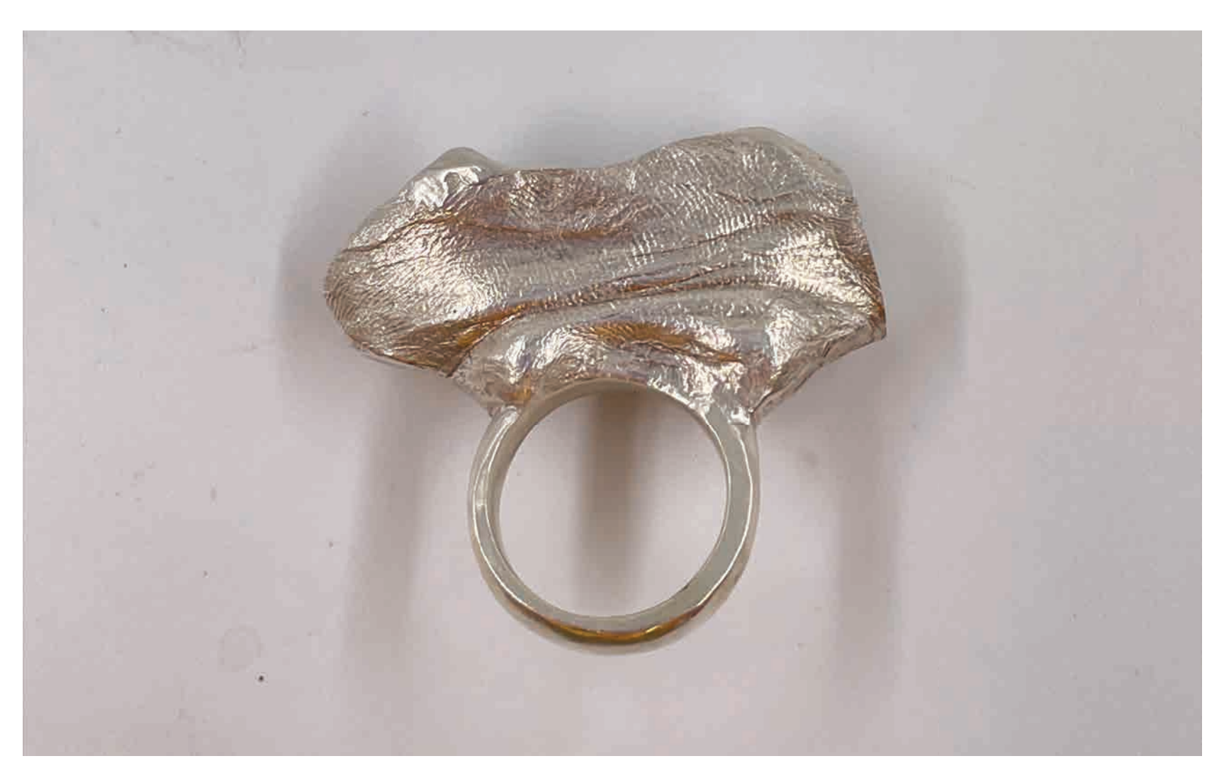
Figure 6: Holding Close Series - Clenched, detail