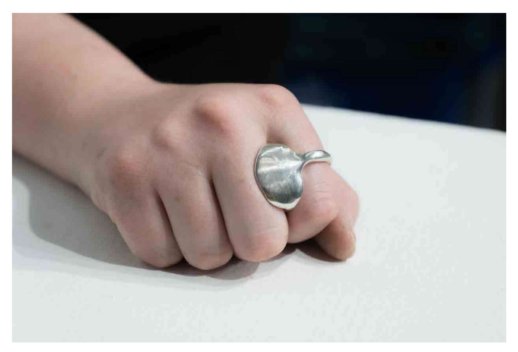
Figure 10: Holding Close Series - Squeeze, worn