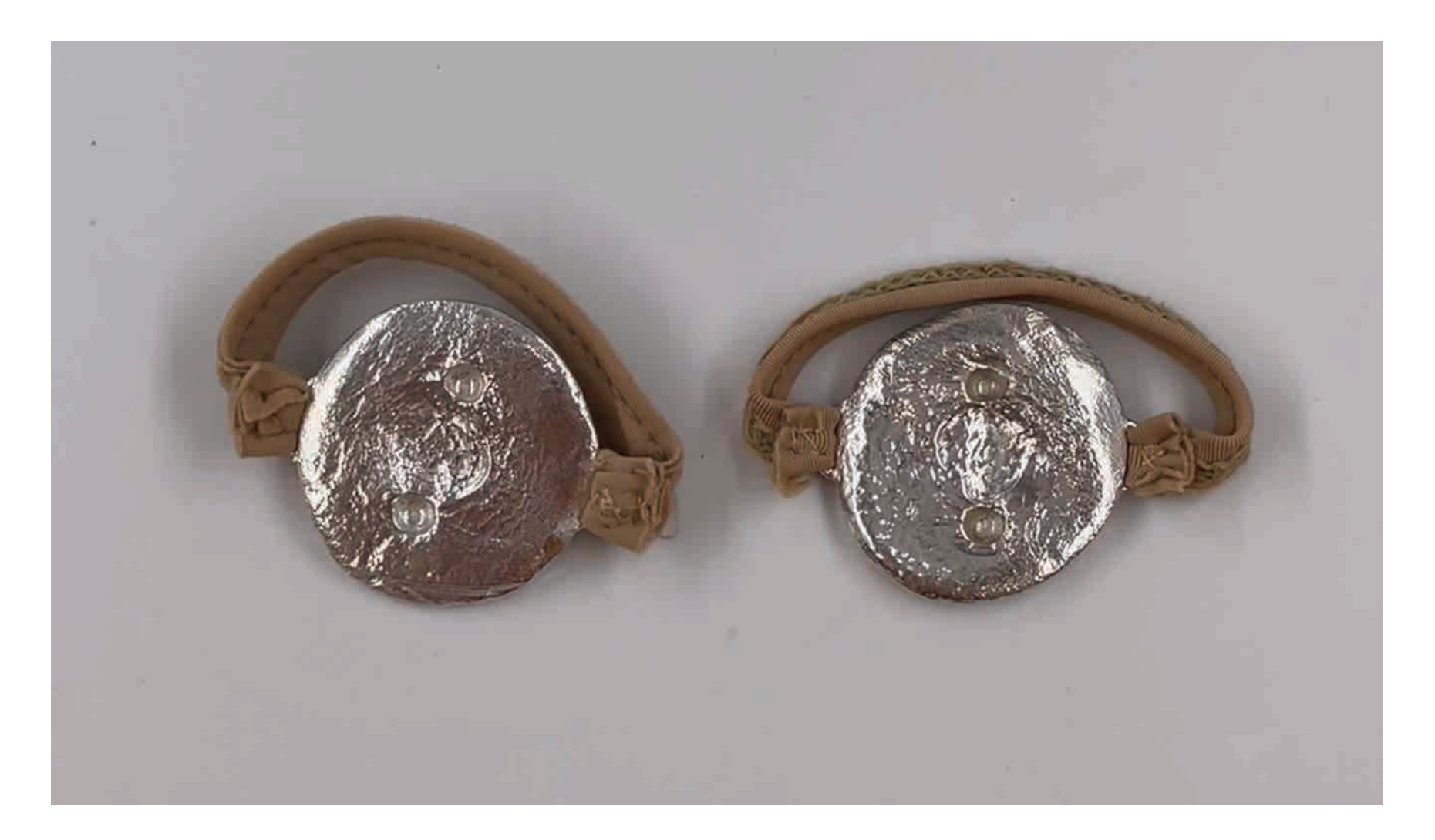
Figure 18: Bound