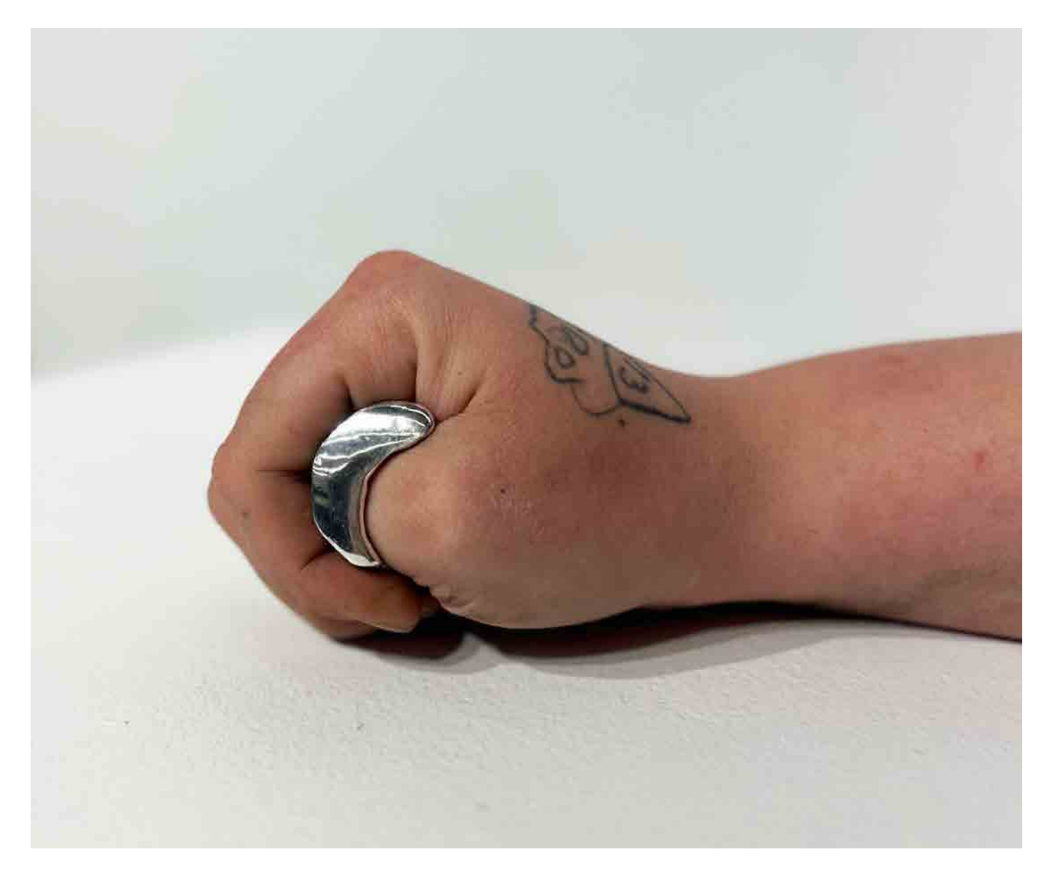
Figure 14: Holding Close Series - Grip, worn