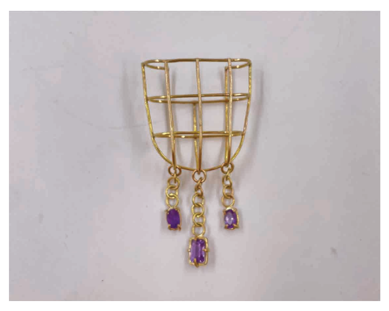
Figure 1: Traditions