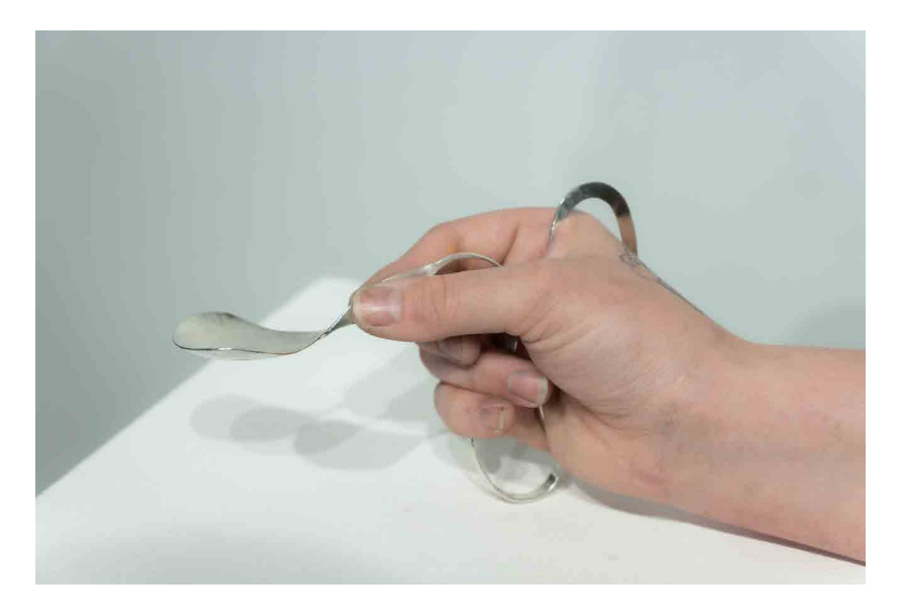
Figure 22: Wrapped, worn