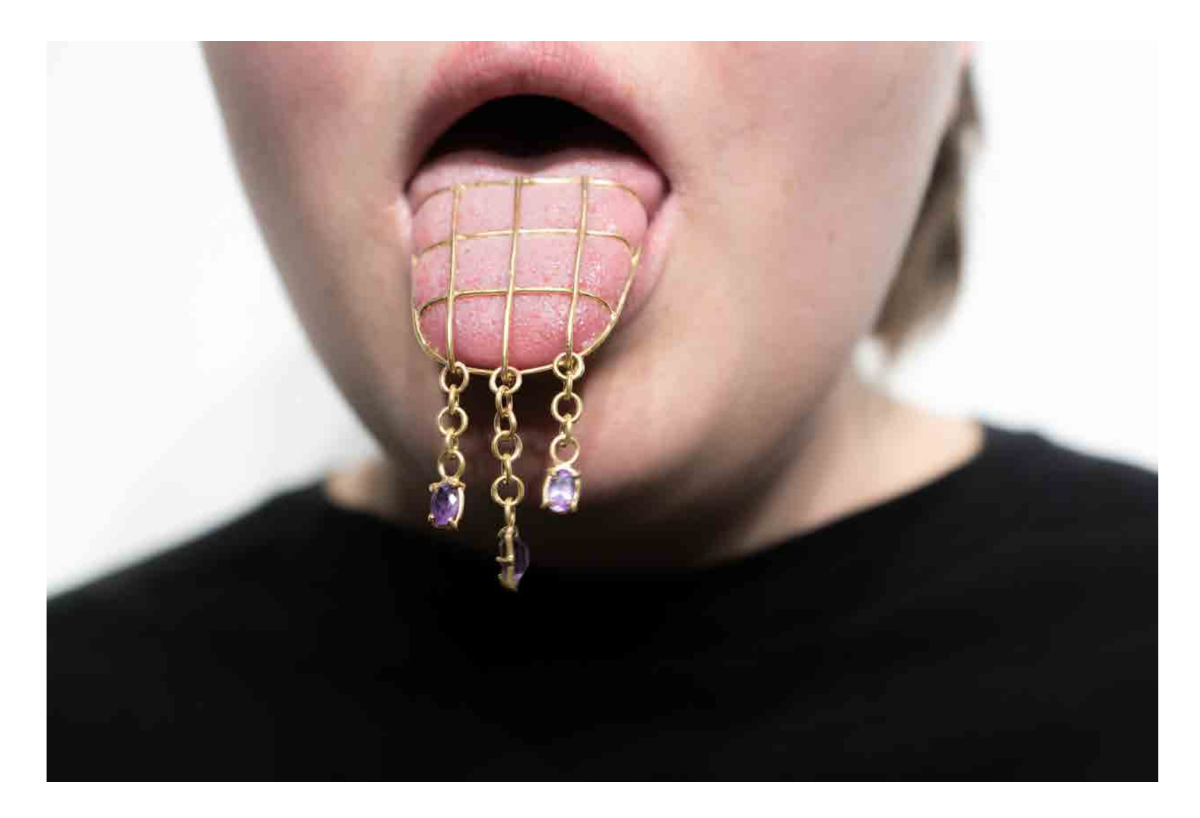
Figure 2: Traditions, worn