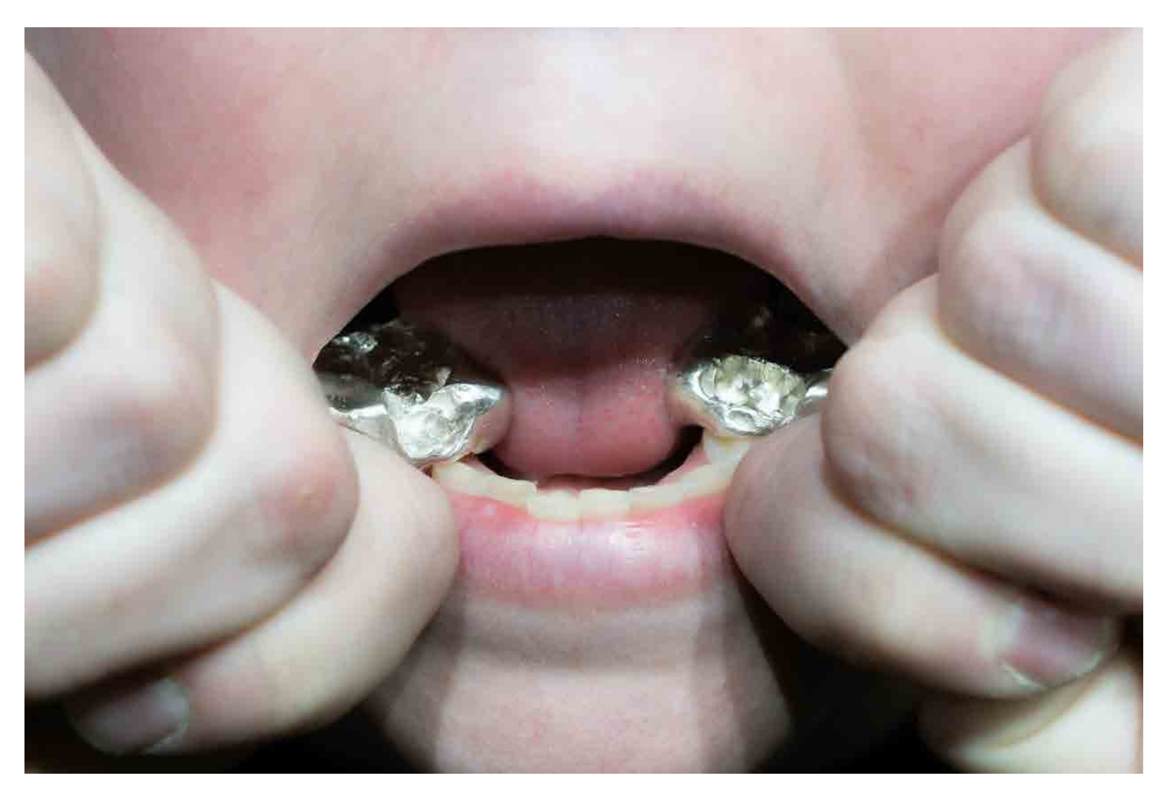
Figure 8: Holding Close Series - Bite, worn