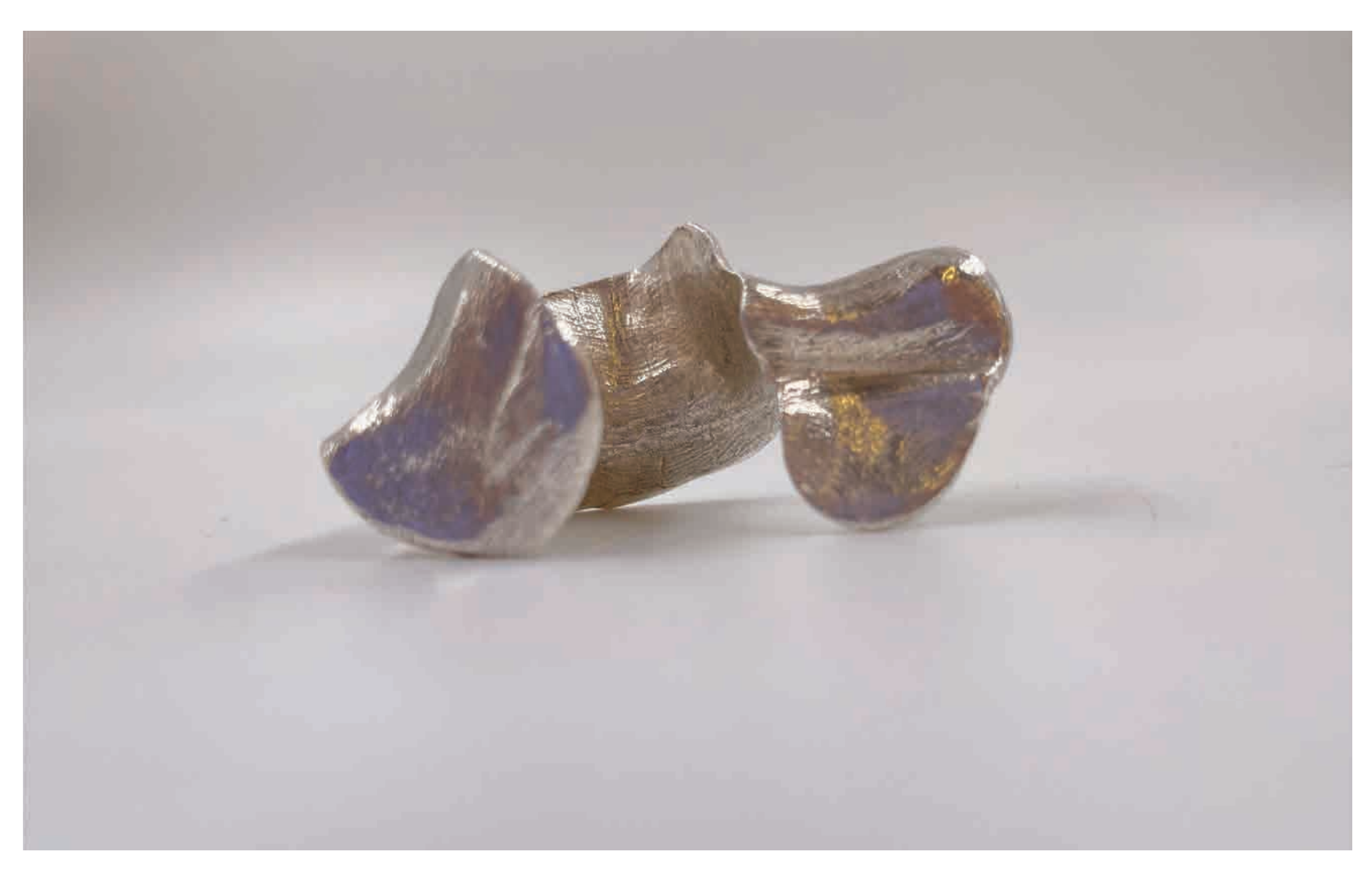
Figure 11: Holding Close Series - Clasped