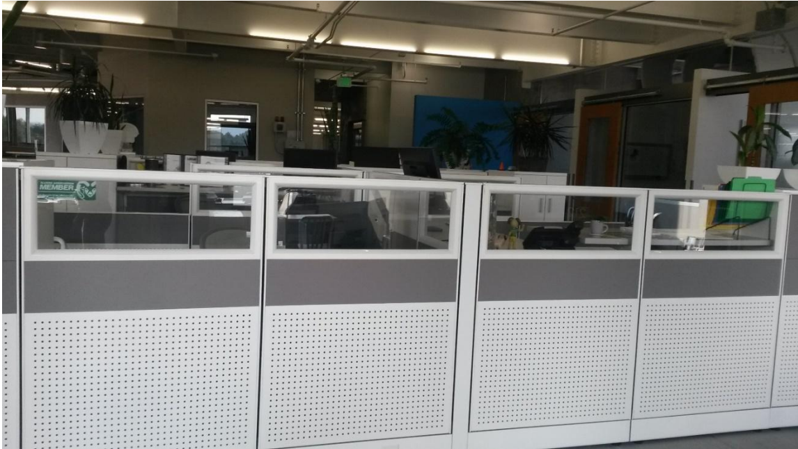
Figure 4.2. Partly enclosed workspaces in CSU Powerhouse

Discomfort can often arise from the inability to improve one's environment when an individual feels that he or she lacks the ability to alleviate his or her comfort level. Some sources of discomfort expressed by building occupants included a high noise level and uncomfortable acoustics because of the number of open research spaces. Figure 4.3 shows an example of open workspaces seen at CSU Powerhouse.