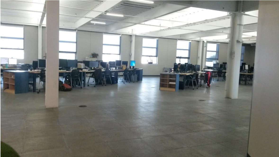
Figure 4.3. Open workspace in CSU Powerhouse

As per the previous discussion, there were two open-ended questions, which were presented to the survey respondents asking for opinions regarding design changes both in the building and in personal workspace. It is a common issue that energy efficient buildings are more focused on energy efficient features that other spheres of importance that directly affect the building occupant's comfort level might be overlooked such as personal comfort. The elaborate responses are attached in Appendix C: Survey Results-Building Features Section.