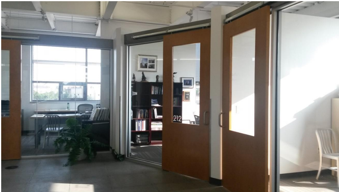
Figure 4.1. Private workspace in CSU Powerhouse

The respondents expressed discomfort and showed a lack of approval about their open workspace environment, specifically noting poor acoustic features that caused distraction from their work. Based on the responses received and a visit to the building by the researcher, the conclusion was drawn that the design of open office spaces correlates well with participants' responses. For example, some participants noted discomfort that resulted from the building features and workspace such as the acoustics in the building. For this reason, cubicles (Figure 4.2) tended to be preferred to desks set up in the open workspaces (Figure 4.3). Furthermore, some building occupants expressed that they did not have closed personal working spaces and said that the partition walls are only half of the wall height, which does not provide the necessary level of quiet they prefer. Figure 4.2 is a photograph that shows an example of shared workspaces at CSU Powerhouse.