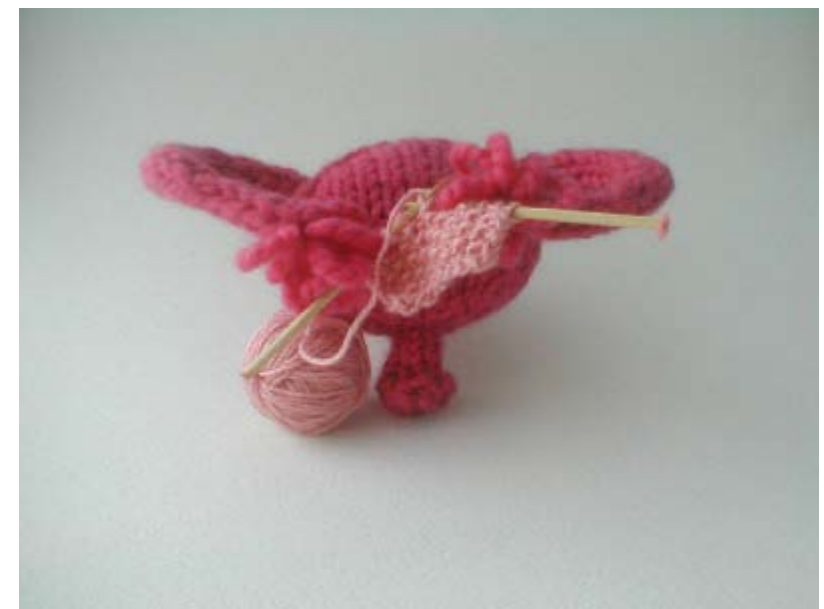
A knitted womb from the Wombs on Washington Project (Pentney, 2008)