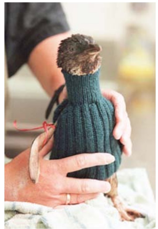
A knitted sweater to help fairy penguins after an oil spill (Pace, 2007, p. 132)