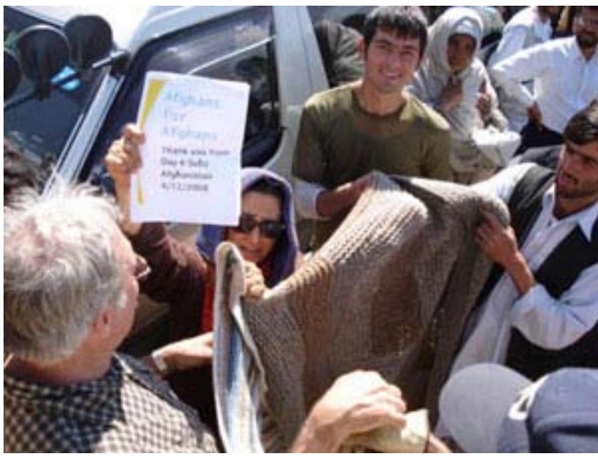
Afghan delivery day in Afghanistan .