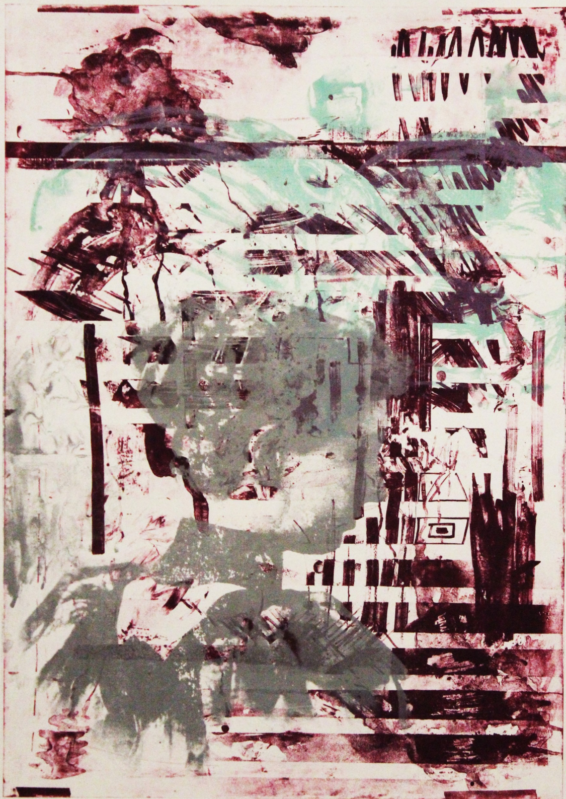
Figure 9: The Family