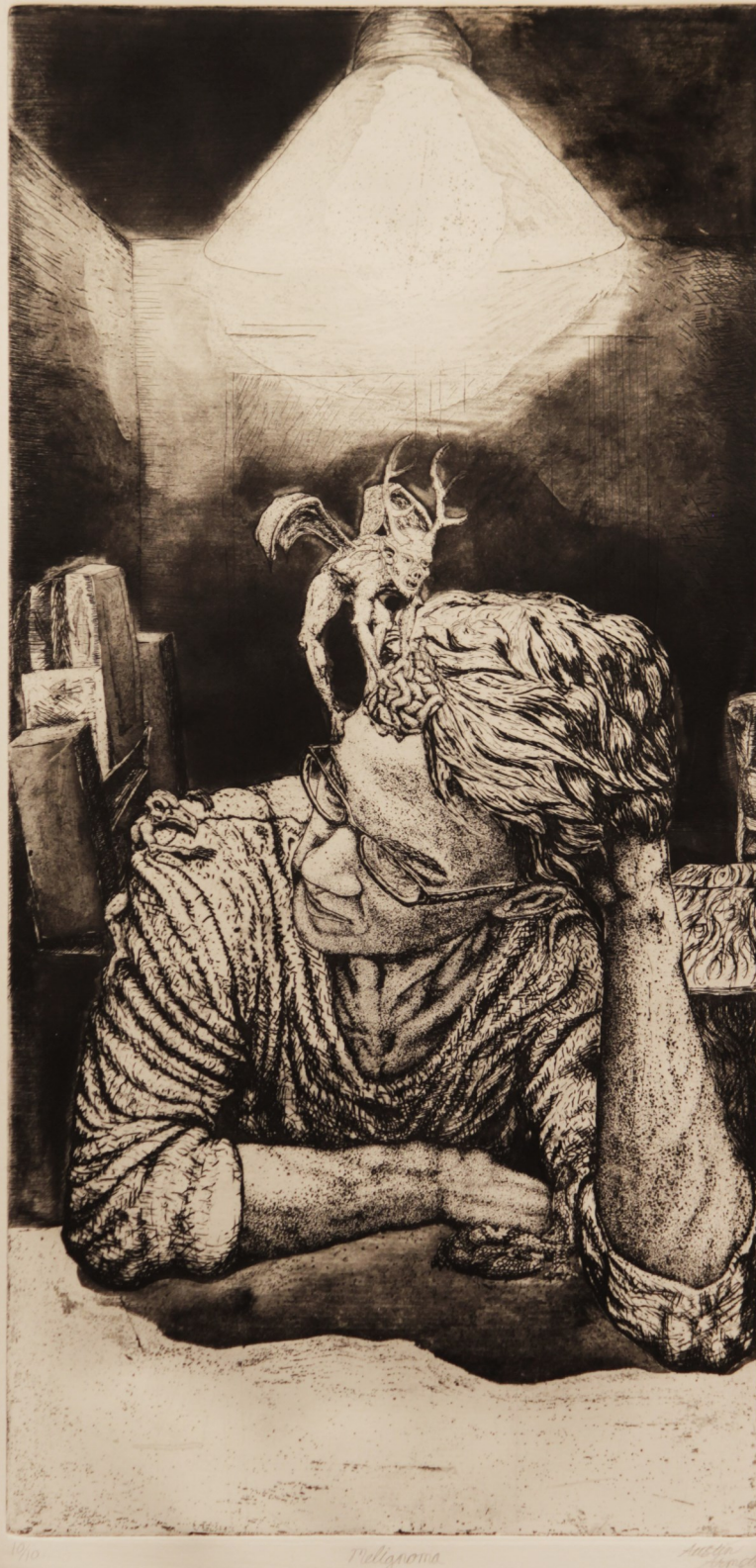
Figure 5: Melanoma