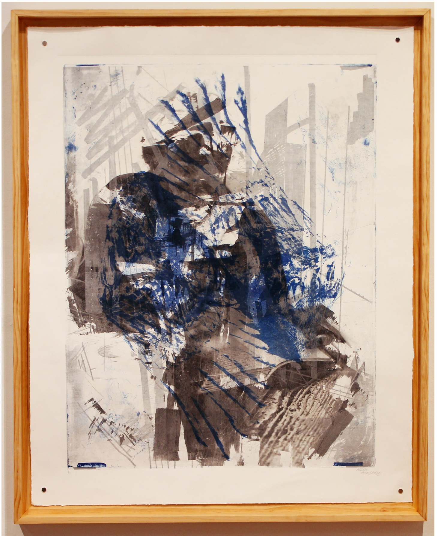
Figure 2: Peter