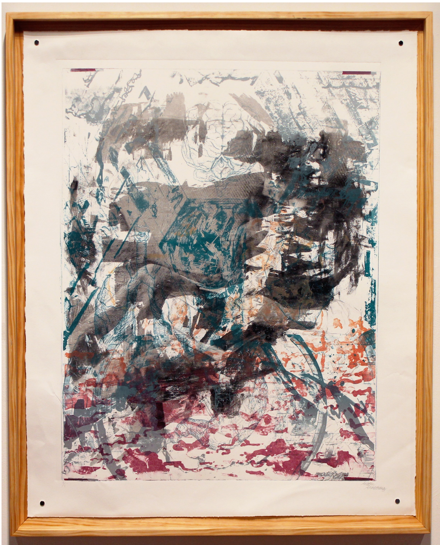
Figure 3: TJ