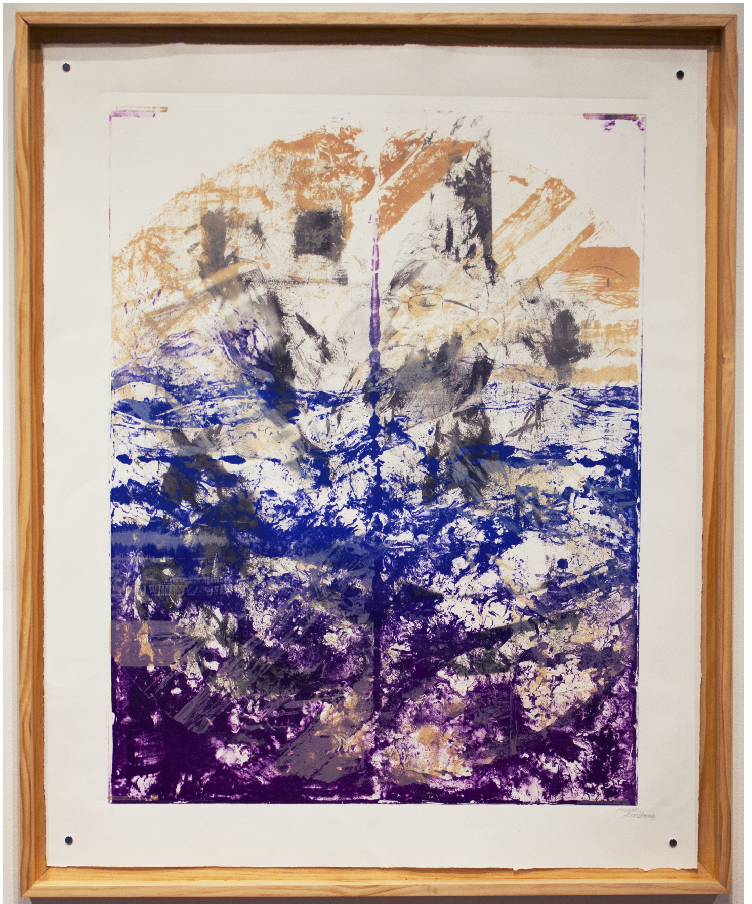
Figure 1: Camron