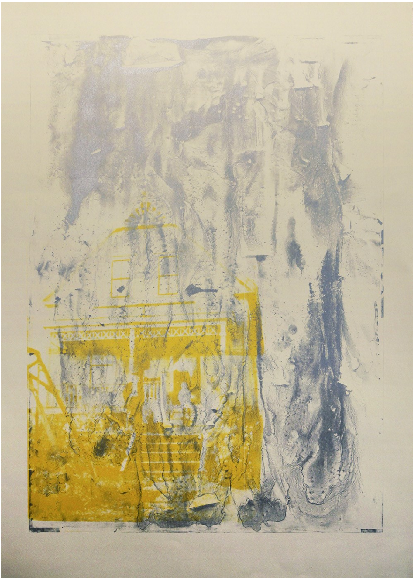
Figure 11: Homestead