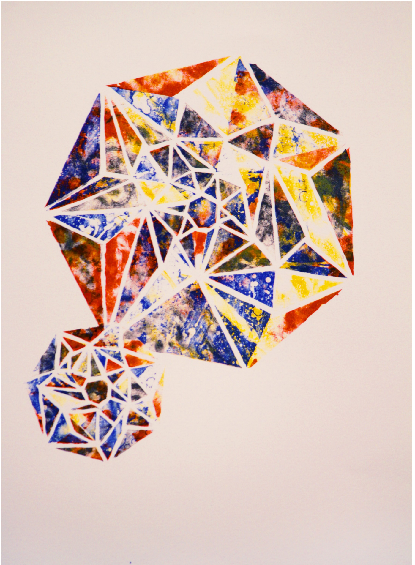
Figure 8: White Glass