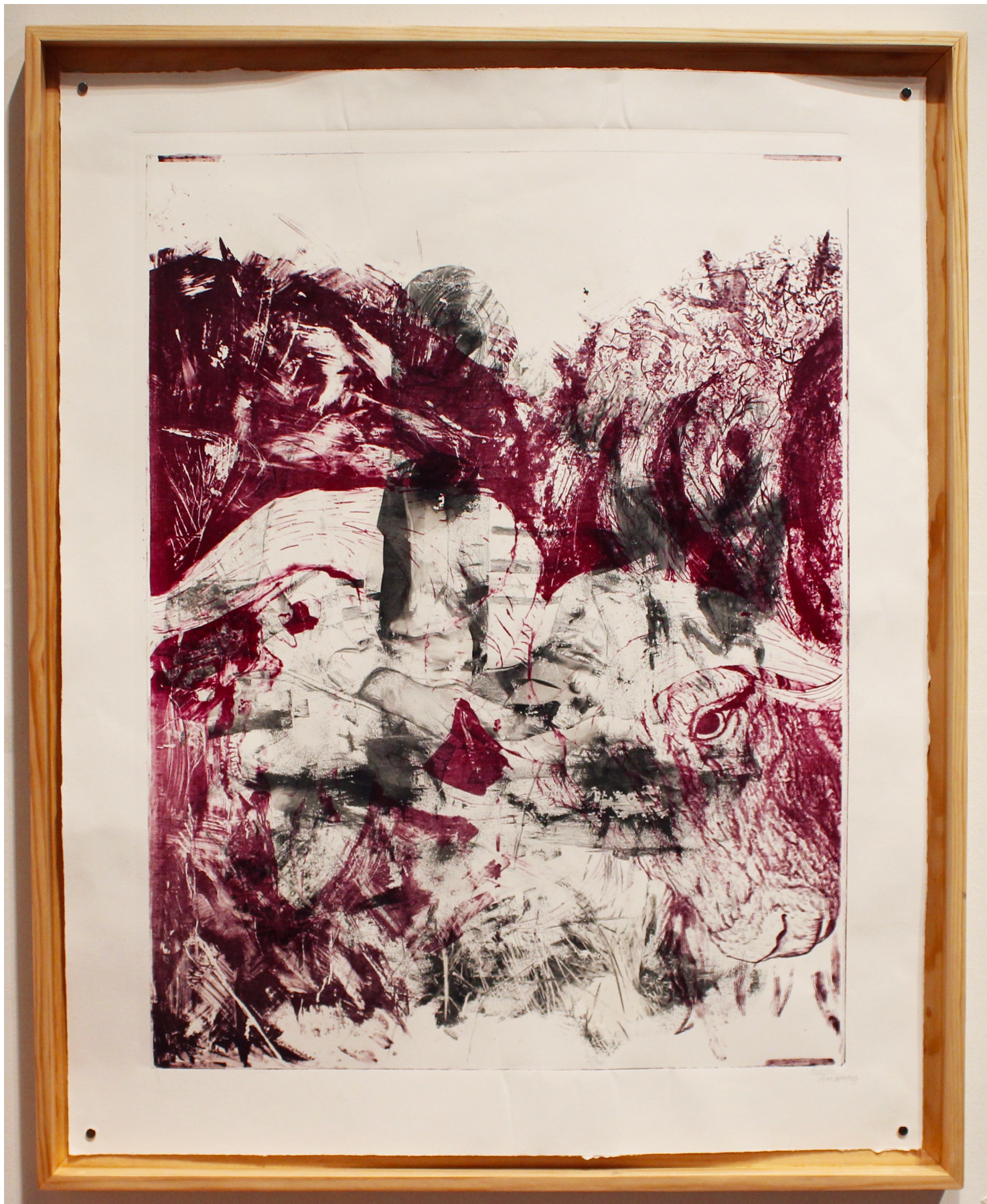
Figure 4: Ben