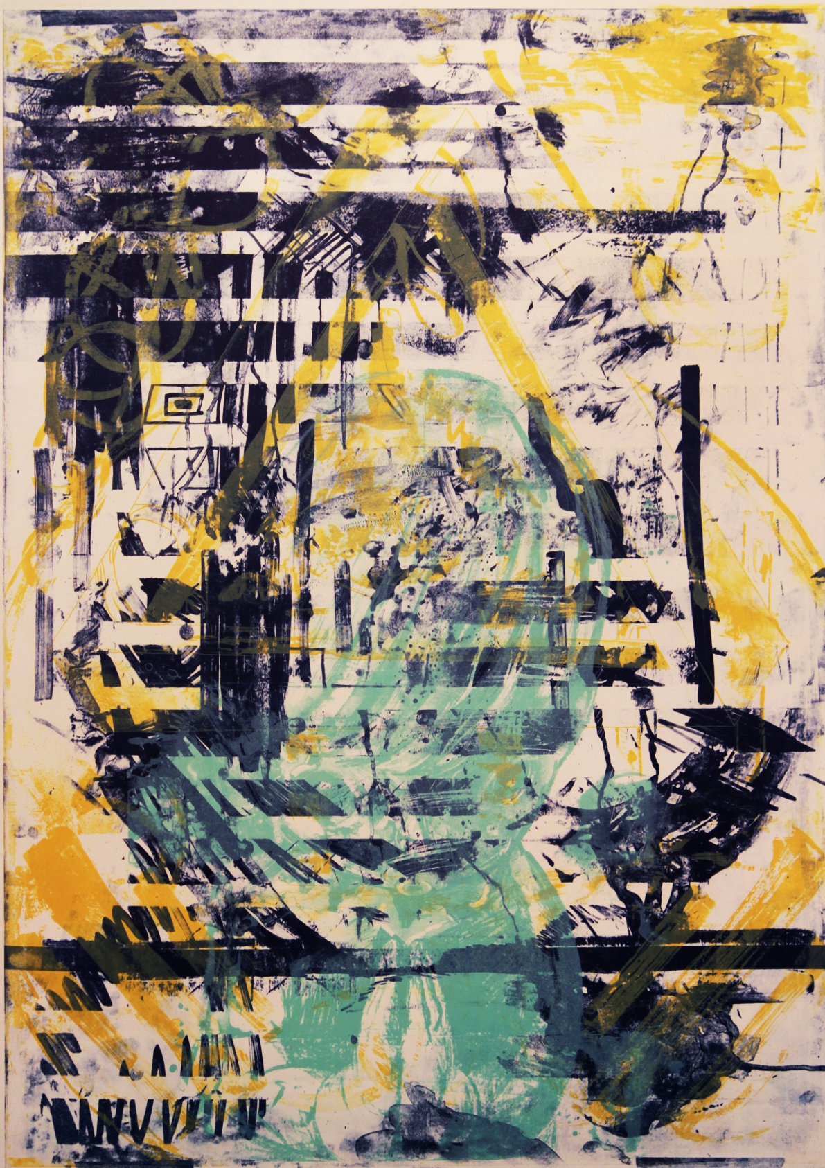
Figure 10: Prayer of a Child