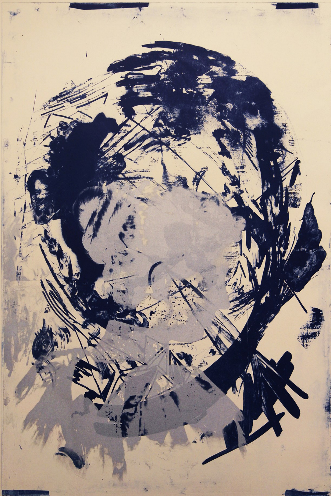
Figure 6: Mother