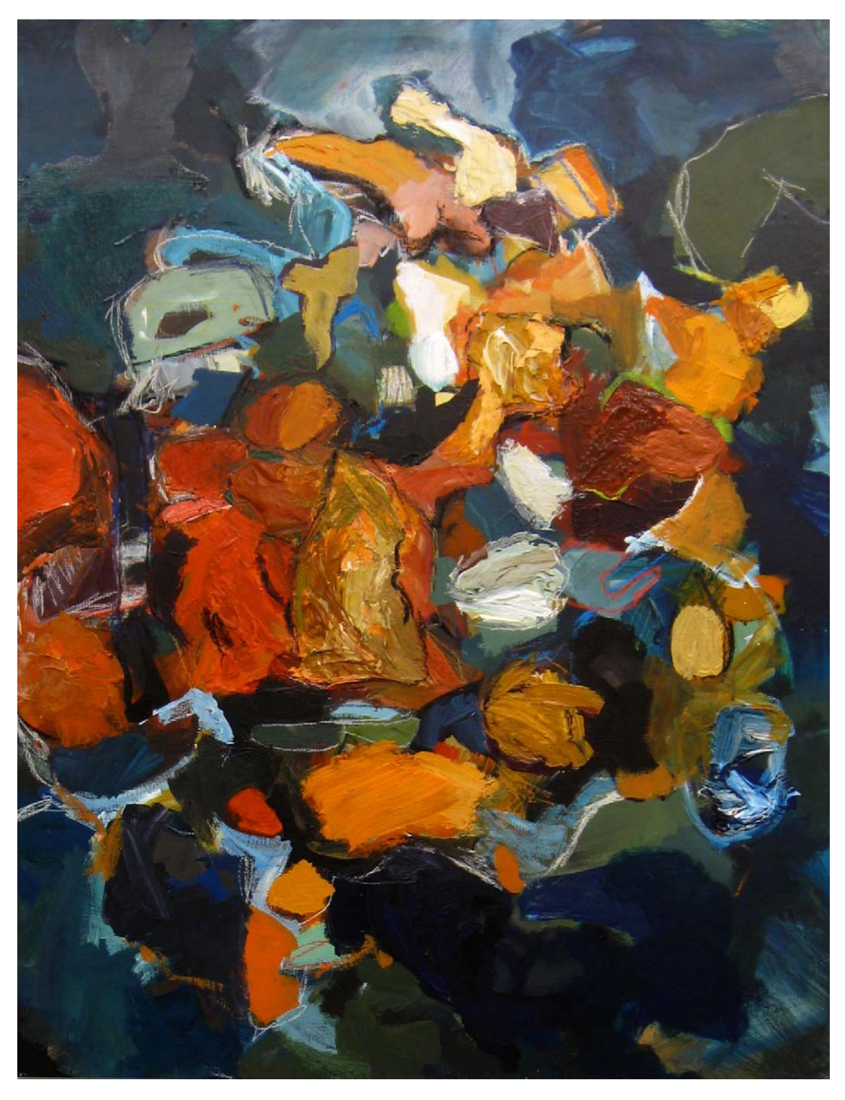
Figure 6 Jamie Davis Tornare Acrylic and pastel on panel 36"x48" 2011