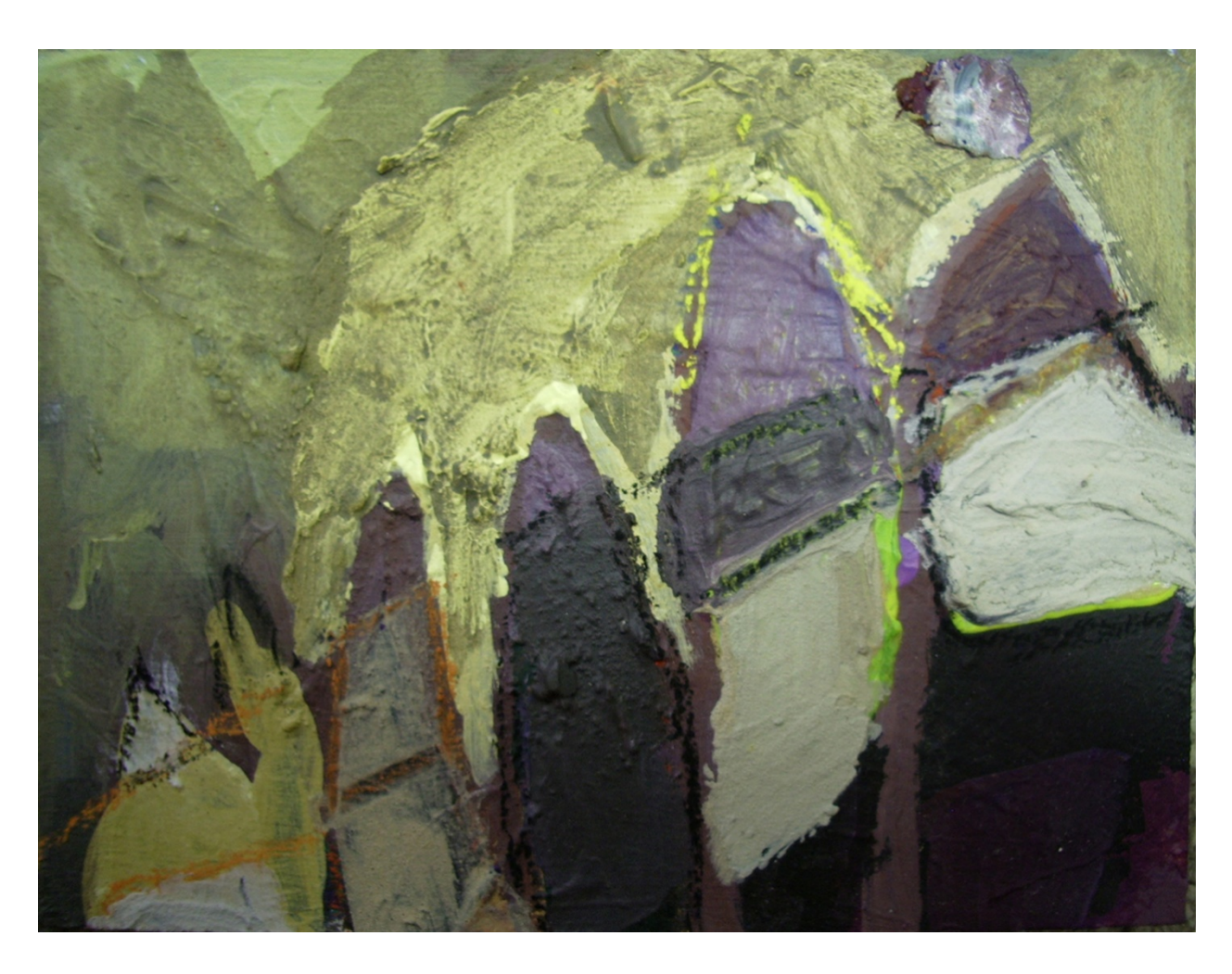
Figure 11 Jamie Davis <u>Untitled</u> Acrylic and pastel on paper 9"x10" 2011