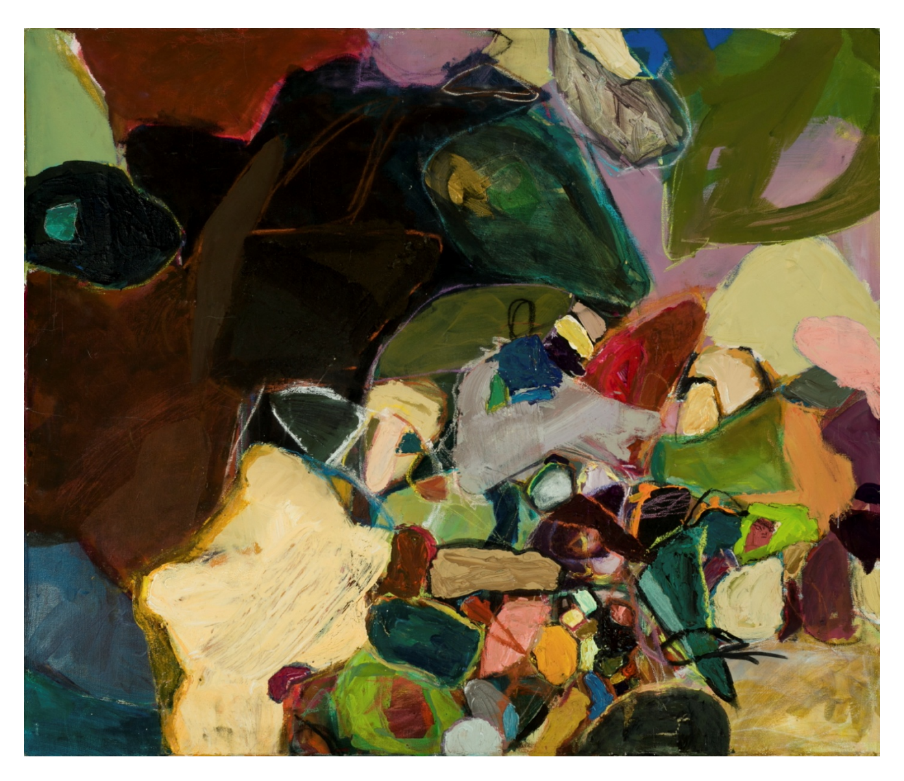
Figure 14 Jamie Davis Beginnings Acrylic and pastel on canvas 39"x35" 2011