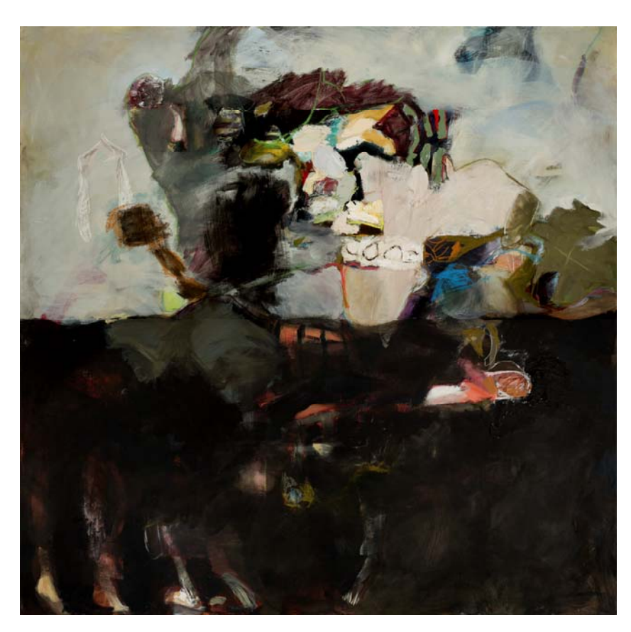
Figure 8 Jamie Davis Botticelli's Feet Acrylic and pastel on panel 96"x96" 2012