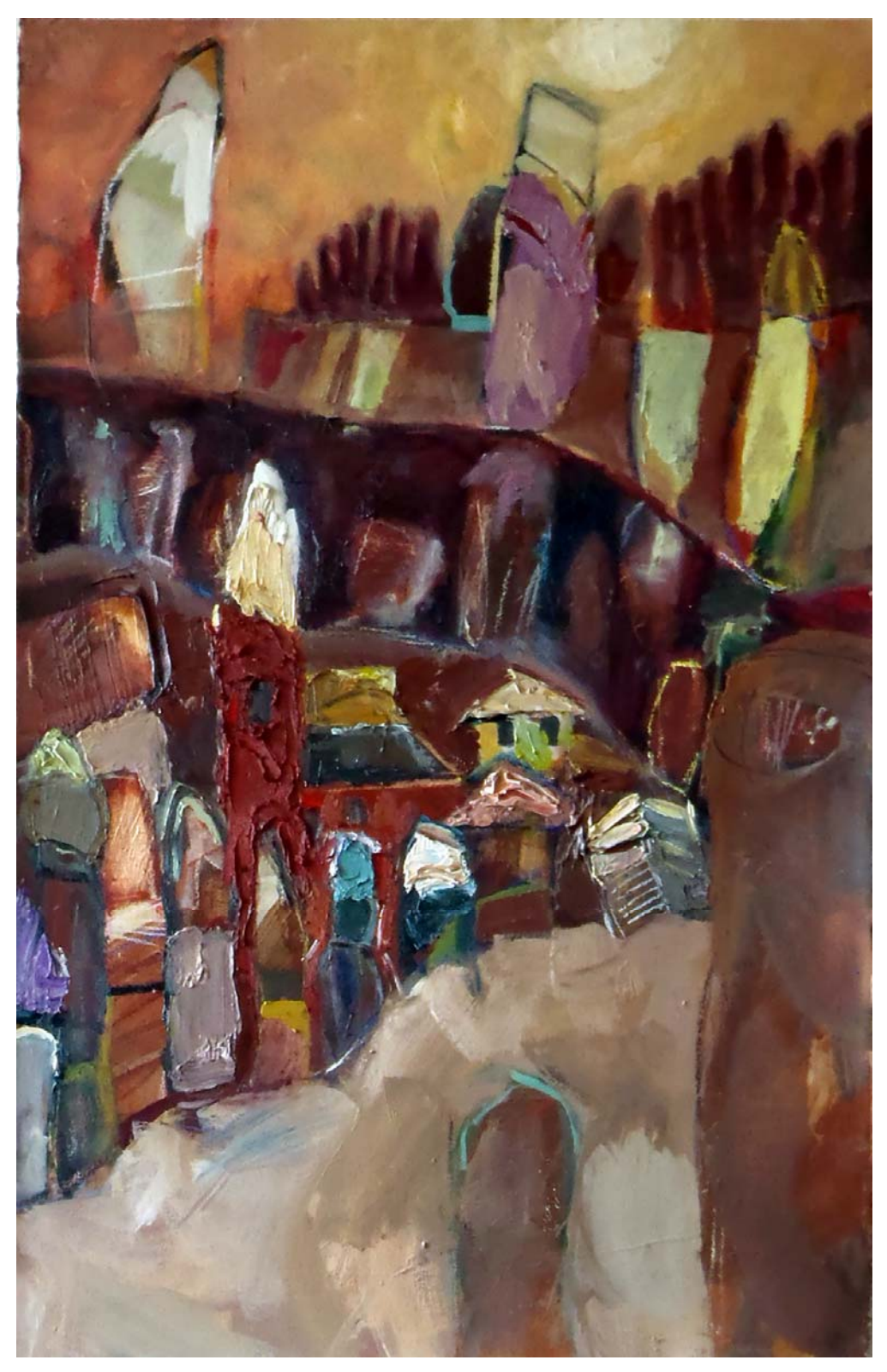
Figure 3 Jamie Davis Cortona Acrylic and pastel on paper 28"x40" 2011