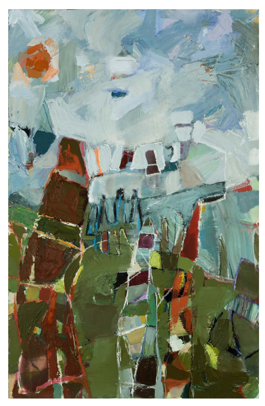
Figure 4 Jamie Davis Foiano della Chiana Acrylic and pastel on paper 28"x40" 2011