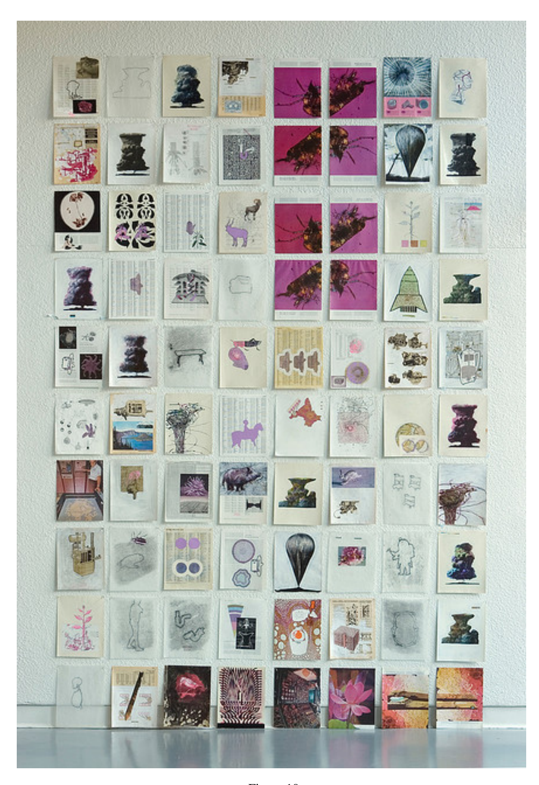
Figure 10 Rachel Hibbard 365 Days, Violet Mixed media on paper 122"x83" 2009