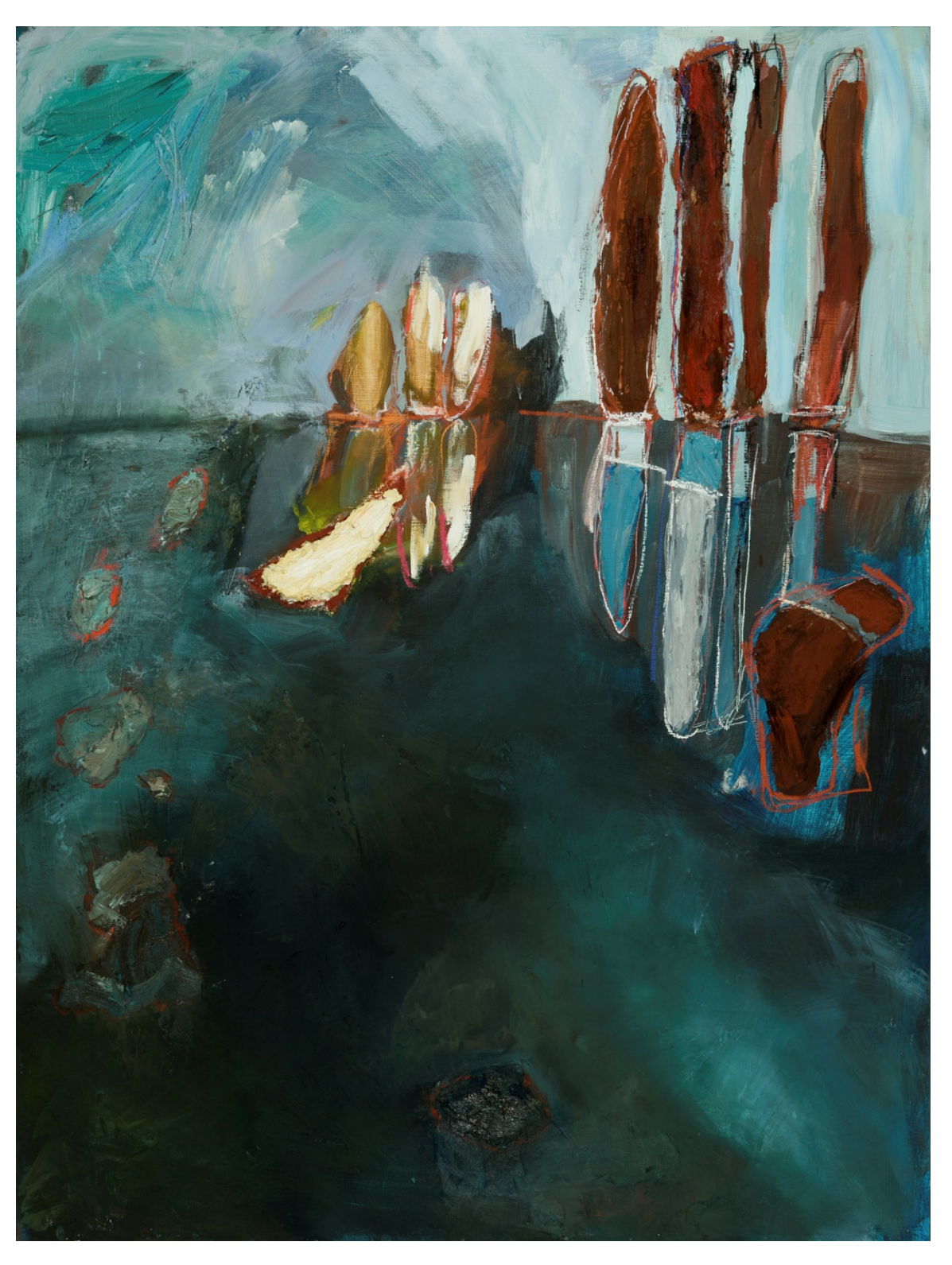
Figure 1 Jamie Davis Anywhere With You Acrylic and pastel on panel 36"x48" 2011