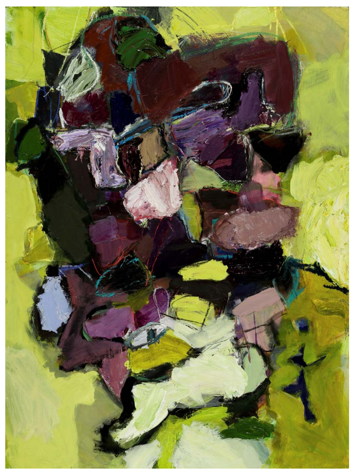
Figure 5 Jamie Davis A Destra o Sinistra Acrylic and pastel on panel 36"x48" 2011