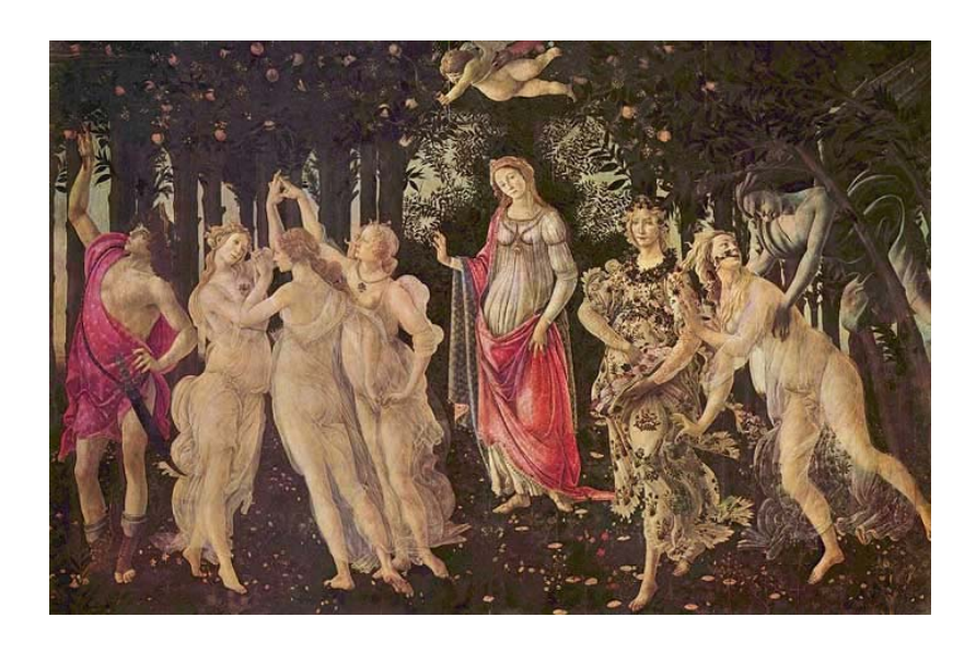
Figure 9 Sandro Botticelli Primavera Tempera on panel 80"x124" c. 1482