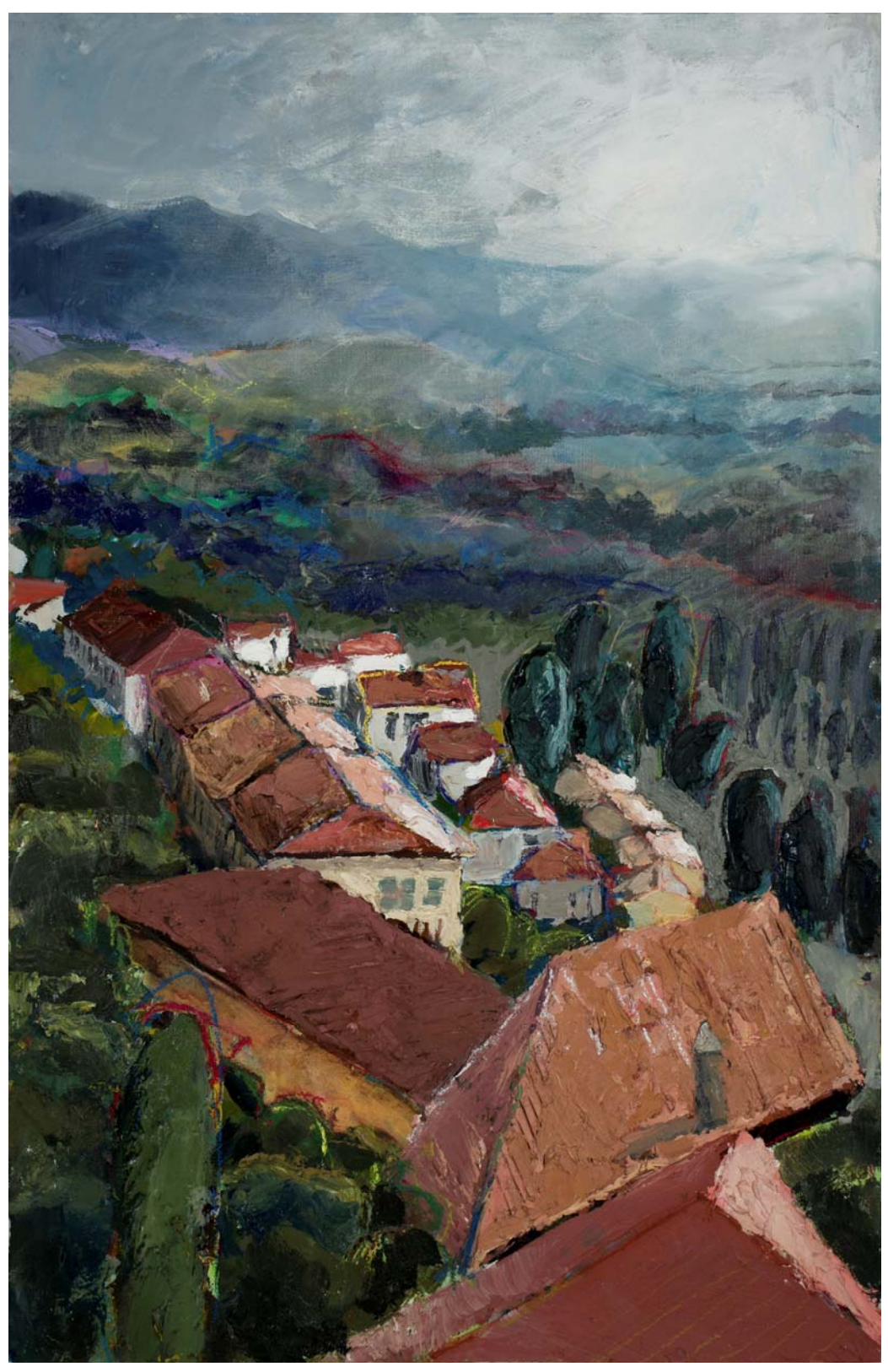
Figure 2 Jamie Davis Castiglion Fiorentino Acrylic and pastel on paper 28"x40" 2011 13