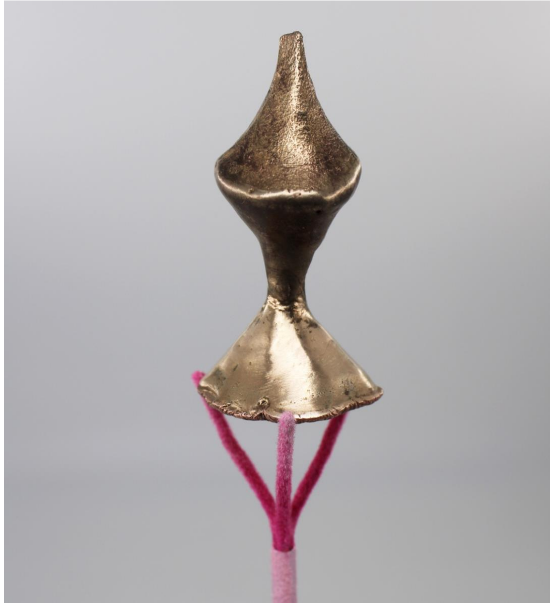
Figure 8: Buttons