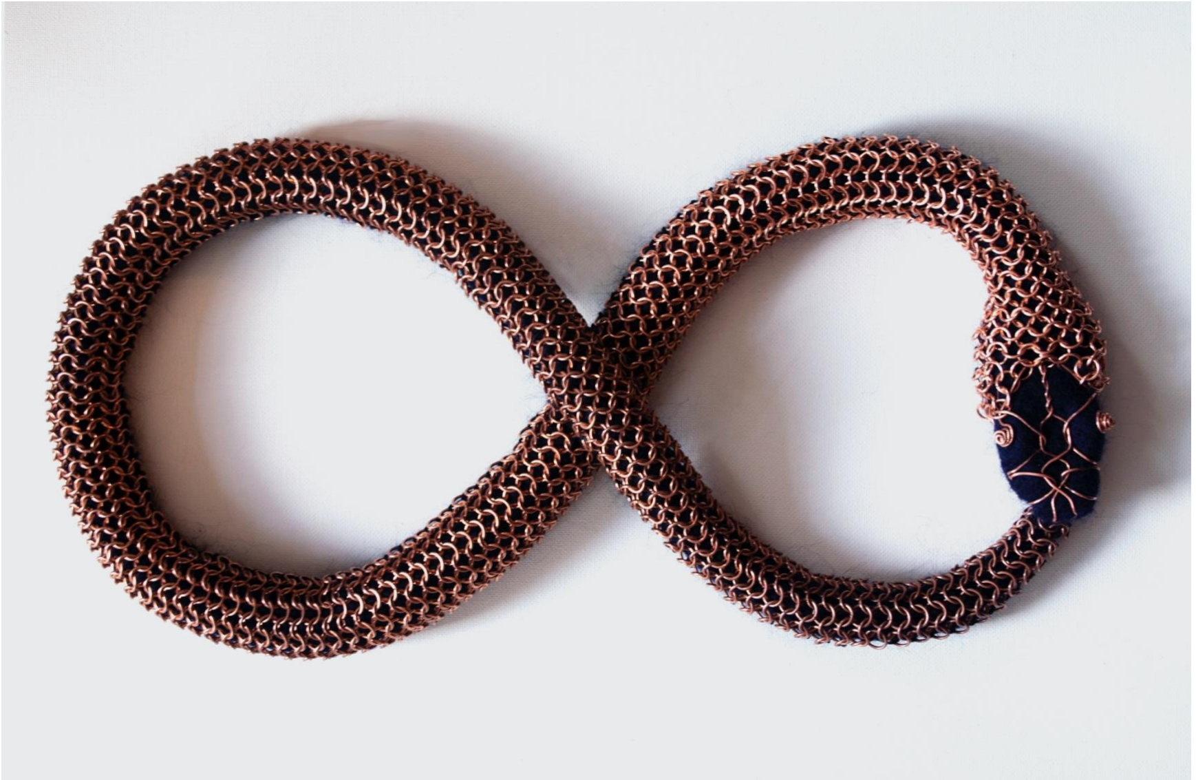
Figure 4: Ouroboros