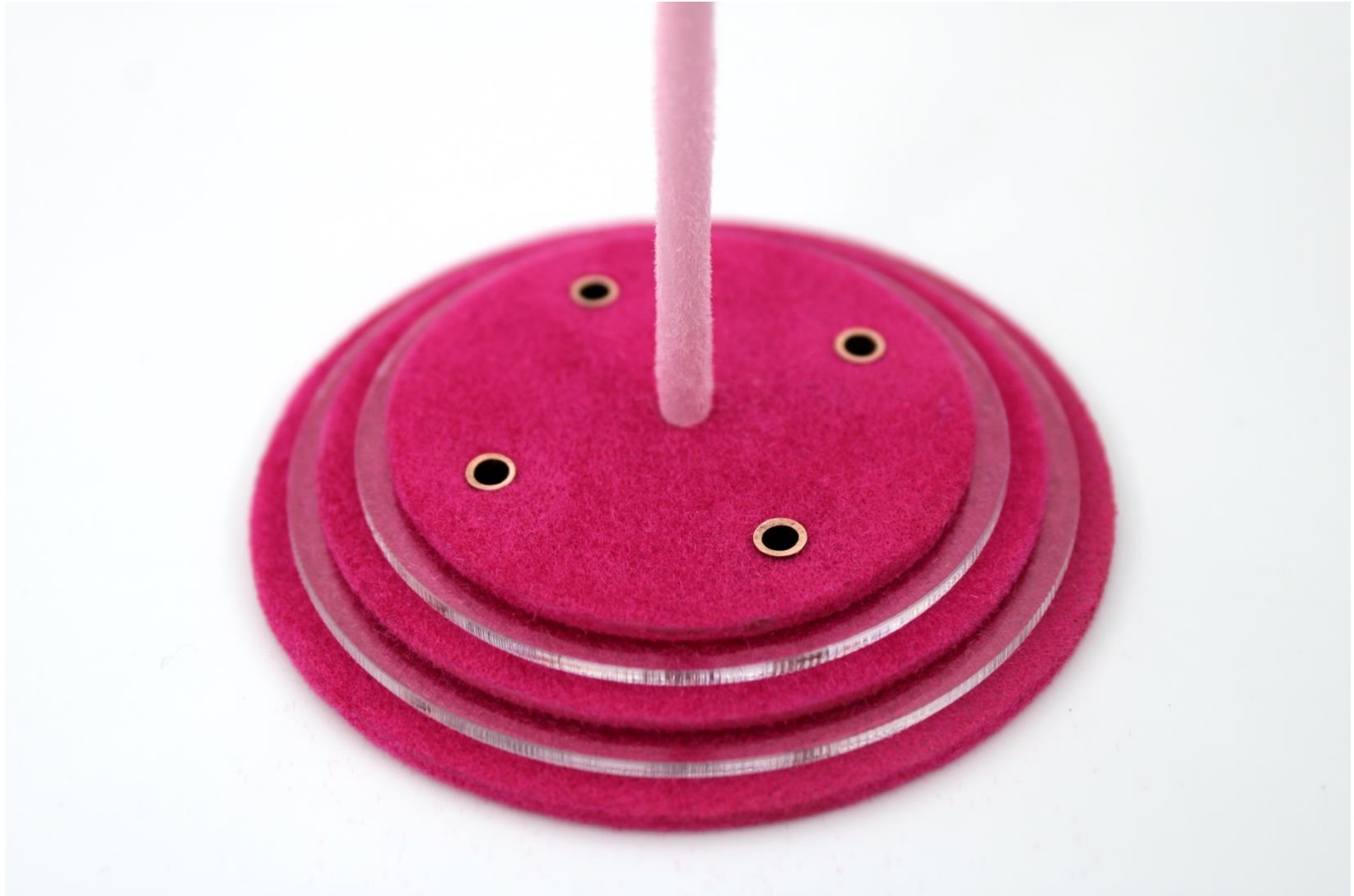
Figure 9: Buttons (base)