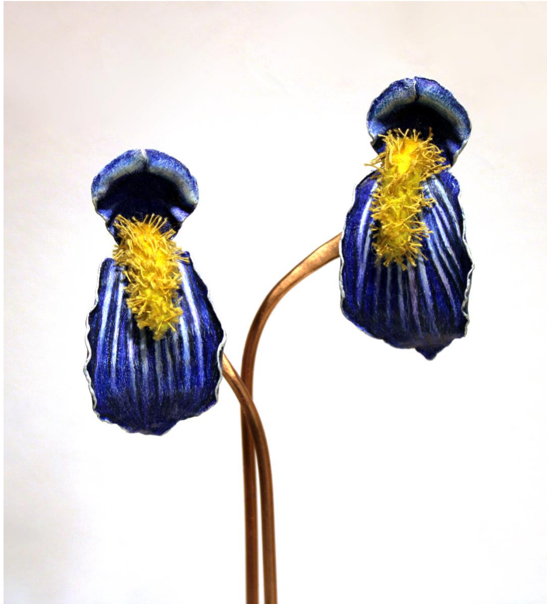
Figure 1: I can't hear you, I have flowers in my ears