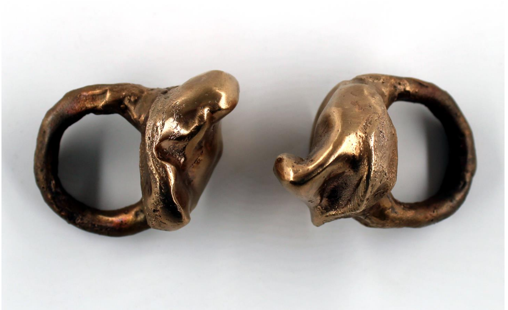
Figure 2: Inner Ear Rings