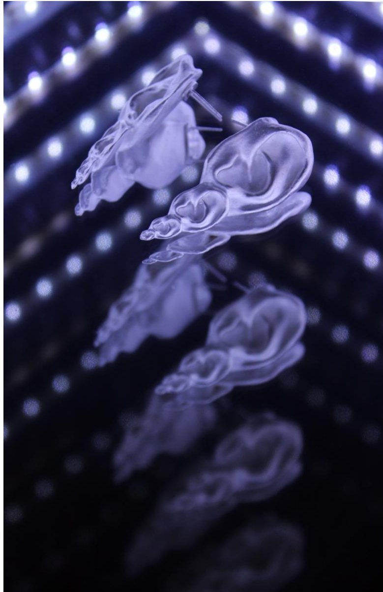
Figure 7: Ears all the Way Down (with infinity pedestal)