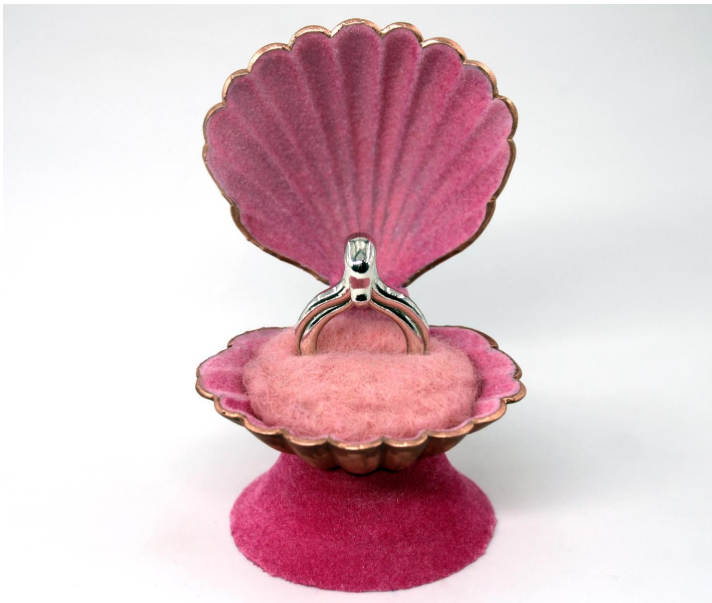
Figure 10: Promise Ring