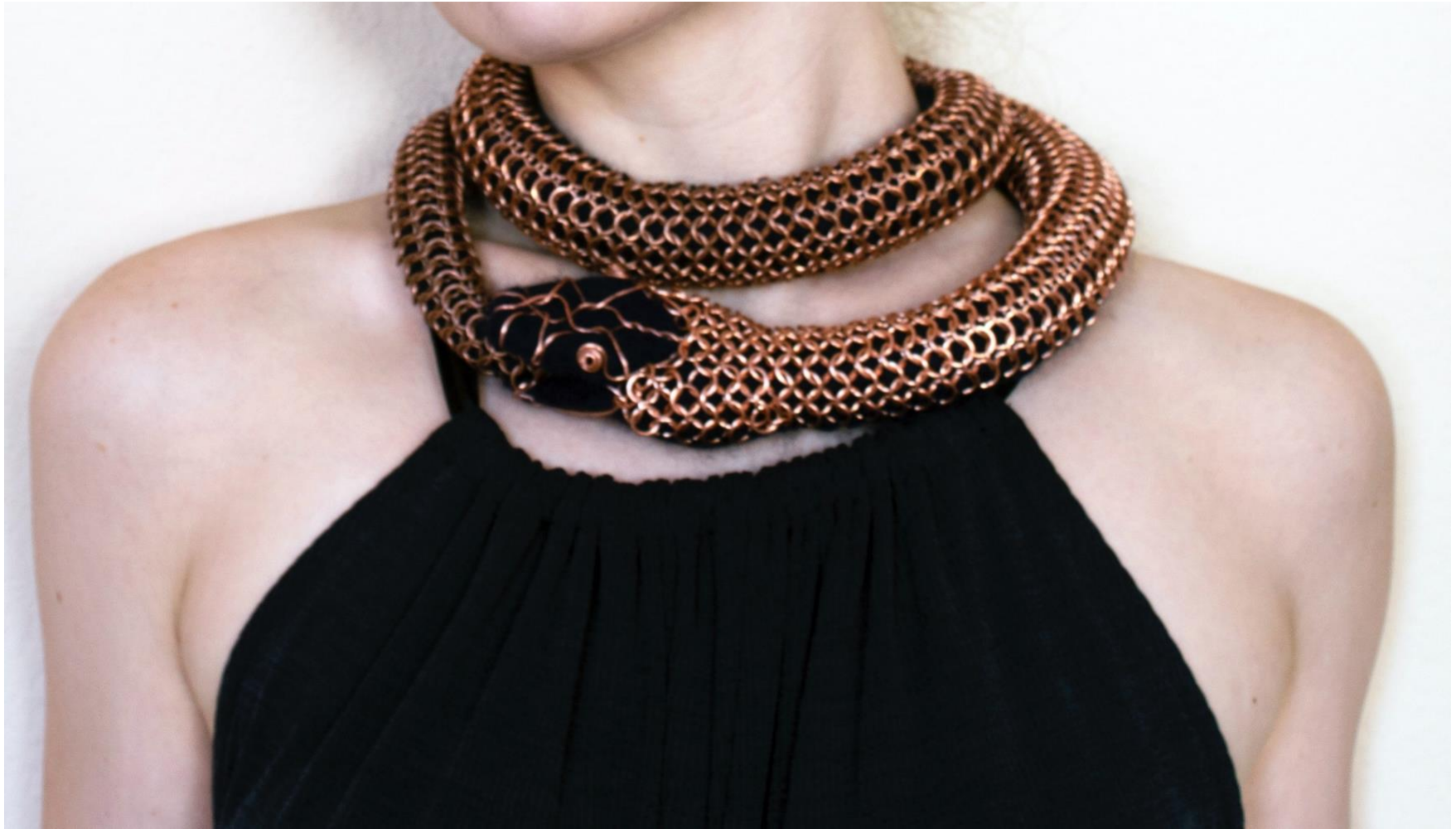
Figure 5: Ouroboros (worn)