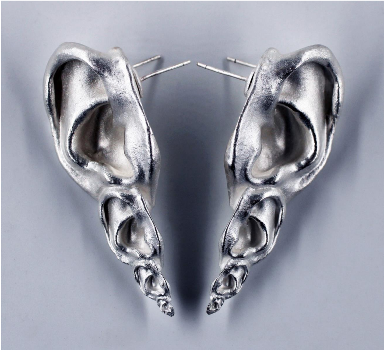
Figure 6: Ears all the Way Down