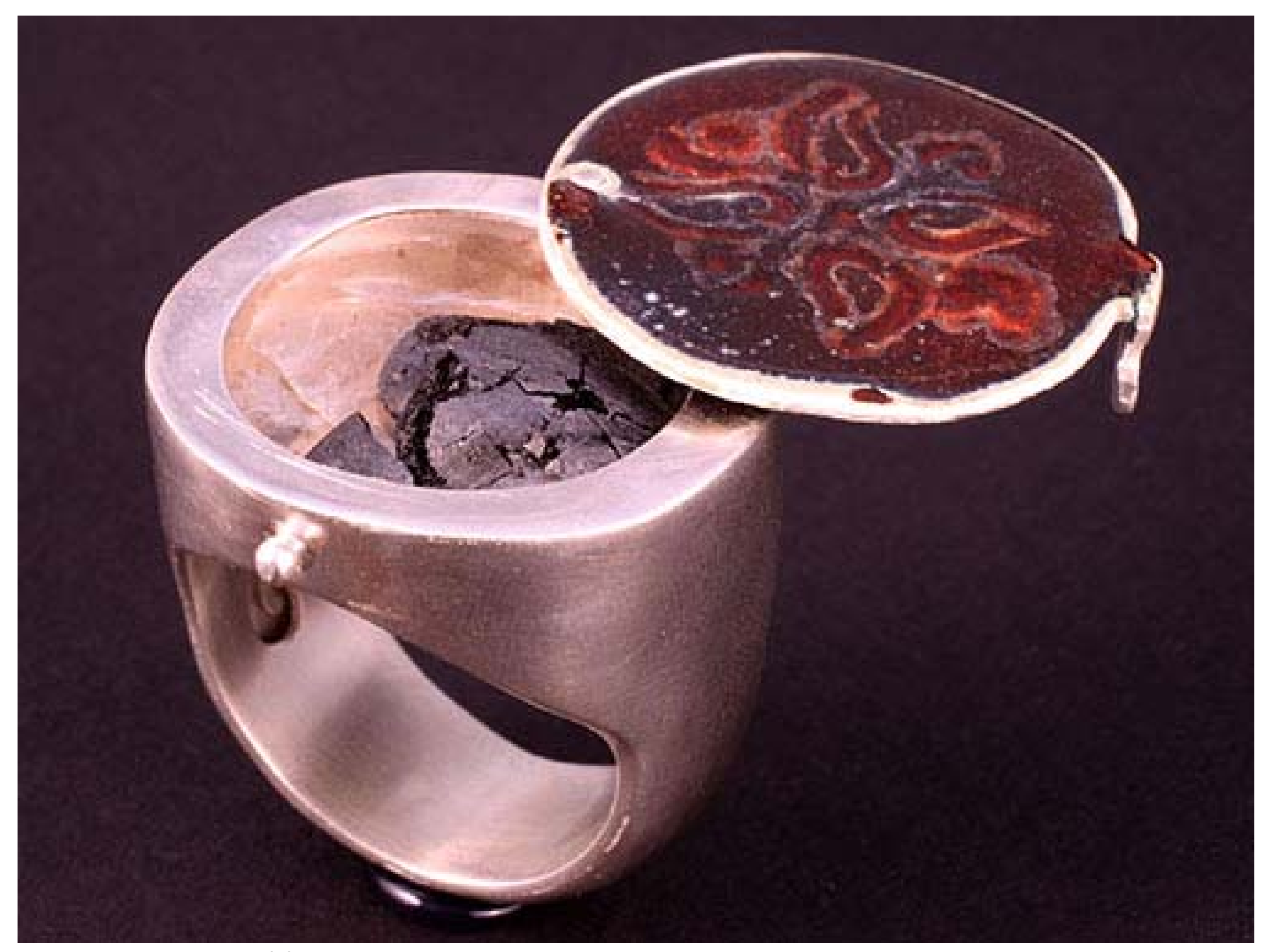
Figure 16: Natural Cycles (2).