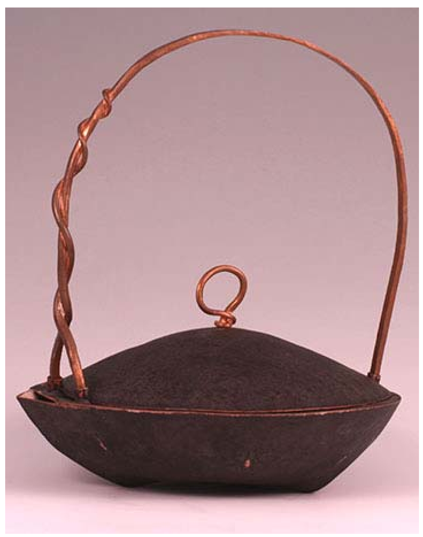
Figure 12: Tipotto.