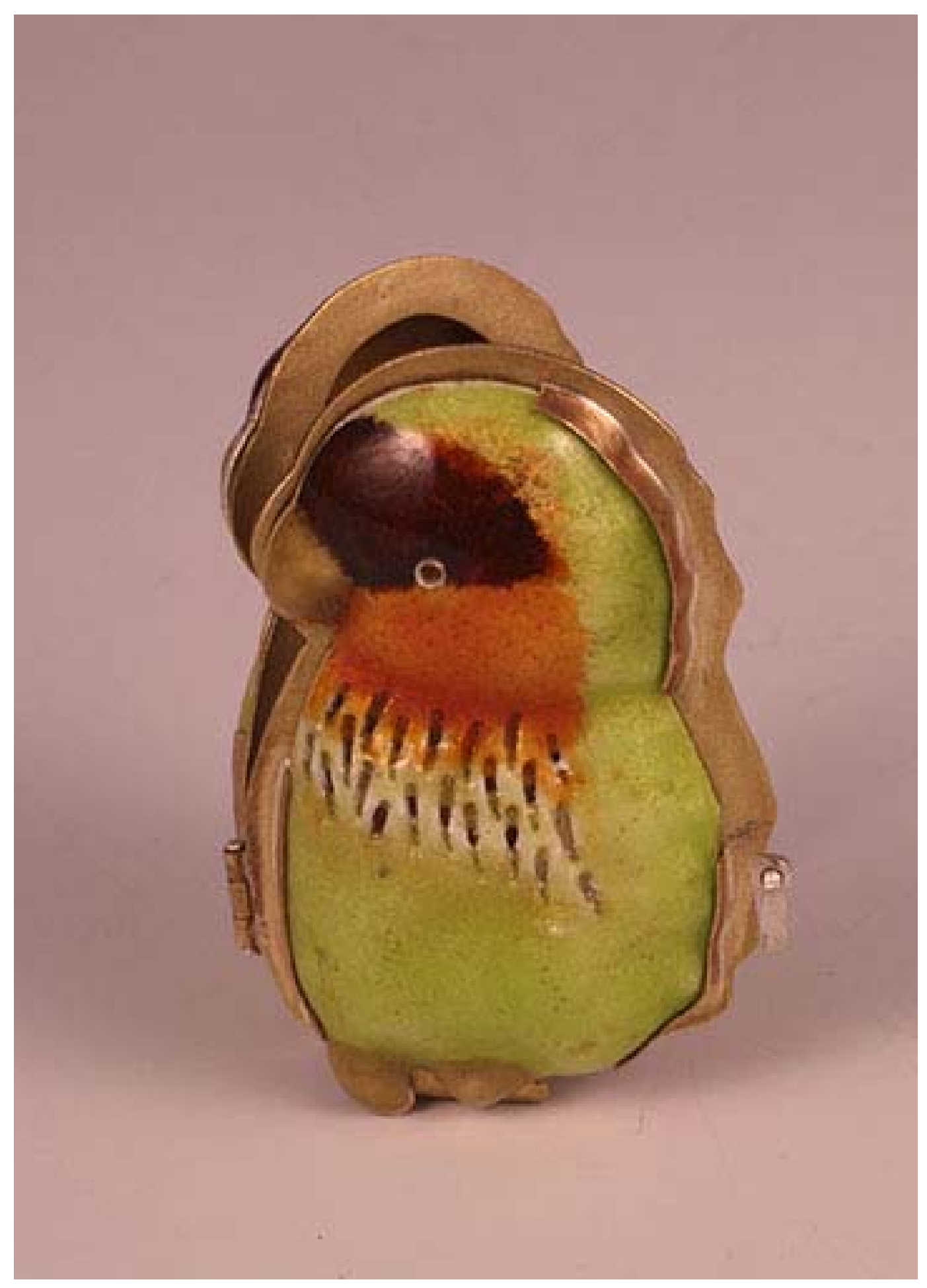
Figure 19: Love, Birds (3).