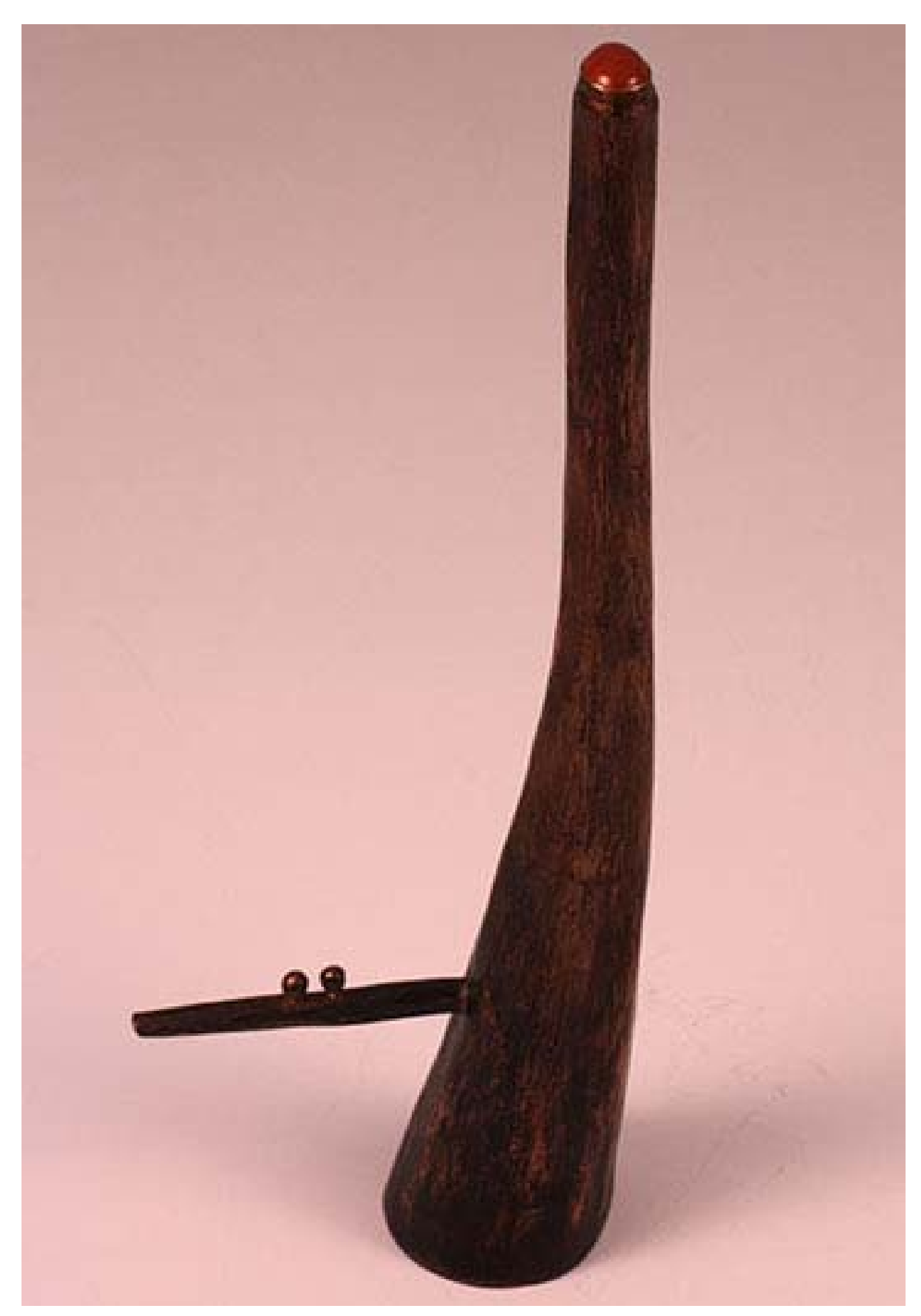
Figure 18: Love, Birds (2).