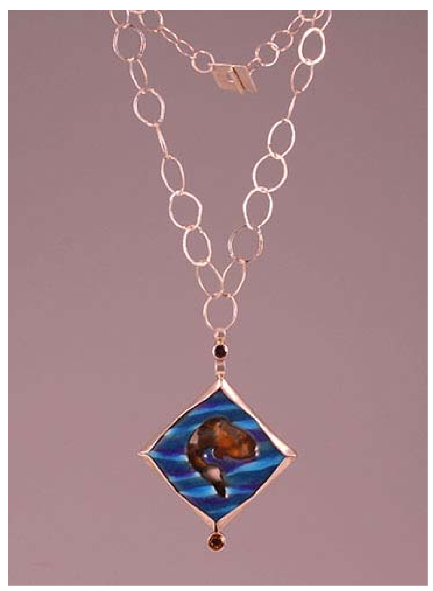
Figure 13: Koi.