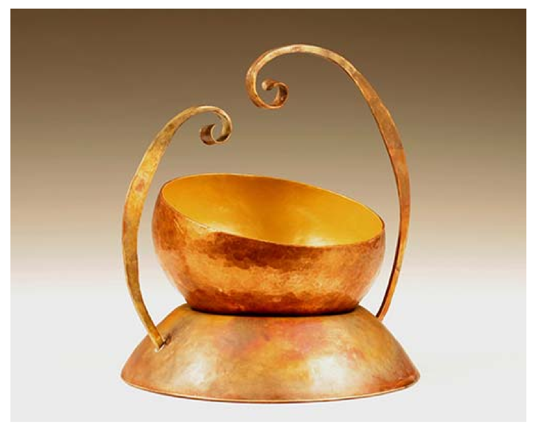
Figure 11: Ambrosia Tea Steeper.