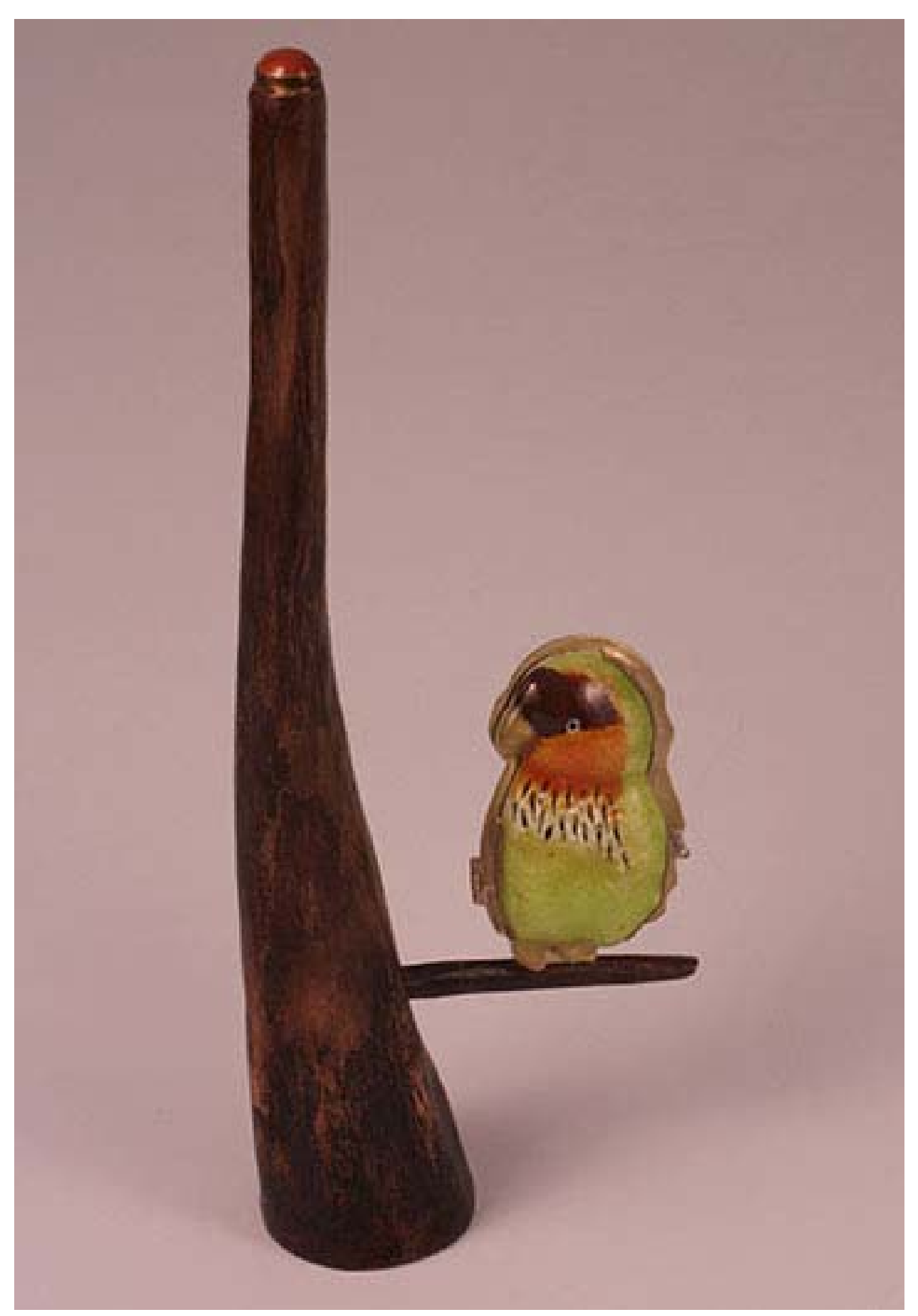
Figure 17: Love, Birds.