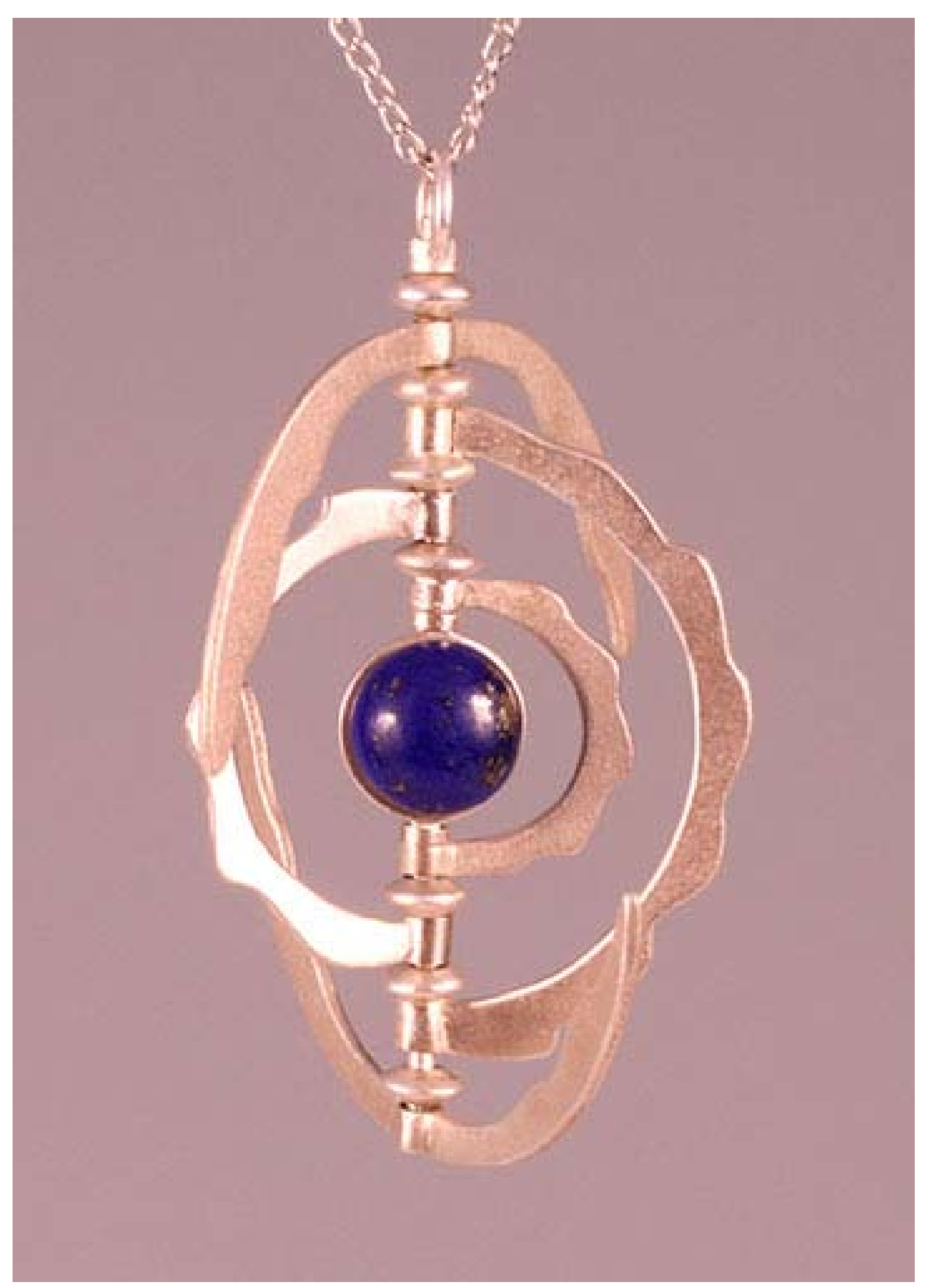
Figure 8: Cosmic Energy (2).