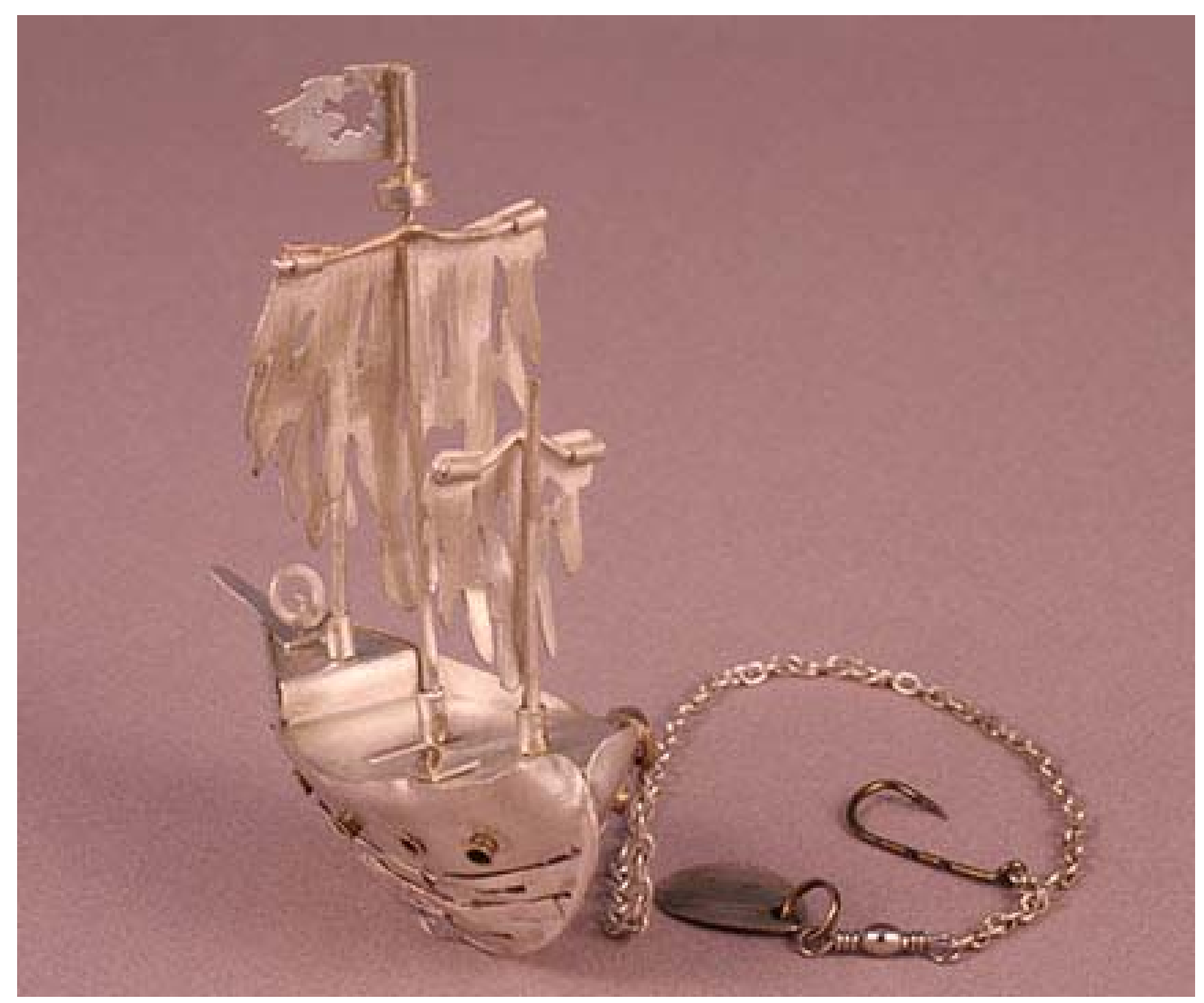
Figure 4: Pirate Tea Party (2).