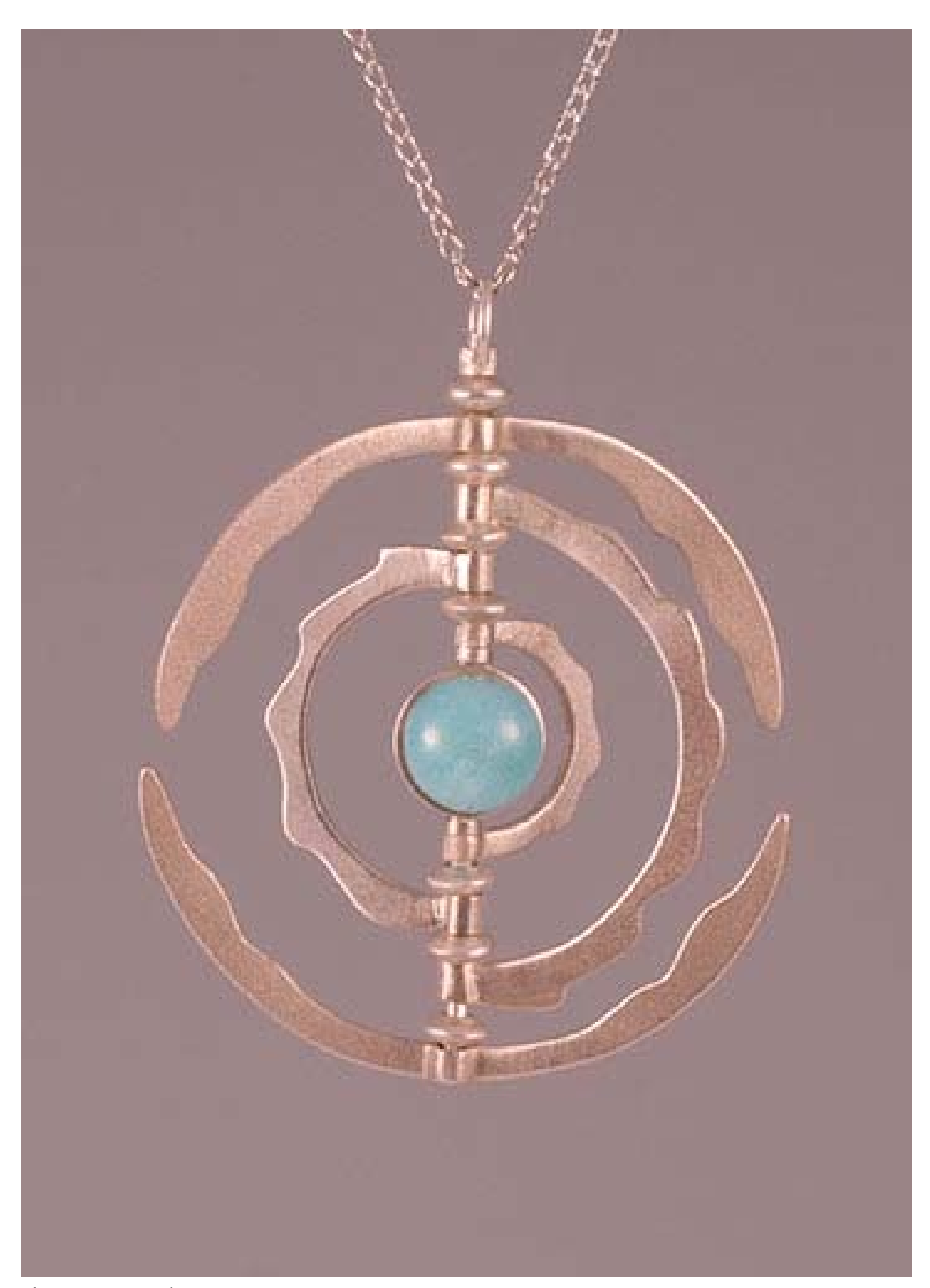
Figure 7: Cosmic Energy.