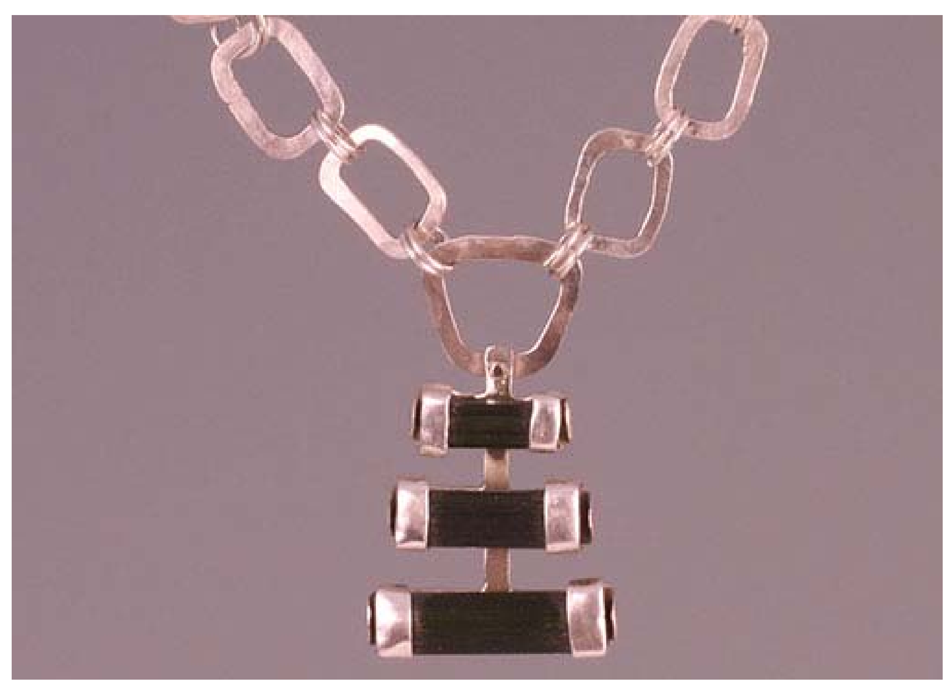
Figure 5: Tourmaline Dream.