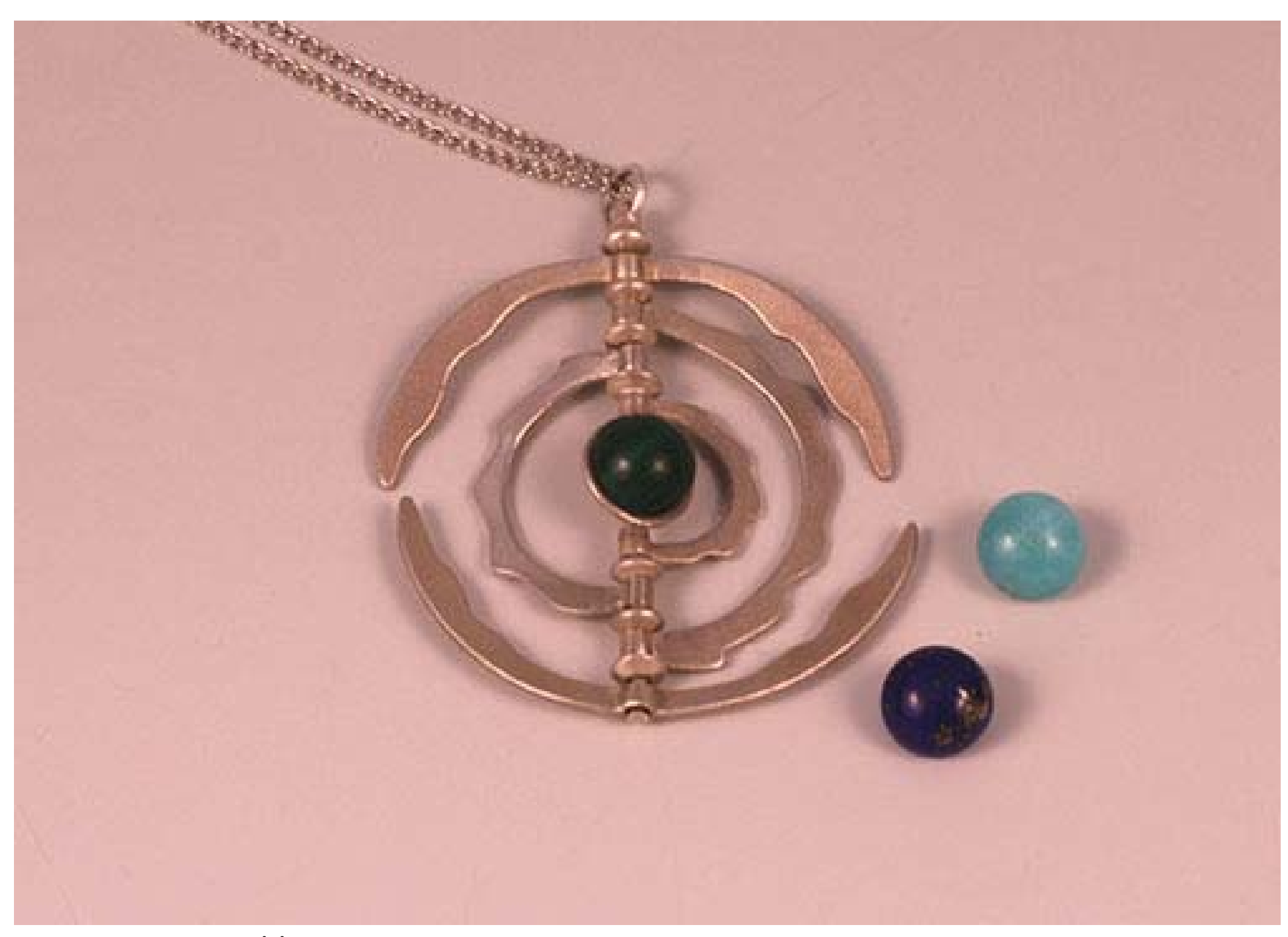
Figure 9: Cosmic Energy (3).