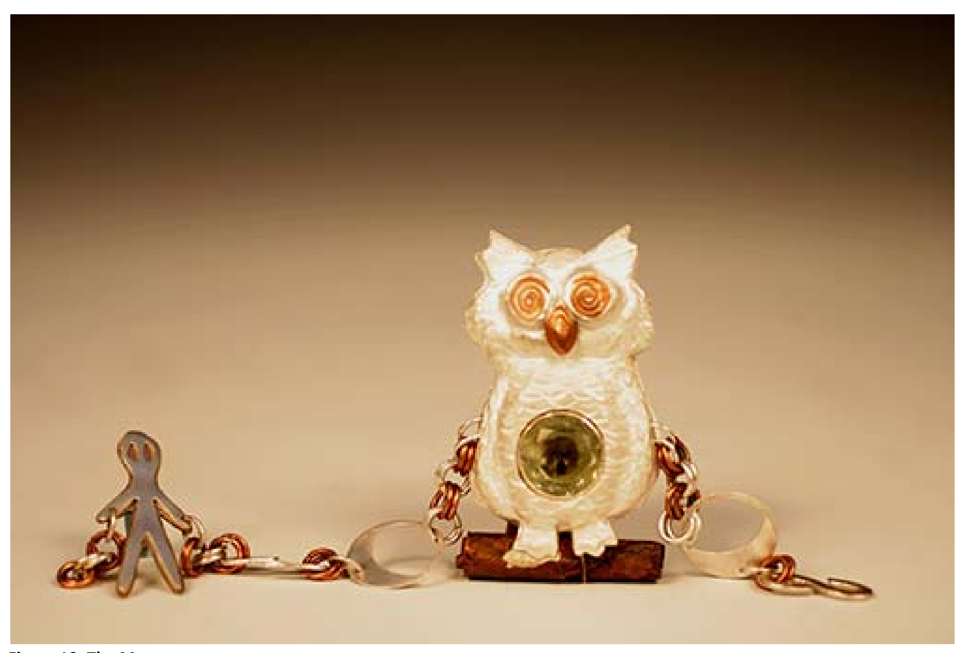
Figure 10: The Messengers.