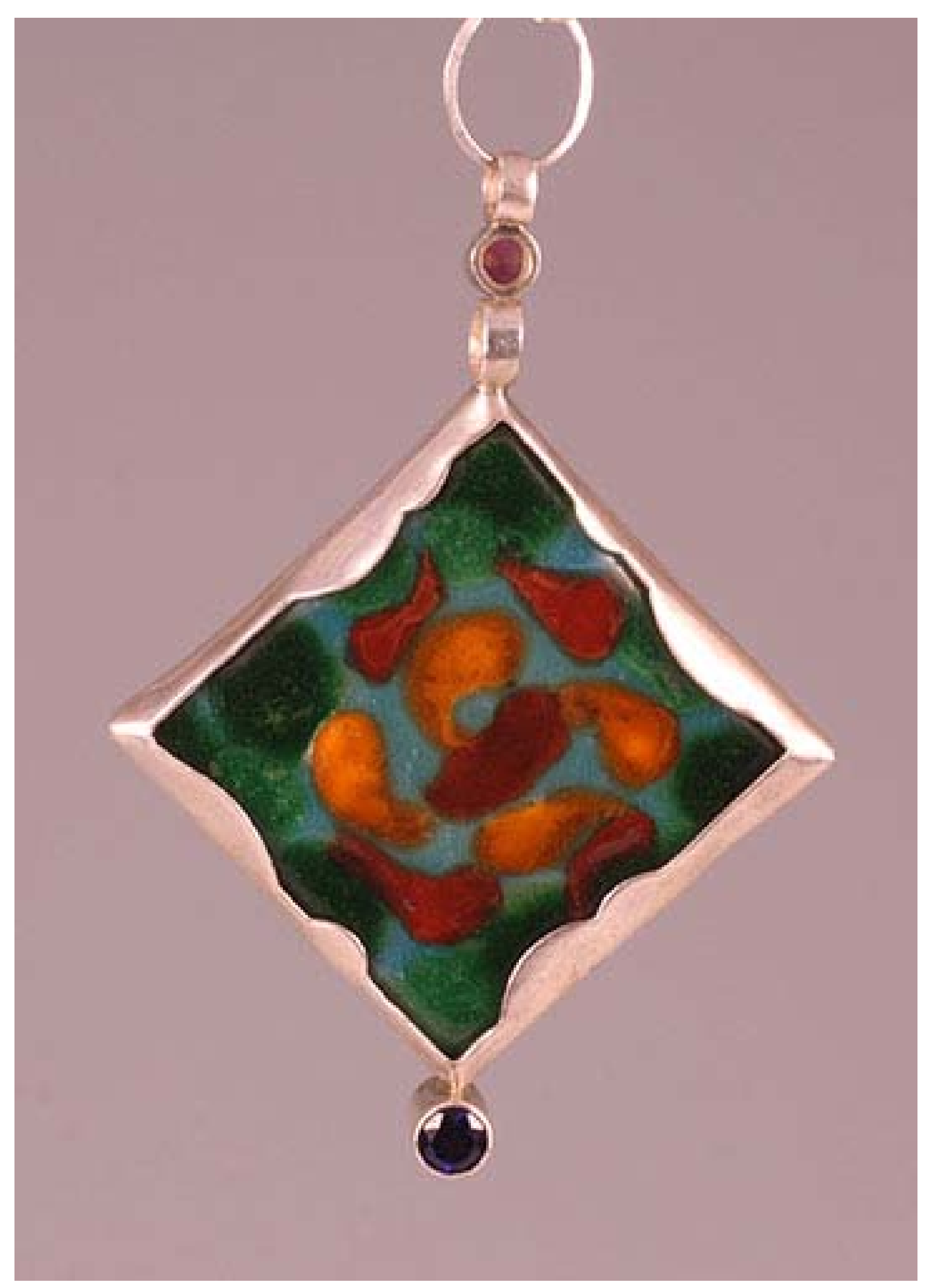
Figure 14: Koi (2).