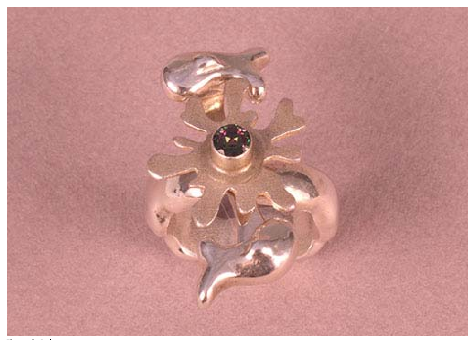
Figure 2: Balance.