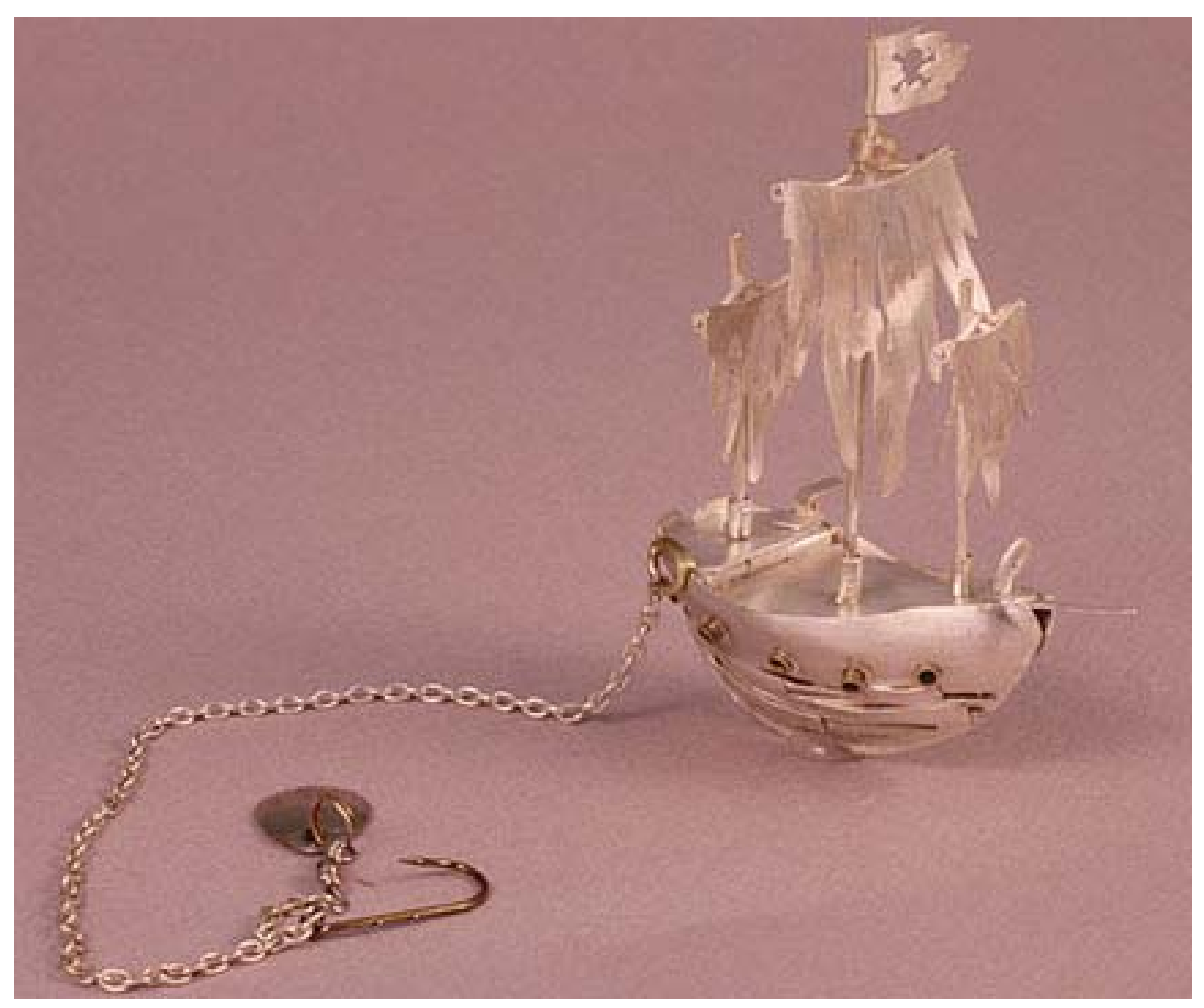
Figure 3: Pirate Tea Party.