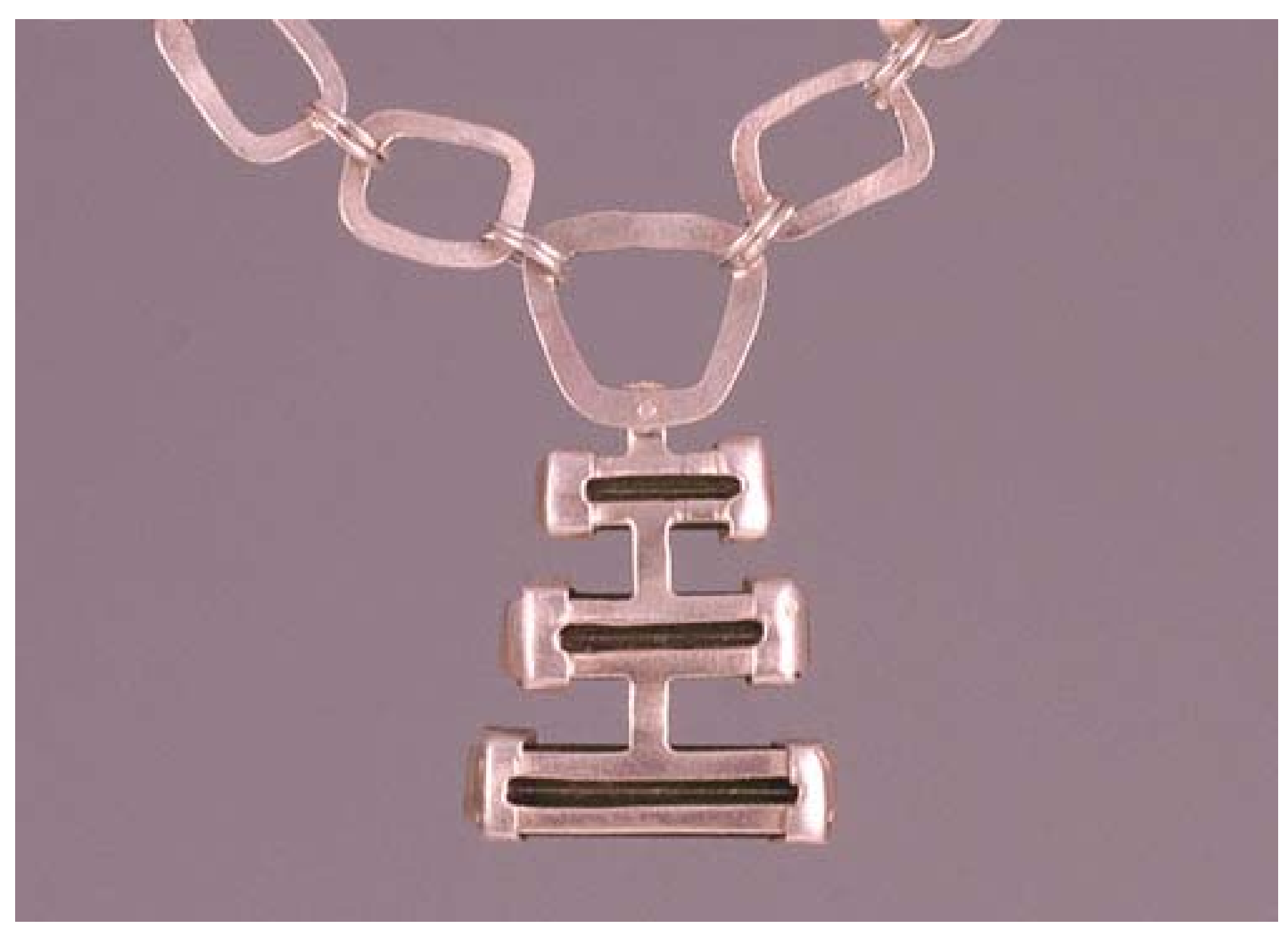
Figure 6: Tourmaline Dream (2).