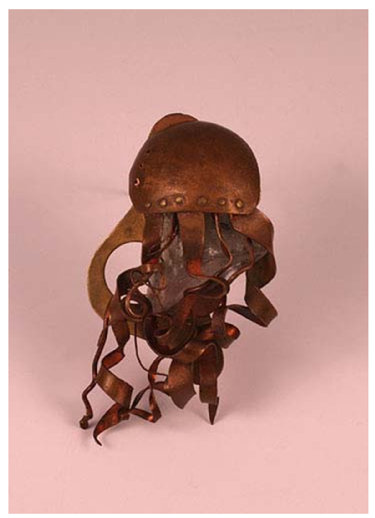
Figure 1: Jellyfishing.