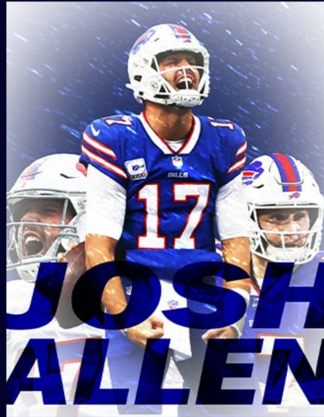
Figure 6: Josh Allen Posters