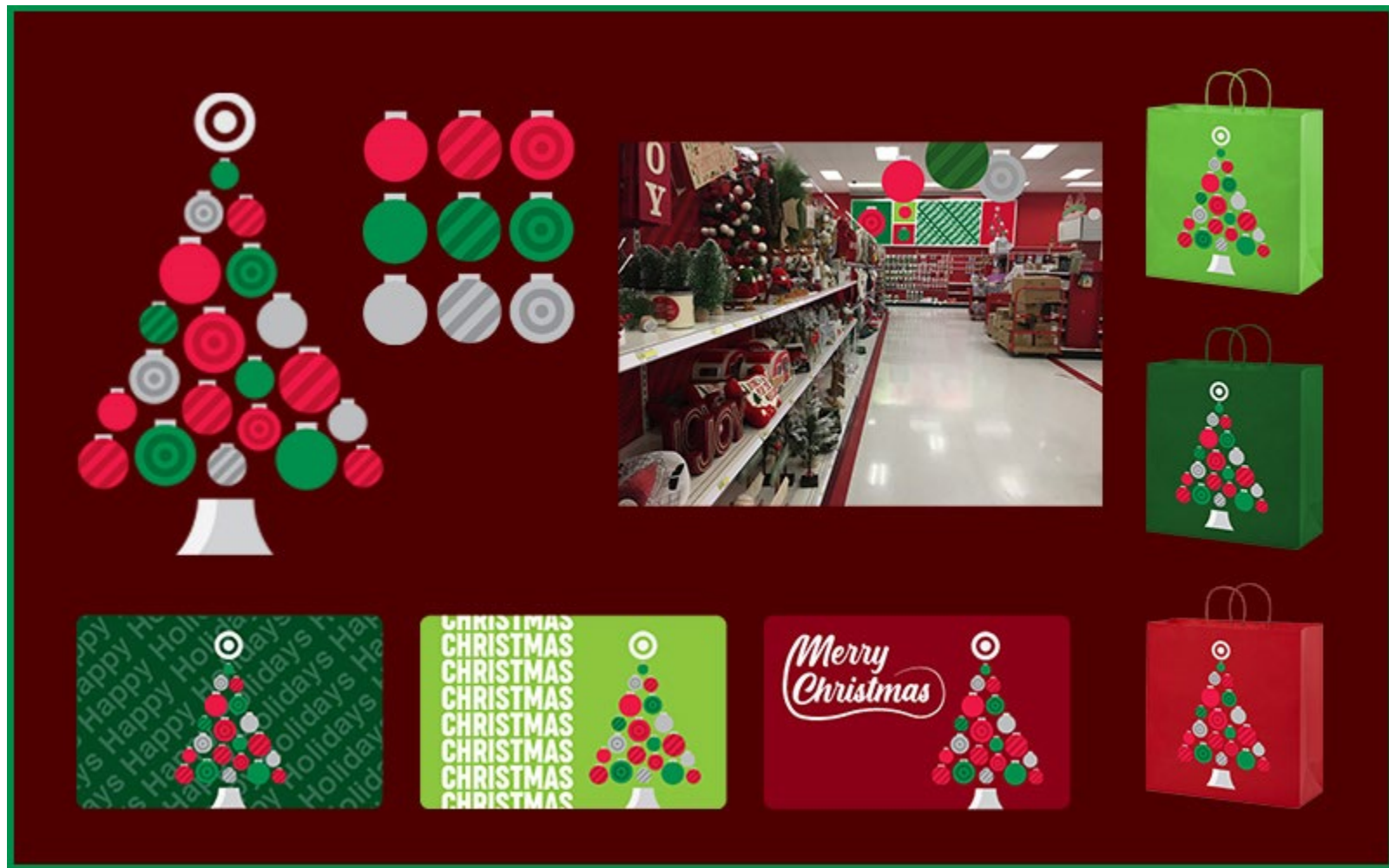
Figure 2: Target Christmas Campaign