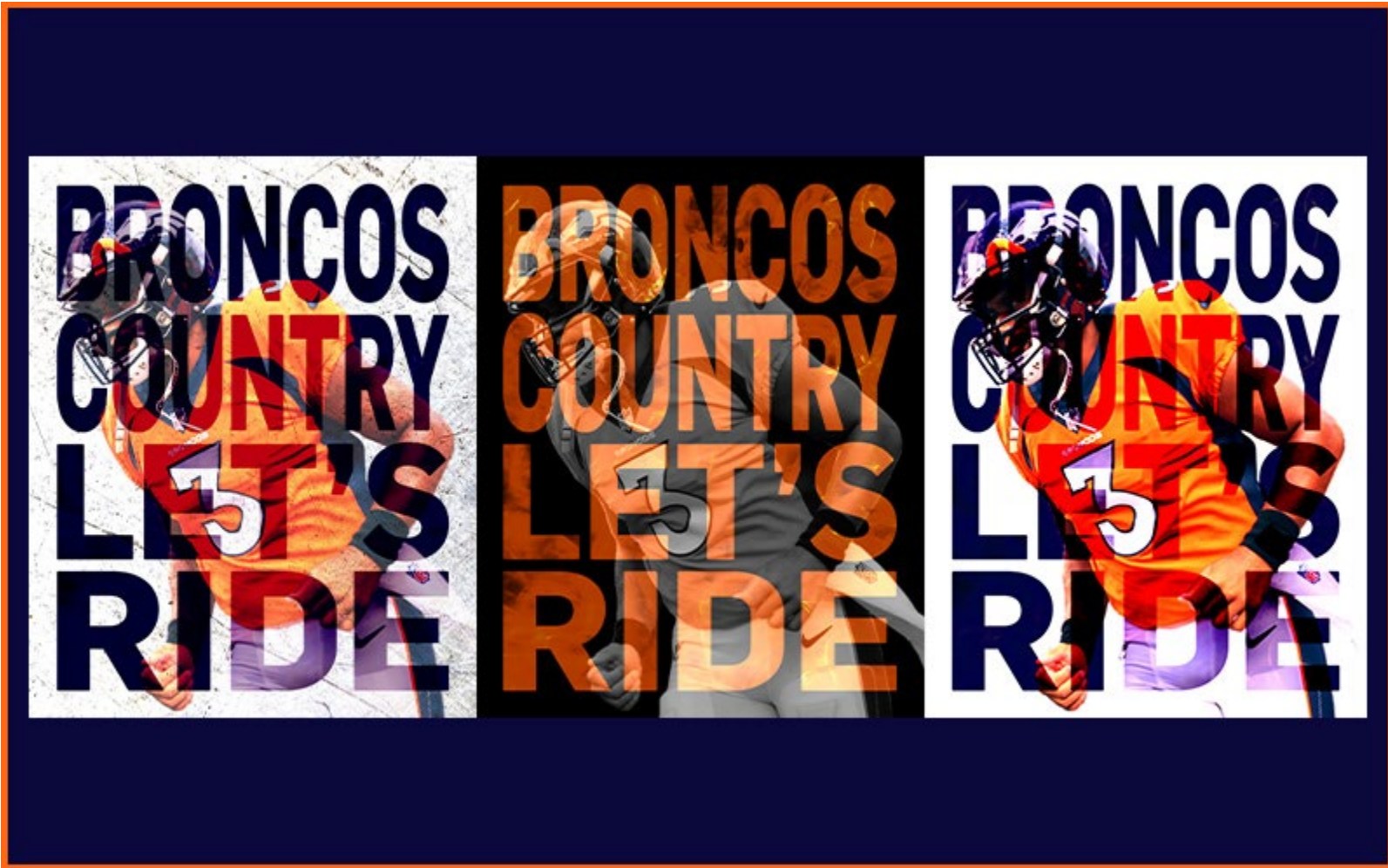
Figure 3: Russell Wilson Posters