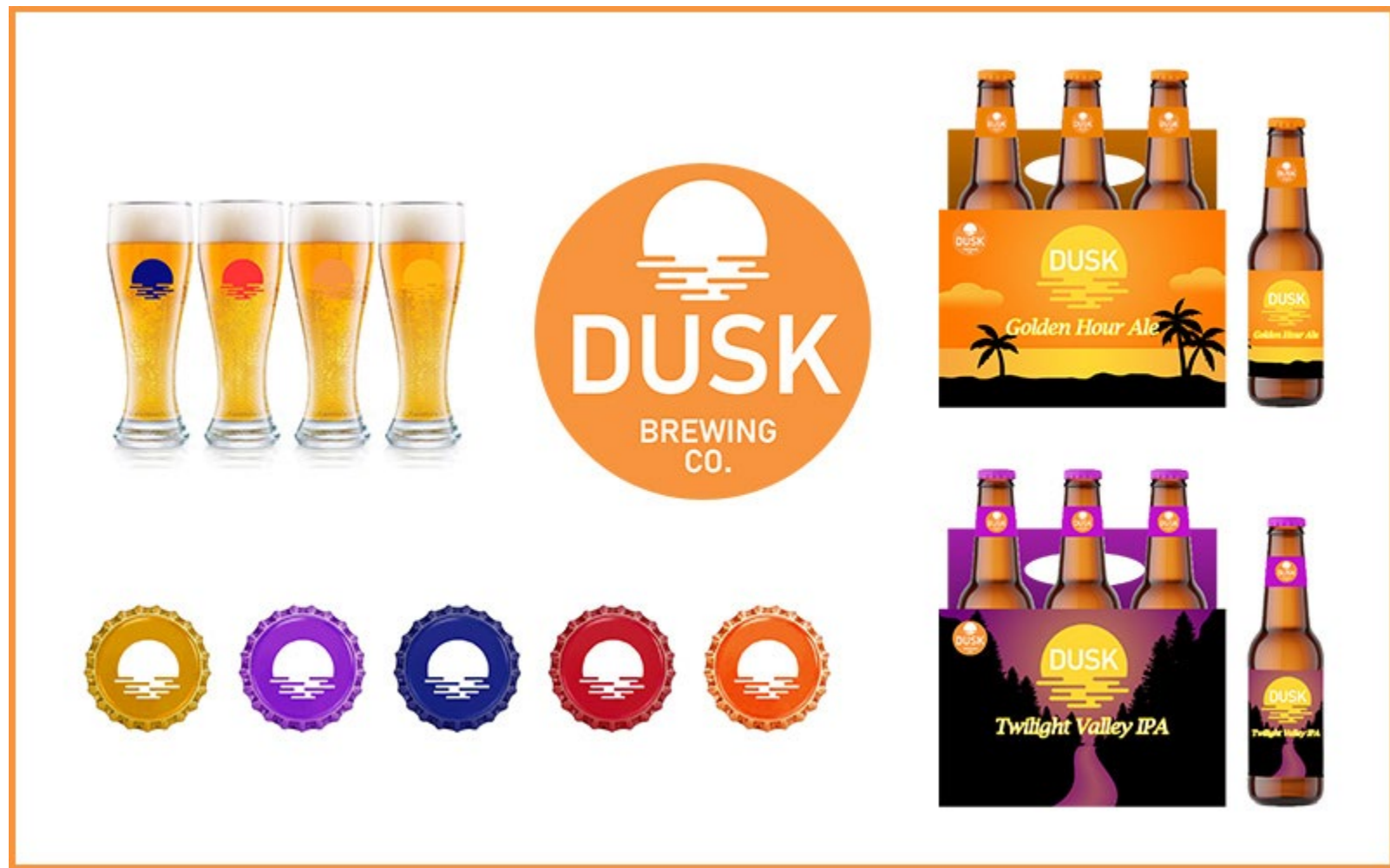
Figure 1: Dusk Brewing Co.