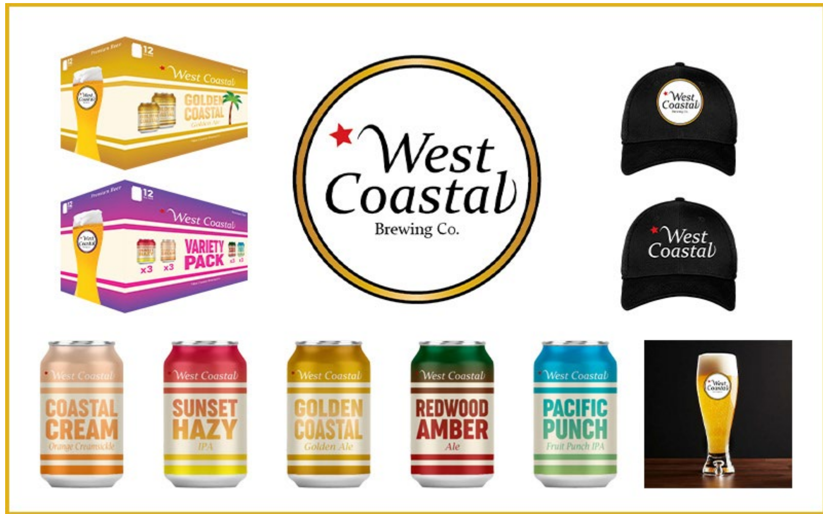
Figure 4: West Coastal Brewing Co.