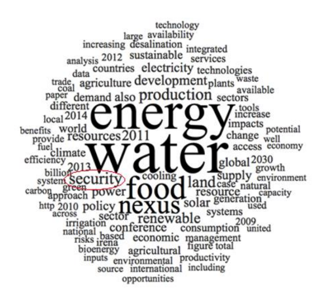
Figure 2. Word Cloud depicting 100 most frequently used words within Bonn2011 documents and IRENA nexus report

The FEW security nexus is an empirically interesting political arena because it is "driven by the alarmist rhetoric of uncertainty and scarcity" and "often couched in the language of security" (Srivastava and Mehta 2014, 1). To uncover the particularities of how security is connected to the environment and sustainable in the FEW nexus, I use discourse analysis to examine the Bonn 2011 documents and IRENA's 2015 nexus report. An initial word frequency count of these documents confirms the repeated mention of security as the sixth most frequently used word after water, energy, food, nexus, and production, as indicated in the word cloud below. Therefore, this data set can be considered as representative of a policy domain in which various actors deliberate and give meaning to security in the context of sustainable development and environmental change.