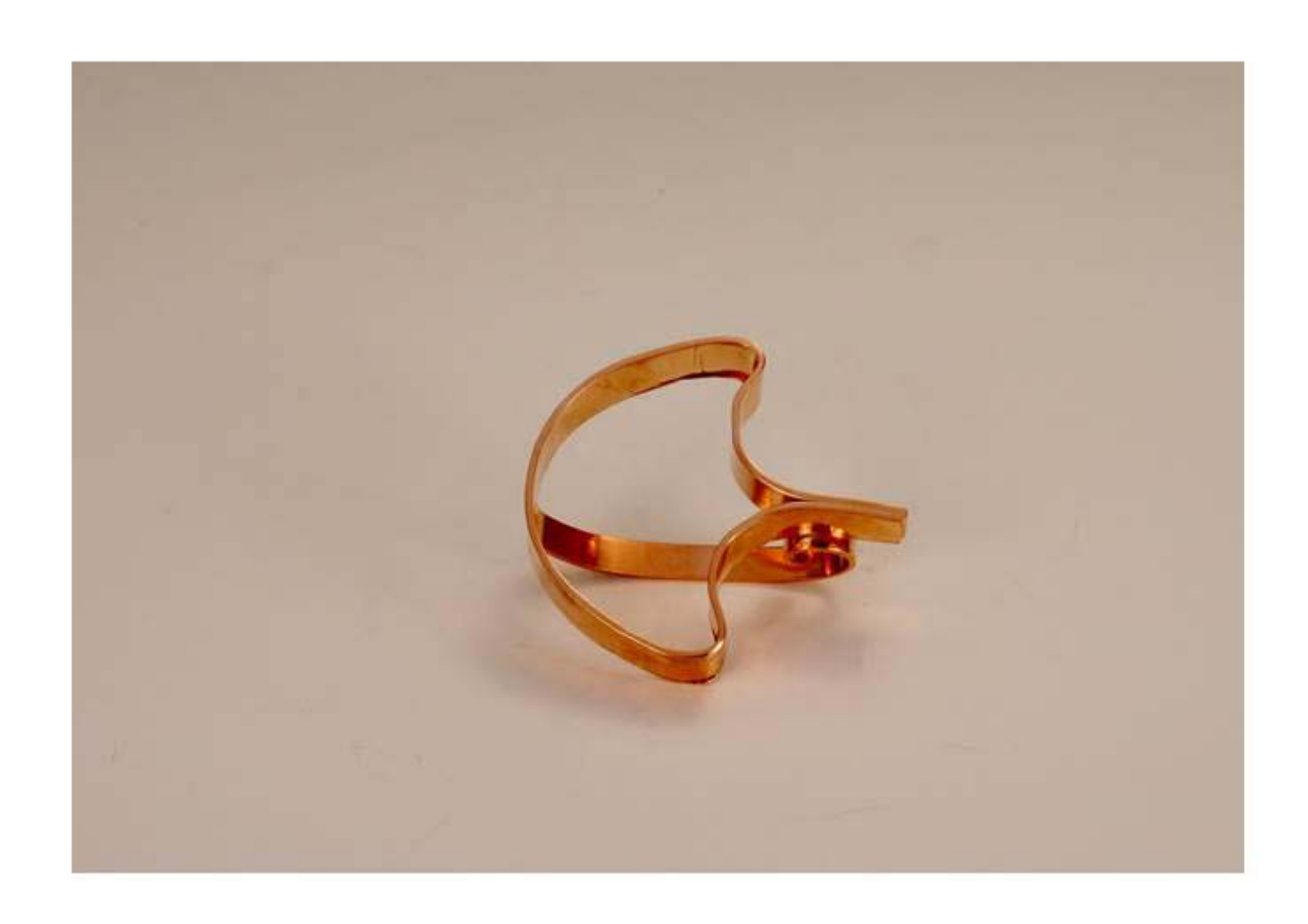
Figure 22: Palm leaf Tjap.