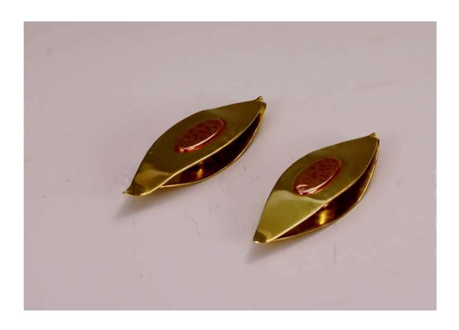
Figure 20: Tatting Shuttles.