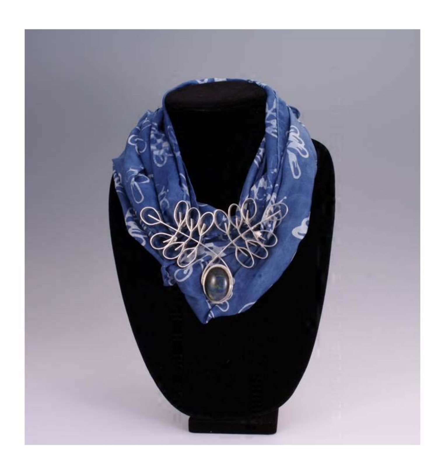
Figure 16: Magic of Indigo.