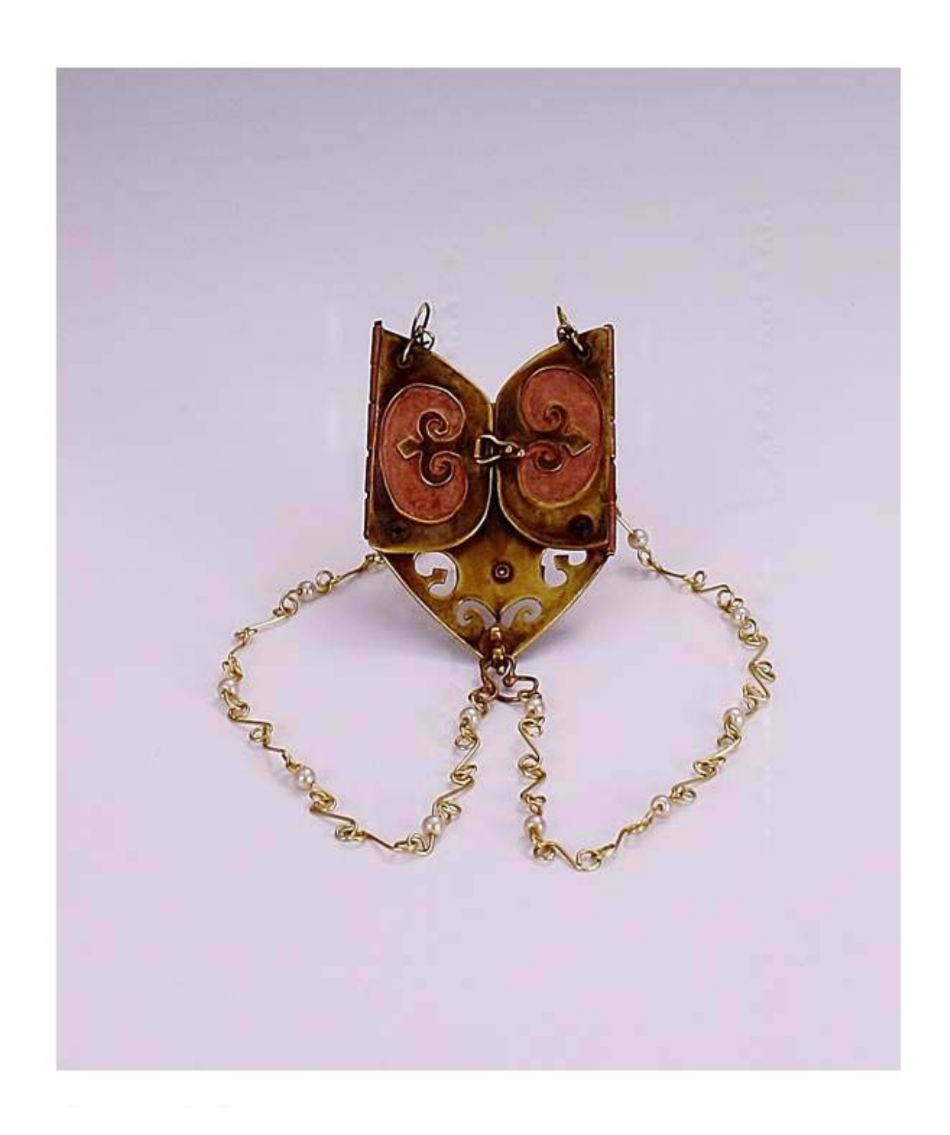
Figure 10: The Wardrobe Door (brooch).