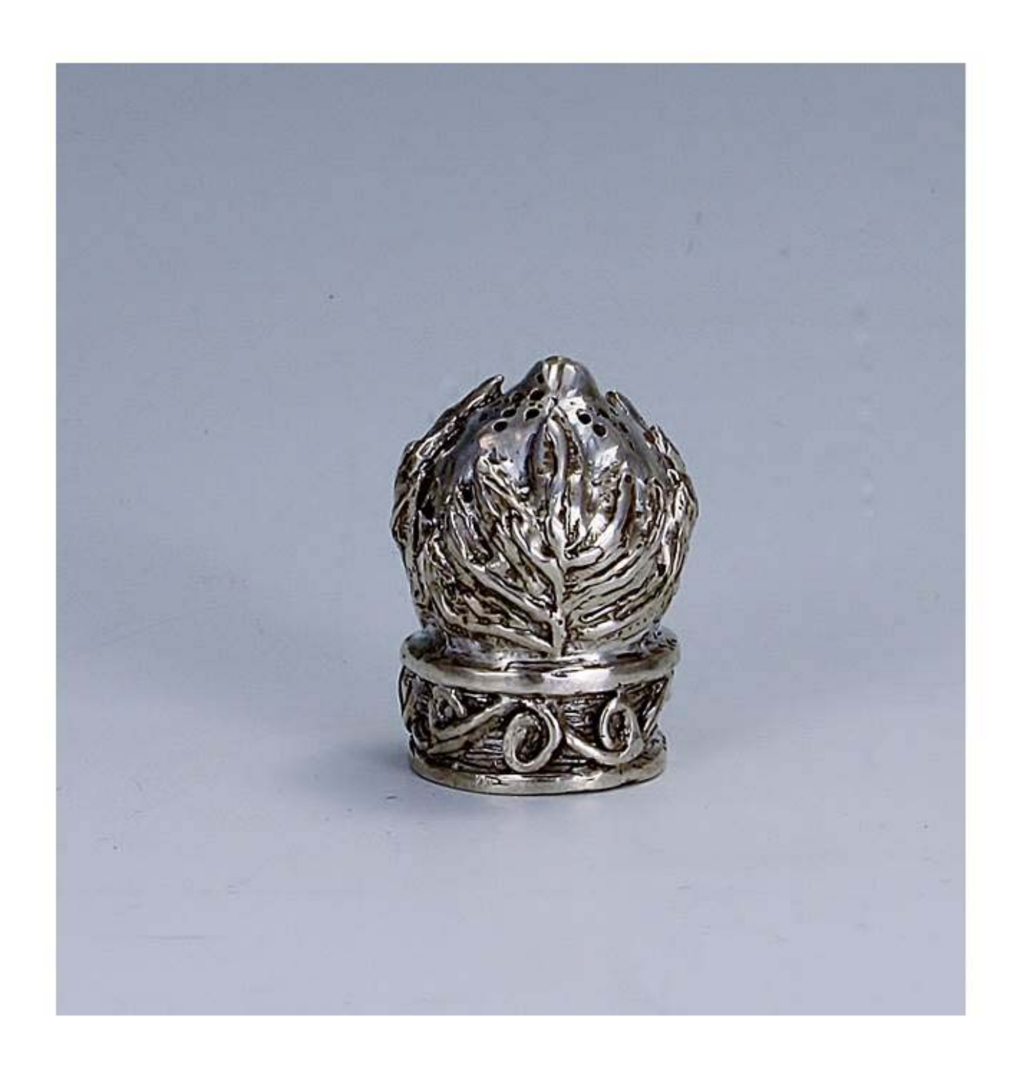
Figure 5: Cotton Boll Thimble.