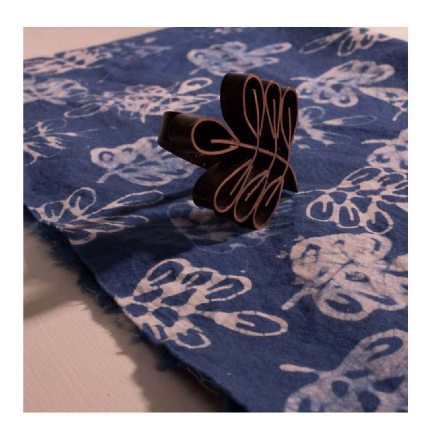
Figure 18: Batik Stamp Indigo Leaves (detail).