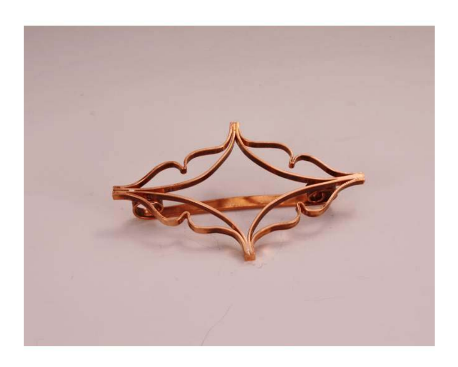
Figure 21: Medallion Tjap.