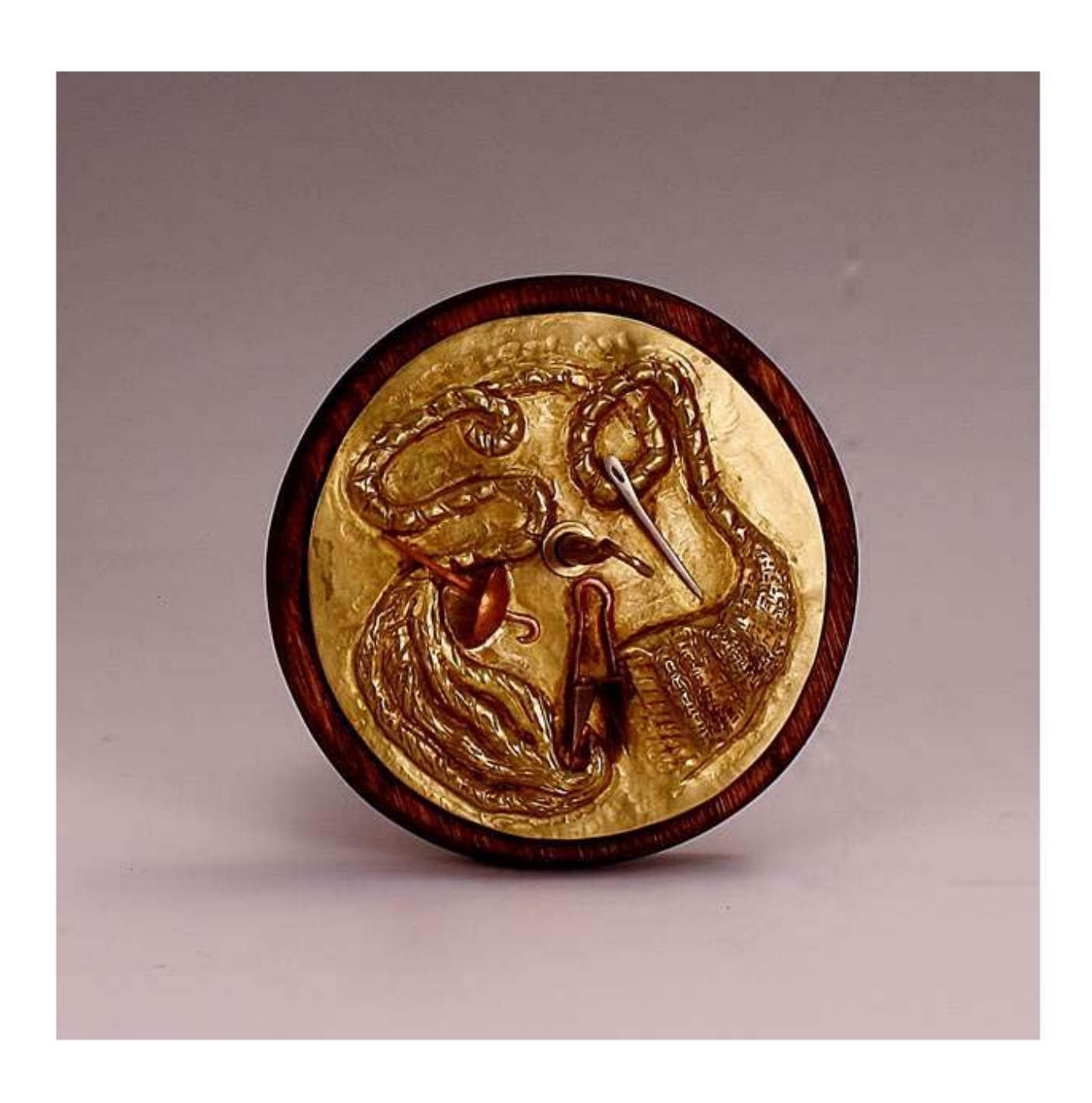
Figure 7: The Three Fates (detail).