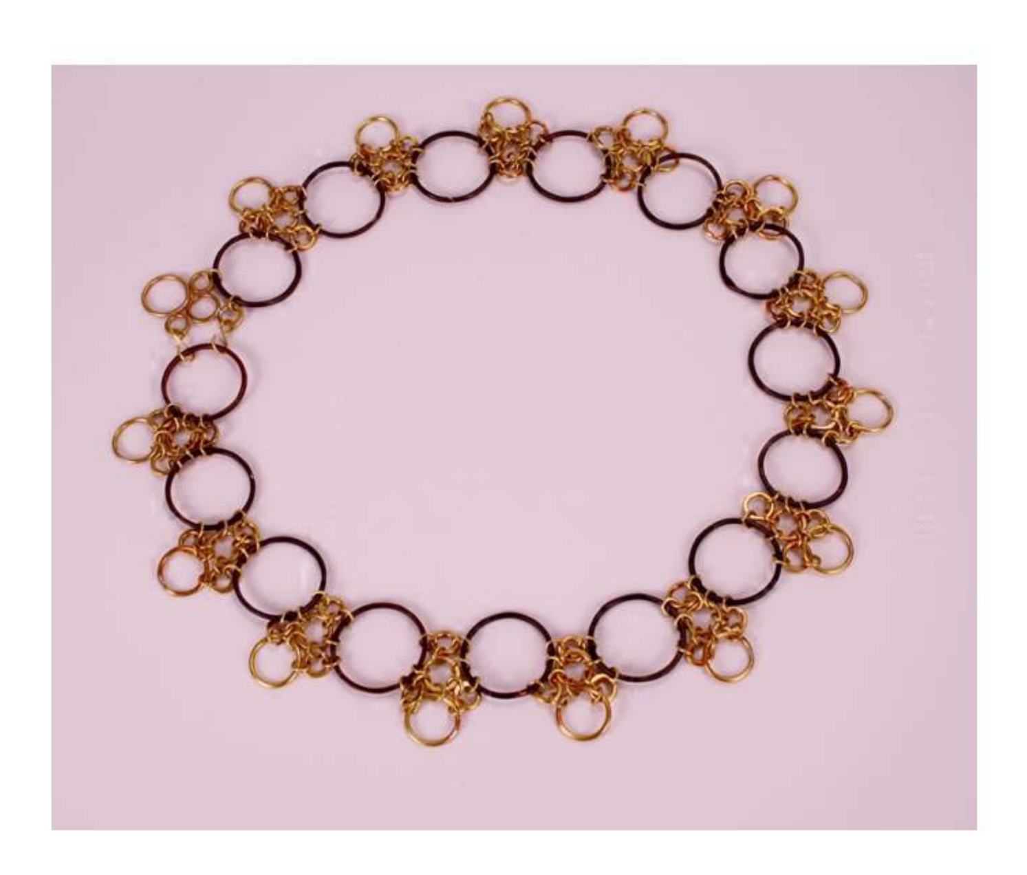
Figure 13: Ring Lace Necklace.