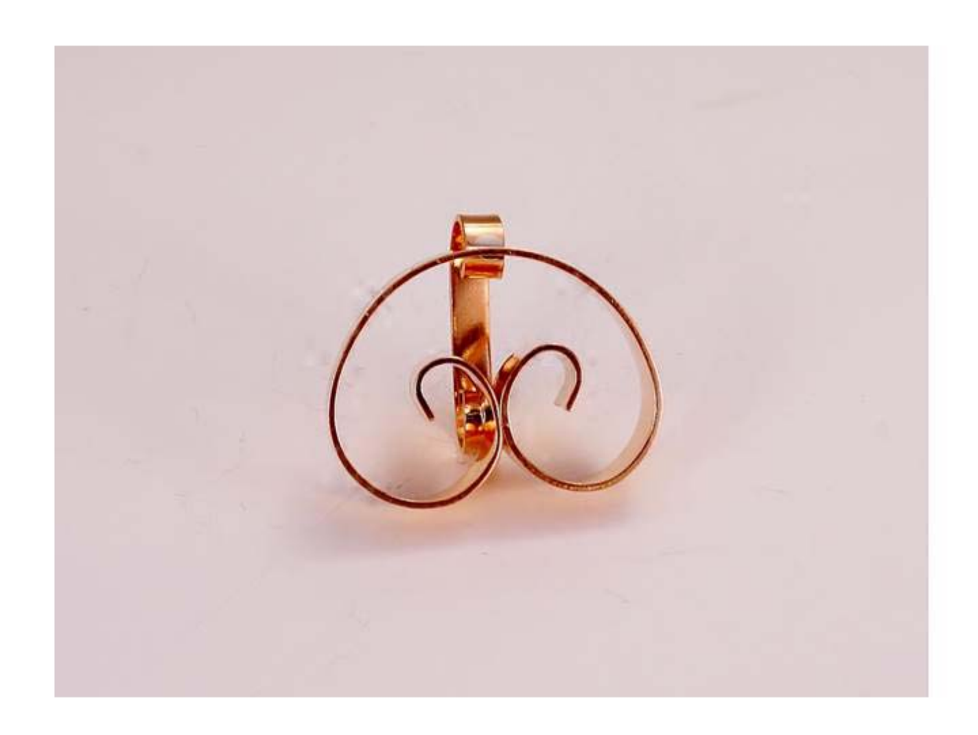
Figure 23: Arabesque Tjap.