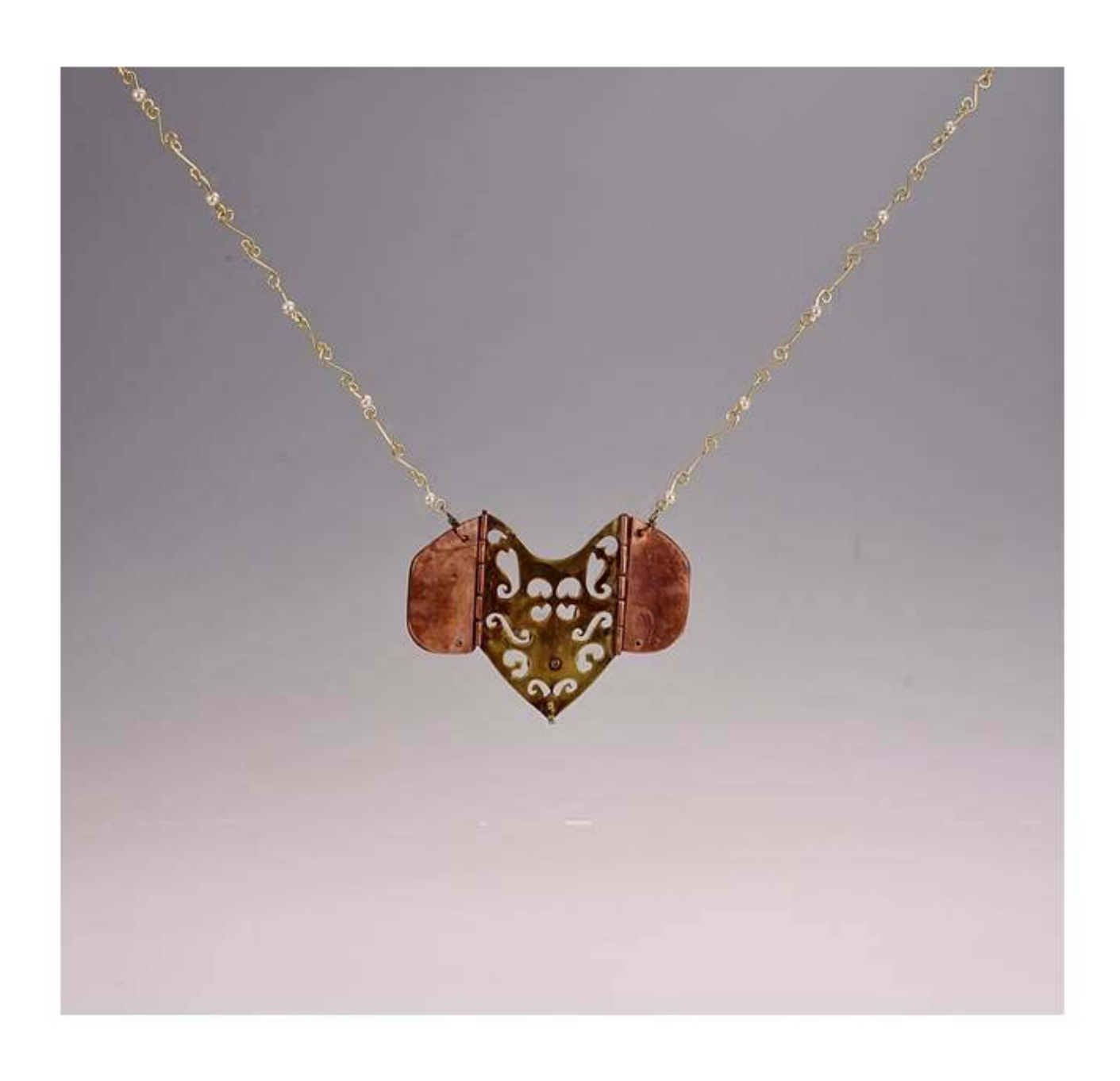
Figure 12: The Wardrobe Door (pendant open).