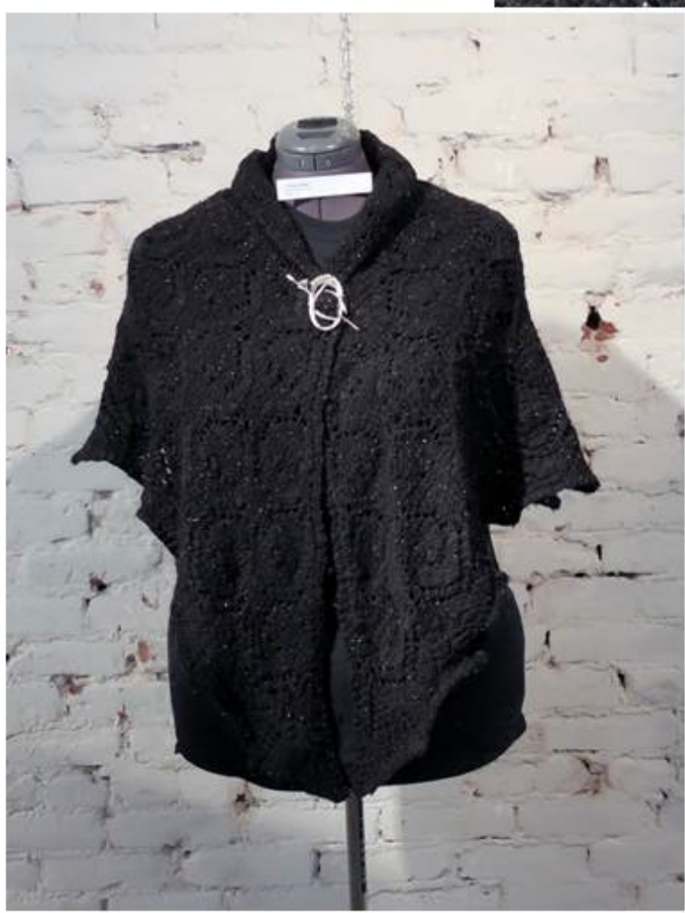
Figure 9: Transitions of Flax (in use).