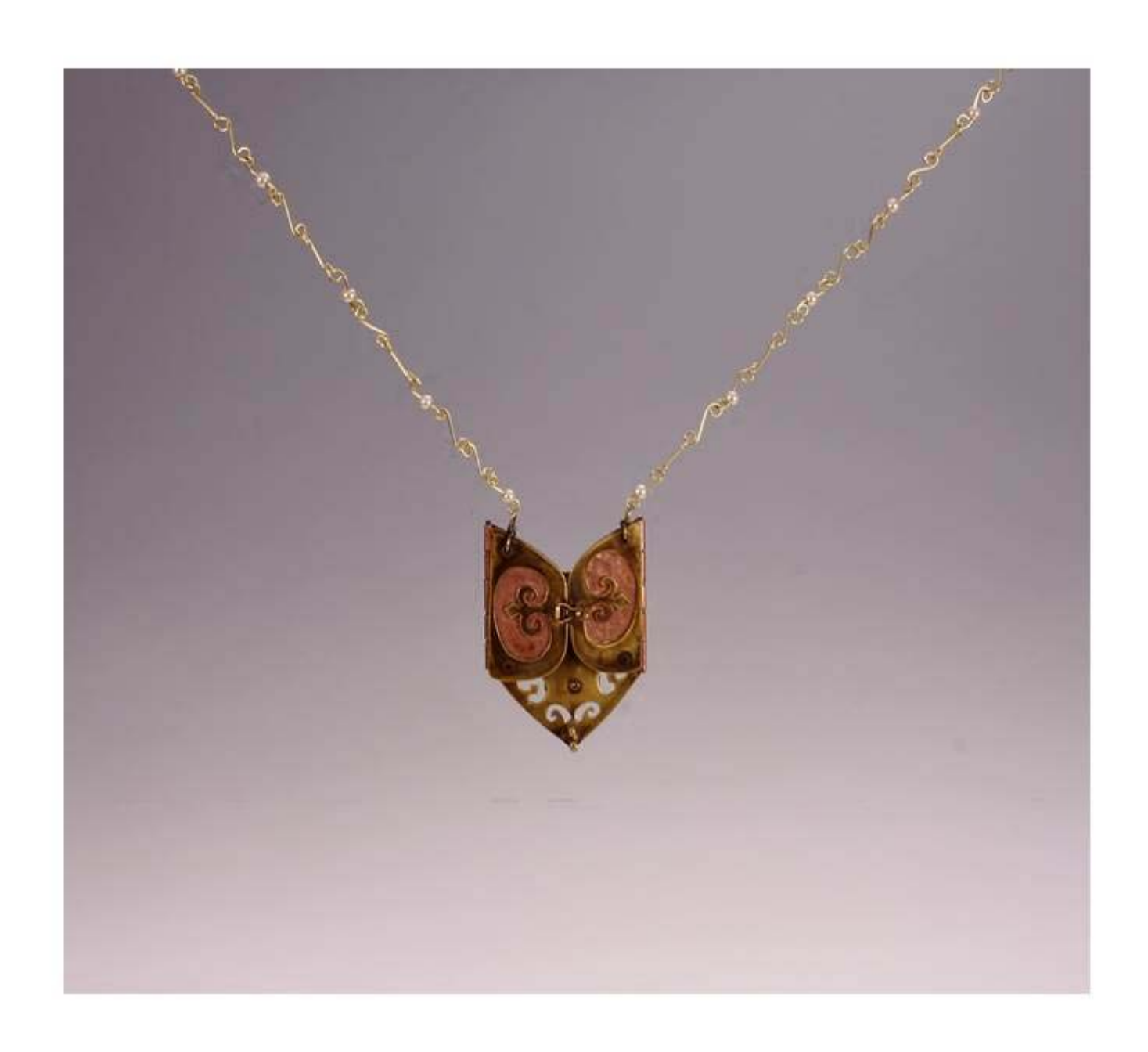
Figure 11: The Wardrobe Door (pendant).