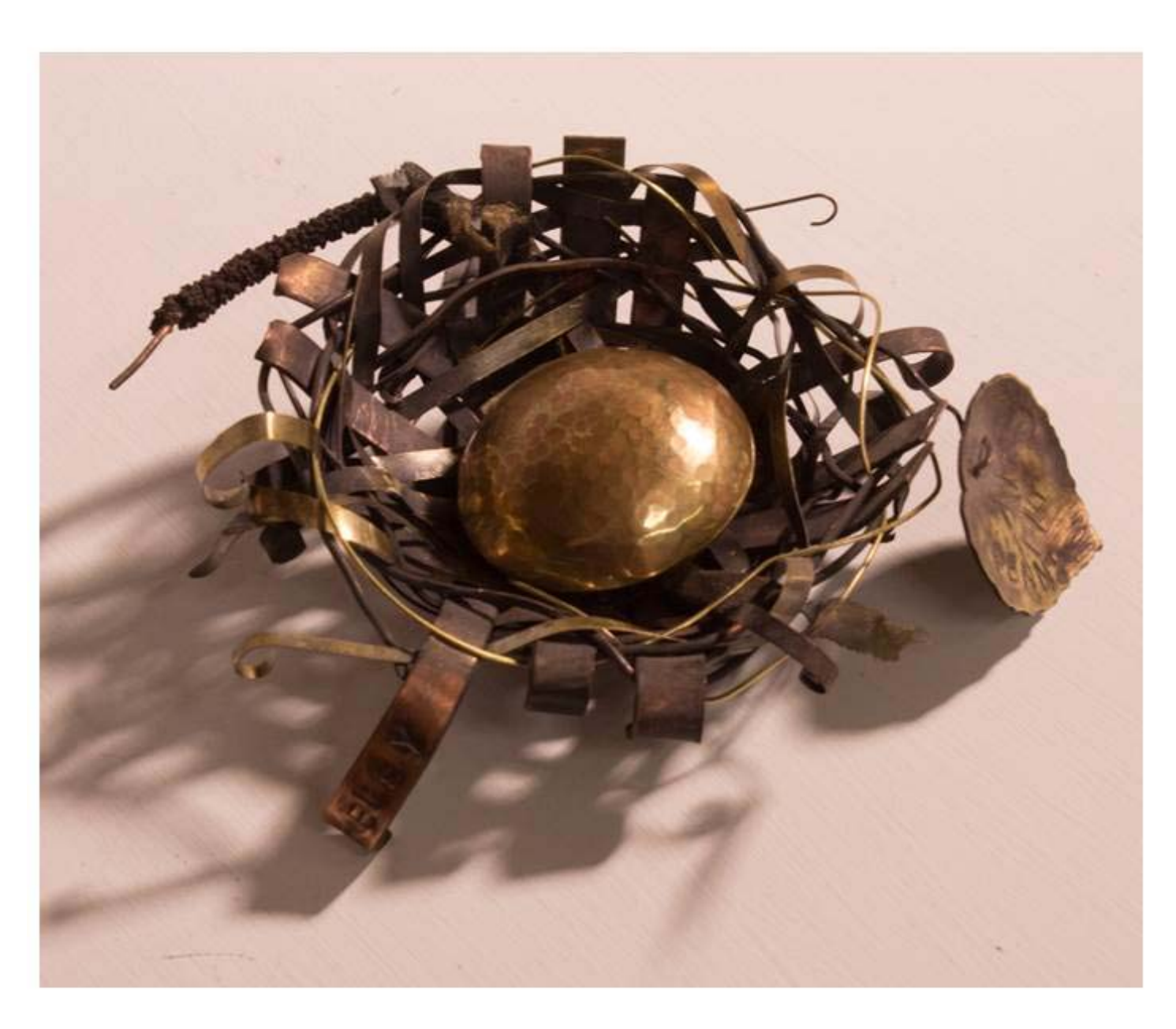
Figure 4: Nest.