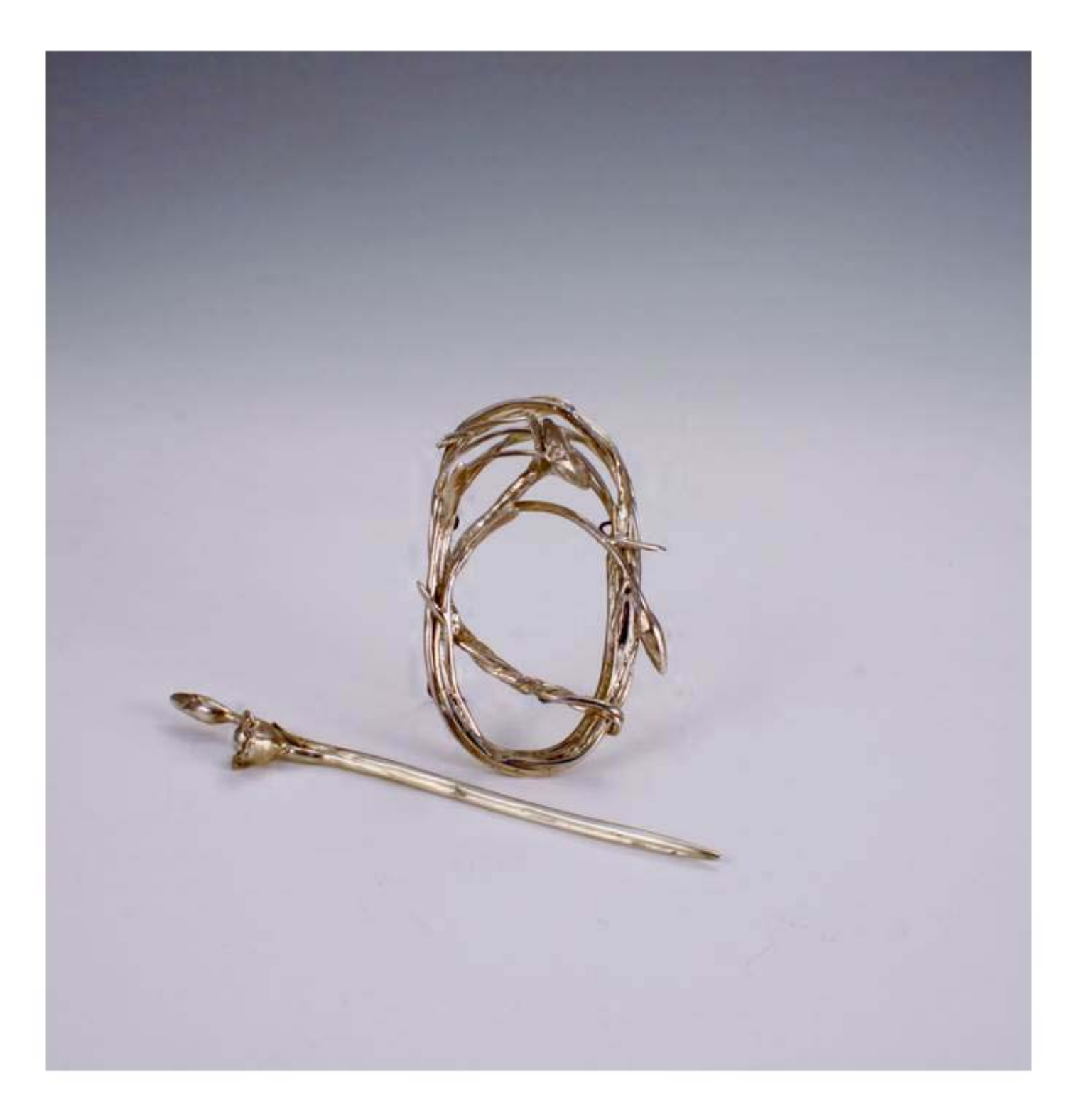
Figure 8: Transitions of Flax.