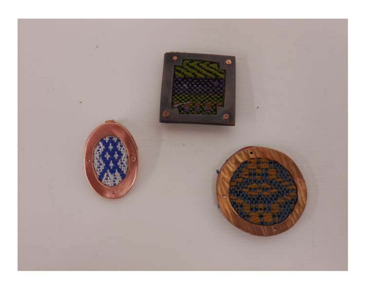
Figure 24: Woven Portraits.