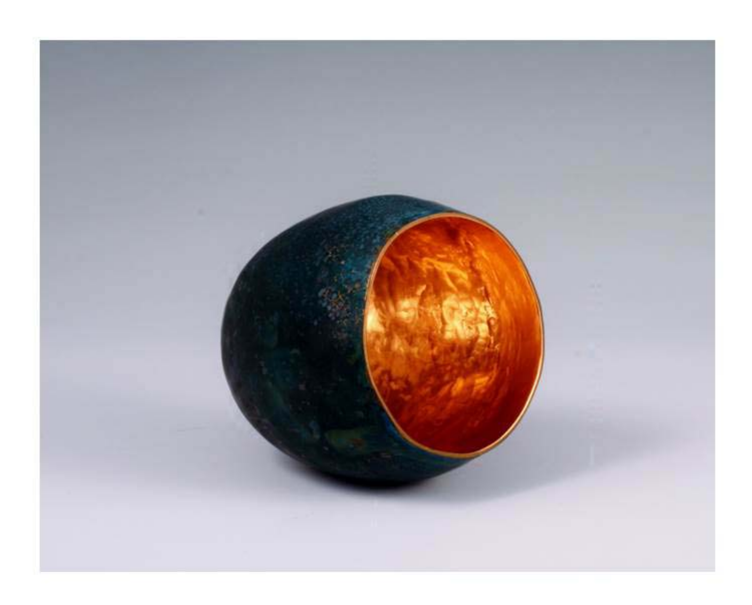
Figure 3: Light Seed.