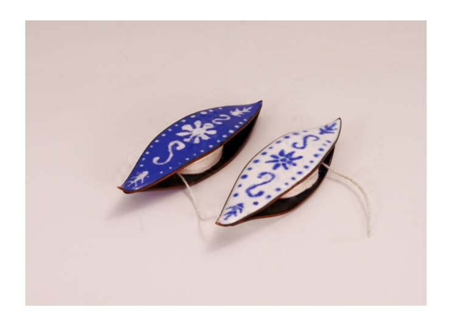
Figure 19: Blue Flower Tatting Shuttles.