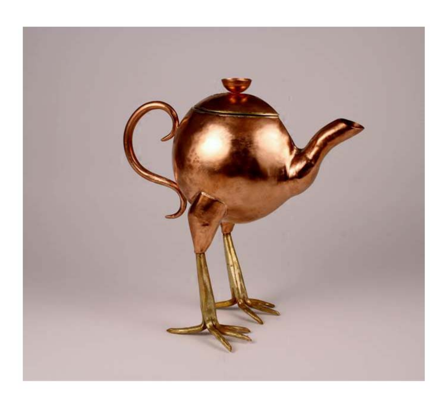
Figure 1: Teapot on Chicken Legs.