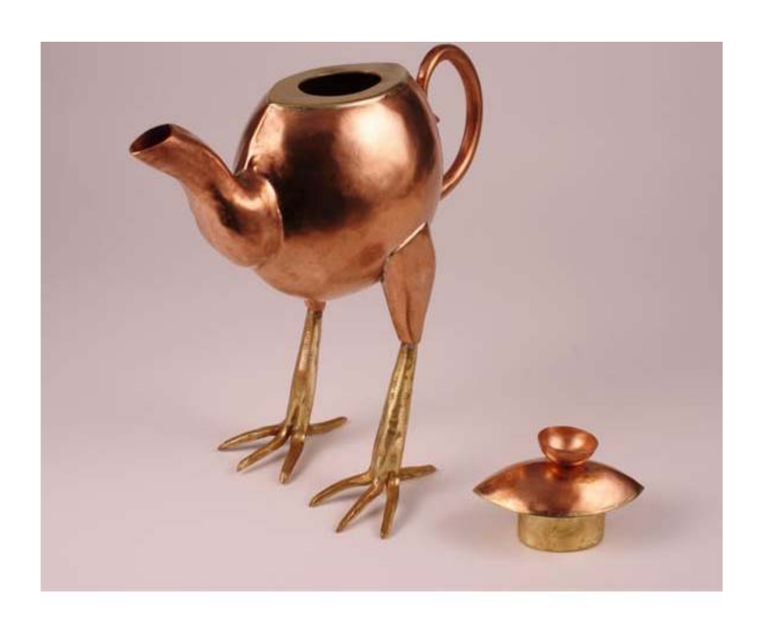
Figure 2: Teapot on Chicken Legs (detail).