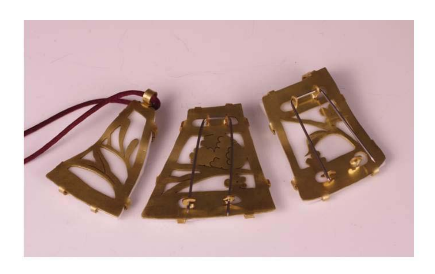
Figure 15: Three Sisters (back).