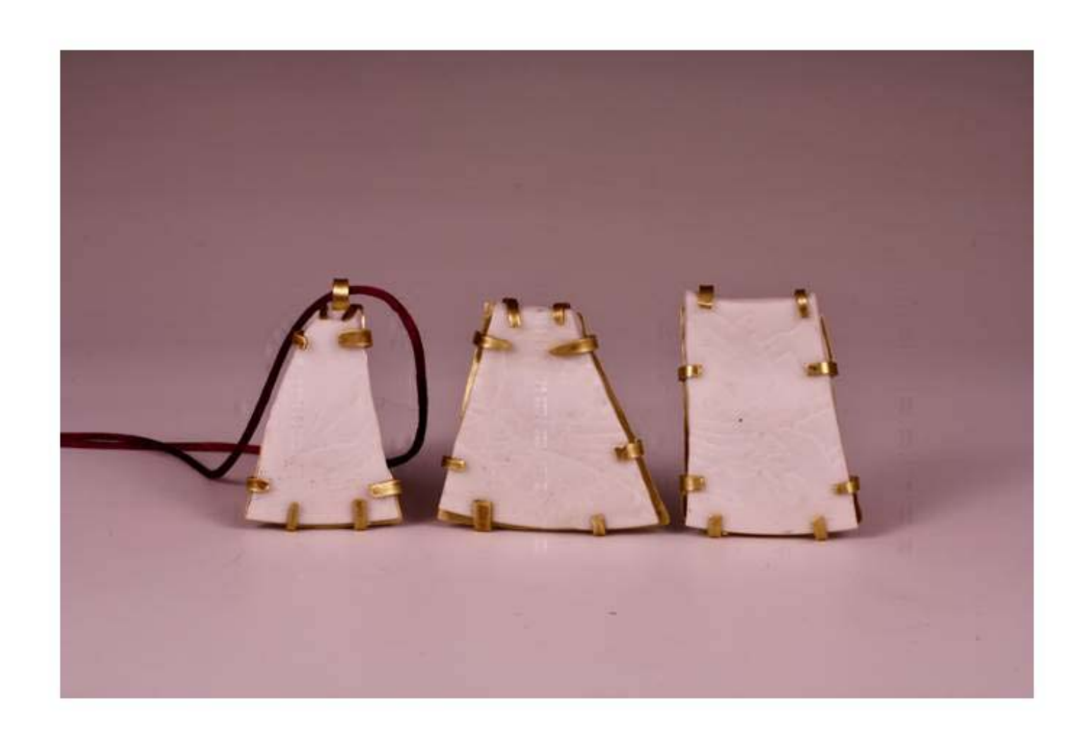
Figure 14: Three Sisters.