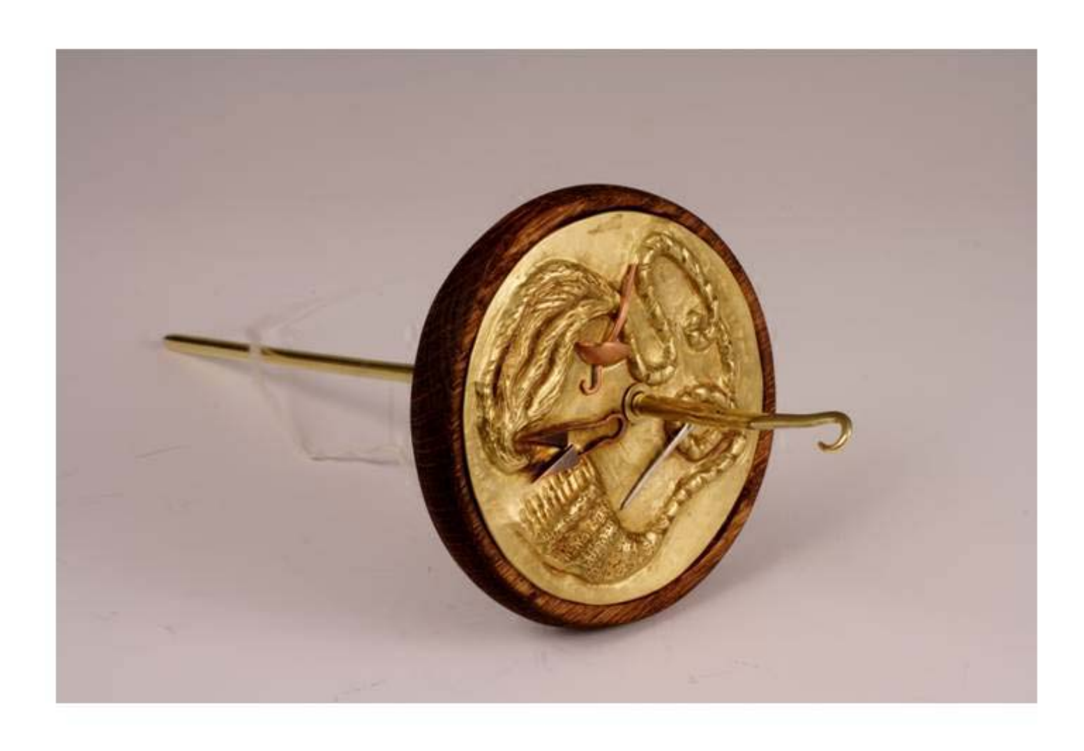
Figure 6: The Three Fates.