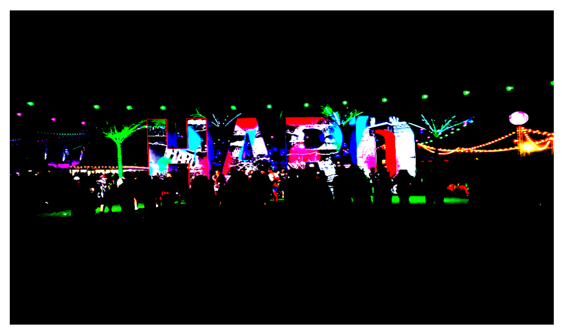
Figure 1

The staged photo areas offer points of connection for participants to engage their peers in