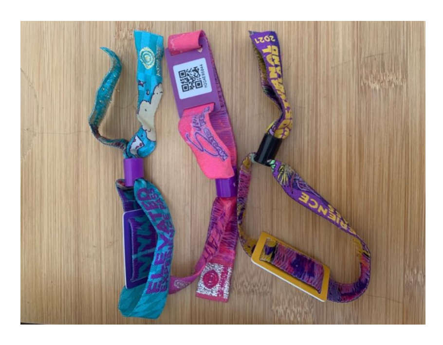
Figure 5

The preceding narrative illustrates the rhetorical significance of wristbands as an artifact of rave attire. Attire norms are so ingrained within EDM communities that it was a comical faux pas for me to put on my wristband without first knowing how to wear it. In other words, loose enough to be removed intact but not so open as to risk losing it or alarming security. For ravers, wristbands document where, when, and how many times they have participated in community performances. They indicate when two ravers have attended the same show, how deeply invested they might be in the scene, and what sorts of experiences they have opted into within the rave community. The significance of wristband collections was evident in my peers' extensive collection that evening. Their collection resembled the thousands I also observed on others at each of the three festivals I attended. The thicker collections covered ravers' entire forearms almost like a removable sleeve tattoo. Bands sitting atop bands grabbed my attention with their colorful tones and busy designs stacked on top of one another to look like a whole pack of lifesaver candies resting tightly next to one another. The more I participated, the thicker my own stack of bands became. I decided, out of practicality, to wear my bands on my right arm and