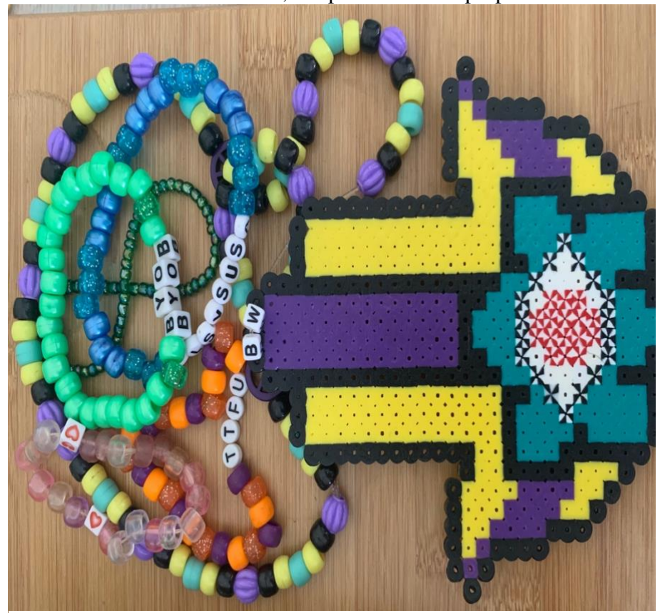
Figure 2

out without provocation and seemingly indiscriminately. As a bashful but grateful and observant recipient of some of these verbal affirmations, I experienced a disproportionate amount of