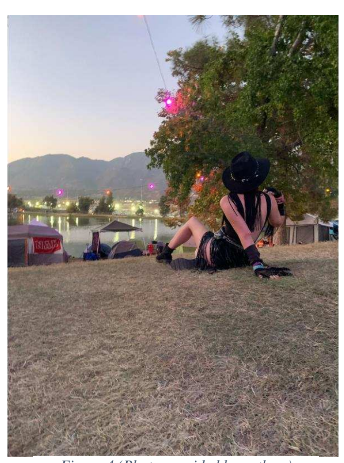
Figure 4

Out of respect for EDM communities and the parameters of my IRB approval, I do not feature photos of other ravers in this manuscript. Instead, I worked to embody the spirit of ravers' character development with my costumes. From HARD to Beyond to Nocturnal, I continuously incorporated my deeper understanding of rave rituals into my fits. At the same time, the individuality of my character developed in line with the PLUR ideal of respect. EDM communities perform respect through verbal affirmations of autonomy and individuality in costume design. The previous narrative vignette demonstrates an important moment in the costume design phase that built my character. At first, I tried to adhere heavily to the community rituals of gender performance. Only after removing the synthetic hair I had seen braided into other young women's looks and donning my favorite hat and adorned with a token of my