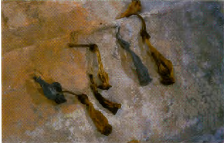
11. Body Is An Experiment of the Mind. Detail