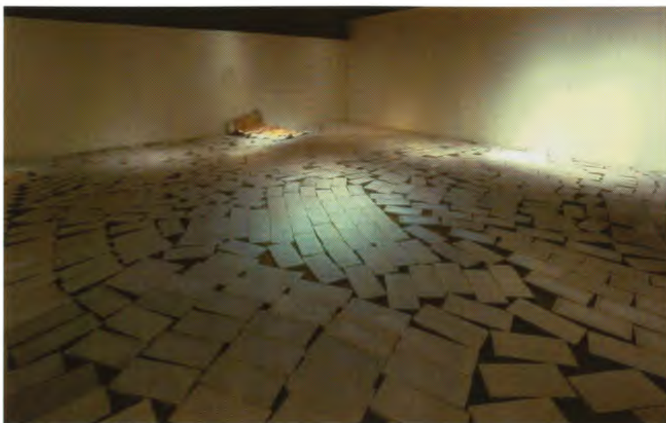
5. Body Is An Experiment of the Mind. Main Room