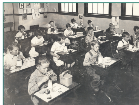
"School Room,"

The Library is in the process of organizing the collection and creating finding aids to help patrons search the collection and more broadly widen access to the materials. The Library hopes to raise an additional $25,000 in the coming year to support this project so that images can be digitized and made available online and so that exhibits can be developed within the Morgan Library and around campus. With support, the Historic Photographic Collection will help ensure that CSU history remains a vital part of the present University experience for generations to come. Finding aids for the glass plate negatives and silver nitrate negative prints will be available for public use in fall of 2007. Current requests for collection materials can be made by contacting Archives & Special Collections (specialcollections@library.colostate.edu or 970.491.1844).