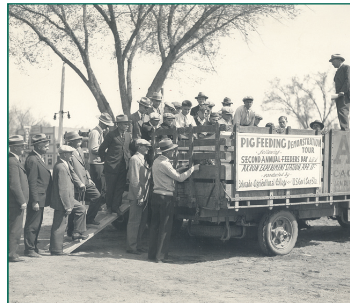
"Pig Feeding Tour," Extension Service Photographs, April 1930.