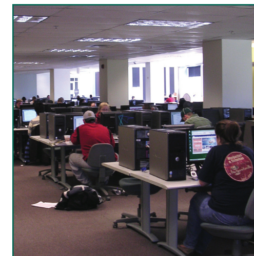
CSU Students crowd the Electronic Information Center in Morgan Library during finals week, taking advantage of electronic resources for last minute research.

In 2006, patrons borrowed 17,235 books from other regional libraries.