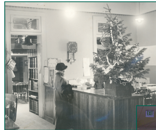
Top: The Loan Desk at CSU Library in December, Circa 1920. Below: The Information Desk in Morgan Library, December 2006.