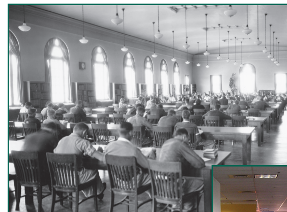
Top: Students in Library on the Oval, Circa 1928. Below: Students studying for finals in Morgan Library, Decem- ber 2006.