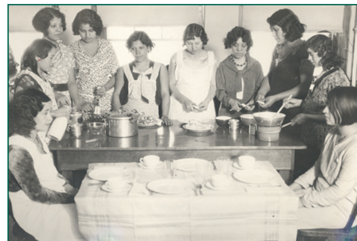
"Spanish Cooking Class," Extension Service Photographs, January 1933.