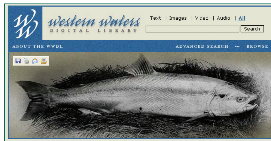
The online “entrance” to the Western Waters Digital Library