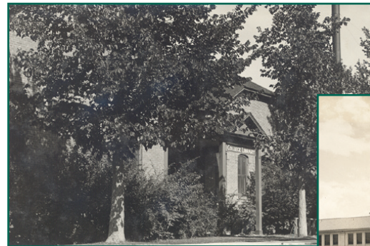
Top: College Library from 1905–1920. Middle: Library on the Oval, 1929. Below: Morgan Library, 2006.

As Colorado State University campus has grown, so has its library. From a small corner reading room in Old Main to the Library on the oval to the extensive renovations planned for the interior of Morgan Library, the face of CSU Libraries has expanded over the years to reflect an ever increasing campus population. Although digital technology has changed the nature of resources and the days of hushed hallways have all but disappeared, one thing remains the same—the Library is the heart of campus. This photo spread of images from the Historic Photographic Collection of the University Archive celebrates the Library, past and present. After all, the Library has always been a favorite place on campus (especially now that you can cram-a-latte.)