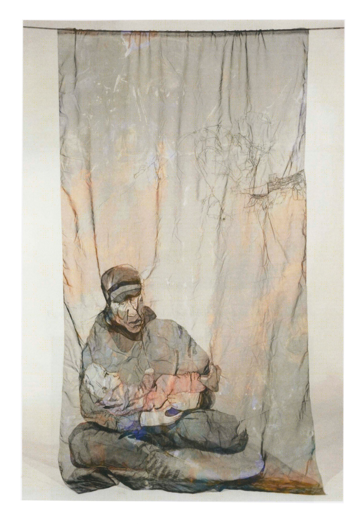
Figure 6: Stop, Hand dyed nylon fabric, Appliqué, Machine-stitched.