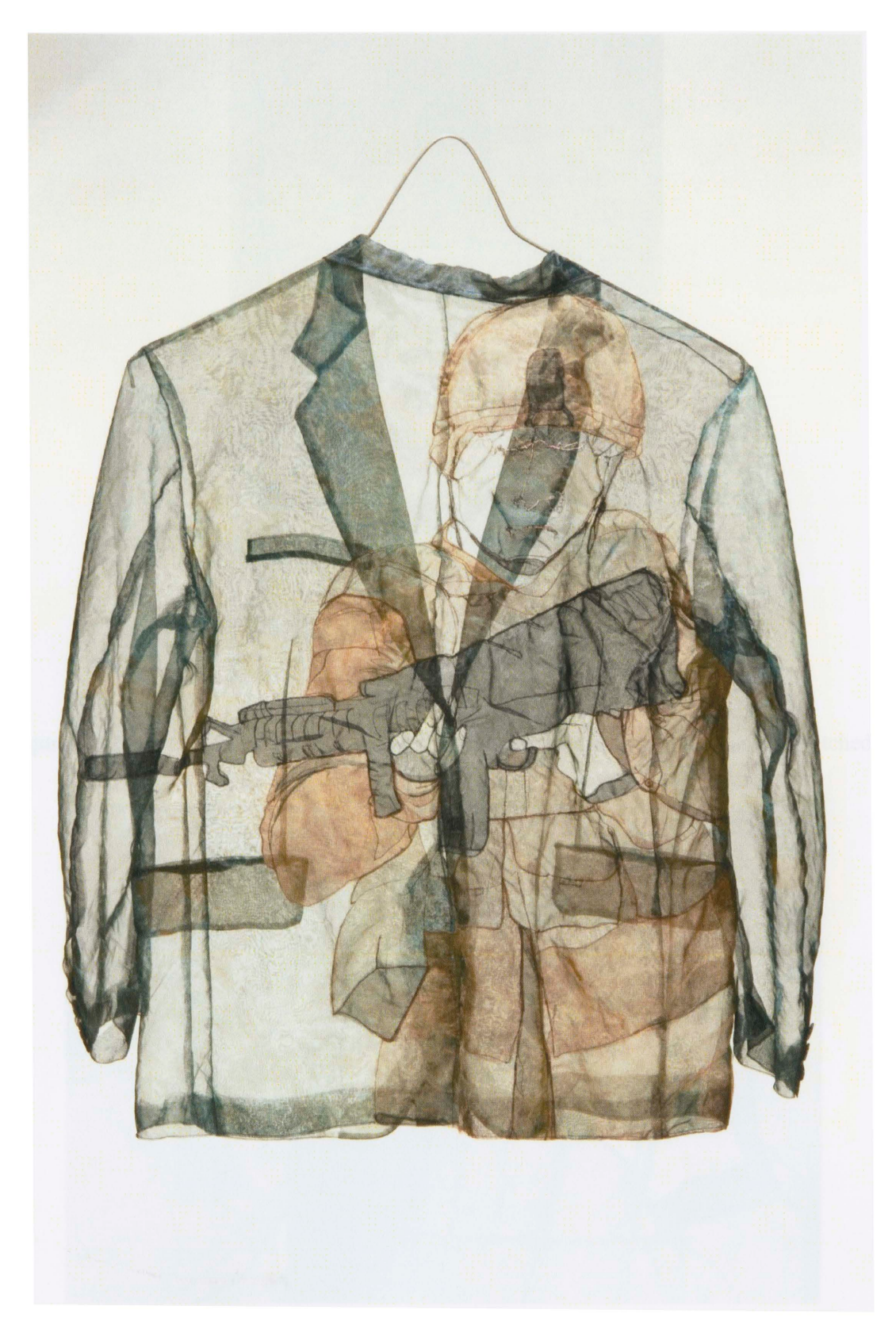
Figure 11: Upon Our Shoulders, Hand dyed nylon fabric, Appliqué, Machine-stitched.