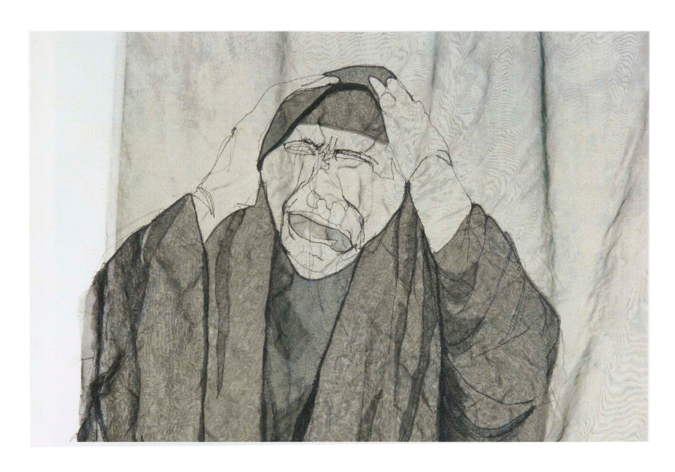
Figure 5: Carrier of Grief Detail, Hand dyed nylon fabric, Appliqué, Machine-stitched.