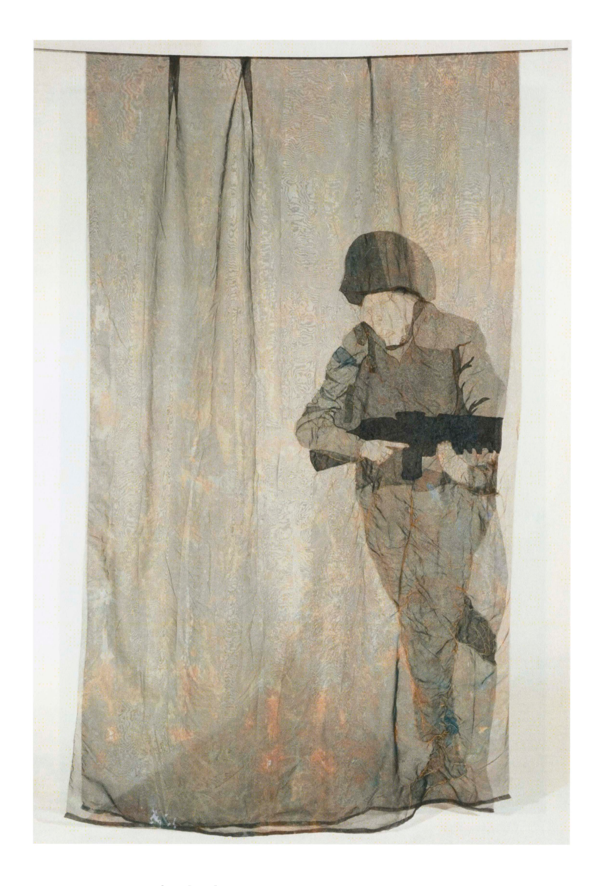
Figure 9: Father, Mother, Brother, Son, Hand dyed nylon fabric, Appliqué, Machine-stitched.