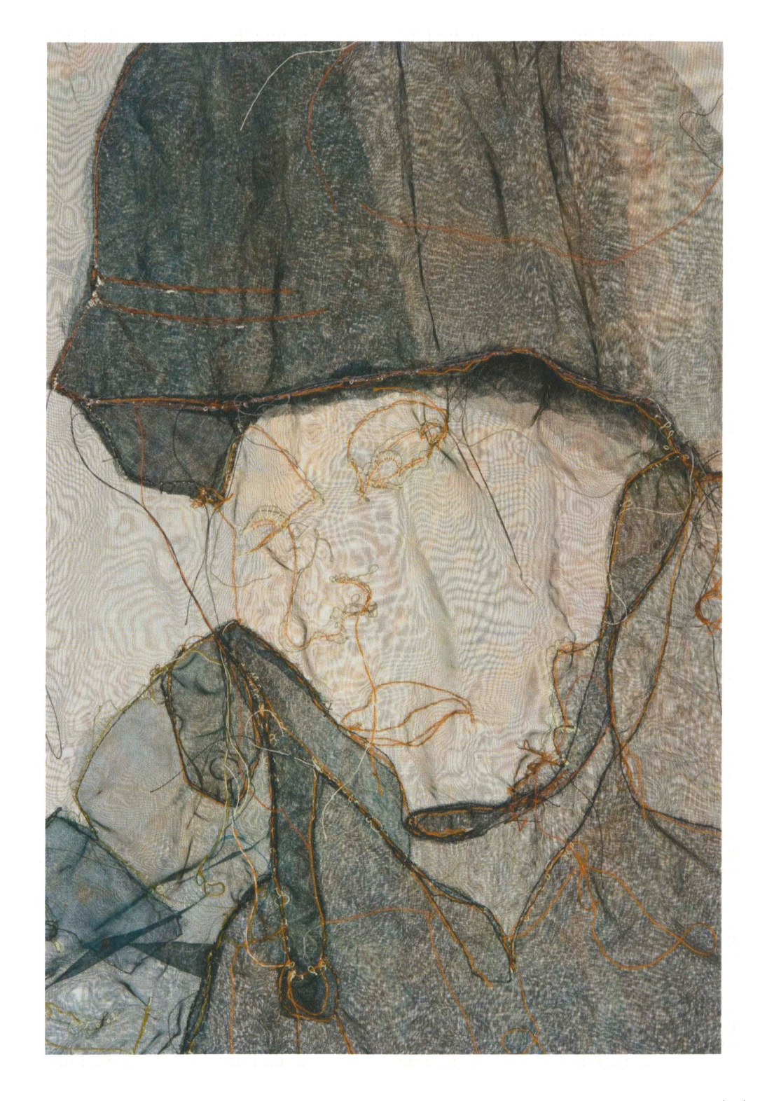
Figure 10: Father, Mother, Brother, Son Detail, Hand dyed nylon, Appliqué, Machine-stitched.