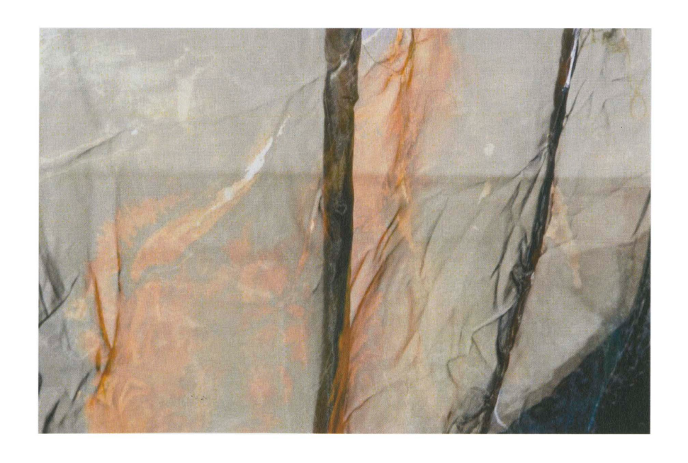
Figure 8: Stop Detail, Hand dyed nylon fabric, Appliqué, Machine-stitched.