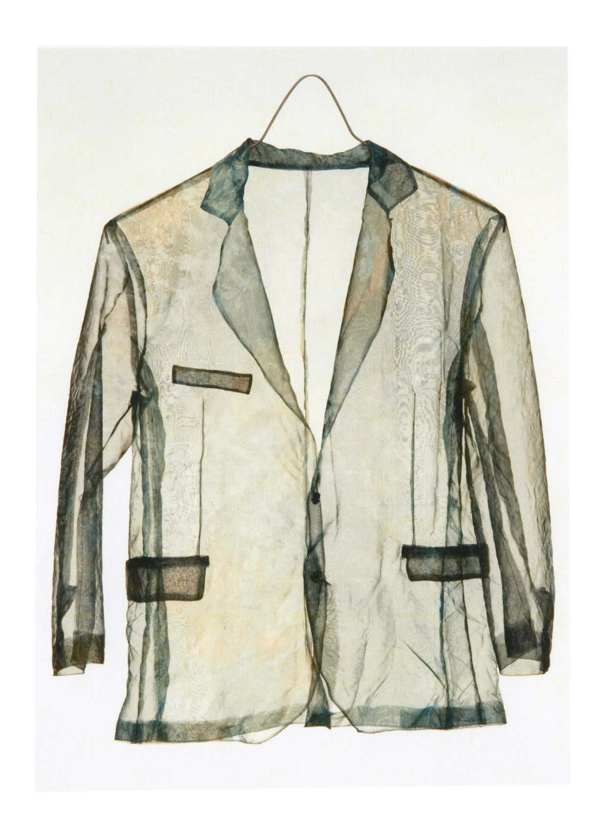
Figure 17: Still Carry It, Hand dyed nylon fabric, Machine-constructed.