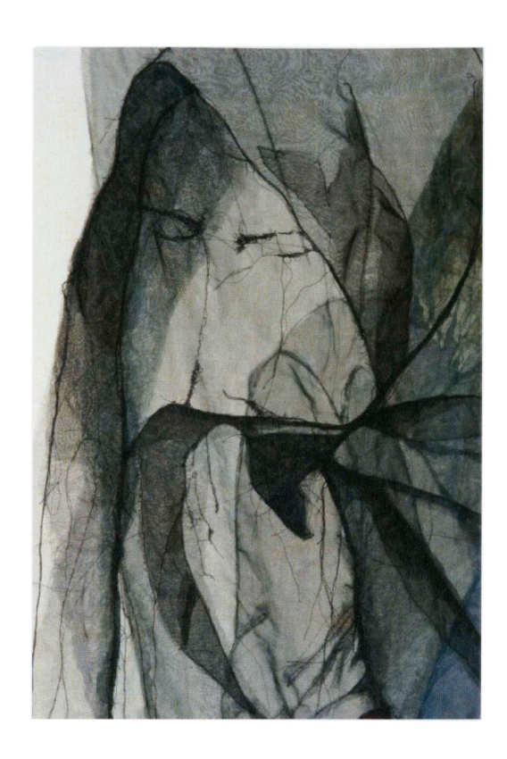
Figure 2: Two Sided War Detail, Hand dyed nylon fabric, Appliqué, Machine-stitched.