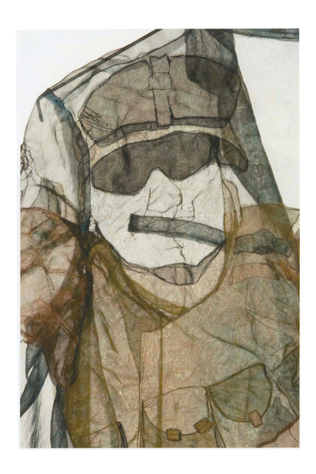
Figure 15: Got Your Back Detail, Hand dyed nylon fabric, Appliqué, Machine-stitched.