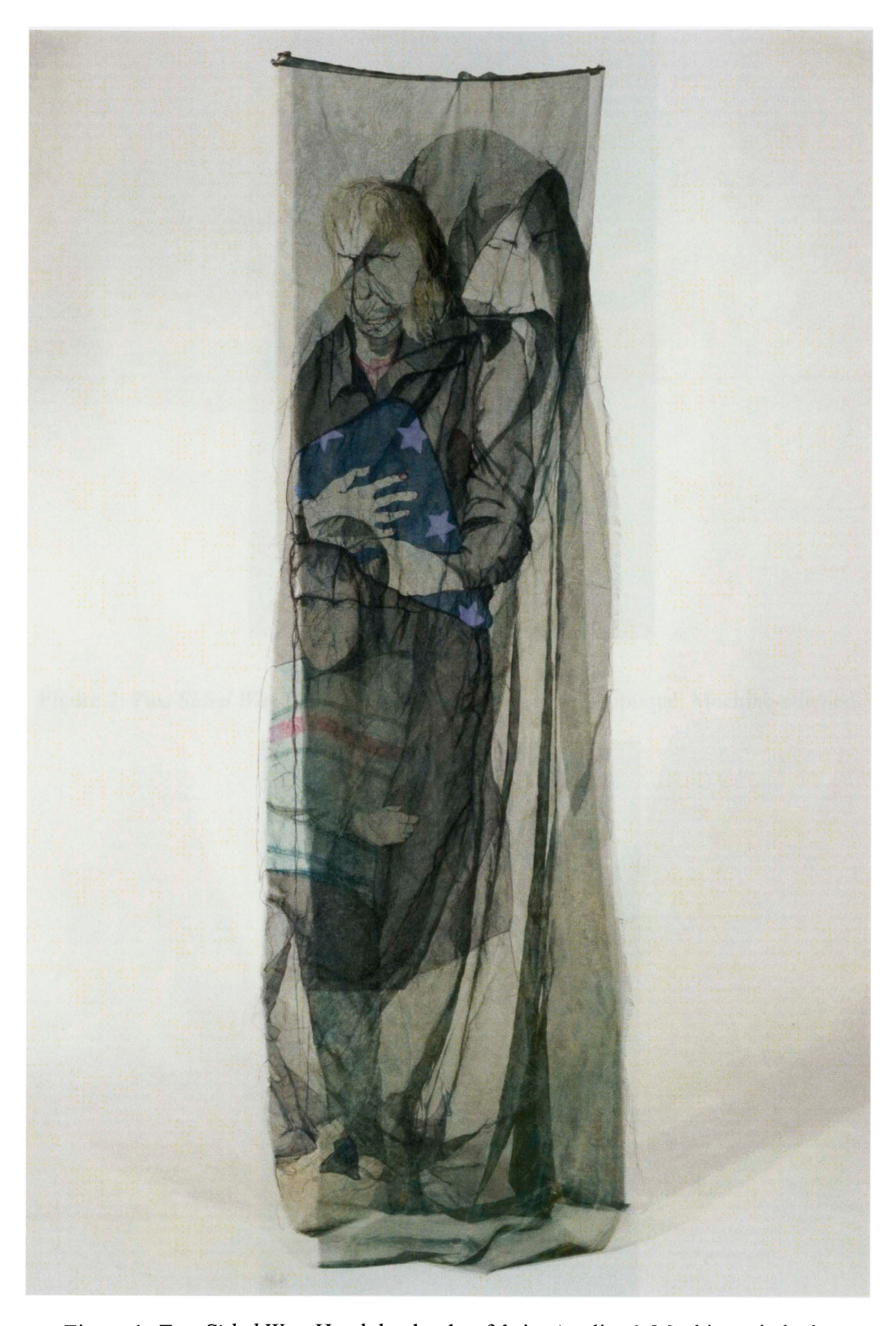
Figure 1: Two Sided War, Hand dyed nylon fabric, Appliqué, Machine-stitched.