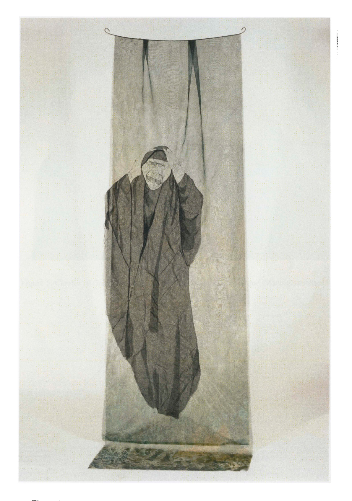
Figure 4: Carrier of Grief, Hand dyed nylon fabric, Appliqué, Machine-stitched.