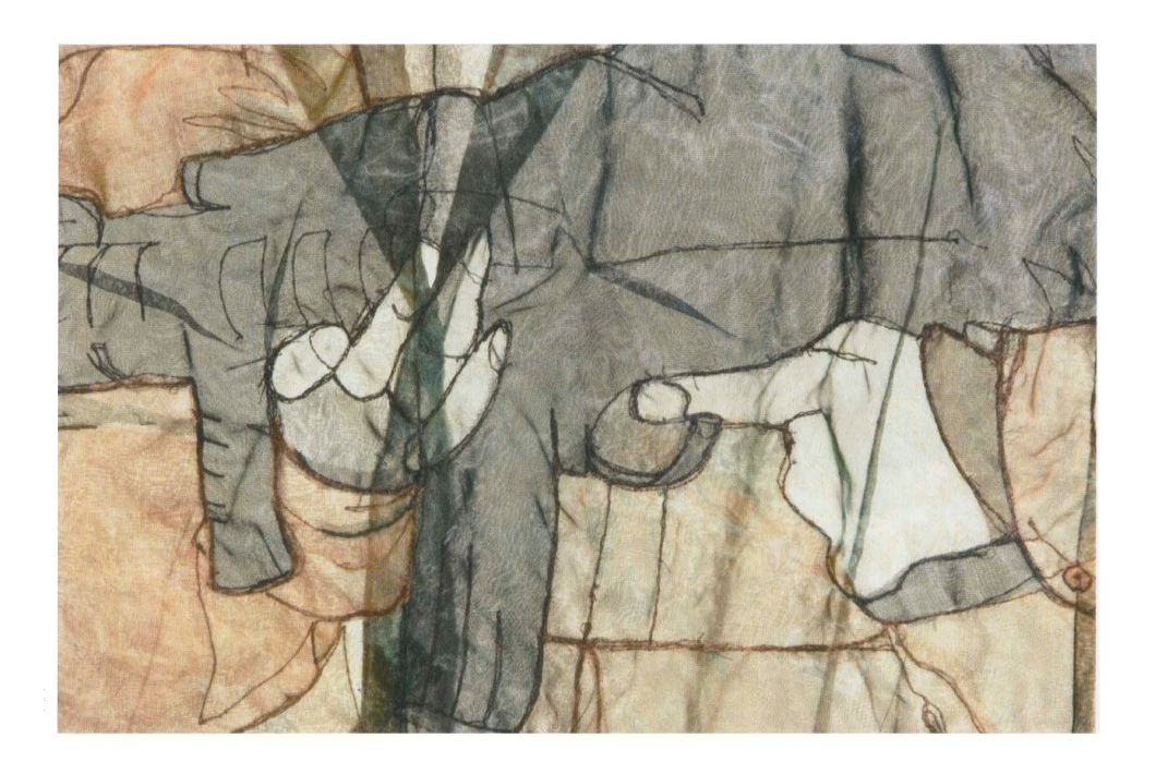
Figure 13: Upon Our Shoulders Detail, Hand dyed nylon fabric, Appliqué, Machine-stitched.