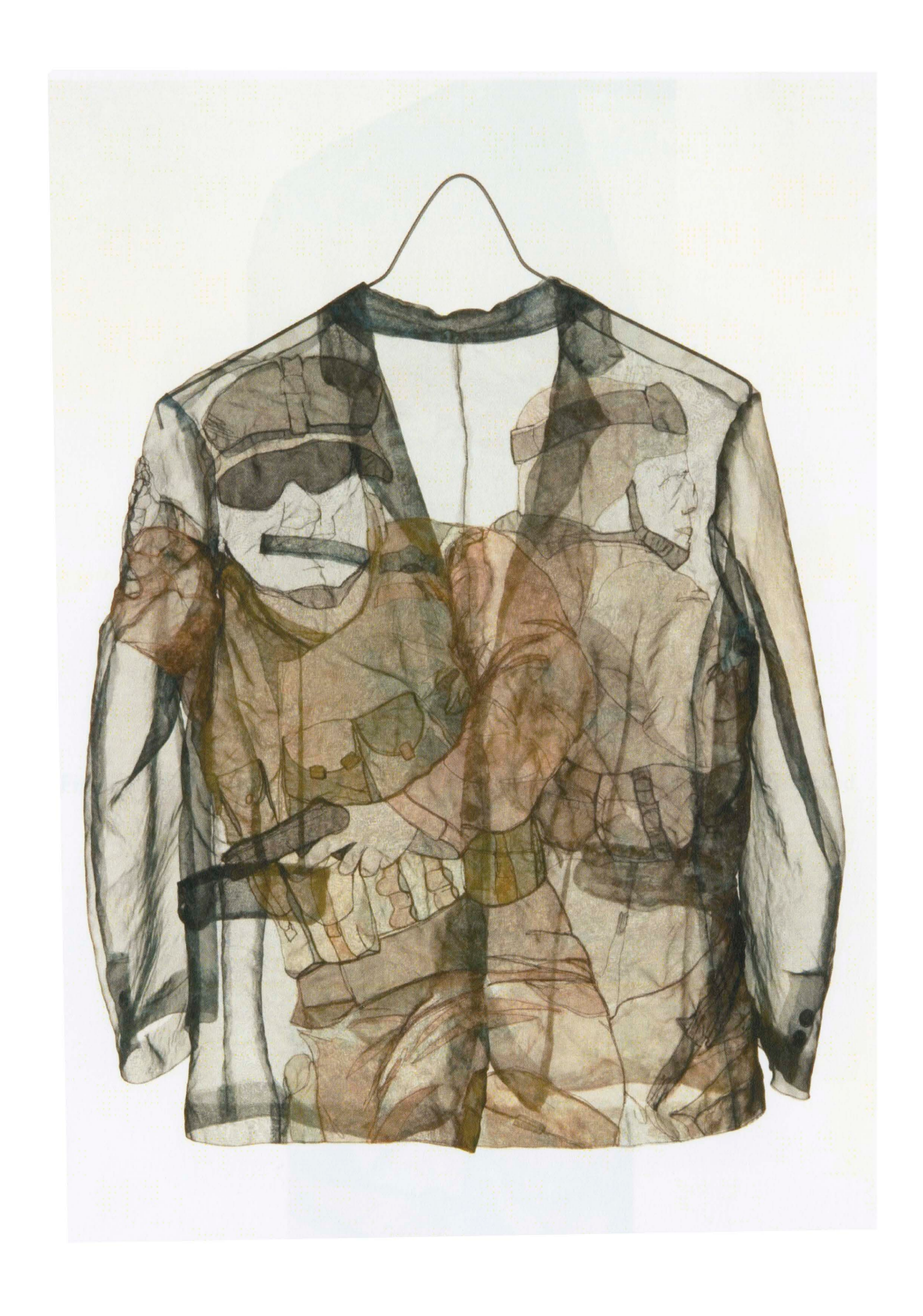
Figure 14: Got Your Back, Hand dyed nylon fabric, Appliqué, Machine-stitched.