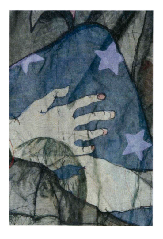
Figure 3: Two Sided War Detail, Hand dyed nylon fabric, Appliqué, Machine-stitched.