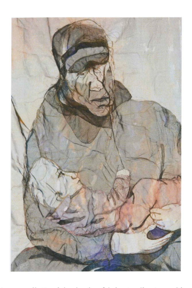
Figure 7: Stop Detail, Hand dyed nylon fabric, Appliqué, Machine-stitched.