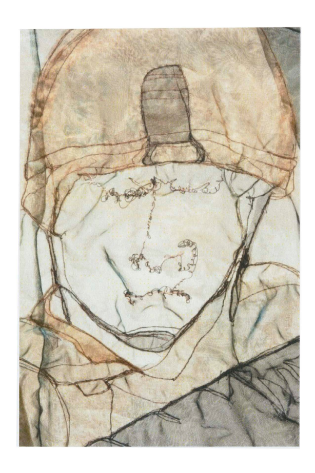
Figure 12: Upon Our Shoulders Detail, Hand dyed nylon fabric, Appliqué, Machine-stitched.