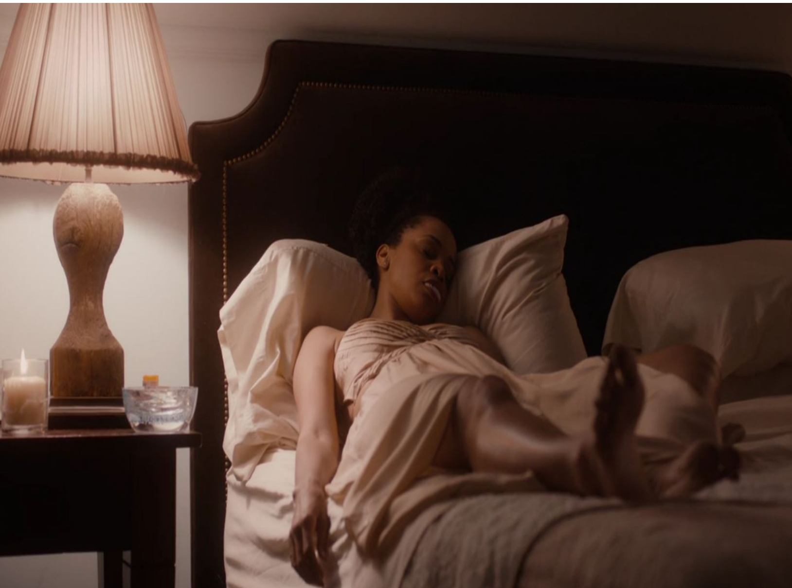
Being Mary Jane Marking mental health

Findings 1) Eurocentric hair was displayed most often in the most positive contexts 2) Three categories emerged in consistent association for natural hair: service work and less “professional” careers , privacy and emotional crisis or failure , and with suicide/ questions of sanity .