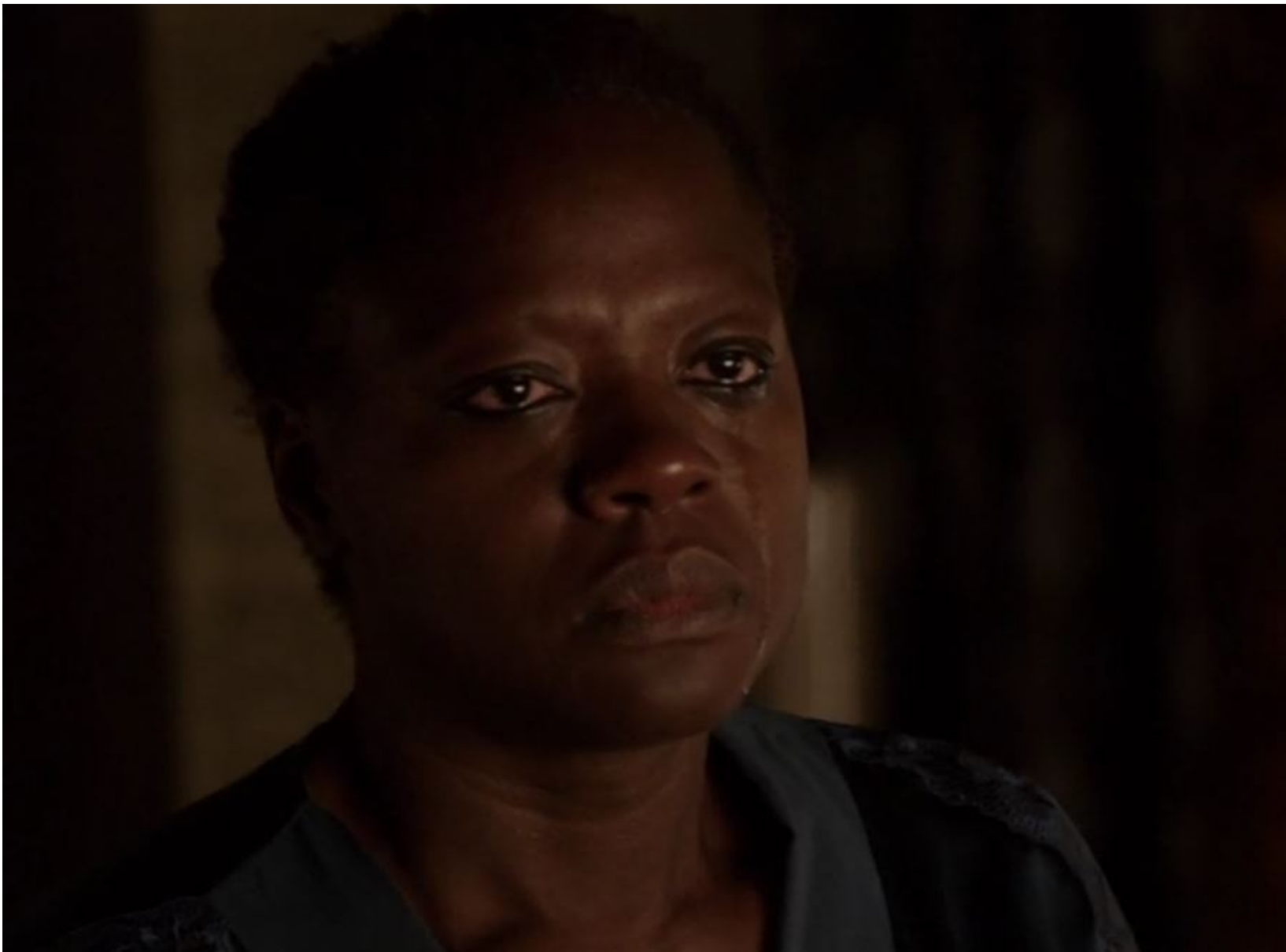
How to Get Away with Murder Masking insecurity