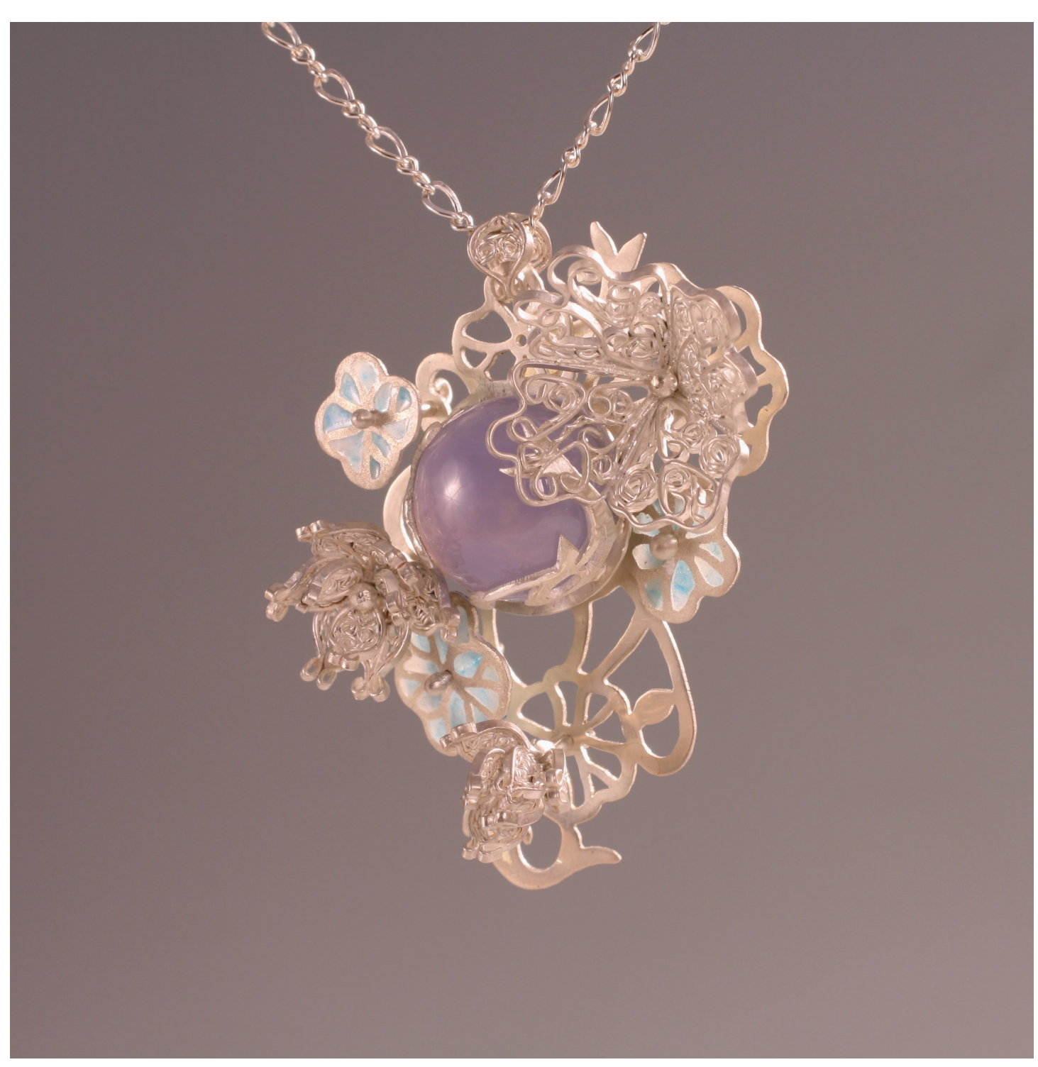
Figure 6: Heart of the Water (side view)