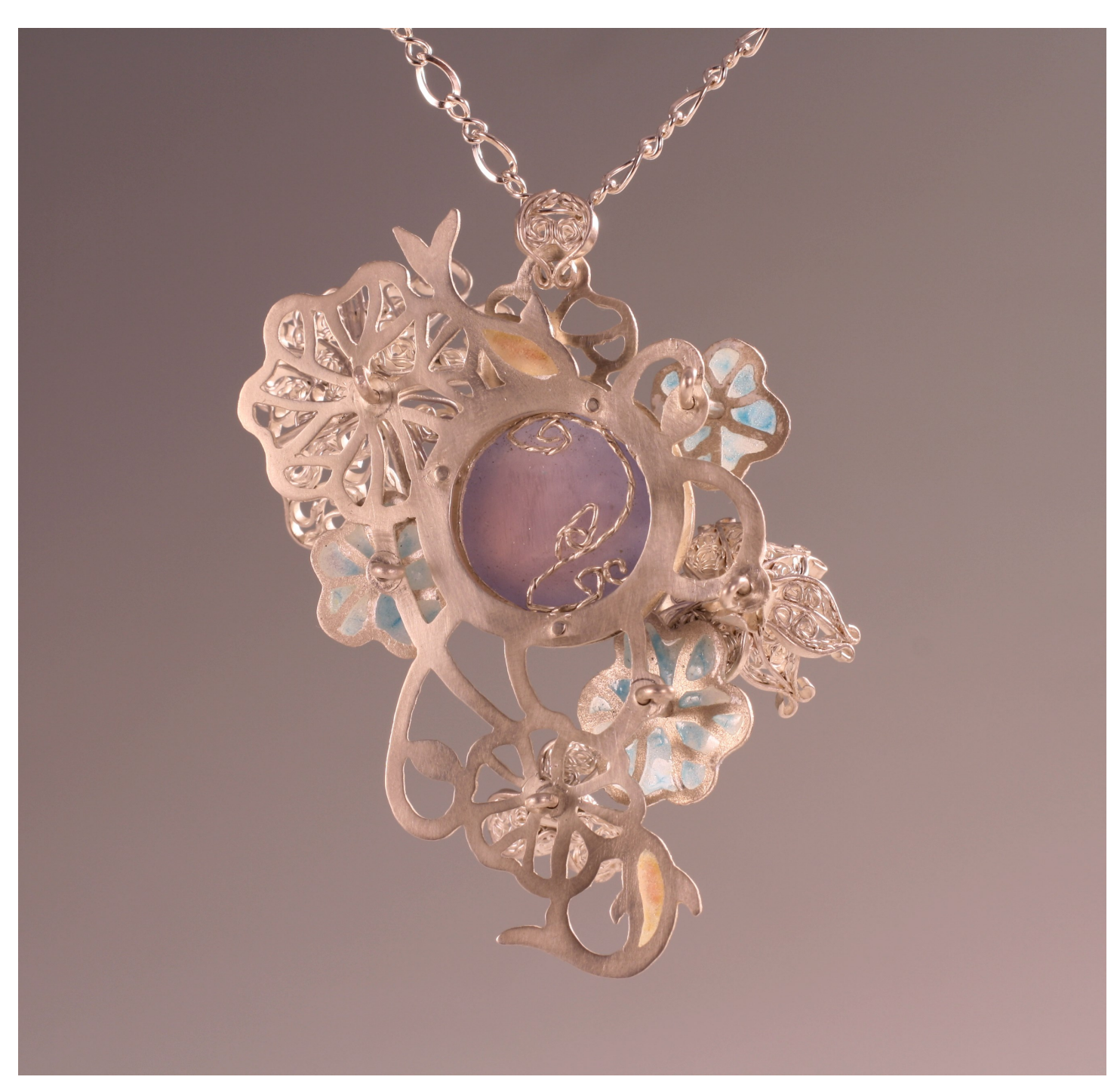
Figure 7: Heart of the Water (back view)