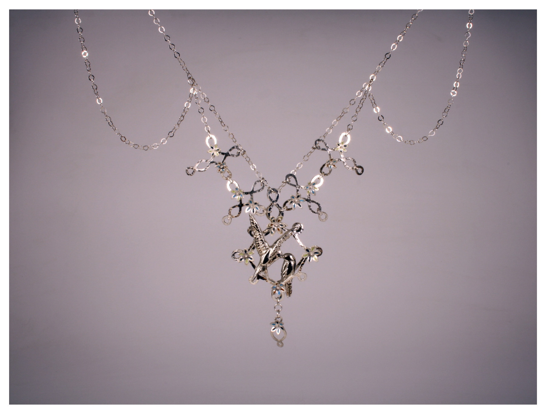
Figure 8: Going Back