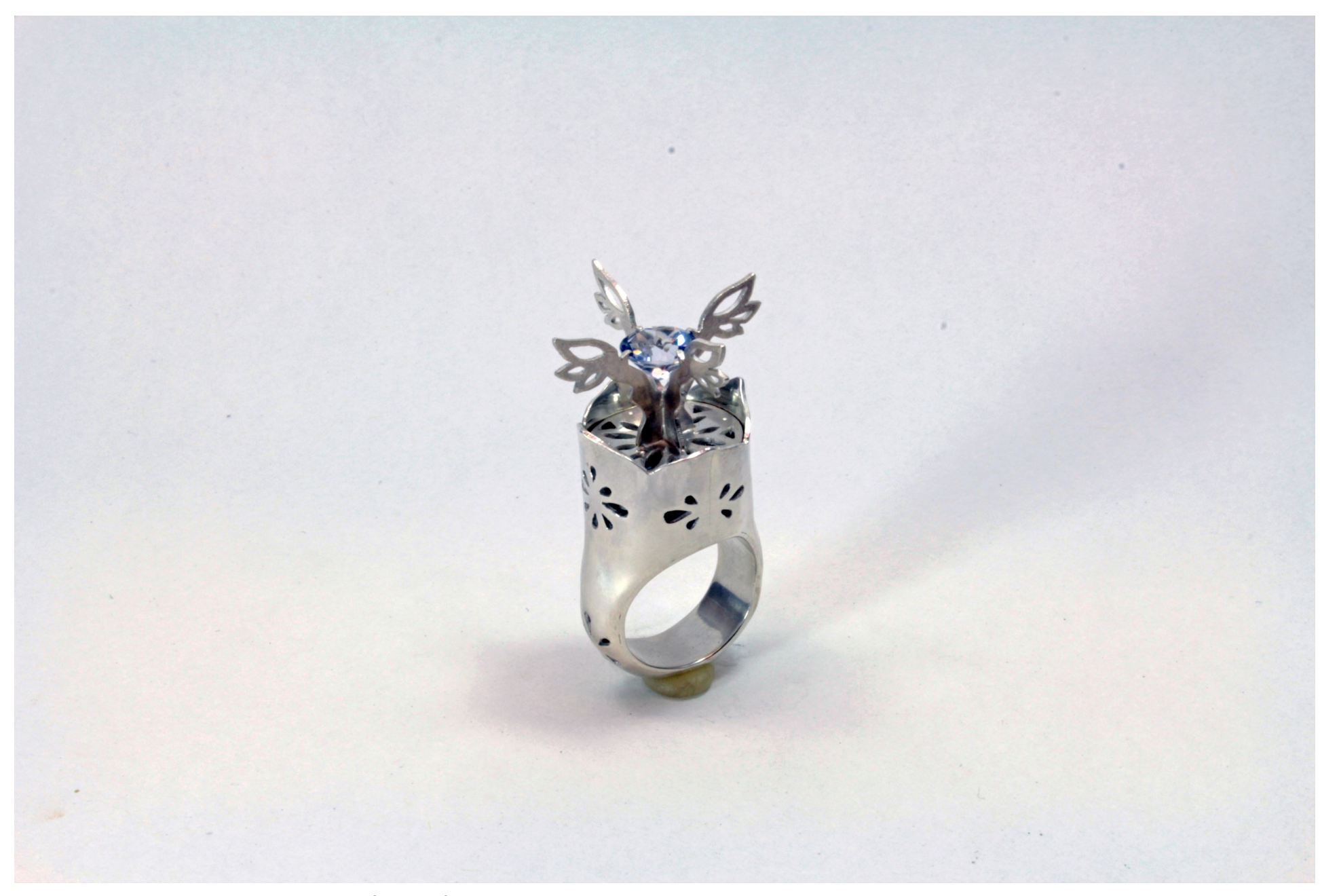
Figure 3: Waiting for Renascence (closed)