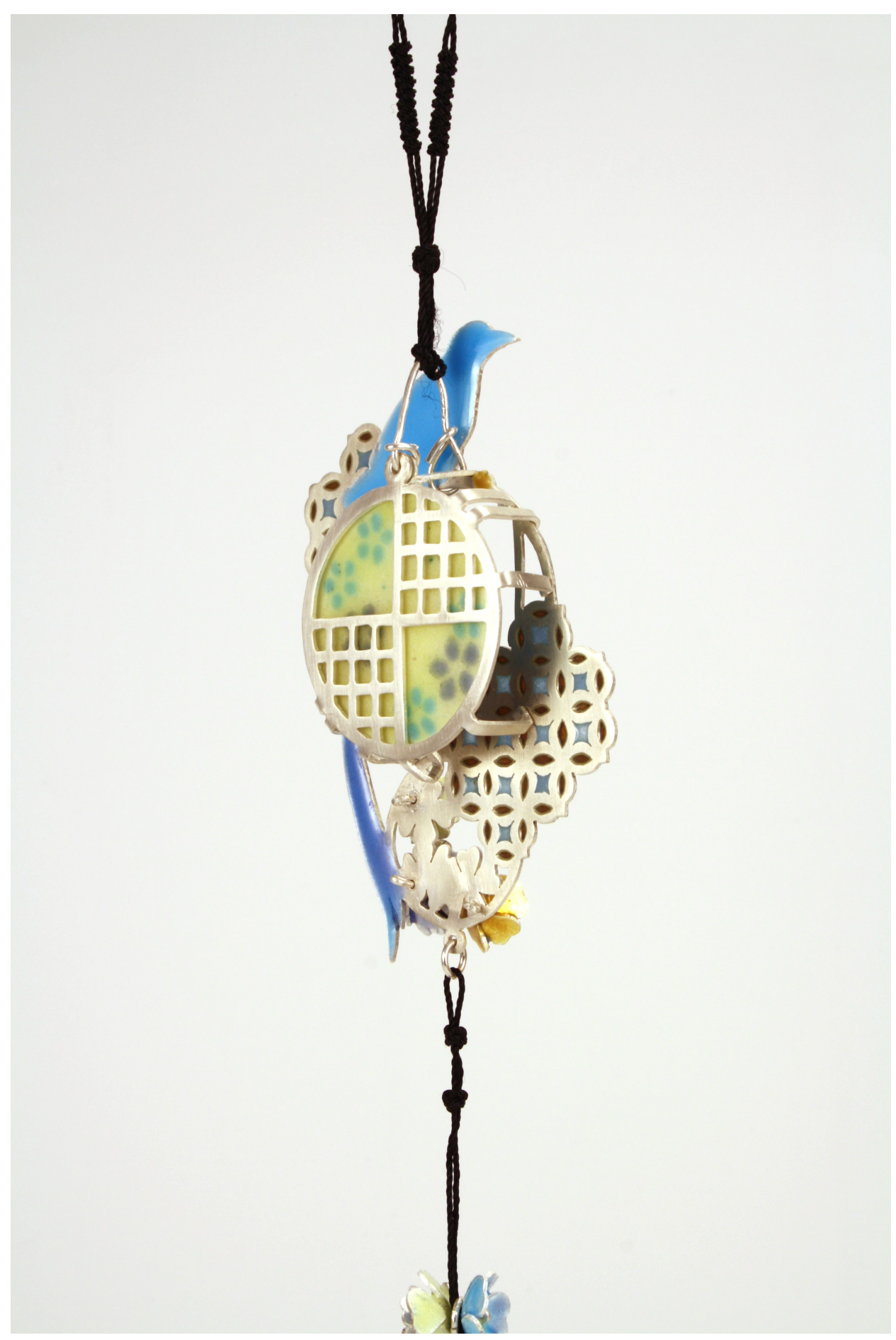
Figure 16: View of the Mountains with a Bird and Flowers (Back View)