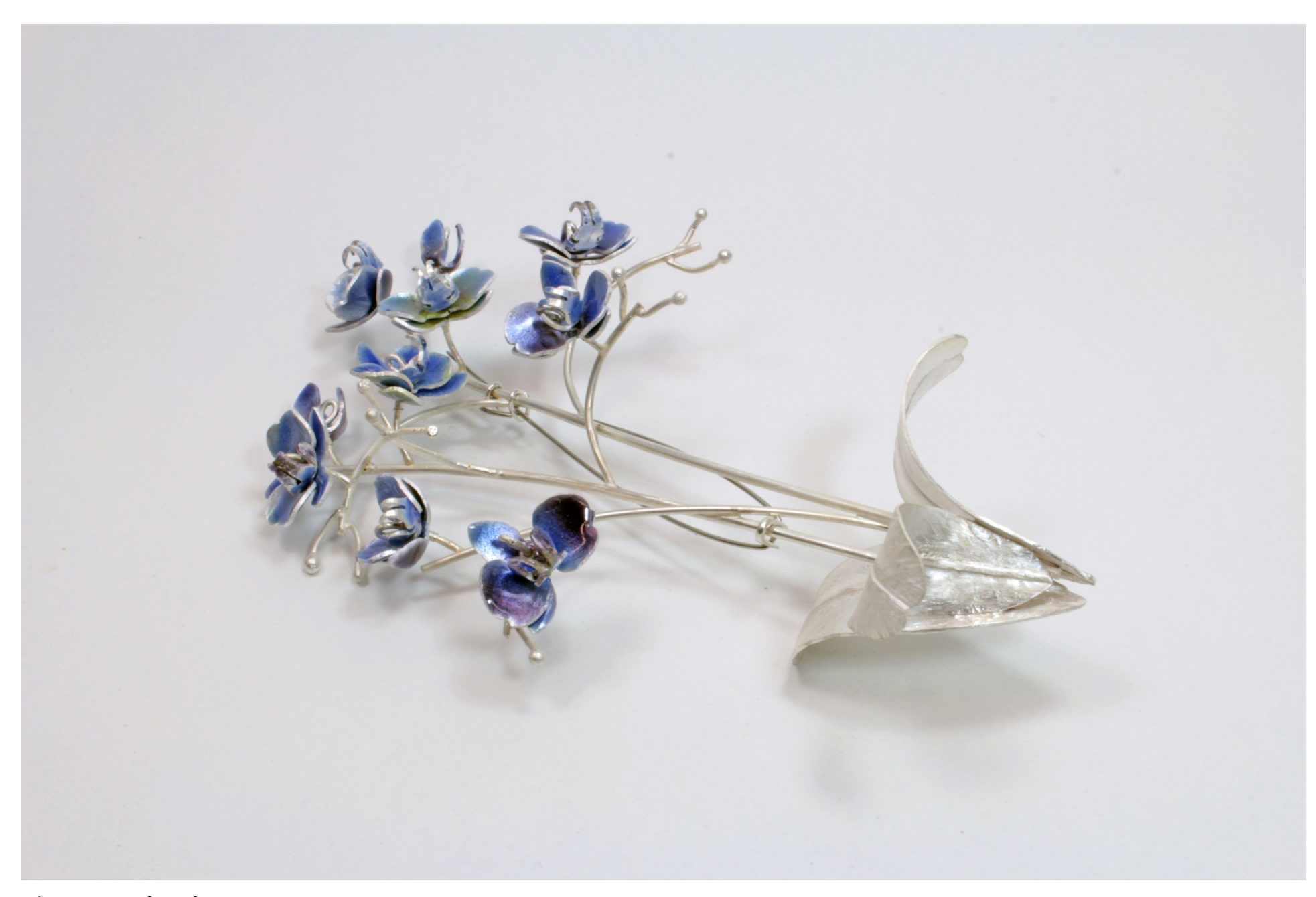
Figure 10: The Blue Memory 2