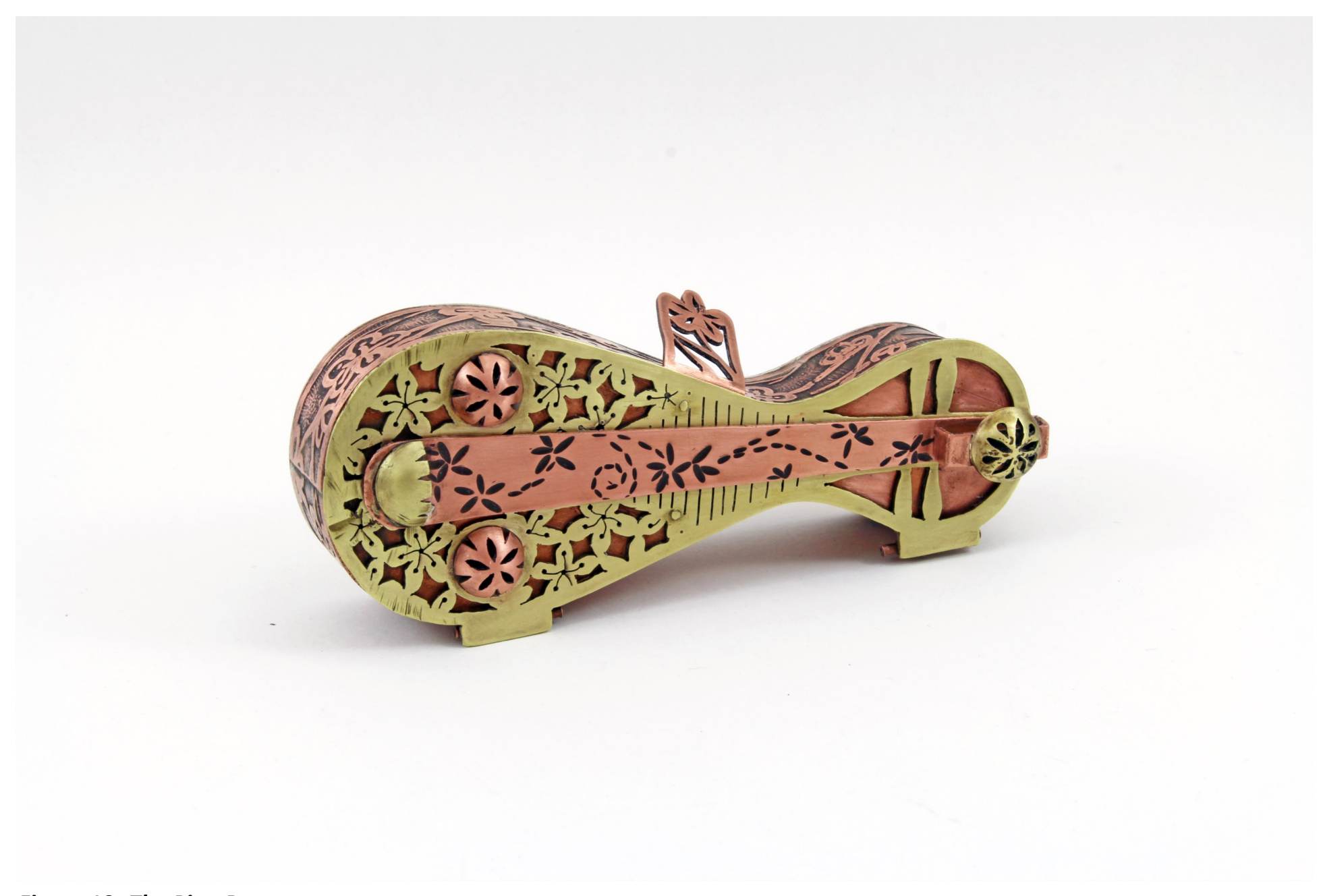
Figure 19: The Pipa Box