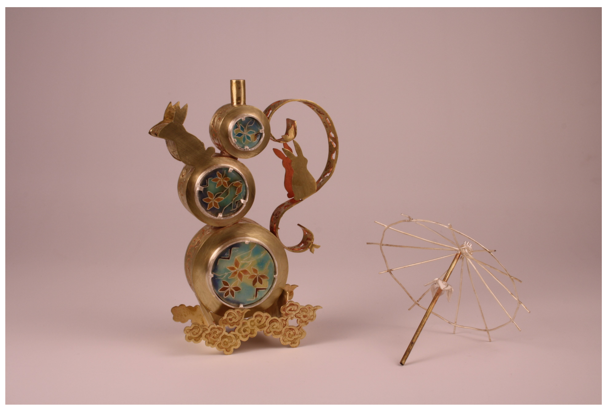
Figure 12: The Rabbit in the Moon Palace -2