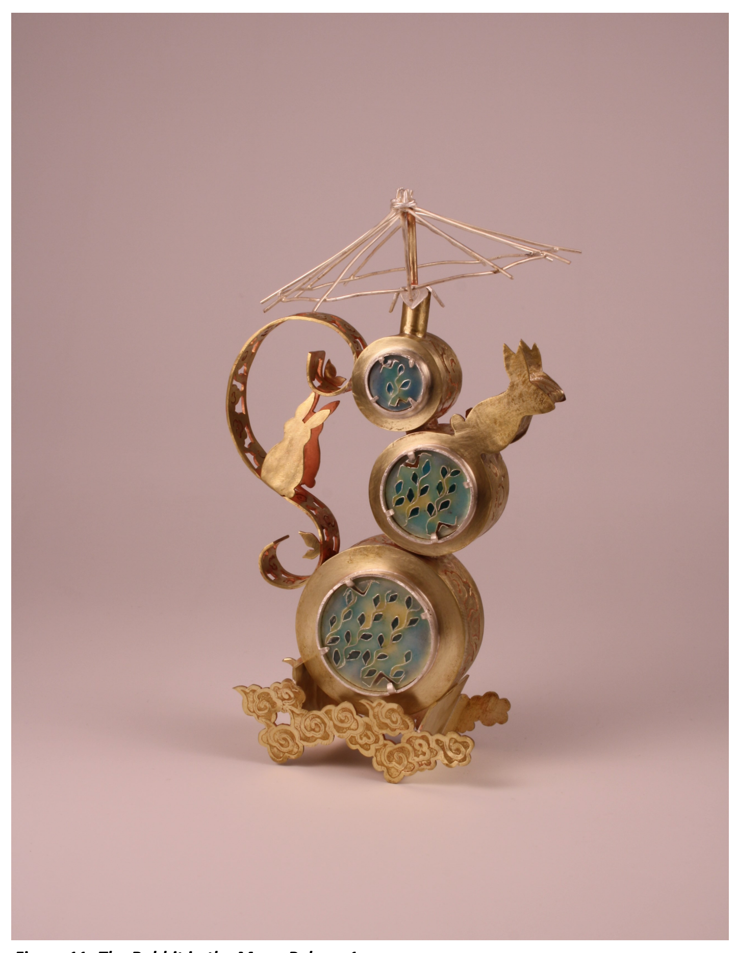
Figure 11: The Rabbit in the Moon Palace -1