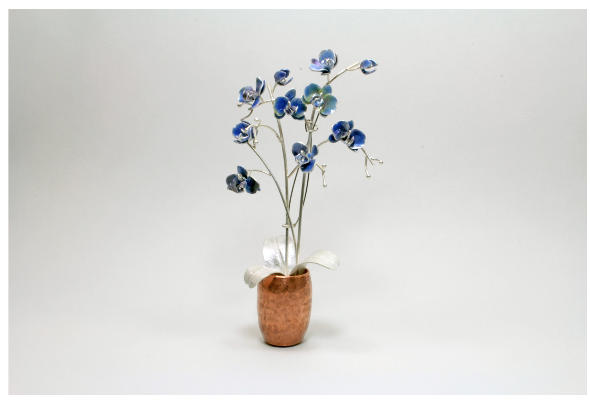
Figure 9: The Blue Memory 1