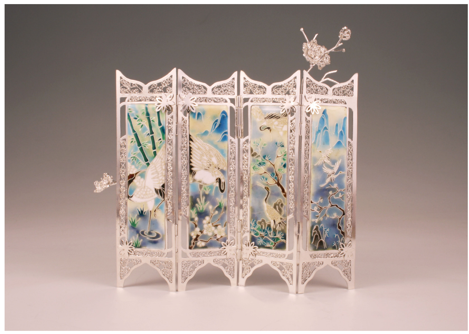
Figure 1: The Crane and Plum