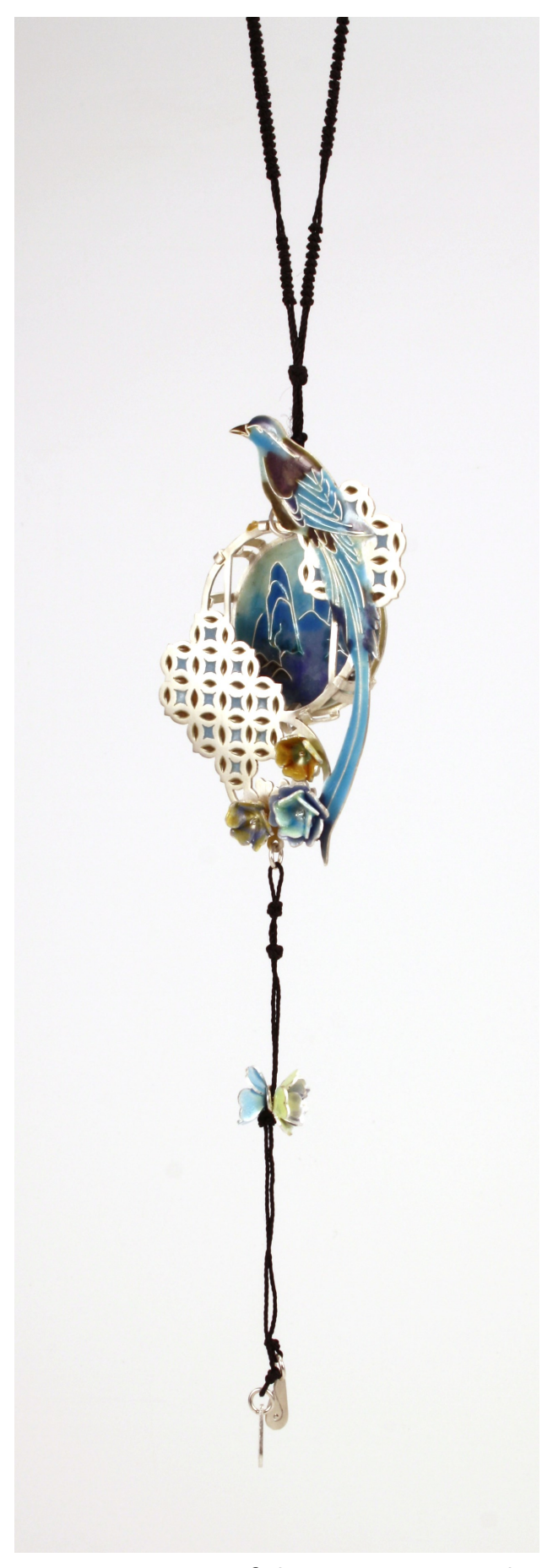
Figure 14: View of the Mountains with a Bird and Flowers