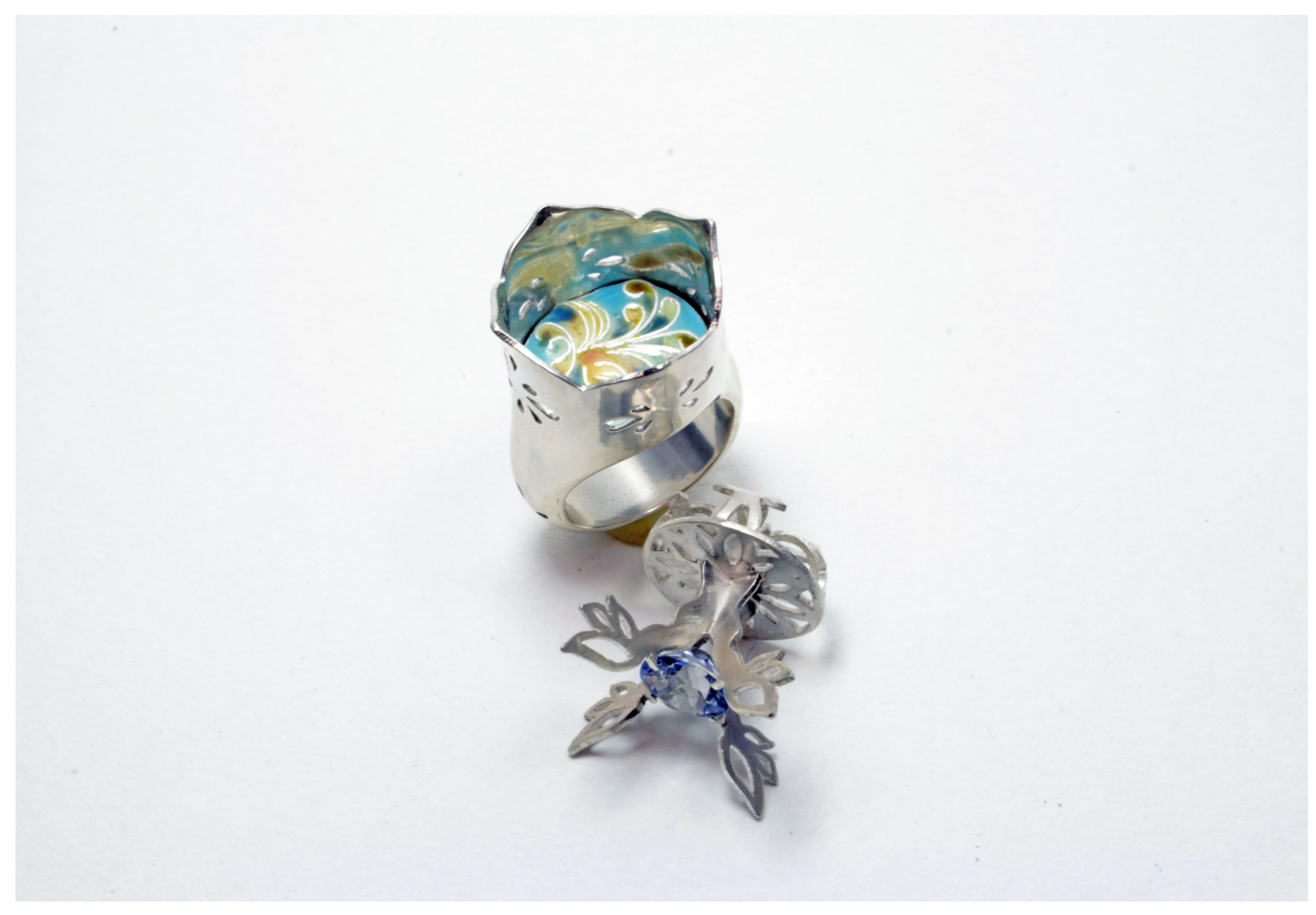
Figure 4: Waiting for Renascence (open)