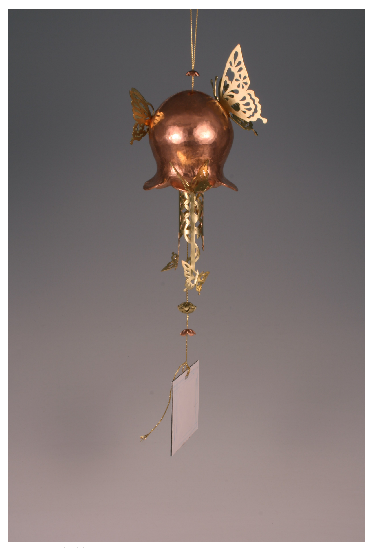
Figure 17: The blessing