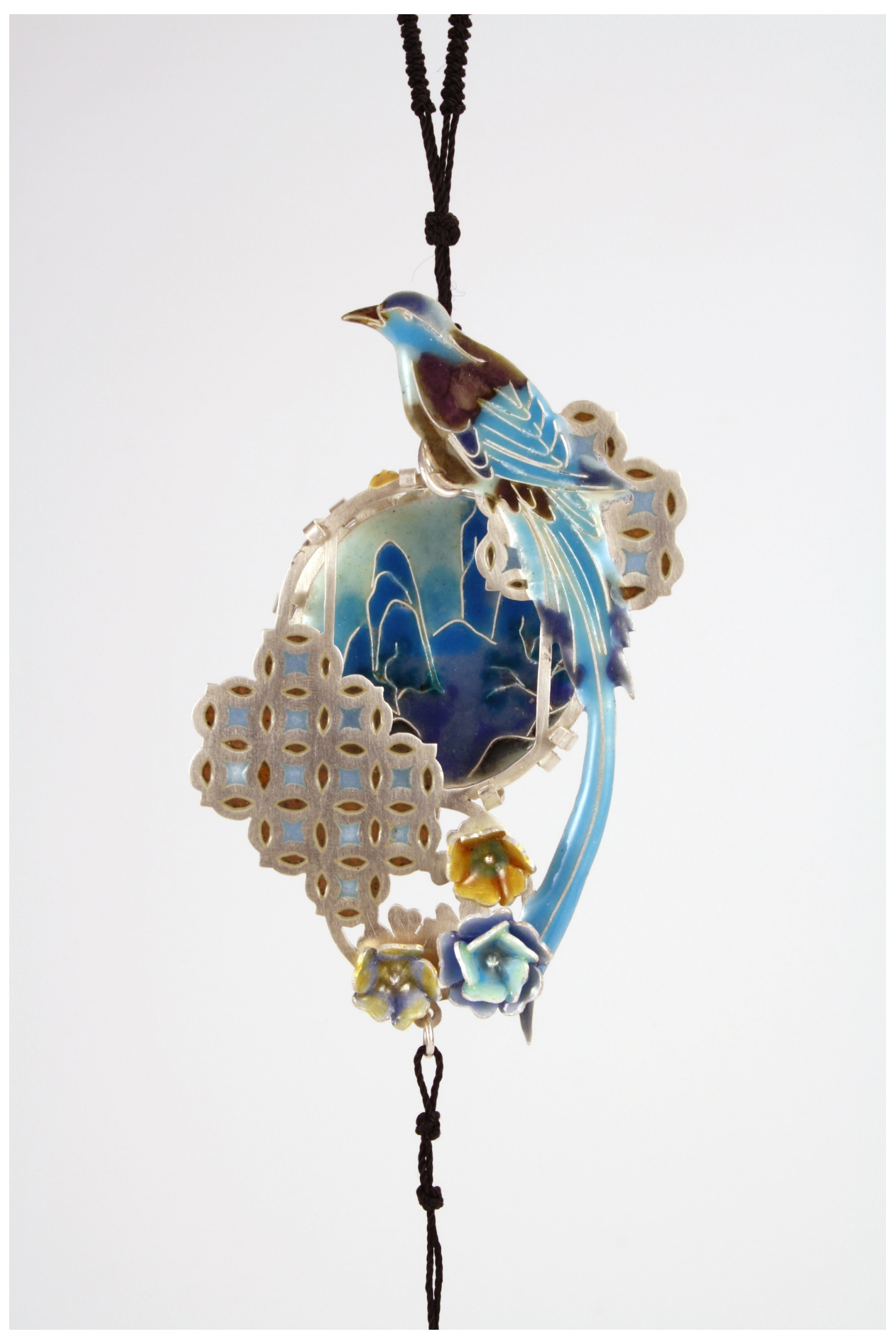
Figure 15: View of the Mountains with a Bird and Flowers (Detail)