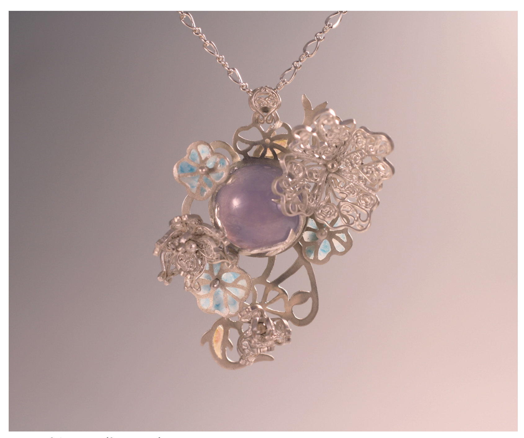
Figure 5: Heart of the Water (front view)