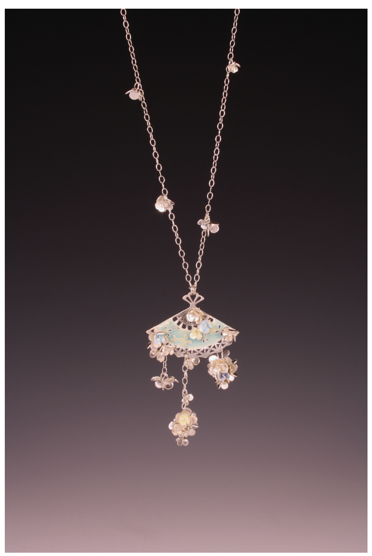
Figure 13: Coming True