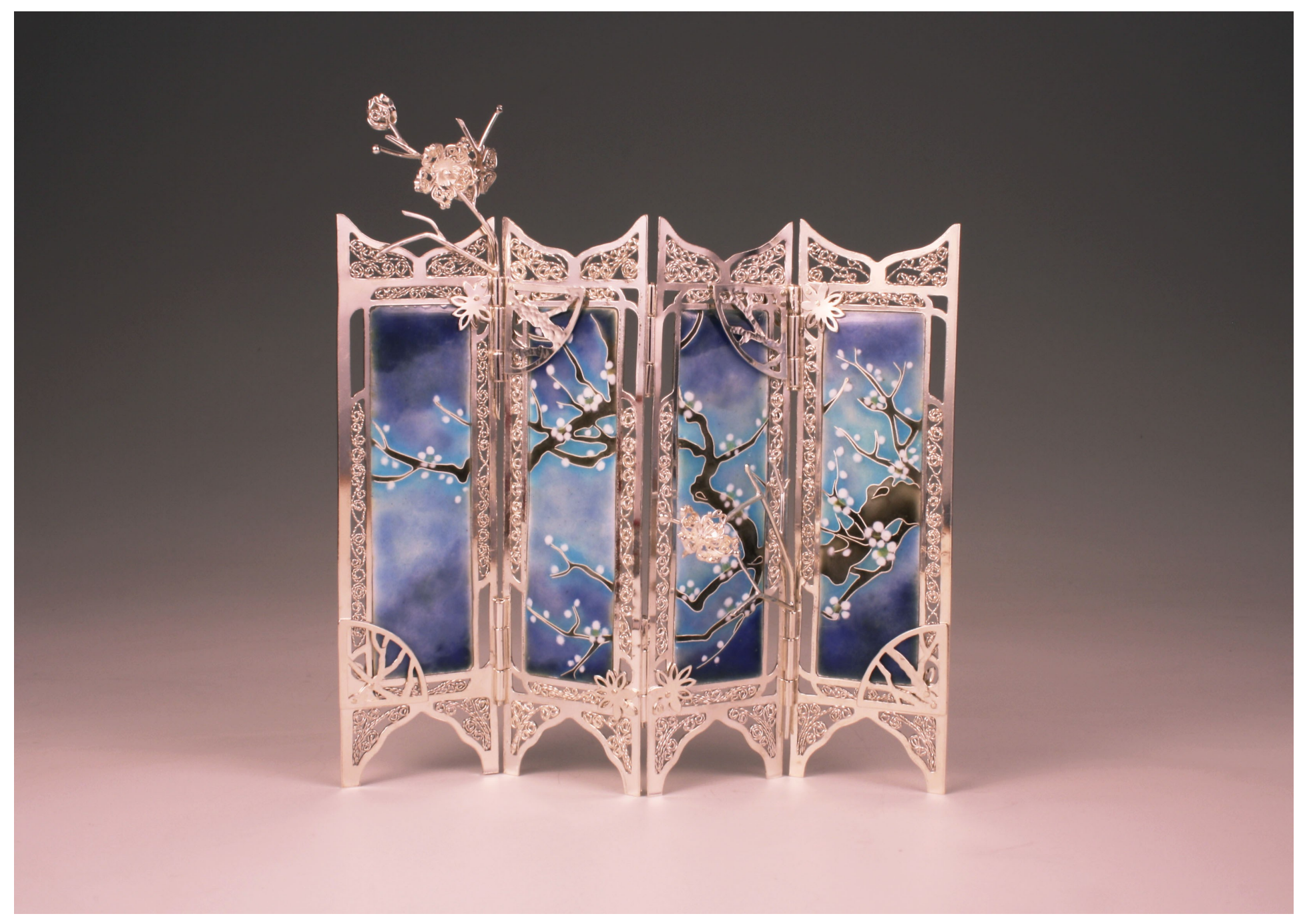
Figure 2: The Crane and Plum