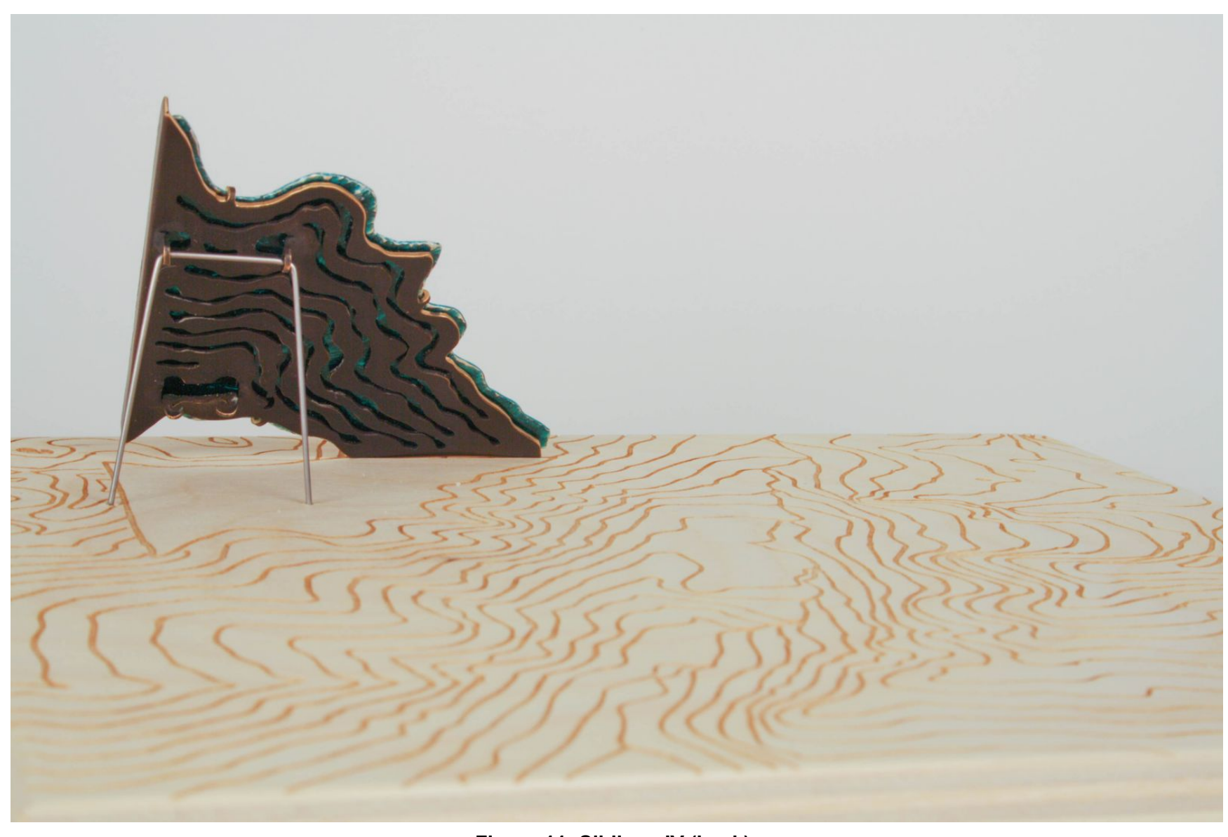
Figure 11: Siblings IV (back)