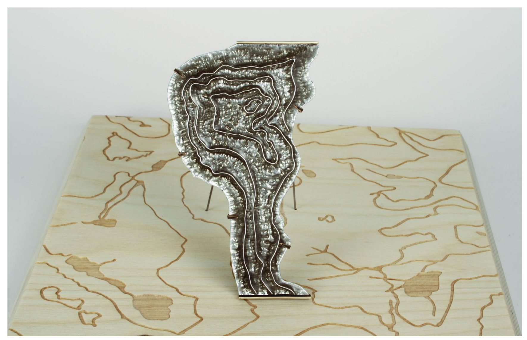
Figure 6: Siblings I