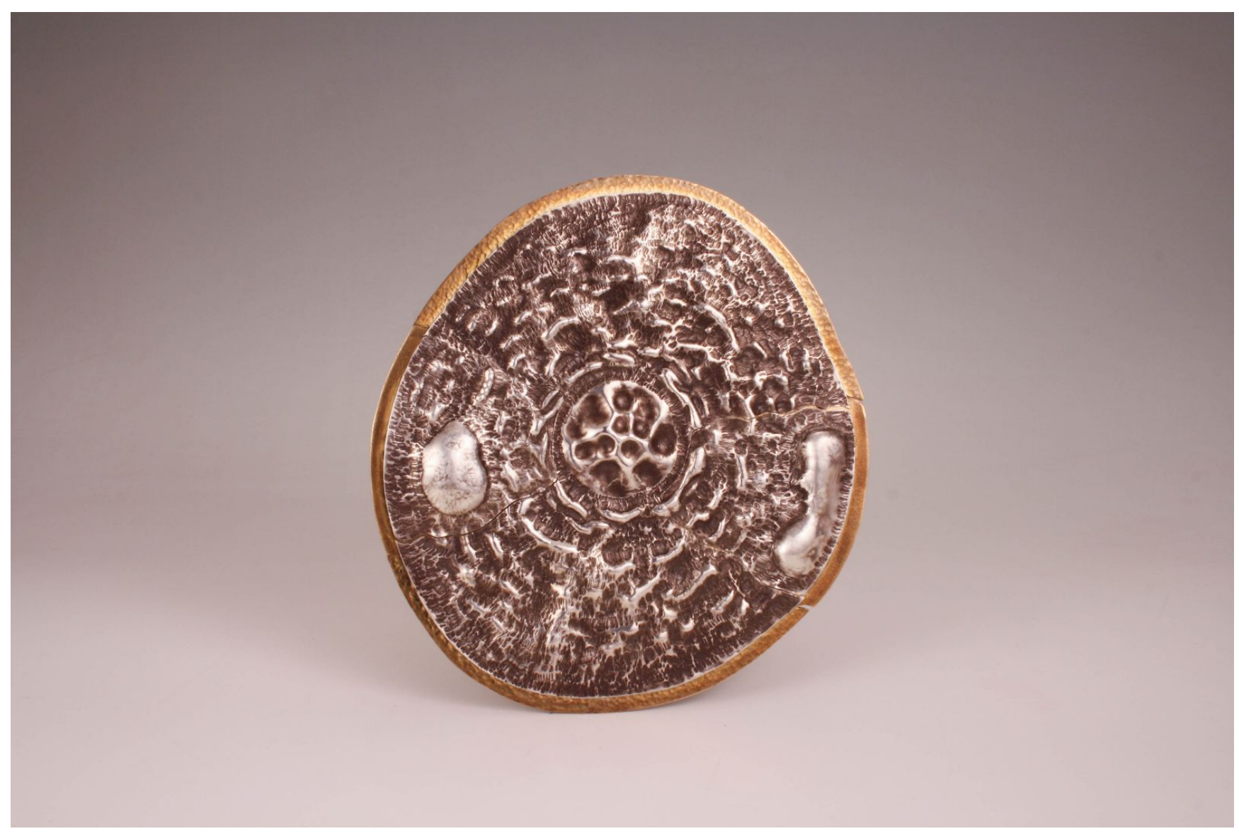
Figure 1: Disperse