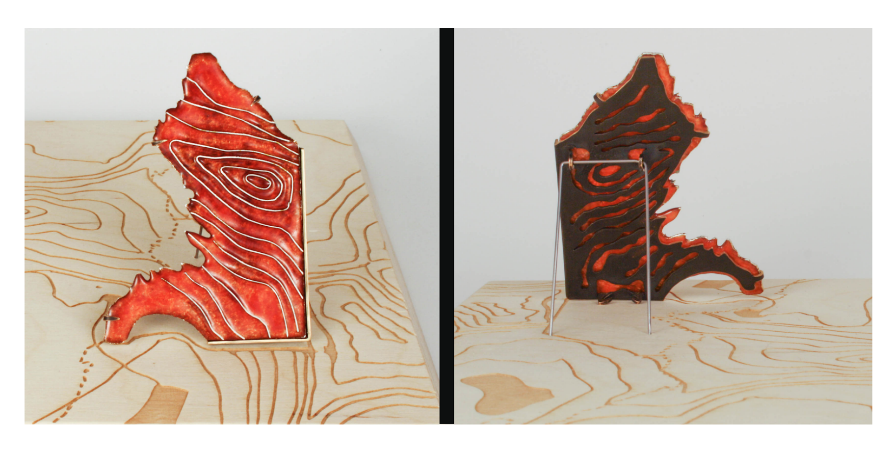
Figure 8: Siblings II