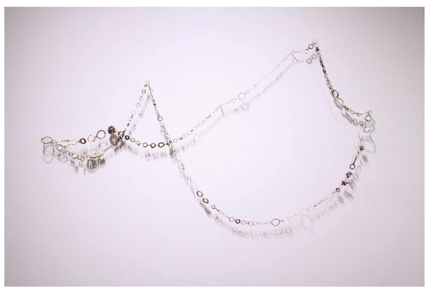
Figure 3: Links