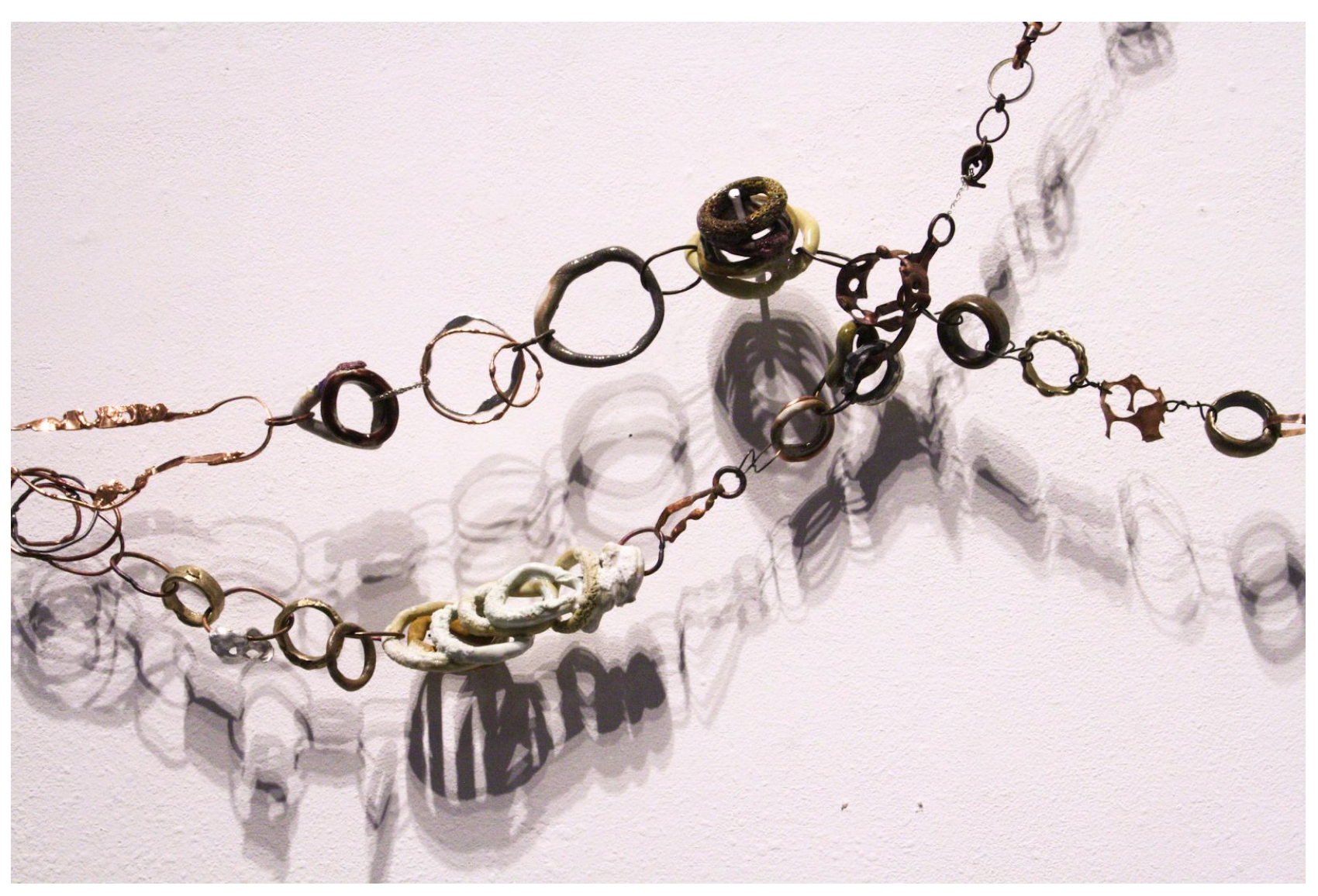
Figure 4: Links (detail)