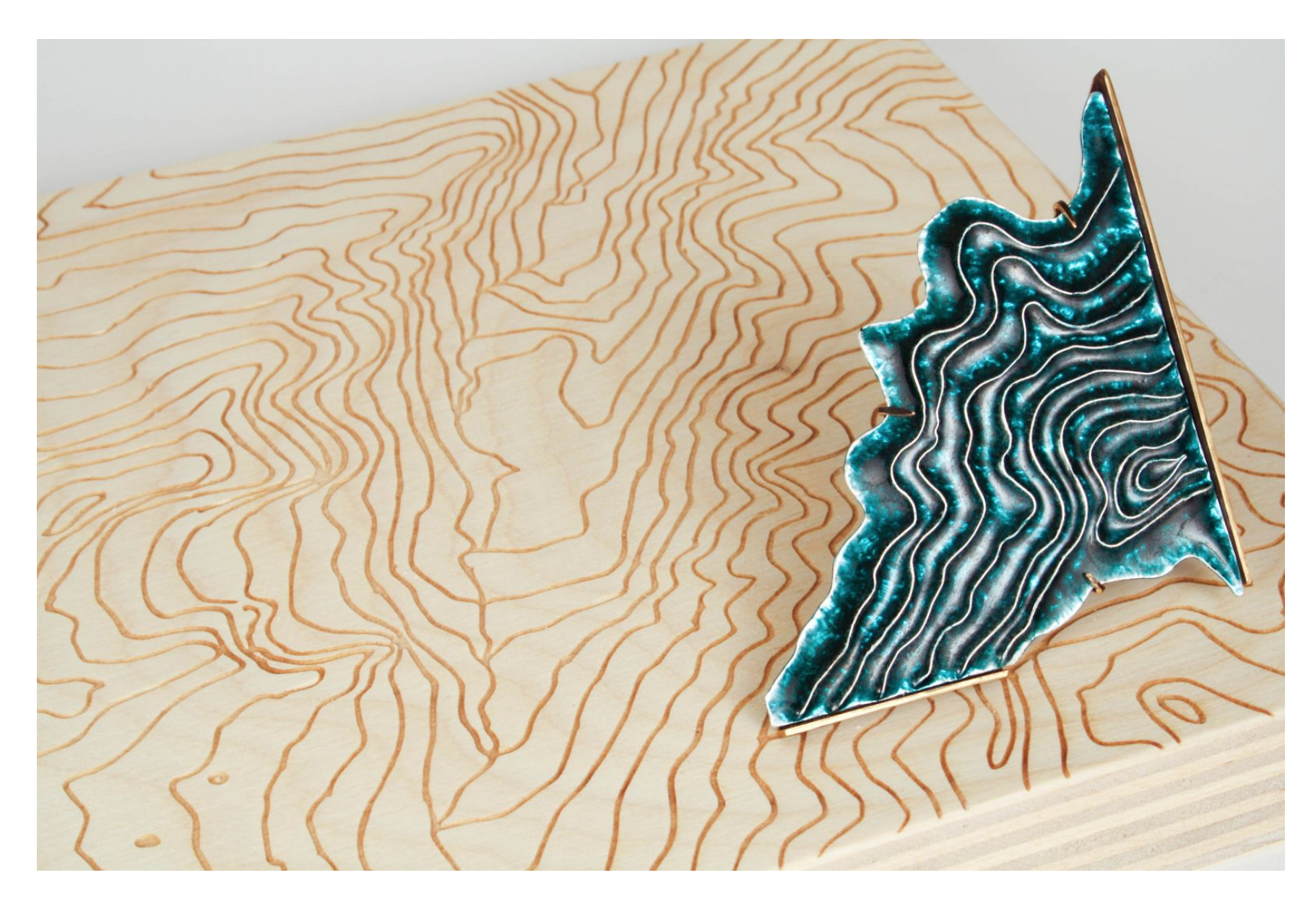
Figure 10: Siblings IV