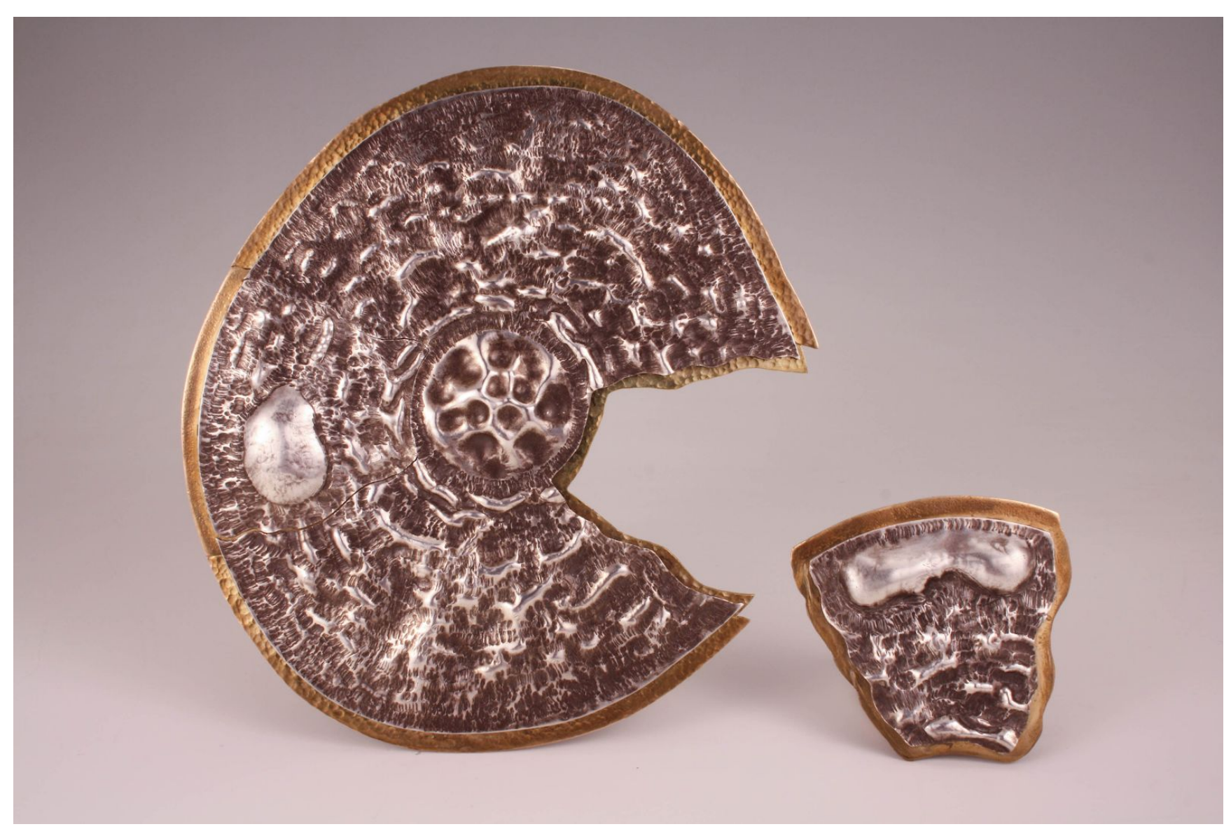
Figure 2: Disperse (brooch)