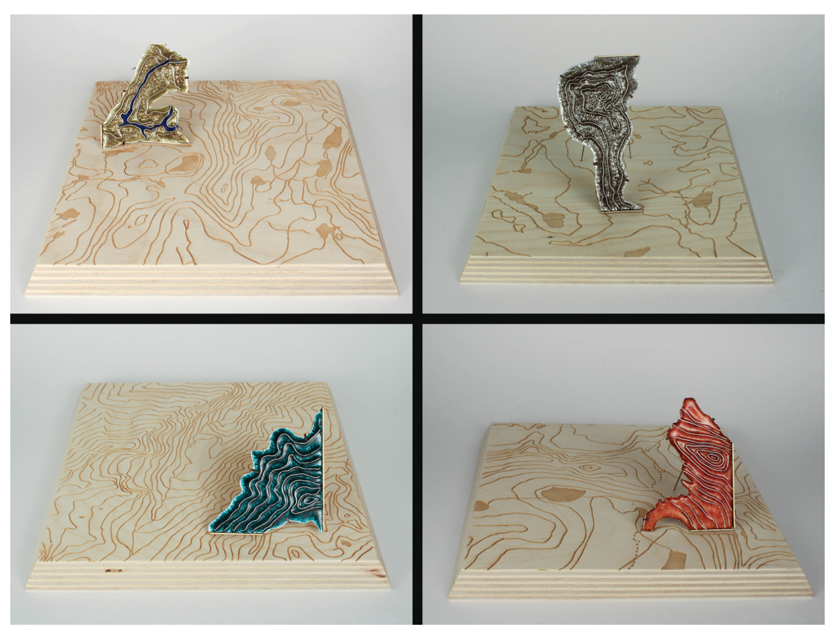
Figure 5: Siblings Series