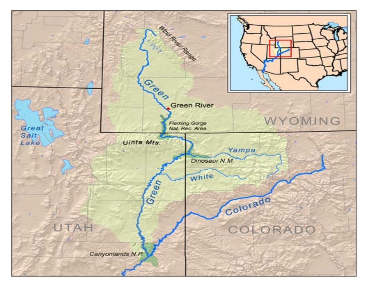
Figure 2. 1