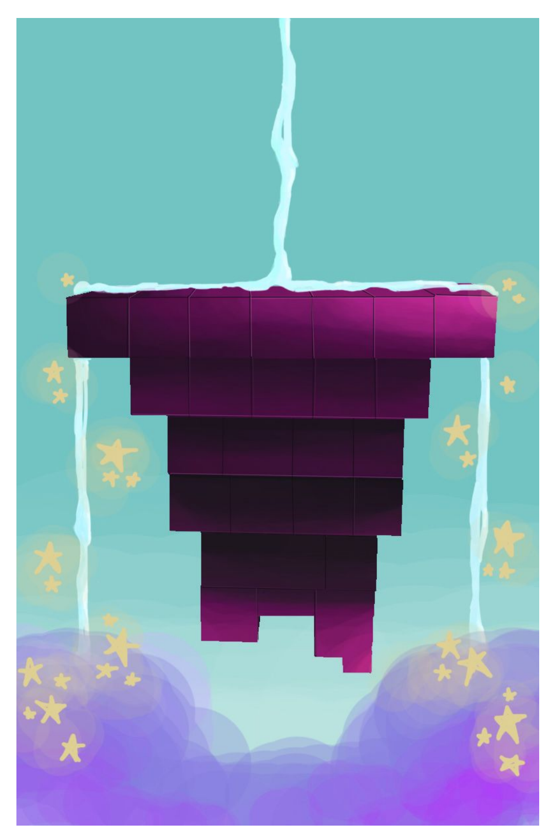
Figure 3: Tower Series 2