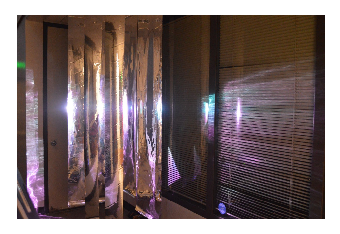
Figure 5: Mico/Macro Installation