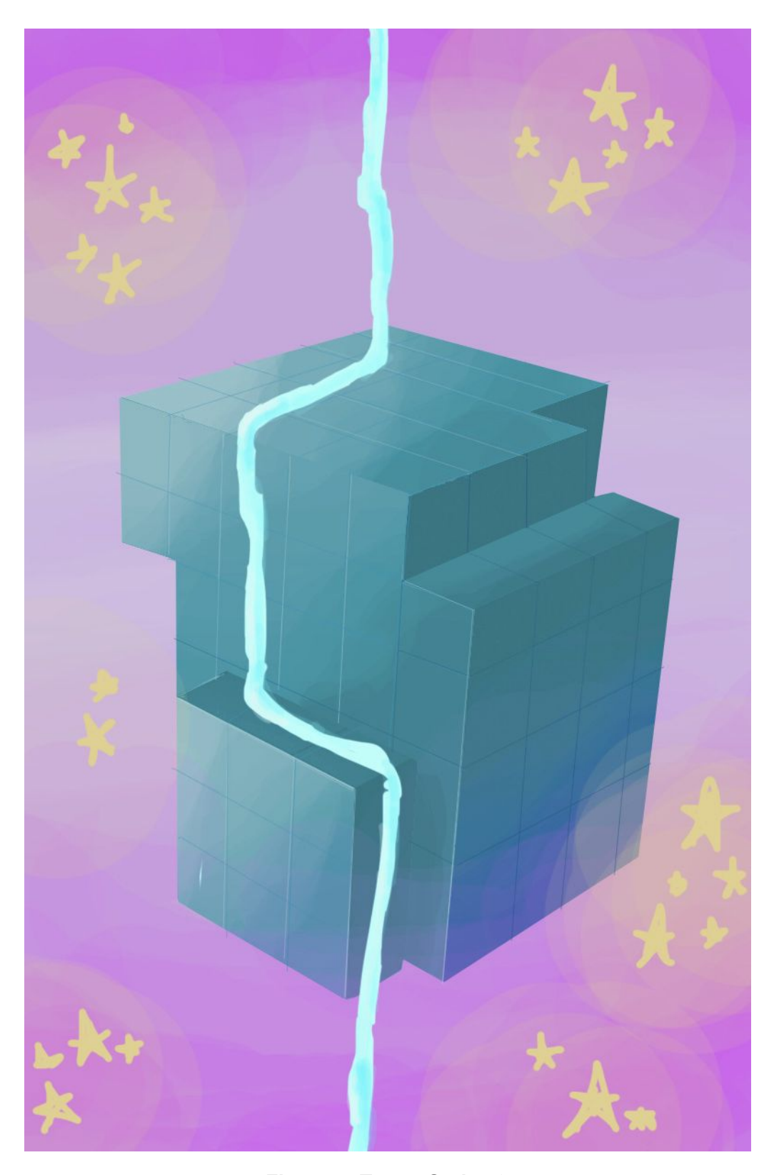
Figure 4: Tower Series 3