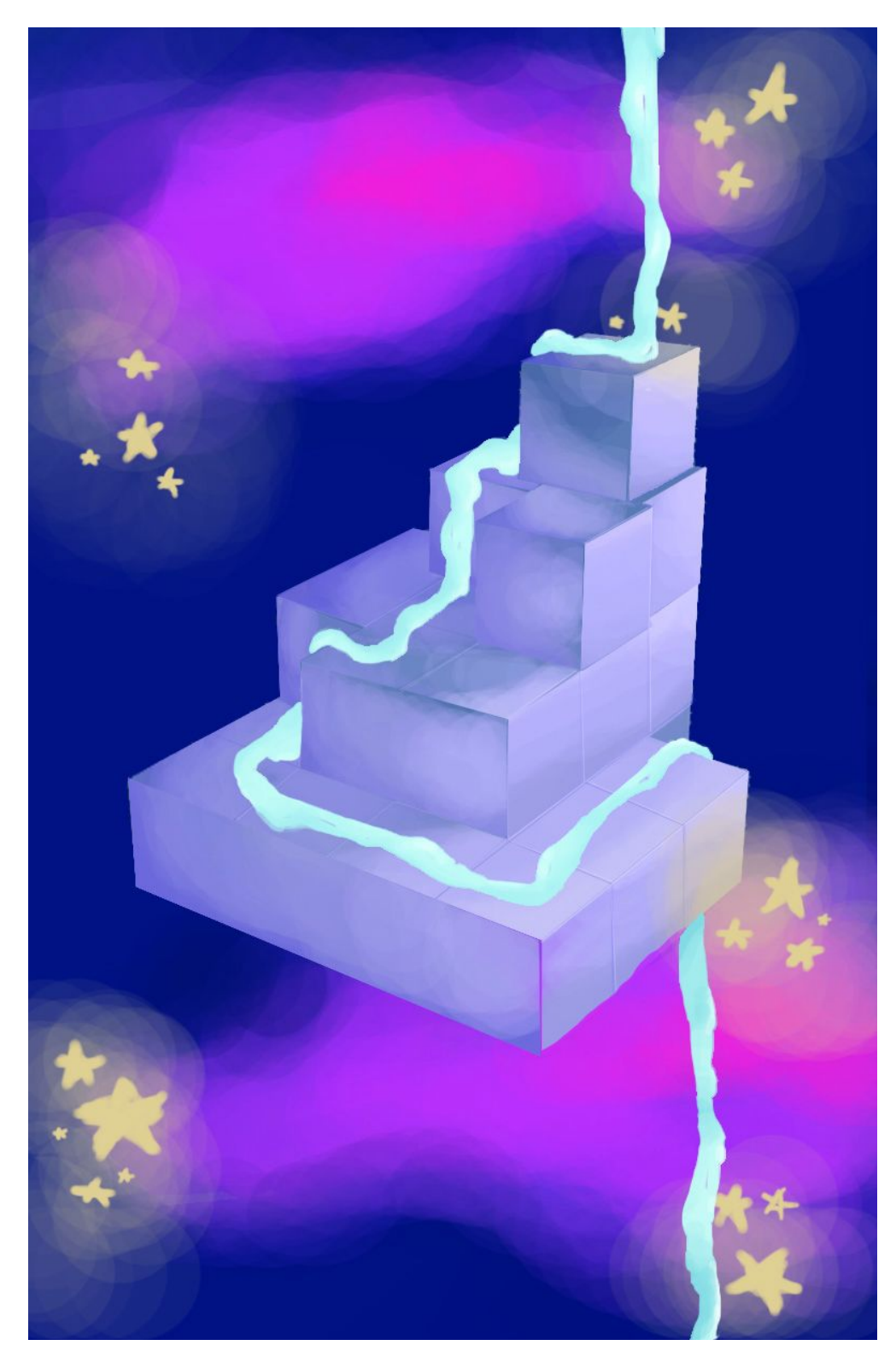
Figure 2: Tower Series 1