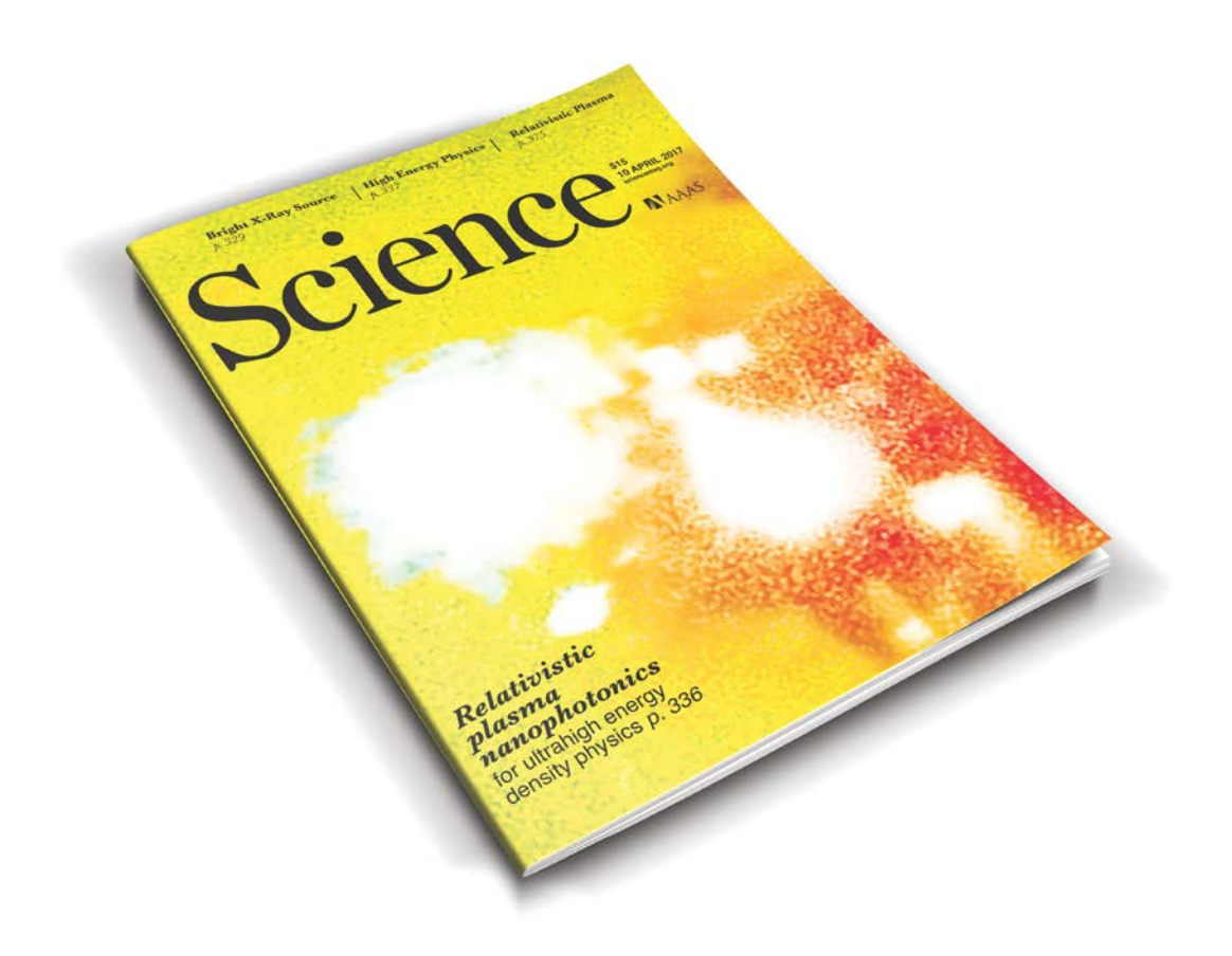
Figure 8: Science magazine