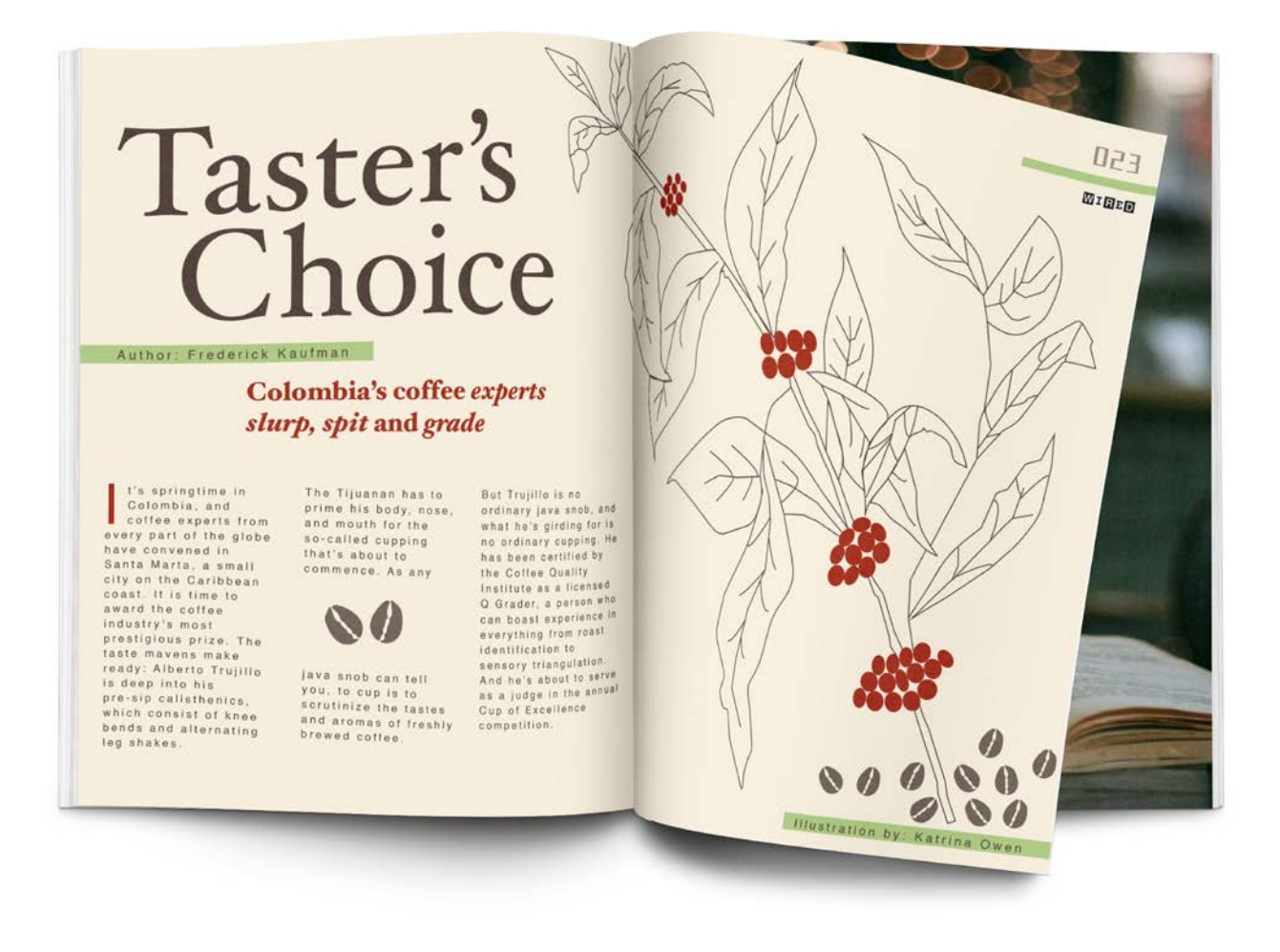
Figure 2: Taster's Choice magazine spread