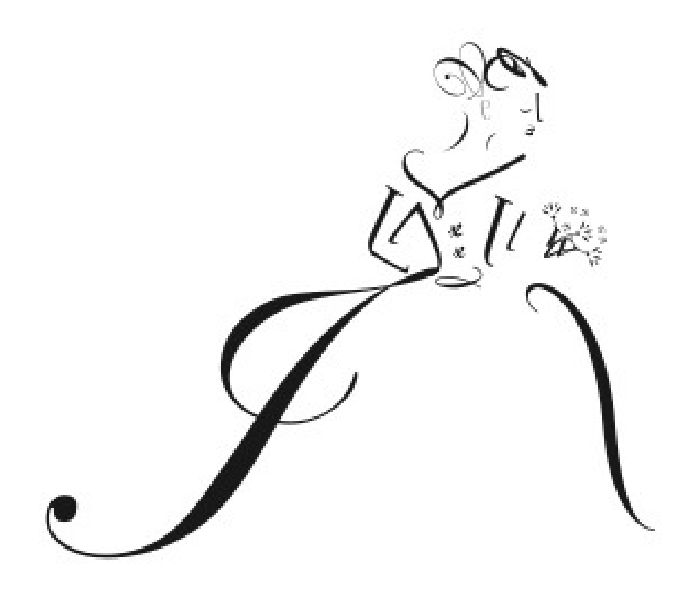
Figure 1: Wedding Dress