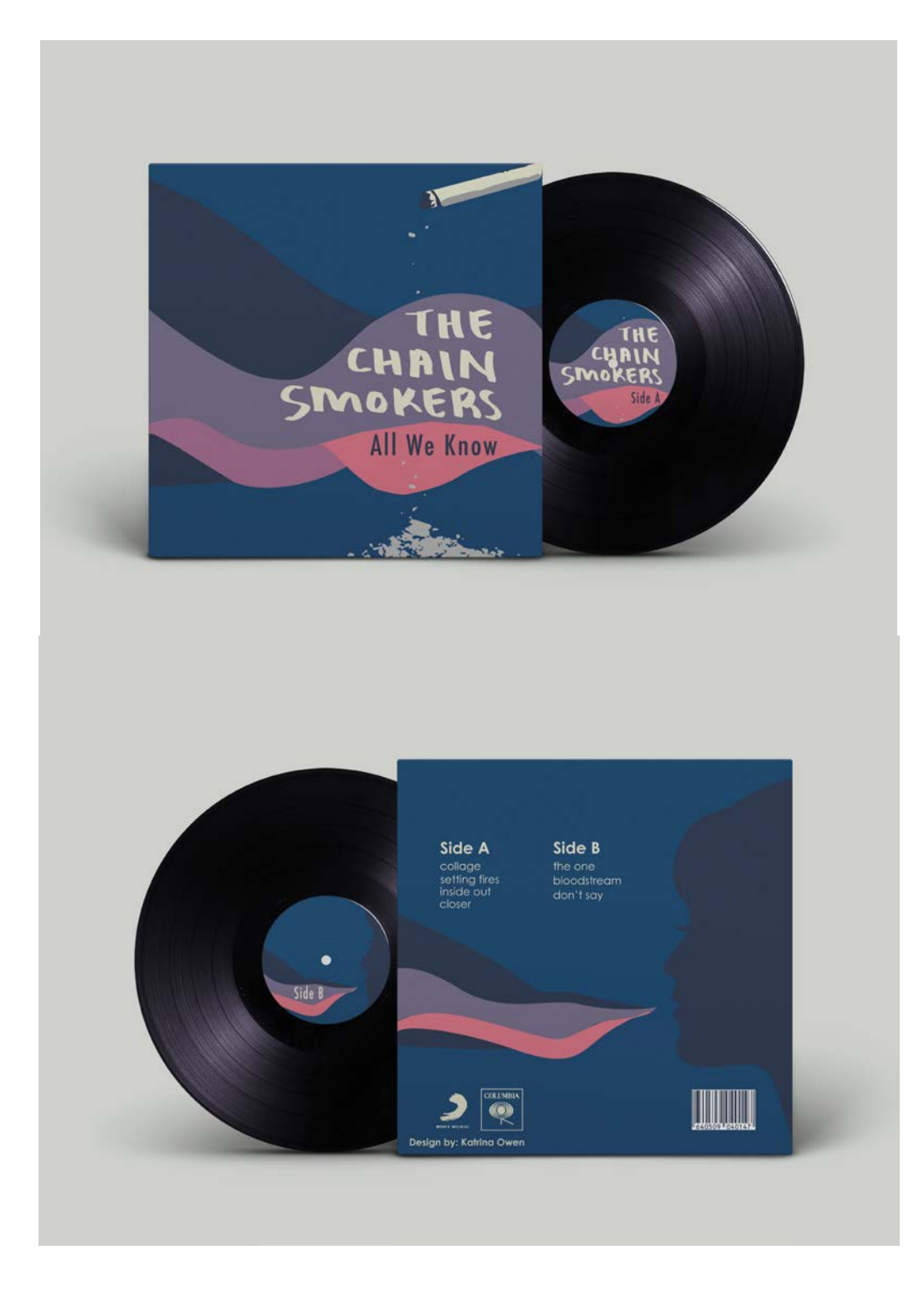
Figure 10: The Chainsmokers vinyl