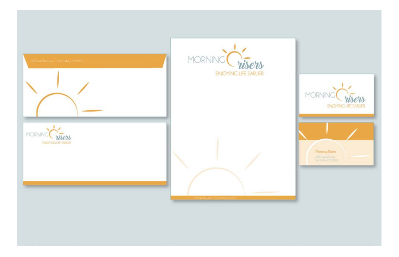
Figure 4: Morning Risers corporate identity