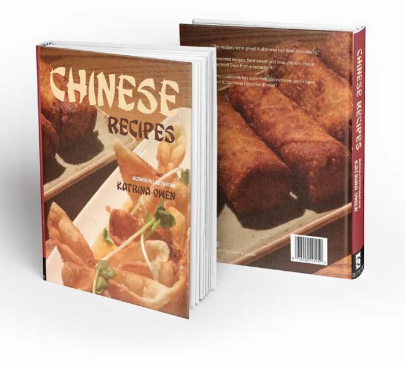
Figure 7: Chinese Recipes cookbook